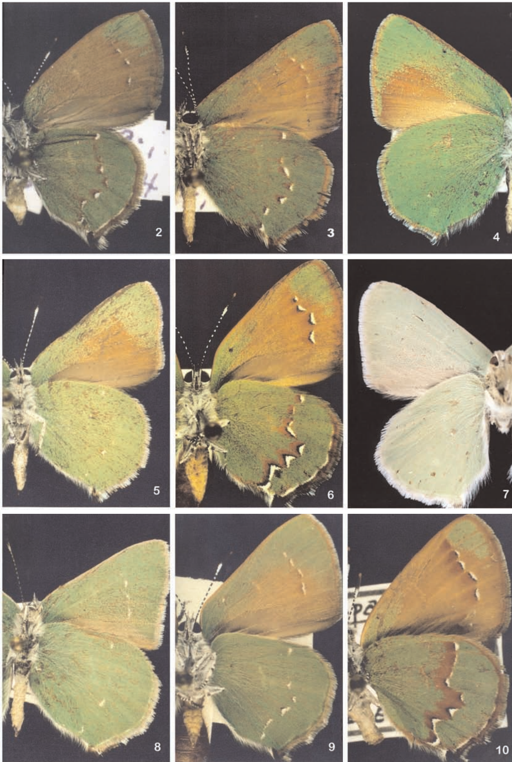
FIGS. 2–10: Callophrys affinis subspecies from the U. S. and Mexico. 2. C. affinis apama x homoperplexa blend, ♂, Jemez Mountains, Los Alamos Co., NM. 3. C. affinis homoperplexa , ♂, Boulder Co., CO. 4. C. affinis homoperplexa , ♂, Jefferson Co., CO. 5. C. affinis affinis x homoperplexa blend, Albany Co., WY. 6. C. affinis apama , ♂, Coconino Co., AZ. 7. C. affinis affinis , ♂, Box Elder Co., UT. 8. C. affinis washingtonia , ♂, Goose Lake, British Columbia, Canada. 9. C. affinis albipalpus , n. ssp. holotype ♂, Lincoln Co., NM. 10. C. affinis chapmani , n. ssp. allotype ♀, Durango, Mexico.