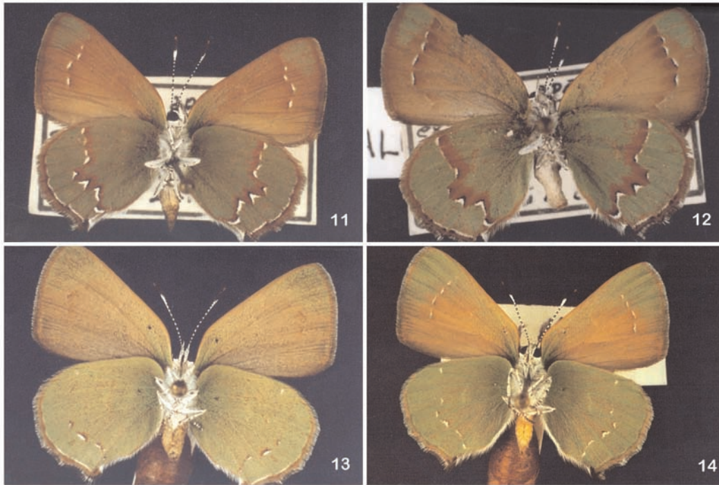
FIGS. 11–14: New subspecies of Callophrys affinis 11. C. affinis chapmani , holotype male, 38 km east of El Salto, Hwy. 28, 2439 m, collected ex ovum on July 13, 1985 -emerged: August 28, 1985, G.A. Gorelick, collector 12. C. affinis chapmani , allotype female, 38 km east of El Salto, Hwy. 28, 2439 m, Durango, Mexico, collected ex ovum on July 13, 1985 -emerged: August 27, 1985, G.A. Gorelick, collector 13: C. affinis albipalpus , allotype female, 10 km north of Ruidoso, 2134 m, Lincoln Co., NM, collected ex female on June 28, 1982 - Emerged: August 15, 1982, G.A. Gorelick, collector 14: C. affinis albipalpus , holotype male, 10 km north of Ruidoso, 2134 m, Lincoln Co., NM, collected ex female on June 28, 1982 - Emerged: August 15, 1982, G.A. Gorelick, collector

The adults emerged on August 28, 1985. These will be deposited in the Natural History Museum of Los Angeles County along with four paratypes (2♂, 2♀) from the same locality. The remaining 14 paratypes (both reared and field collected) were taken between the city of Durango and the village of El Salto on Mexico Hwy. 28 (1964–1986). Two of these paratypes will be distributed to each of the same institutions listed for C. affinis albipalpus .