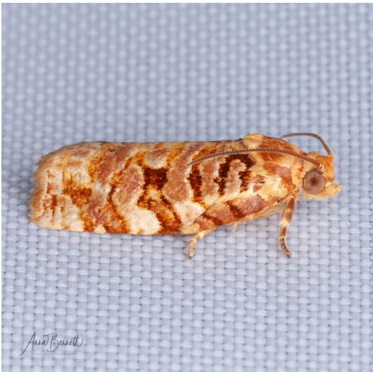
Archips georgiana on 1 Jun 2021