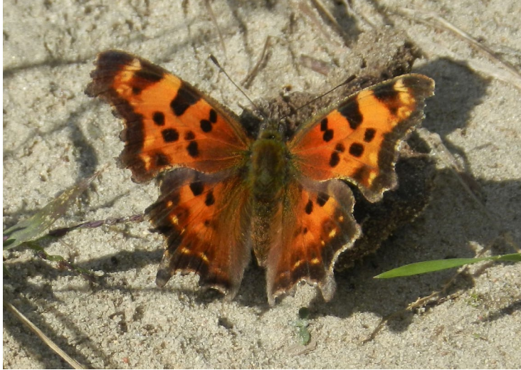
Polygonia faunus : 18 Sep 2021, Oak Point in Cass Co., MN