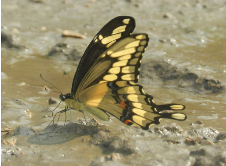
Heraclides cressphontes, 20 Jul 2021, low land farm, Pepin Co., MI.

balm. In Nelson, Wisconsin I found Giant Swallowtails. August 11 saw the posting of “Severe Fire Risk” and “Severe Drought”, with fires growing north and northeast of our location. By August 20 there was still no rain, and temperatures cooled to 67°F. The drought continued as September approached. It was a relief to welcome fall. I thought when I photographed a monarch feeding on my zinnia flowers on October 10 th , that it would be end of this season, and then I was surprised on October 17 th to find a Common Checkered Skipper making its way across our yard (season’s final photo).