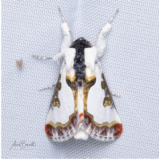
Xerociris wilsonii on 2 Jun 2021.