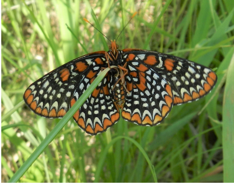
Euphydryas phaeton, 28 Jun 2021, Nary Rd., Beltrami Co., MI