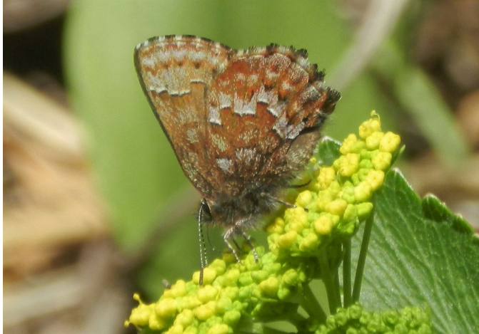
Callophrys niphon, 29 May 2021, Oak Point, Steam Boat Trail, Cass Co., MN