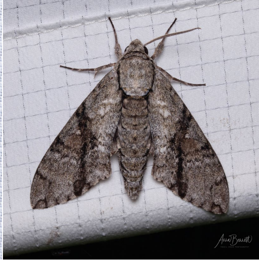
Manduca jasmineearum on 3 Aug 2021