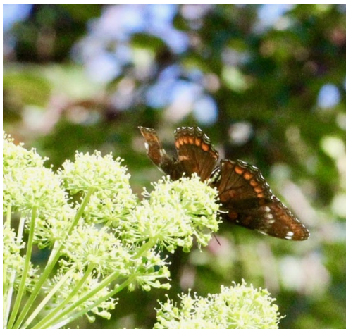
Limenitis arthemis X astyanax hybrid, 28 Jun 2021, 6219 E. Superior St., Duluth, St. Louis Co., MN.