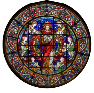
Clayton & Bell, east window (1859), Church of St Michael Cornhill, London.

In the first chapter , entitled "The Secret Cupboard" (p. 13 to 50), we meet Flora Mac-Alpin, a charming blonde with big blue eyes, around eighteen years old. She is the ward of Master Lancelot Young, who commonly introduces her as his niece. The man lives in London, where he is a Master glassmaker at the Court of Queen Elizabeth, the mother of James VI. Flora Mac-Alpin's uncle, usually cheerful, content and in a good mood, has become taciturn and seems very preoccupied, speaking "only about death and coffins" (p. 20). This change in behavior followed the mission entrusted to him by Queen Elizabeth to remove the precious stained glass windows from the Sheene monastery and place them in St. Michael's Church in London.