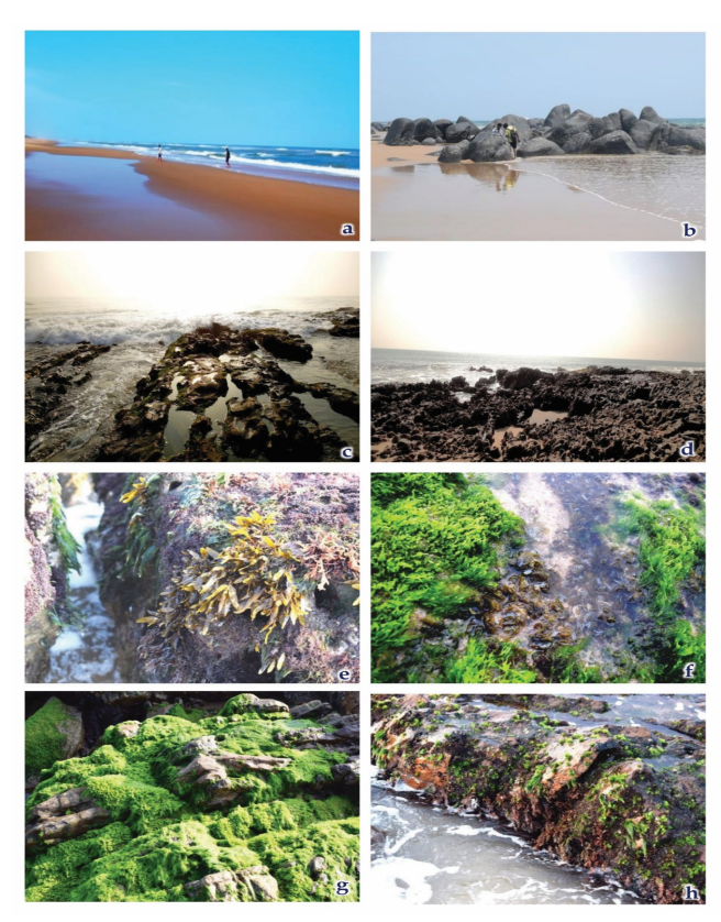
Figure 2 (a-h): Habit and habitats of marine macroalgae from Northern coastal districts. a. Baruva; b. Yeramukkam; c. Bandaruvanipeta; d. Mukkam; e - f. Mixed marine macroalgal diversity at Yerramukkam and Bandaruvanipeta; g. Monospecific diversity of Ulva flexuosa on granite rocks at Lakshimipuram; h. Juvenile stage of red and green algae at Chintapalli.