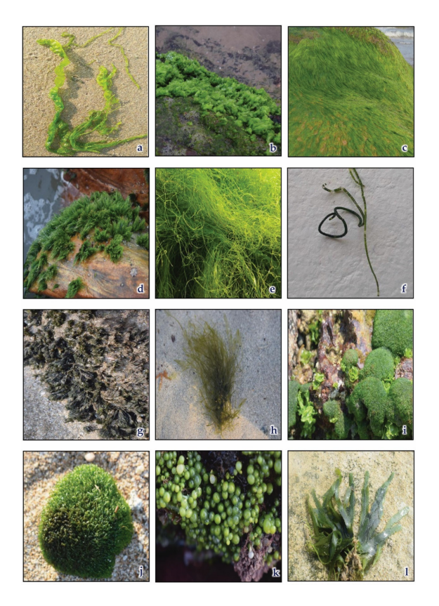
Figure 3 (a-l): Chlorophyceae. a. Ulva linza; b. U. rigida; c. U. prolifera; d. Chaetomorpha antennina; e. C. linum; f. C. spiralis; g. Acrosiphonia orientalis; h. Bryopsis plumosa; i. Acrocladus herpesticus; j. Valoniopsis pachynema; k. Caulerpa racemosa; l. C. scalpelliformis.