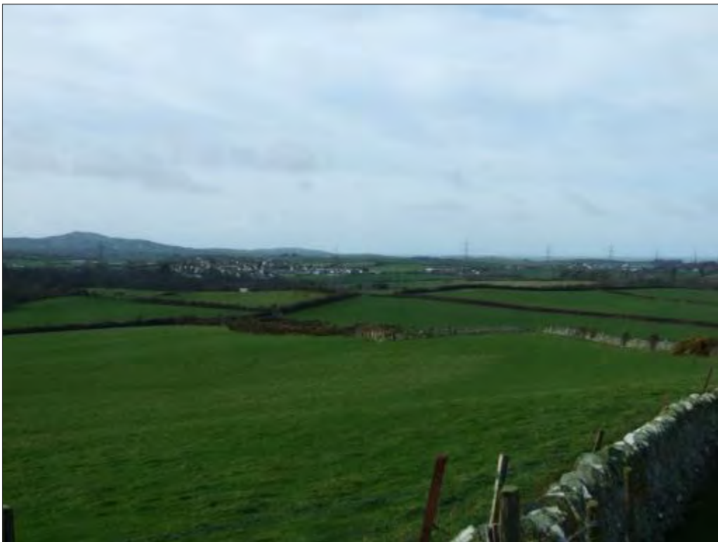
Plate 7b, View from Pen-y-Morwyd round barrow looking north-west towards Llanfechell