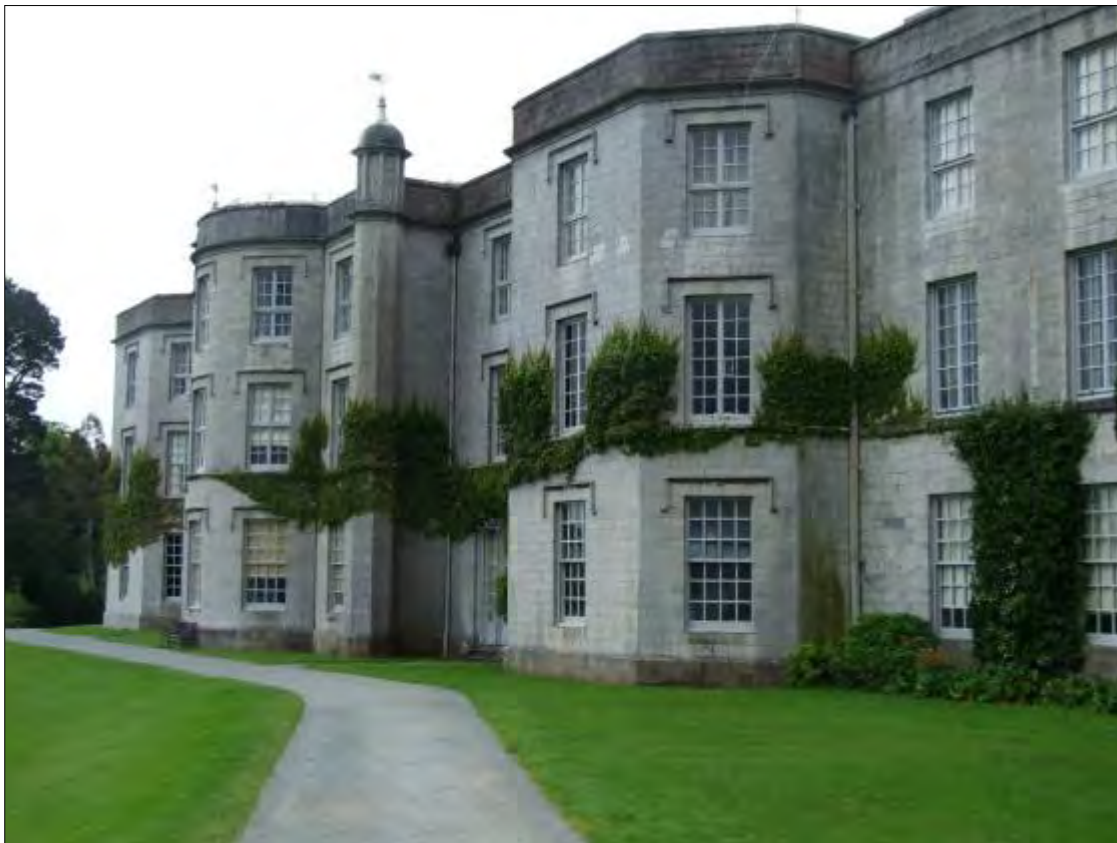
Plate 41a, East facing front of Plas Newydd, from north