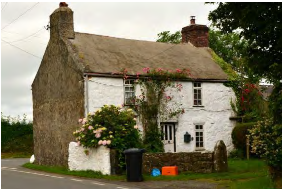
Plate 22b, Ty Newydd, Maenaddwyn, looking north-west