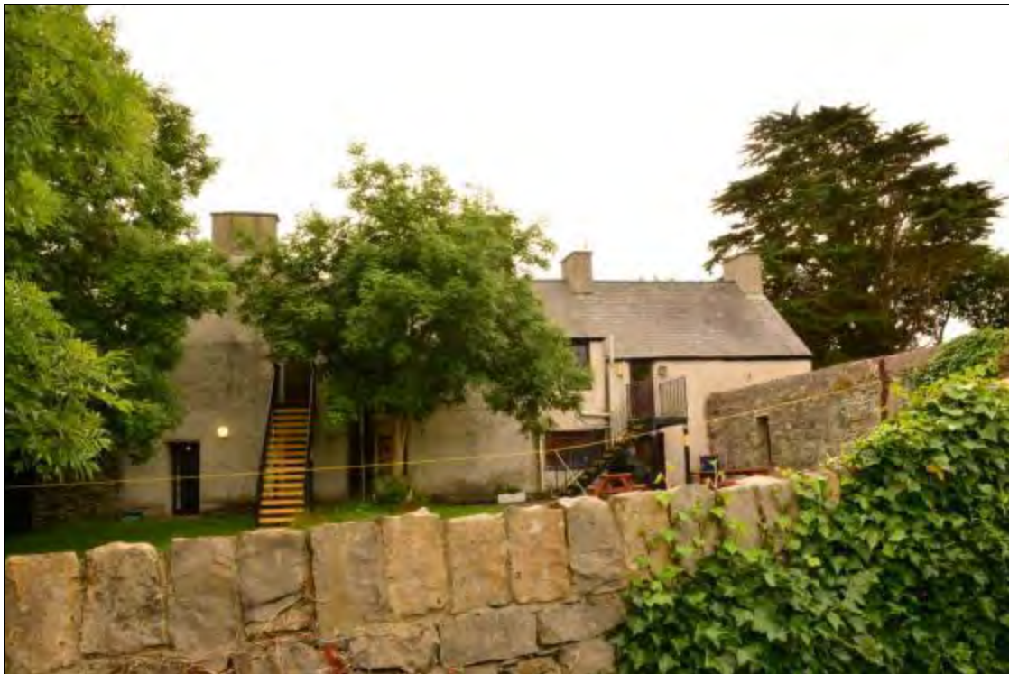
Plate 5b, Rear view of the Rectory, looking south