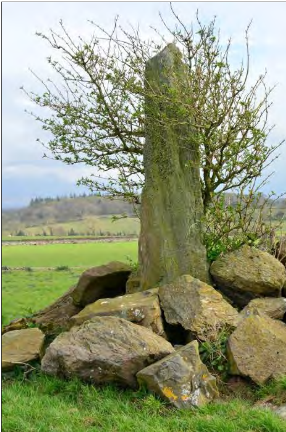
Plate 38a, View of Tyddyn-Bach standing stone from west