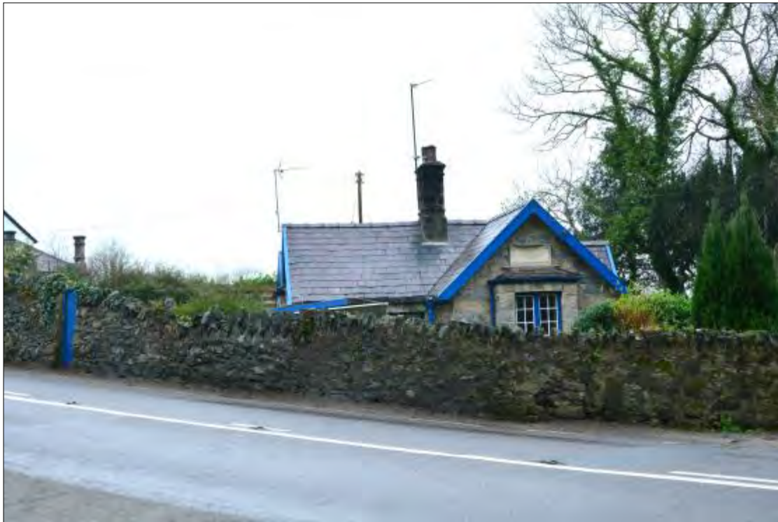
Plate 43a, View of Aberbrait looking south-west from road