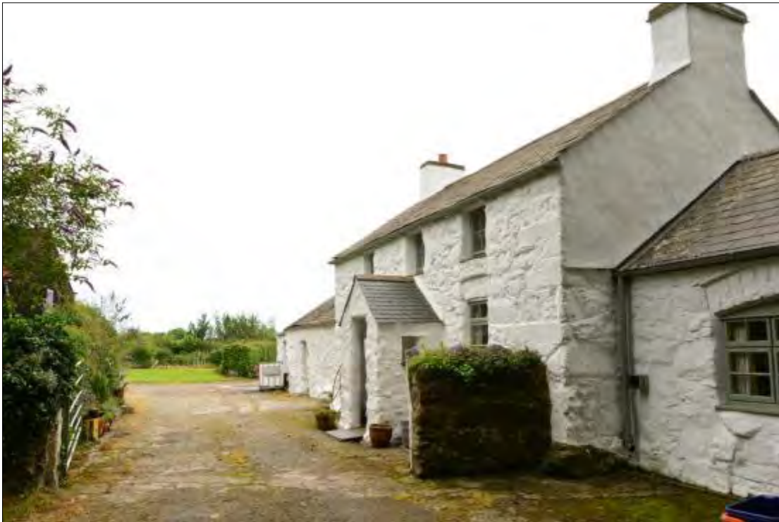
Plate 16c, Courtyard running adjacent Ty Mawr