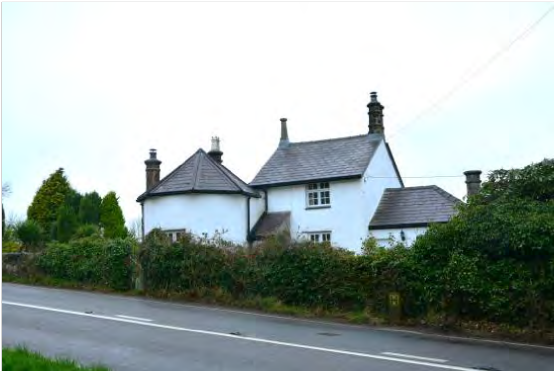
Plate 44a, View of Pen yr Allt looking south-west from road