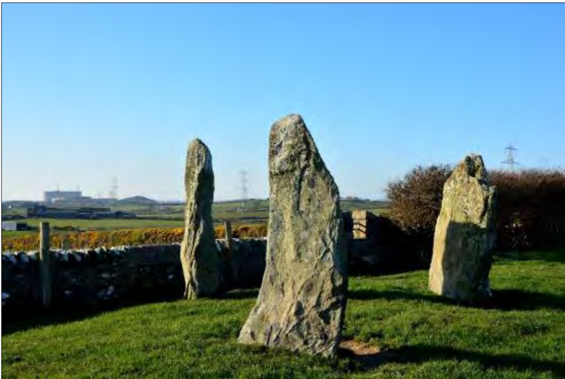
Plate 2b, AN030, looking north-east towards Wylfa Nuclear Power Station