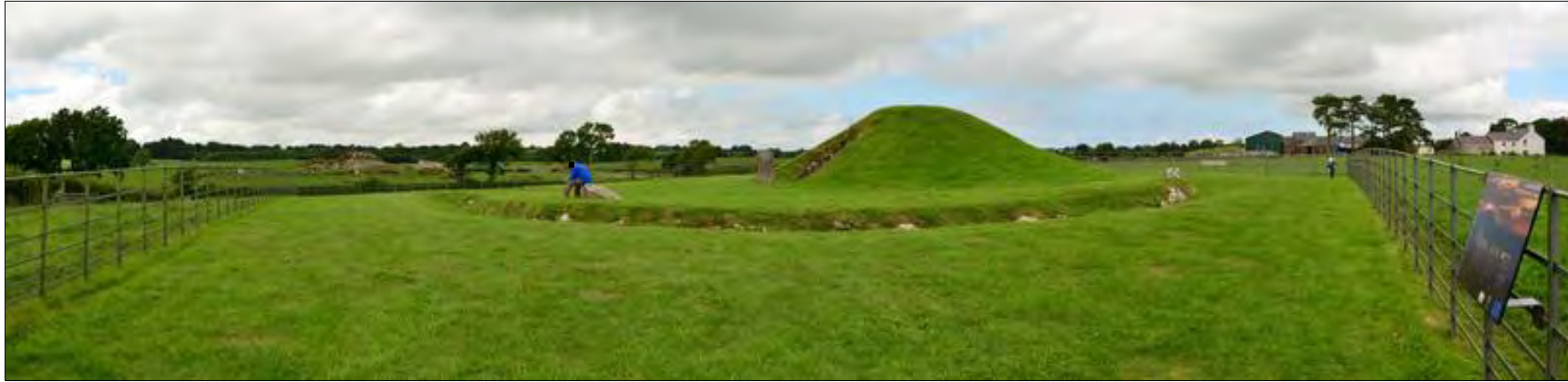
Plate 37a, View of Bryn Celli Ddu and setting from south (top) and east (bottom)