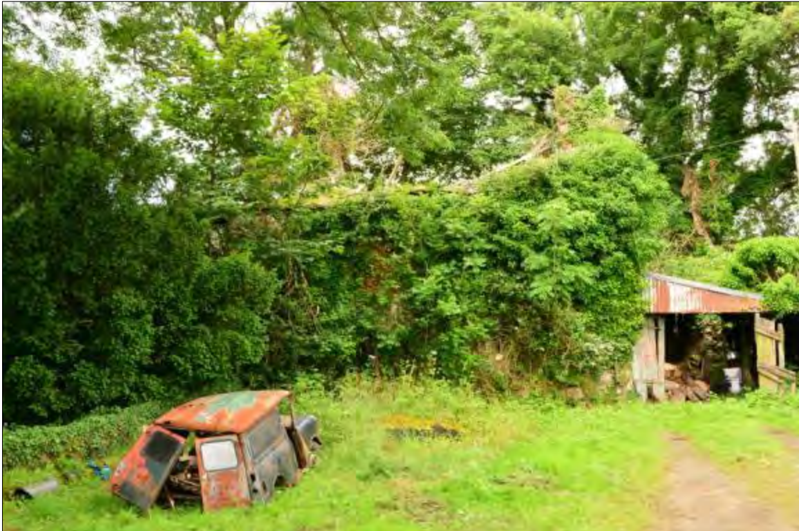
Plate 19a, Clorach-fawr, looking west