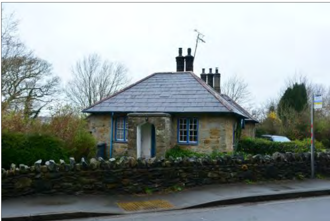
Plate 31b, View of Victoria Cottages, looking east