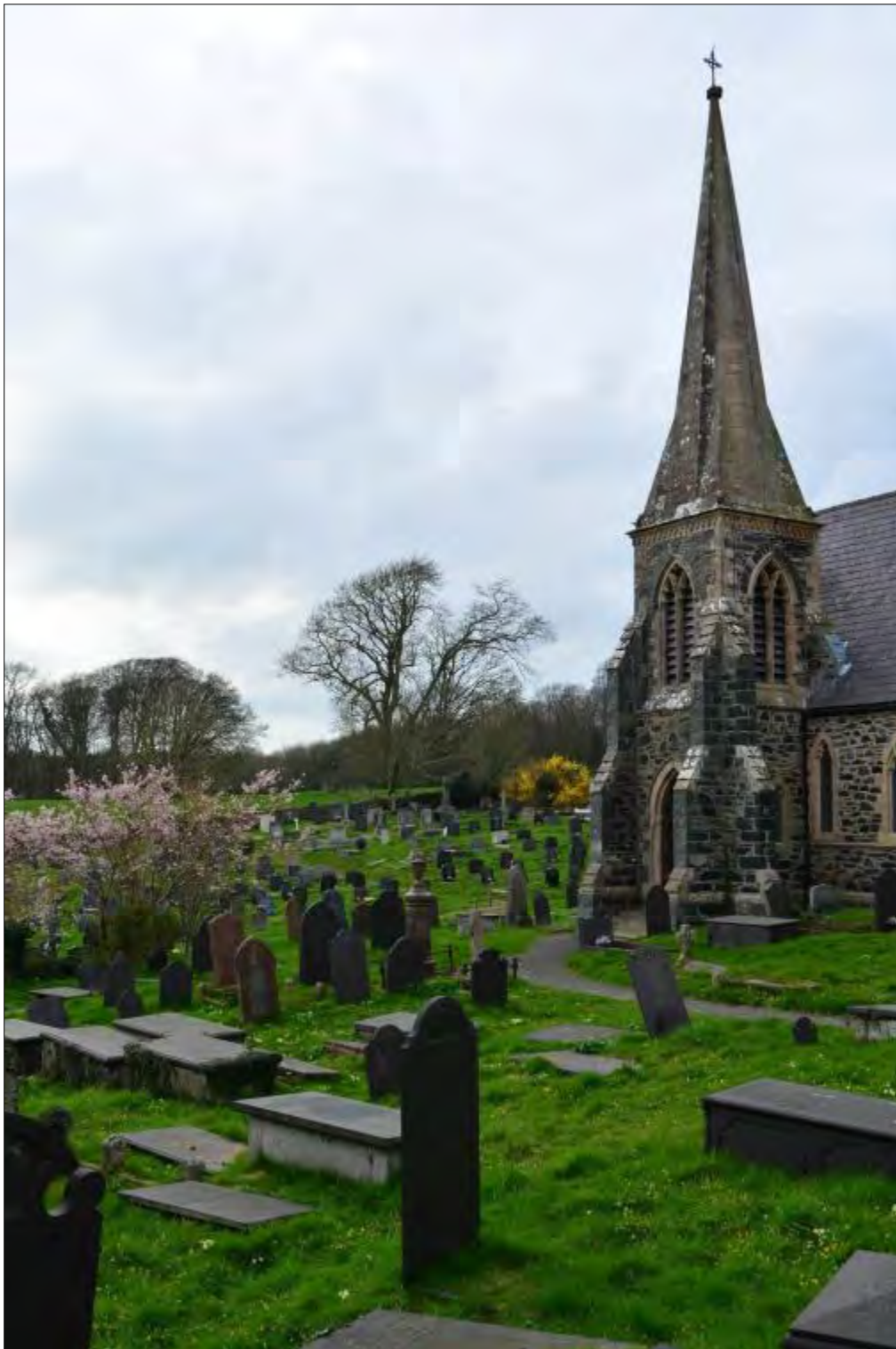
Plate 33a, View of Church of St. Mary, looking east