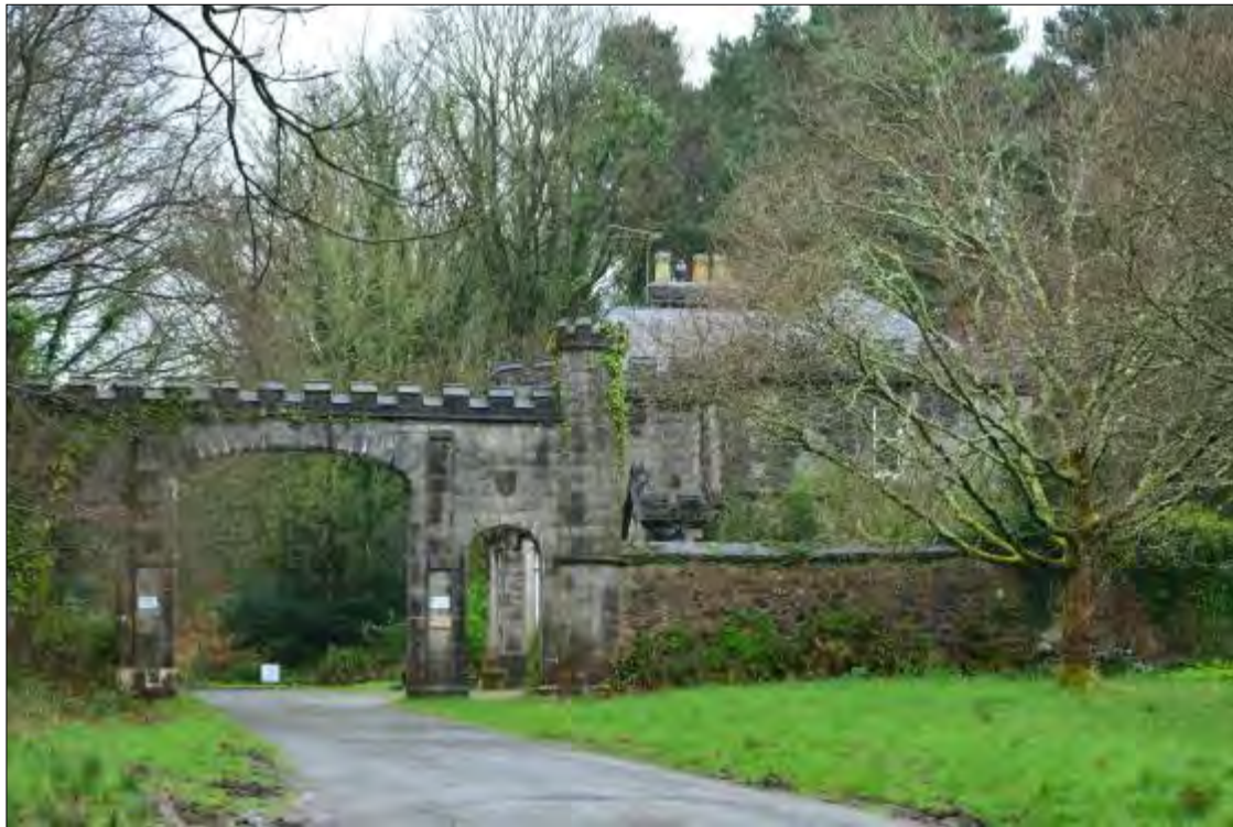
Plate 42a, View of Grand Lodge of Plas Newydd, looking south