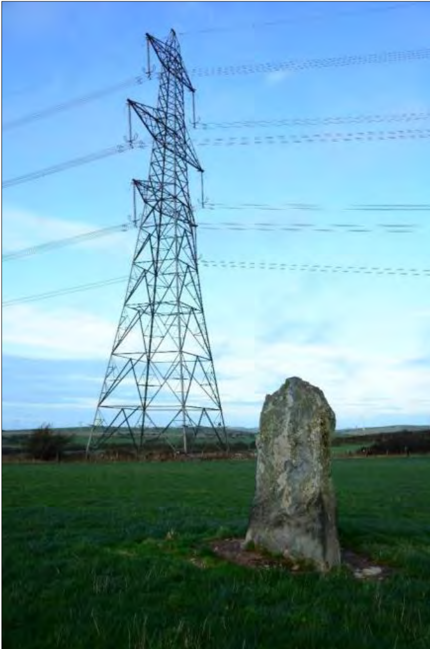
Plate 3a, AN080, looking north-east with existing pylon adjacent