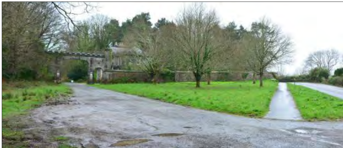
Plate 42b, Setting view of Grand Lodge of Plas Newydd, looking south