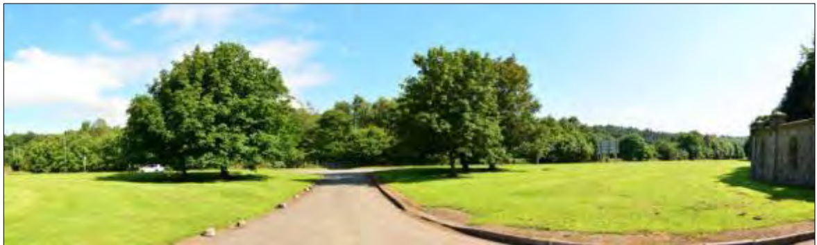
Plate 51b, View from Vaynol Hall Main Entrance looking west (bottom)