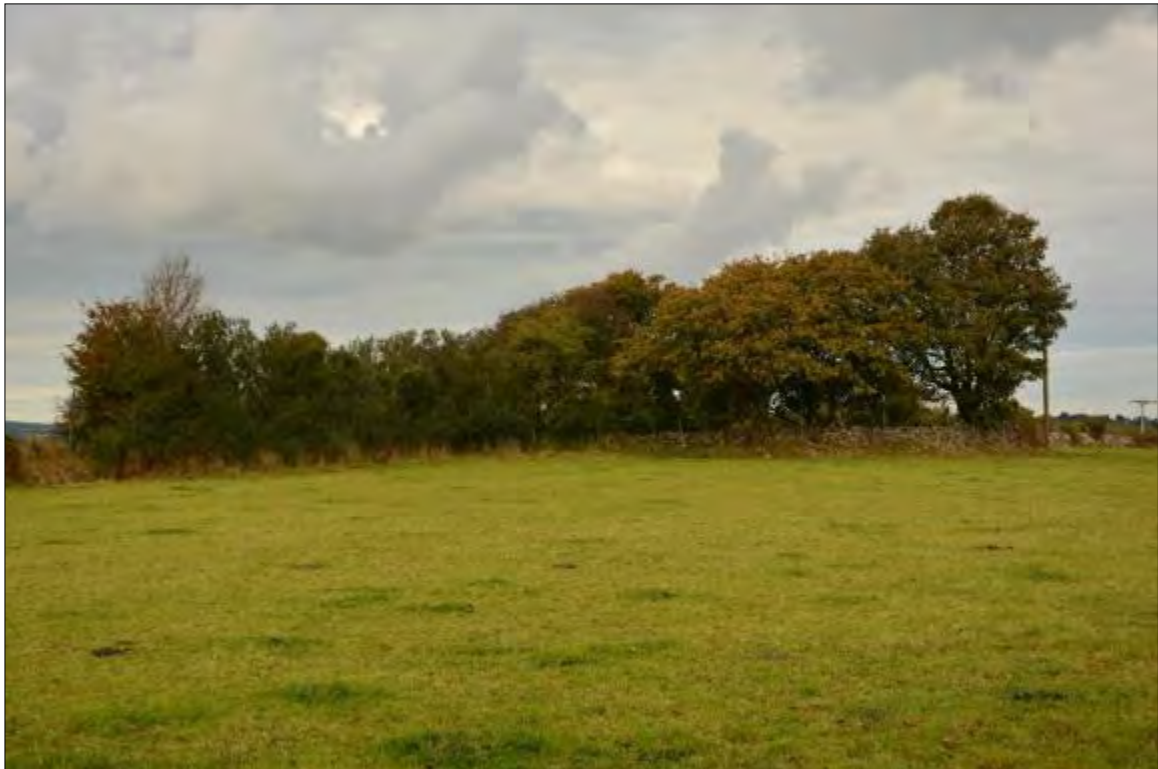
Plate 53b, View looking north at Fodol Ganol Enclosed Hut Group showing overgrown nature of asset