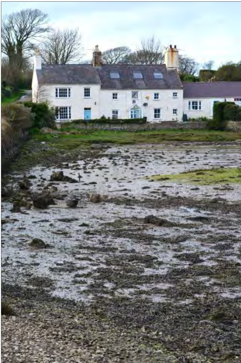
Plate 47a, View of The Old Cutter, looking west, showing its quayside location