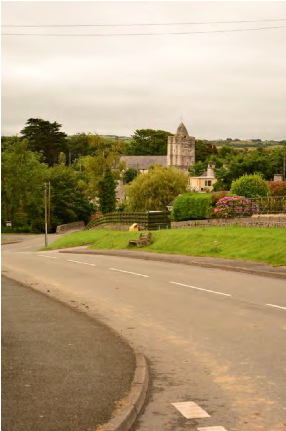
Plate 4a, View of Llanfechell Conservation Area from north