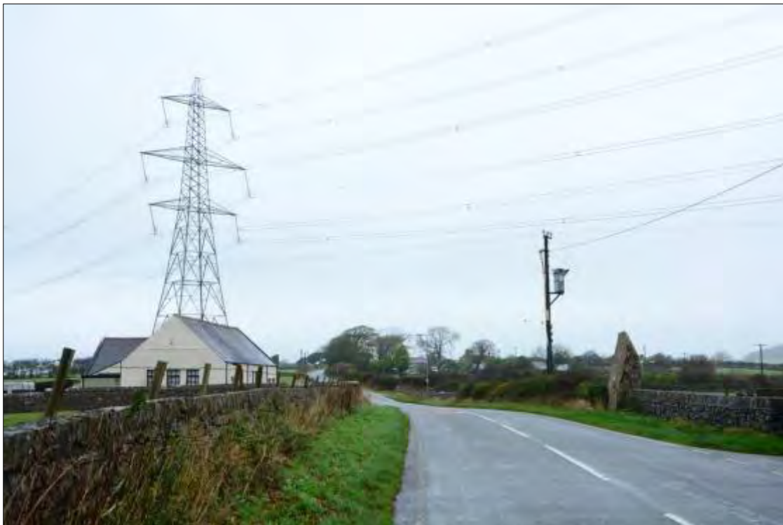
Plate 24b, Maen Addwyn Standing stone, looking north showing existing 400 kV OHL and other overhead wires