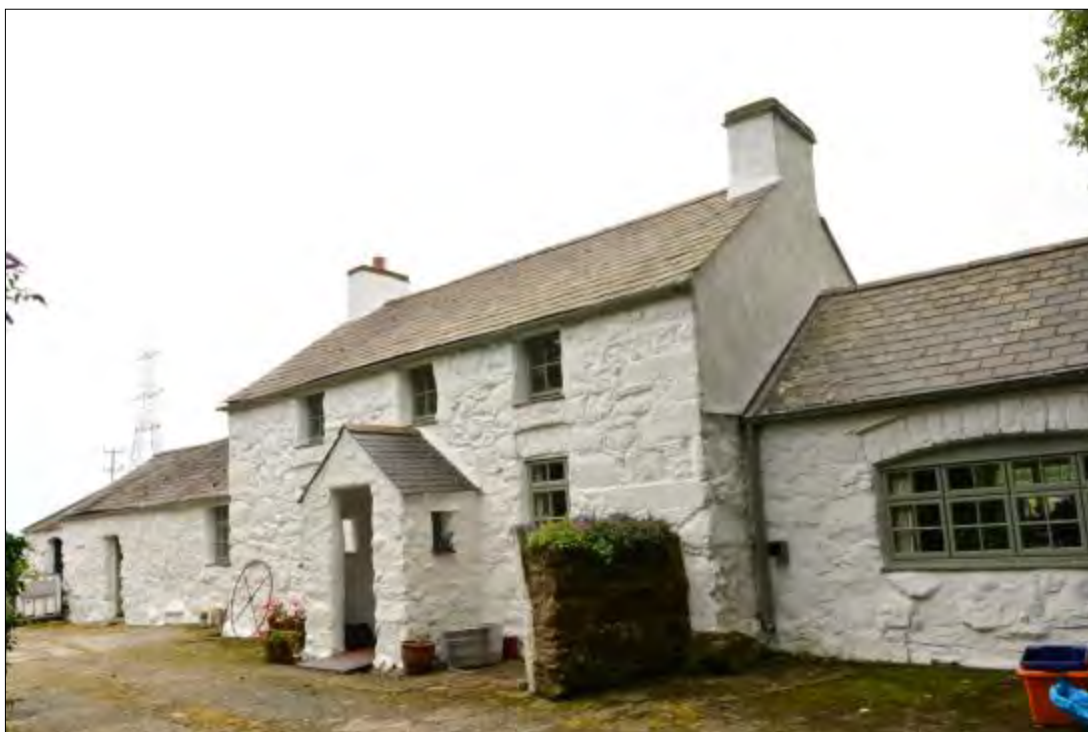
Plate 16b, Ty Mawr, looking south-west