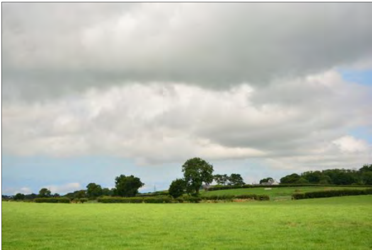
Plate 37b, View of Bryn Celli Ddu and setting from 400 m to the south