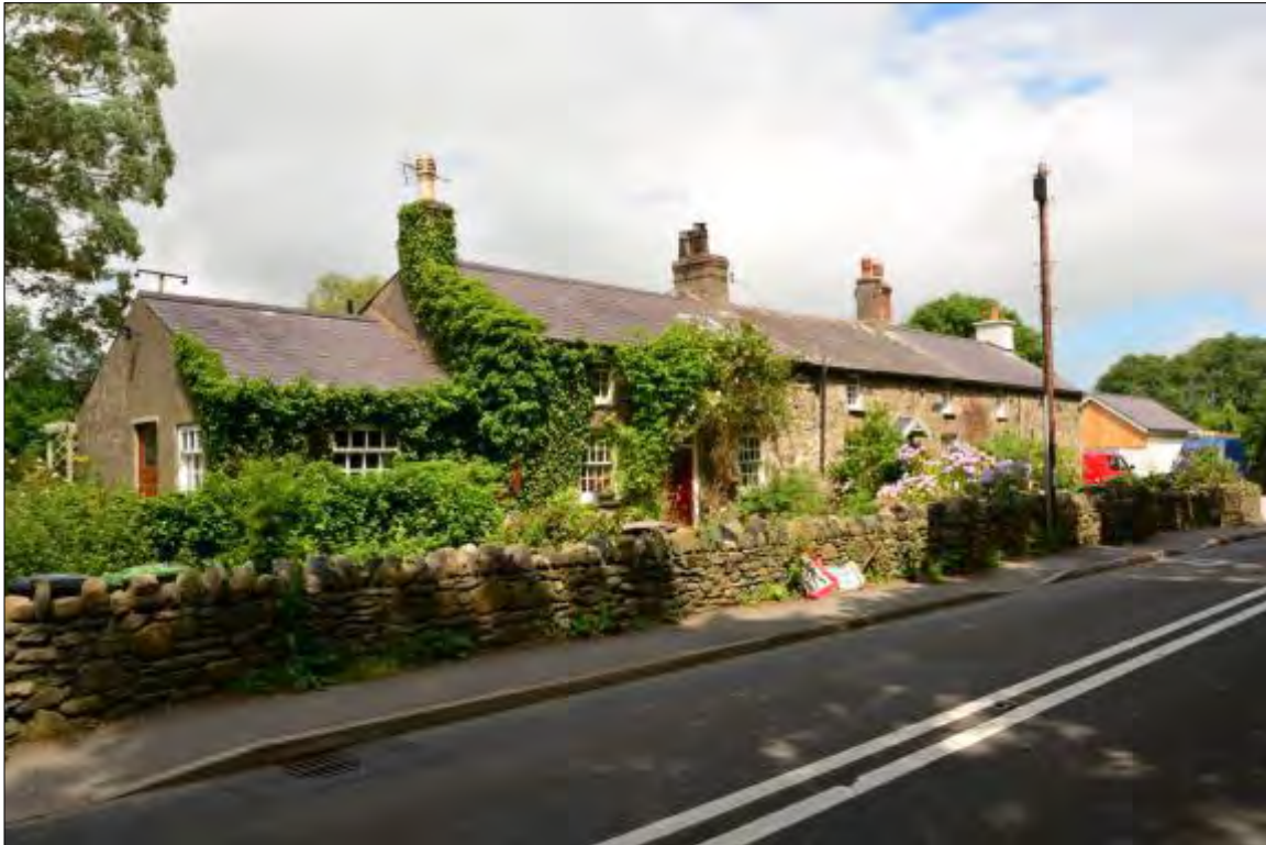
Plate 30a, General view of 1-3 Tyddyn Pwyth, looking north-west