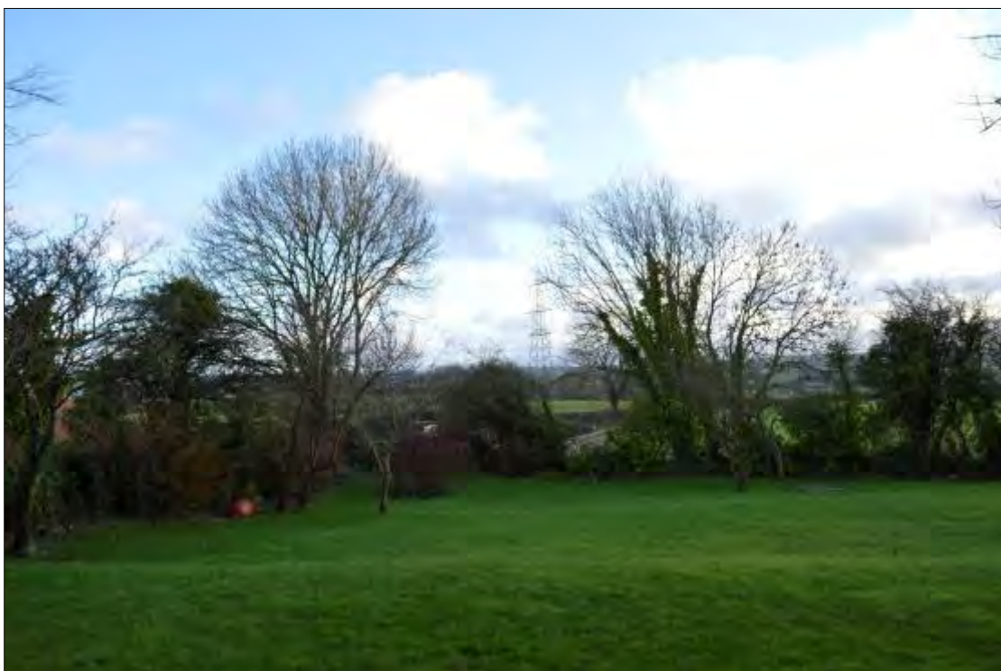
Plate 27b, View from Hendre Howell, looking east