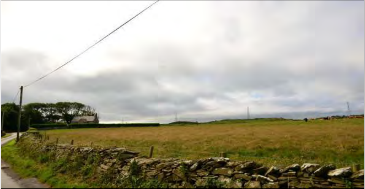
Plate 11c, Church of St Mary; wider setting with existing 400 kV OHL to west