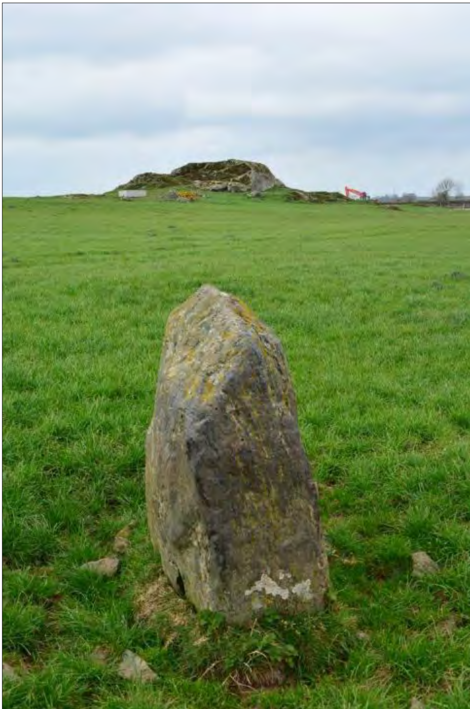
Plate 39b, View of Bryn Celli Ddu standing stone from south (looking north showing visibility to the rock outcrop)