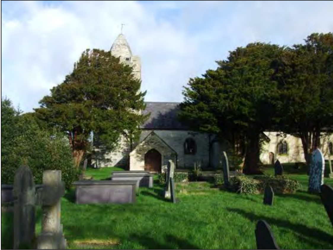
Plate 5a, Church of St Mechell from within churchyard