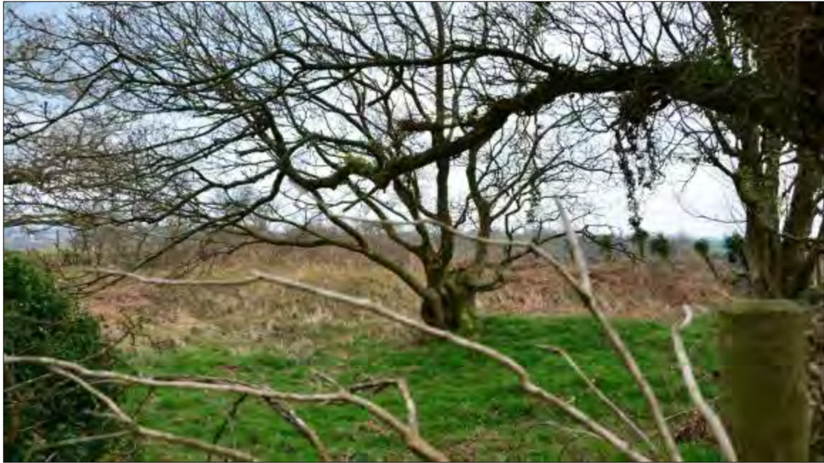
Plate 53a, View across inside of Enclosure