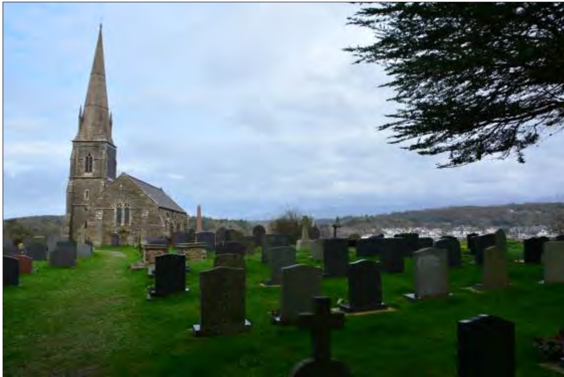
Plate 45a, View of Church of St. Edwen, looking south