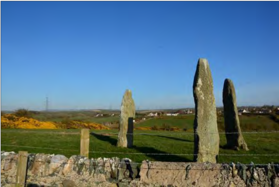
Plate 2a, AN030, looking south-east towards Llanfechell