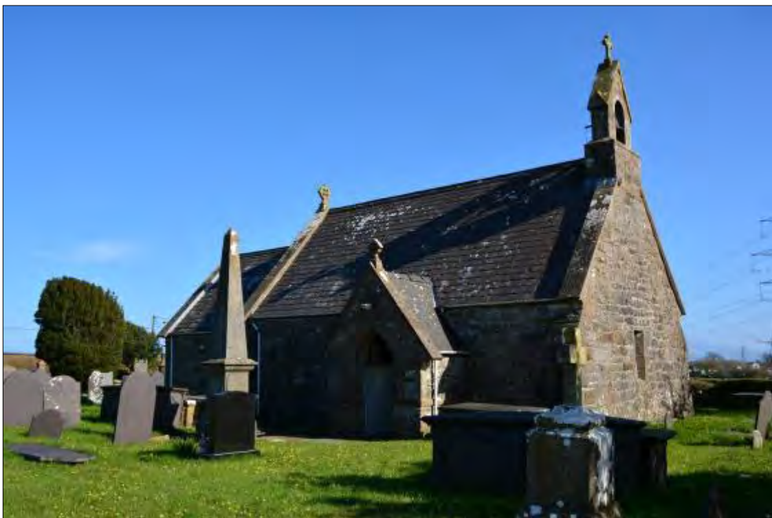
Plate 23b, Church of St Michael, looking south-east