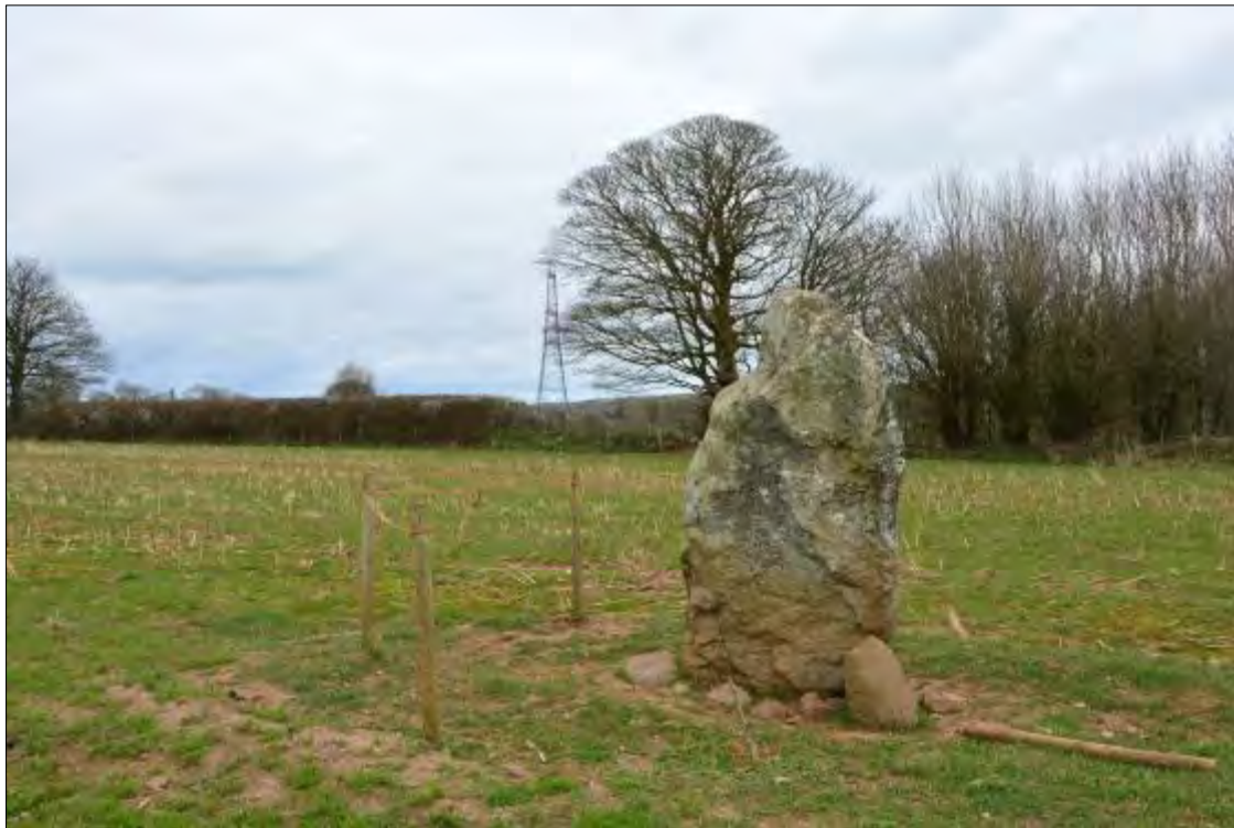
Plate 28a, View of Hirdre-Faig Standing Stone, looking north-east