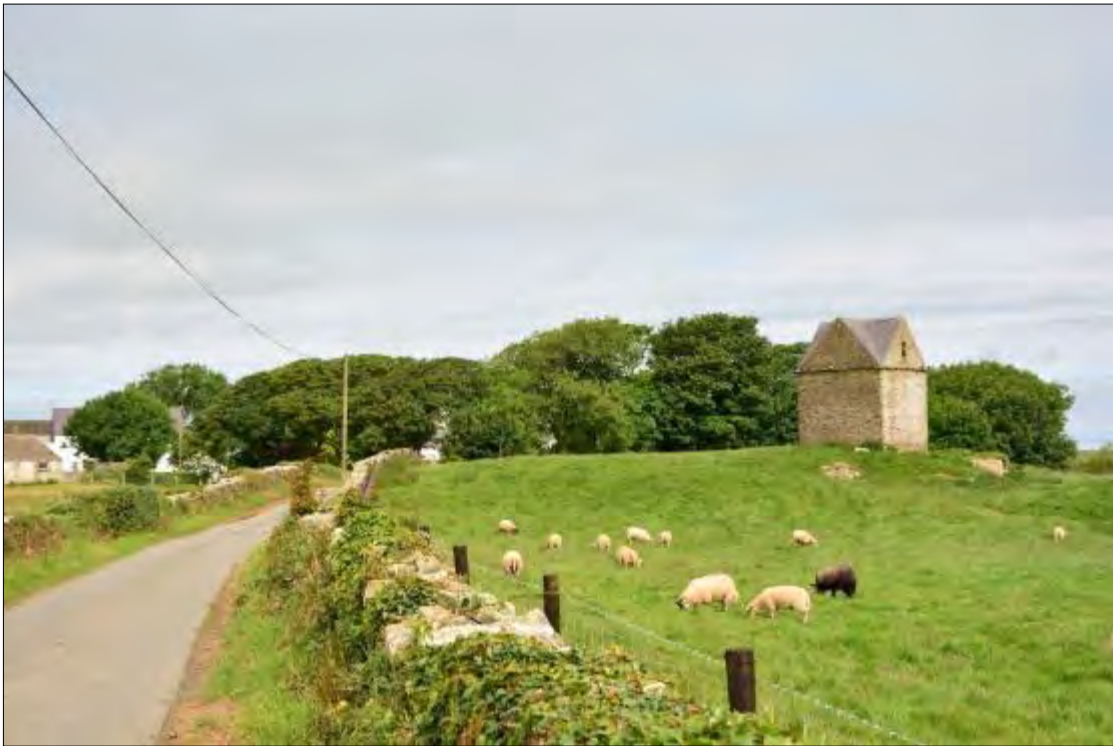
Plate 10a, Plas Bodewryd Dovecote viewed from the south