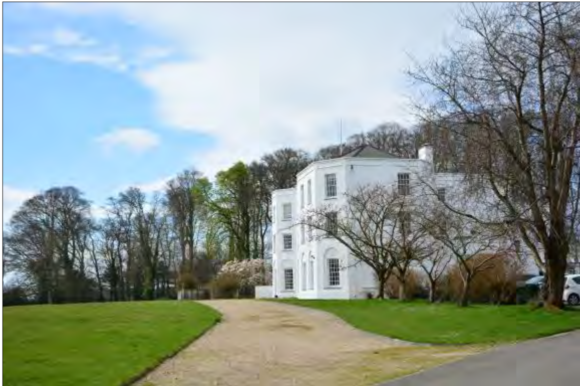
Plate 51a Vaynol Hall, looking south