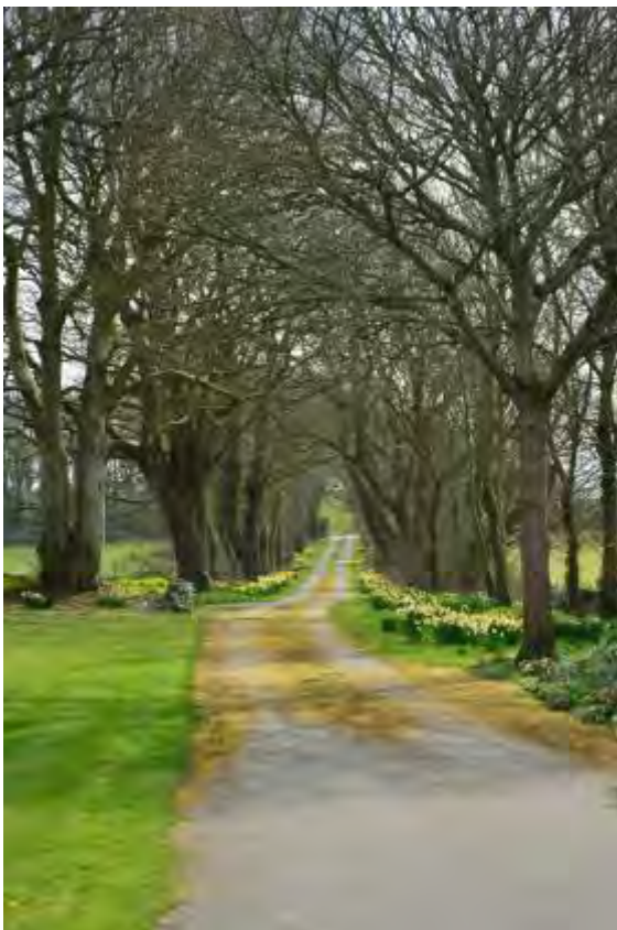
Plate 6b, View from Bryn Ddu along drive