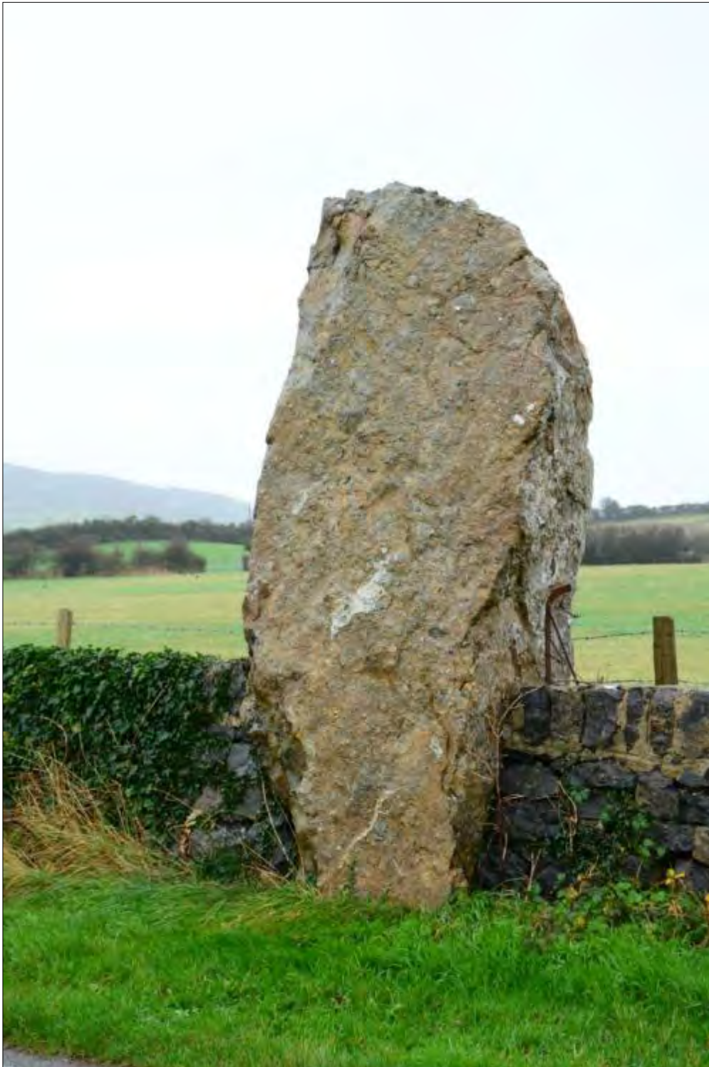
Plate 24a, Maen Addwyn Standing stone, looking north-east