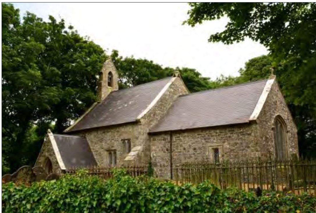
Plate 16a Church of St Tyfrydog, looking north-east