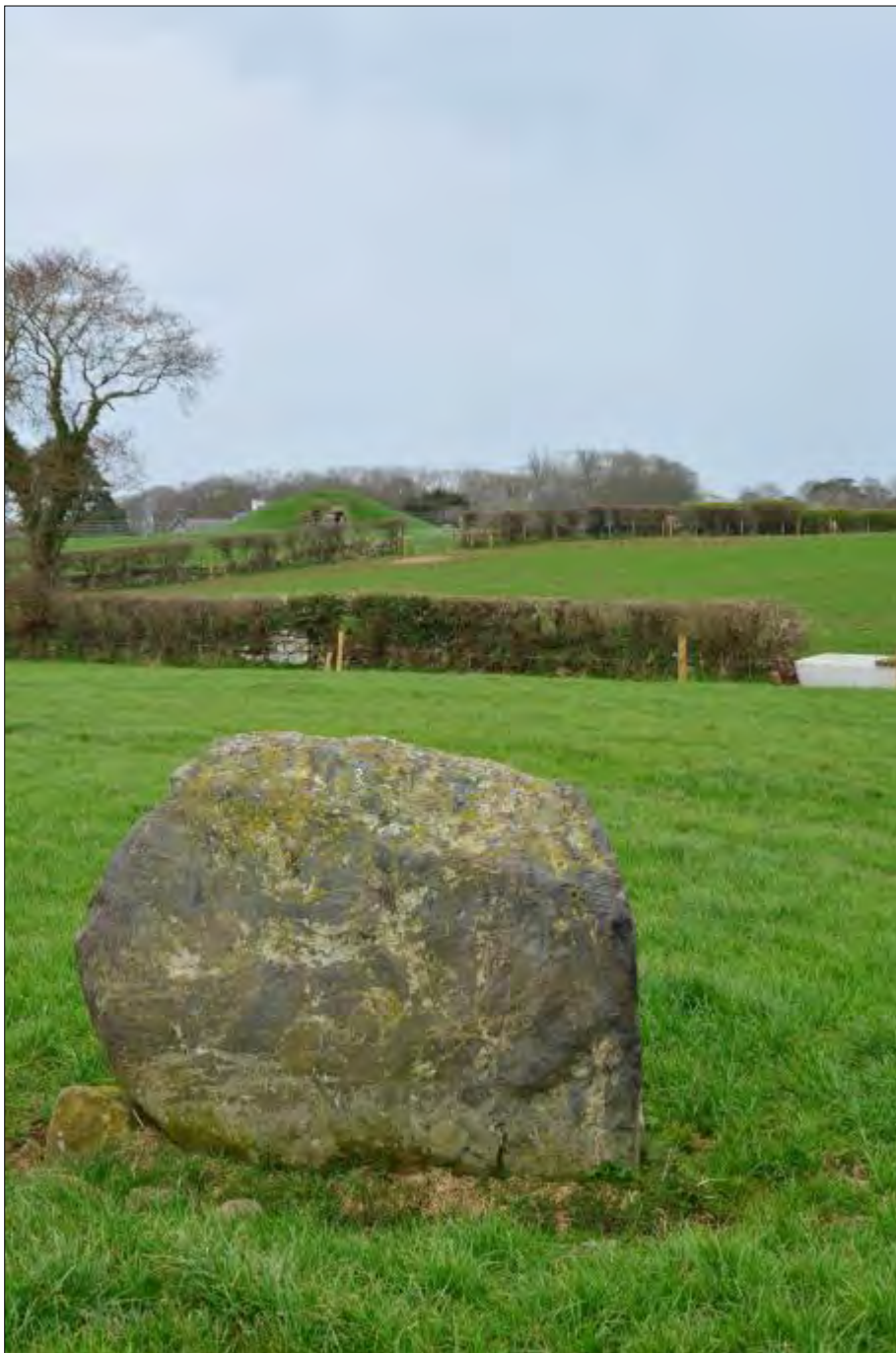
Plate 39a, View of Bryn Celli Ddu standing stone from south (looking north-east showing view to the chambered tomb)