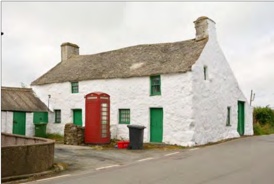
Plate 22a, Former Post Office, Maenaddwyn, looking south-west