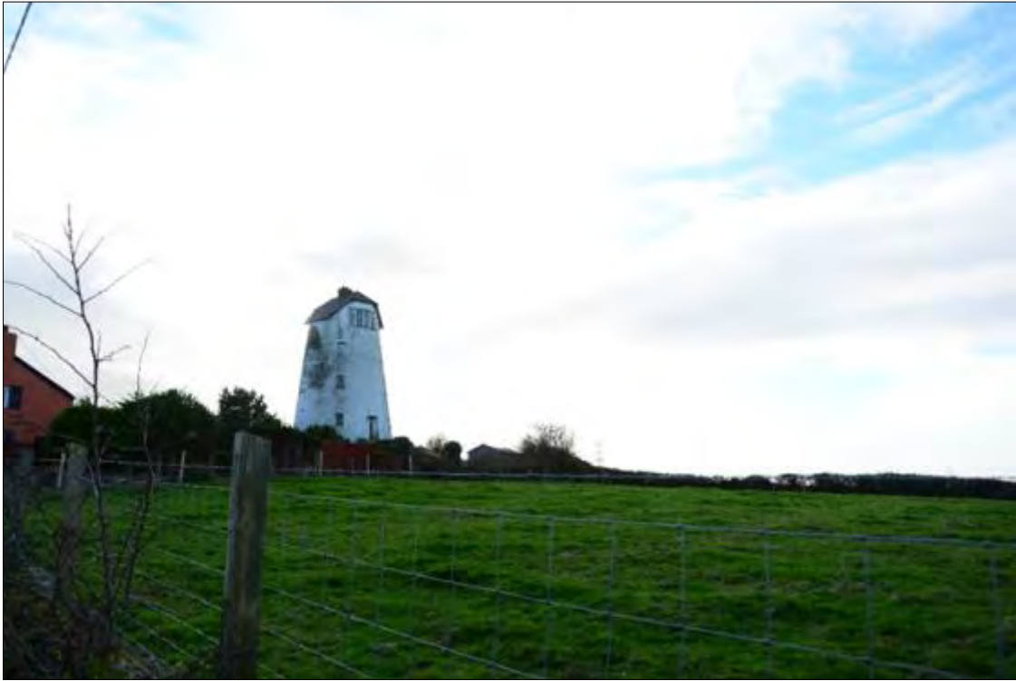
Plate 1a, Cemaes Mill, general view looking south