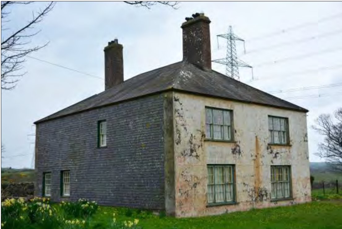
Plate 17c, Rectory, looking north