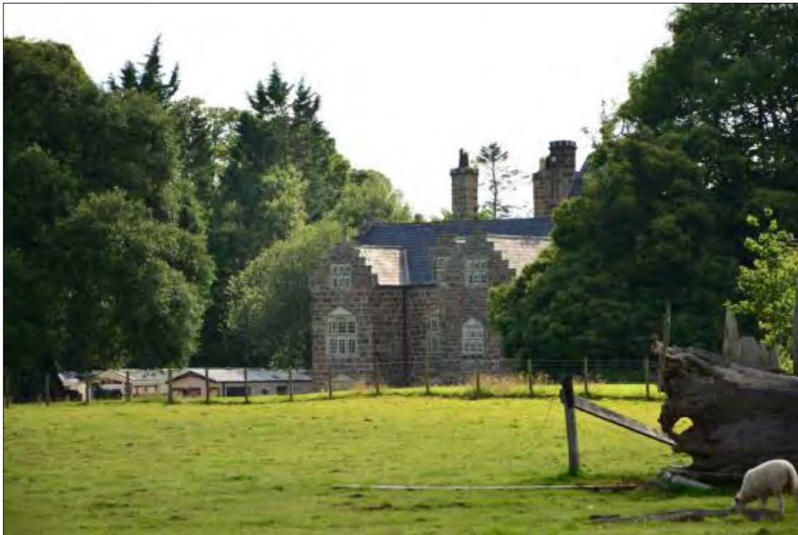
Plate 46a, View of Plas Coch, looking south