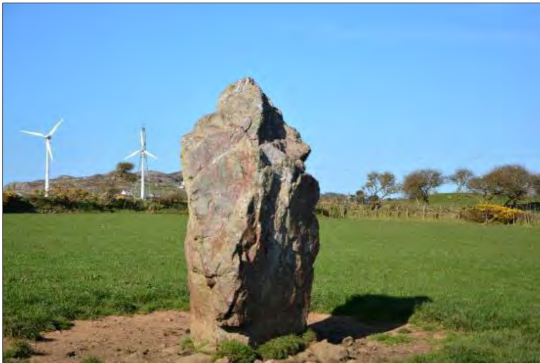
Plate 25a, Llech Golman standing stone, looking north-east