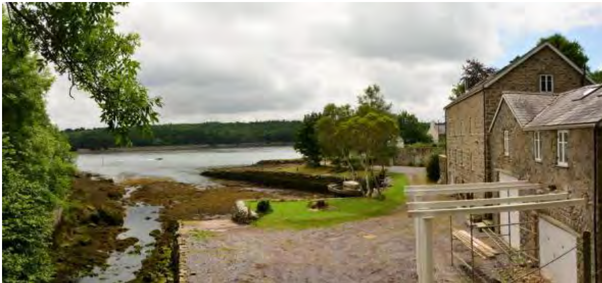
Plate 34a, View of Hen Felin and quayside setting, looking east