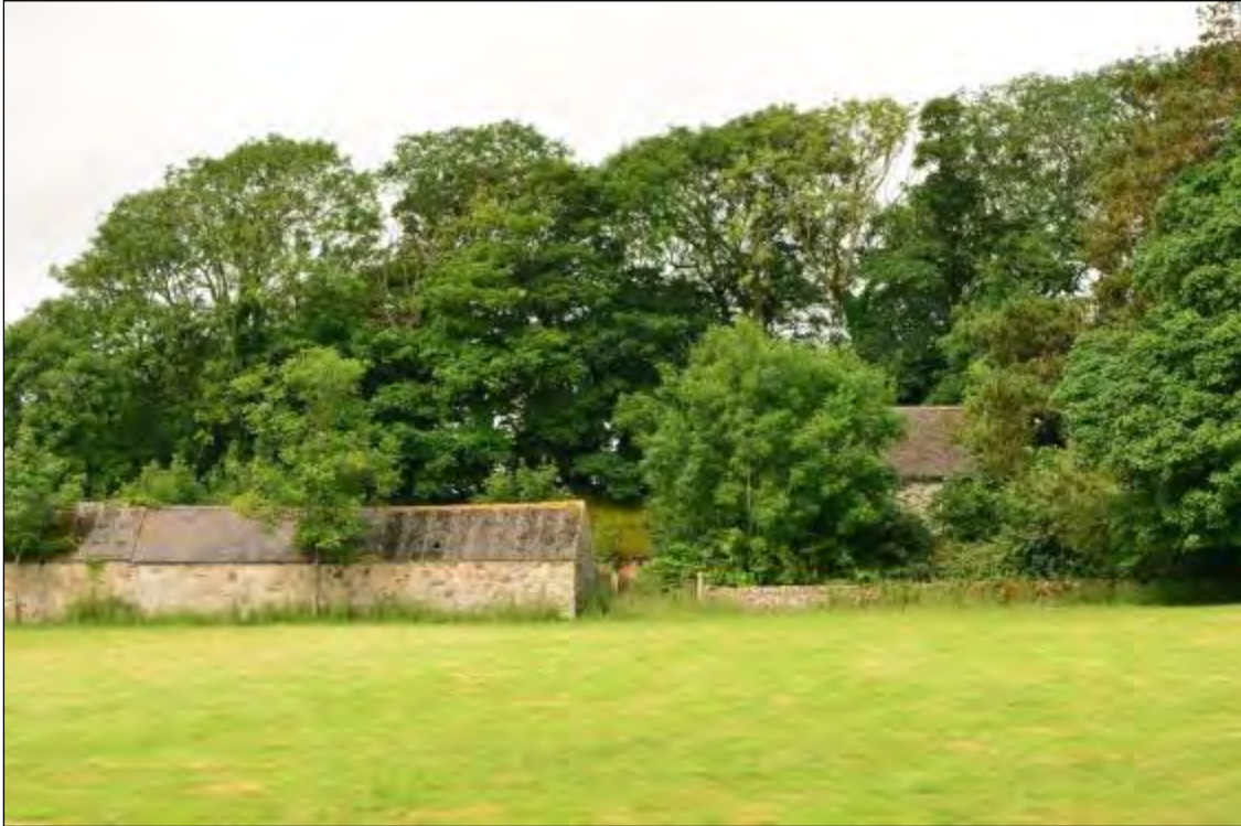
Plate 21a, View of Clorach-back from the east, looking west