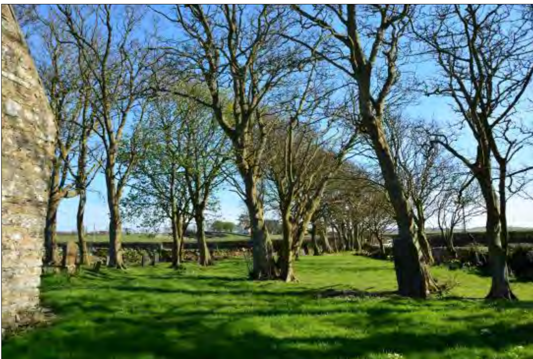
Plate 9b, Church of St Peirio, looking west along avenue of trees that leads to and from the church