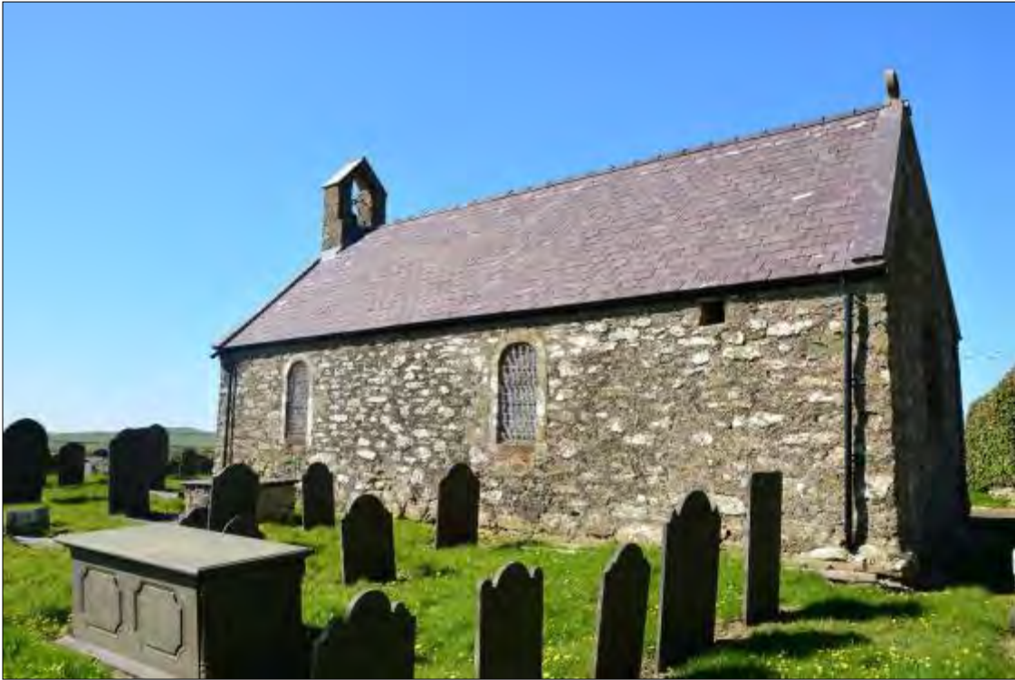
Plate 11a, Church of St Mary looking north-west