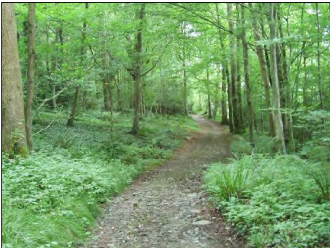
Plate 40b, Woodland walk within Plas Newydd