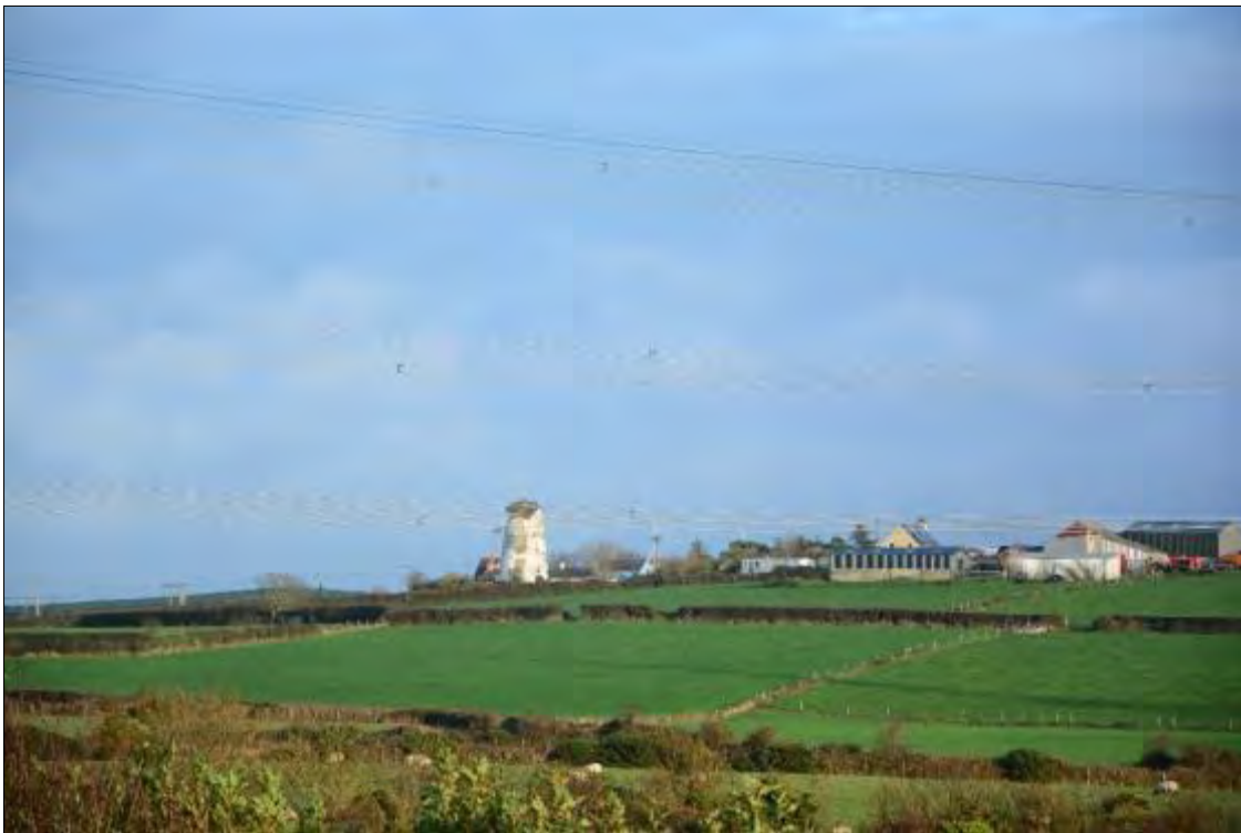
Plate 1b, Cemaes Mill, looking east from a distance of 850m