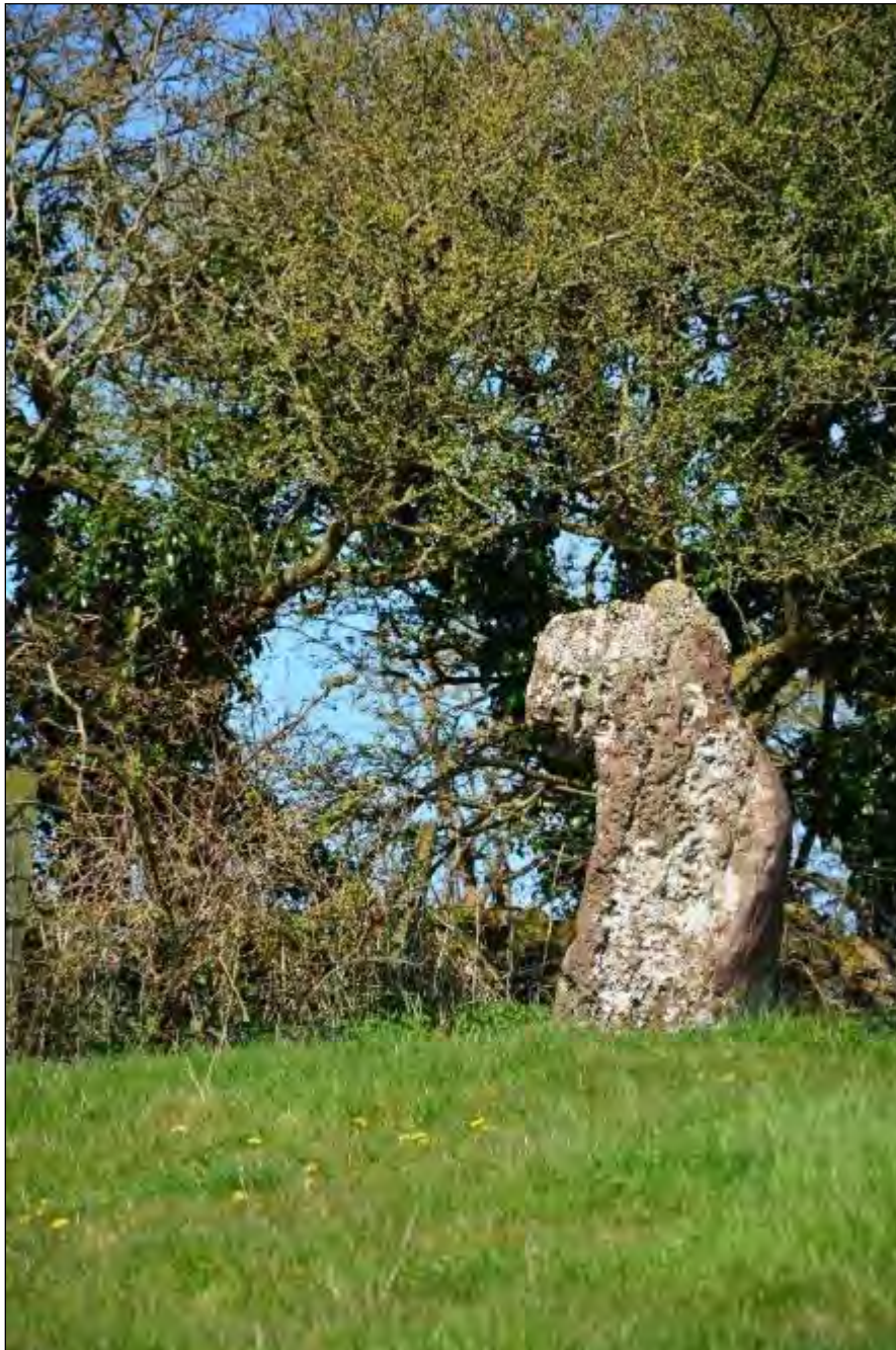
Plate 18a, Carreg Leidr, Looking west (tall hedgerow since removed)