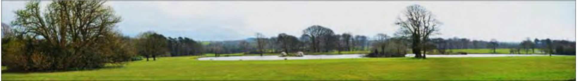
Plate 49a, Panorama view of Vaynol Park, looking east from in front of Vaynol Hall