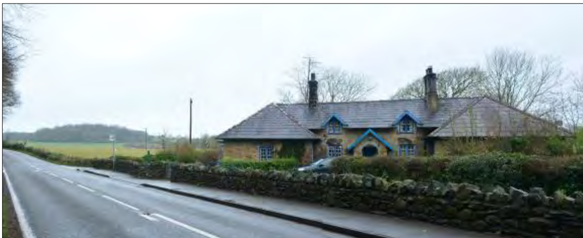
Plate 31a, View of Victoria Cottages, looking west