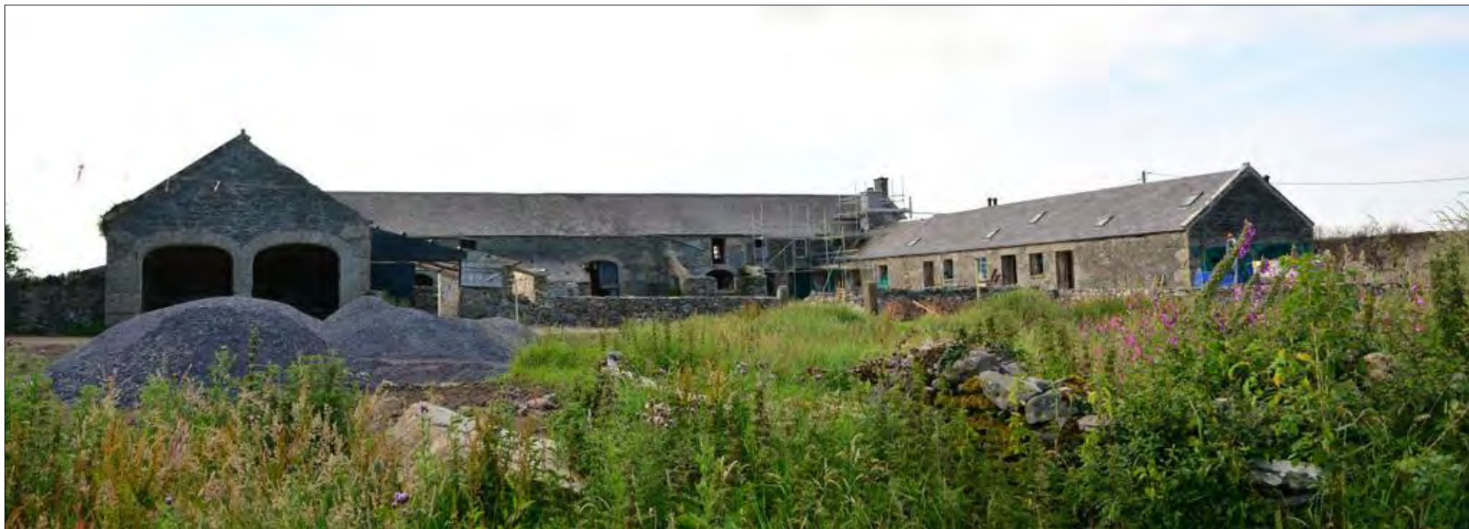
Plate 36a, View of Llwyn-onn farm, looking north