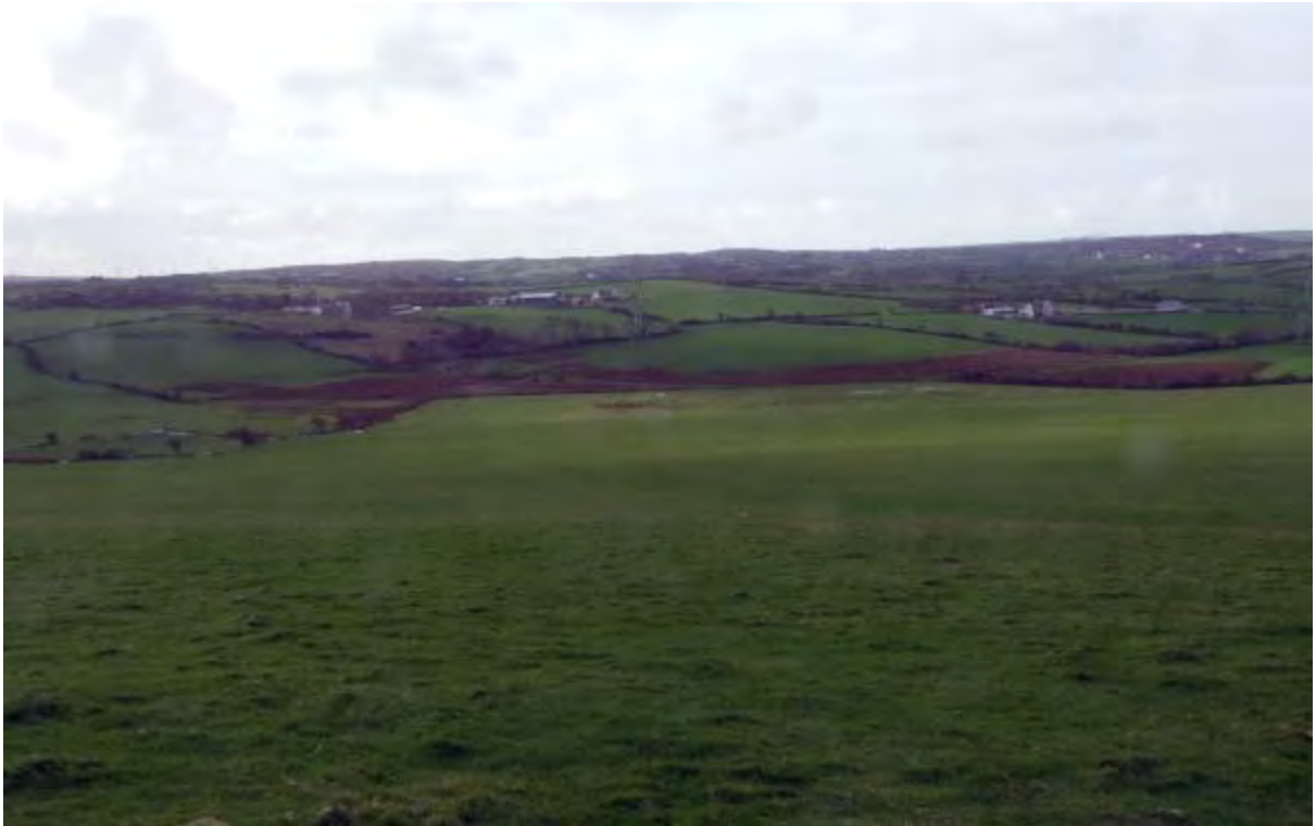
Plate 8a, View of Lifad from Pen-y-Morwyd Round Barrow