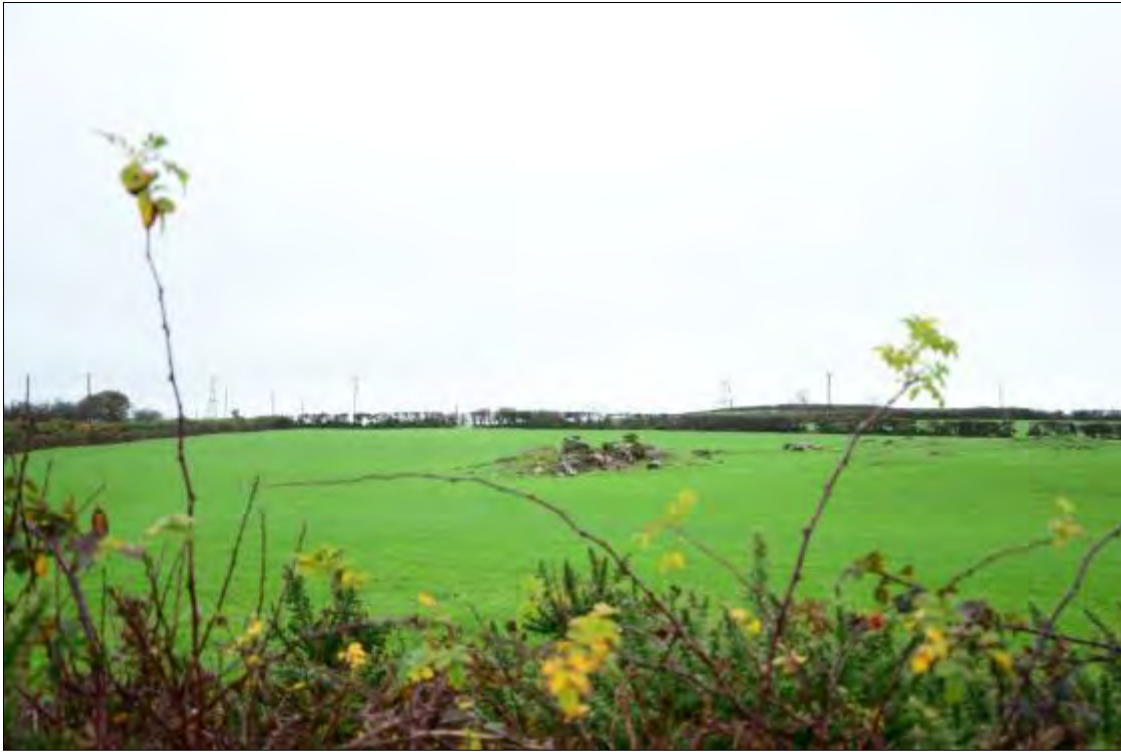
Plate 14a, View of Maen Chwyf looking south