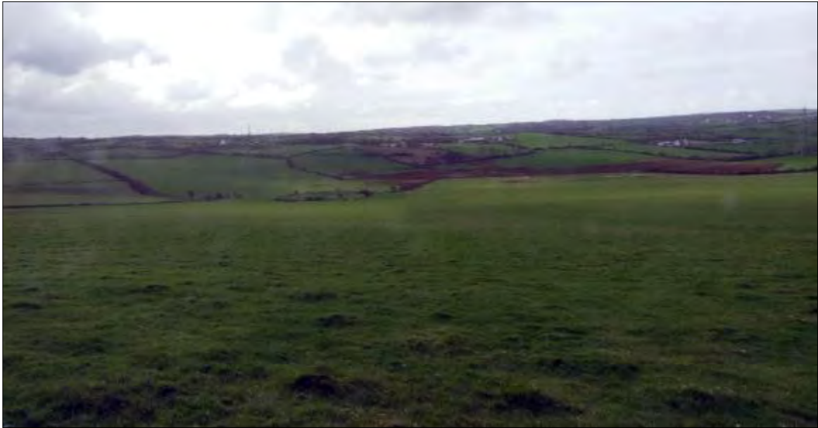
Plate 7c, View from Pen-y-Morwyd round barrow looking south-west