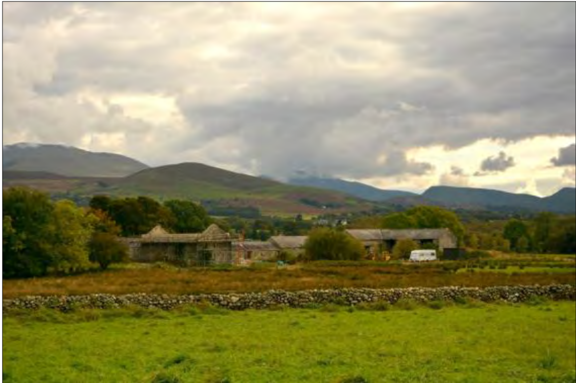
Plate 56a, View across Ty'n Llwyn farm looking south