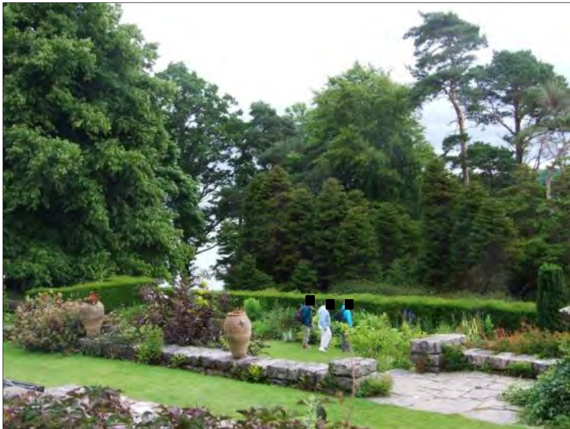
Plate 40a, Mediterranean style formal garden within Plas Newydd