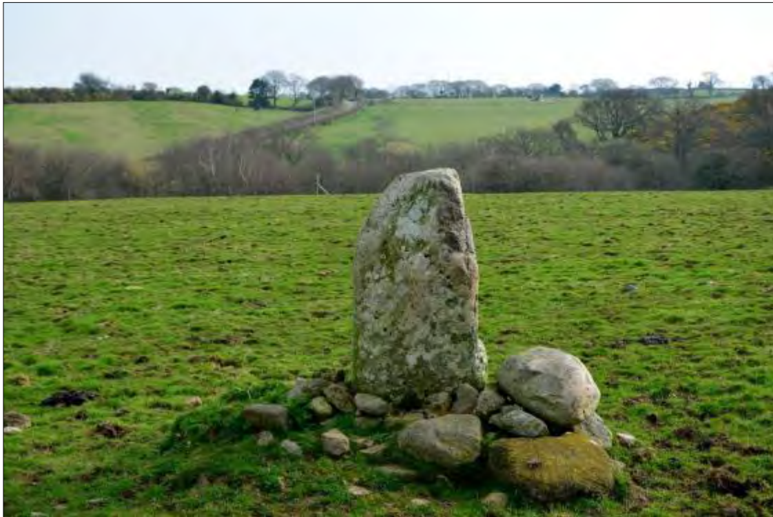
Plate 54a, View of Coed Nant-y-garth standing stone looking north towards proposed Ty Fodol THH/CSEC