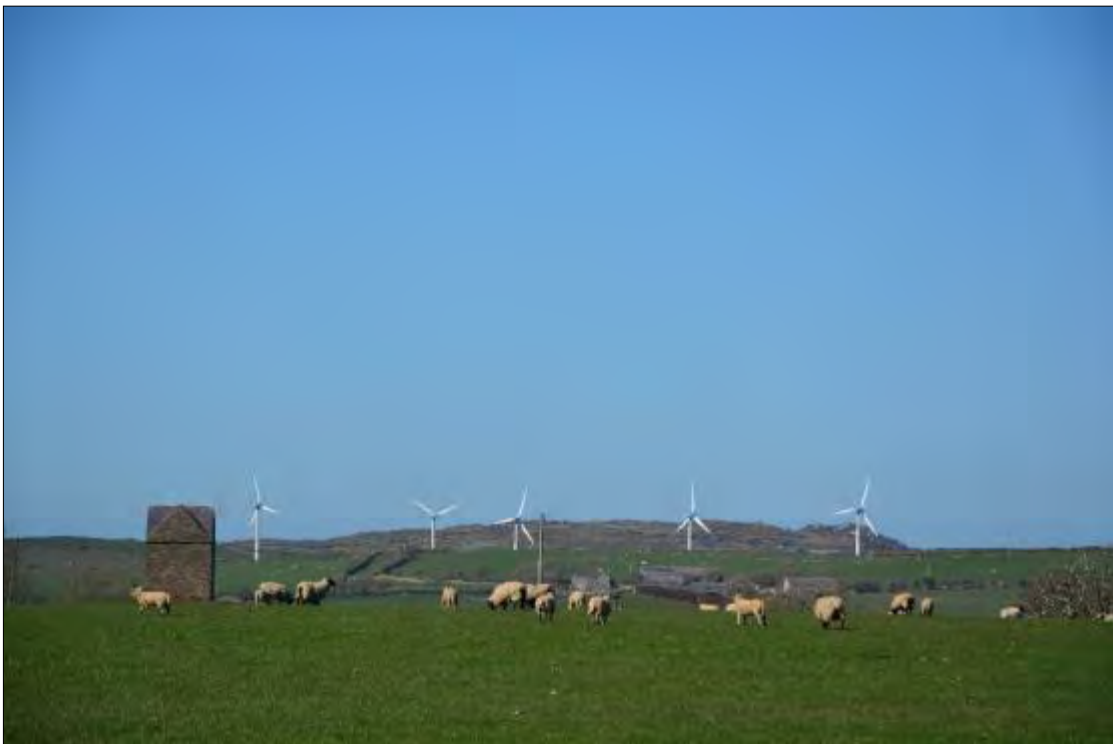
Plate 10b, Distant view of Plas Bodewryd Dovecote from the south-west with windfarm behind