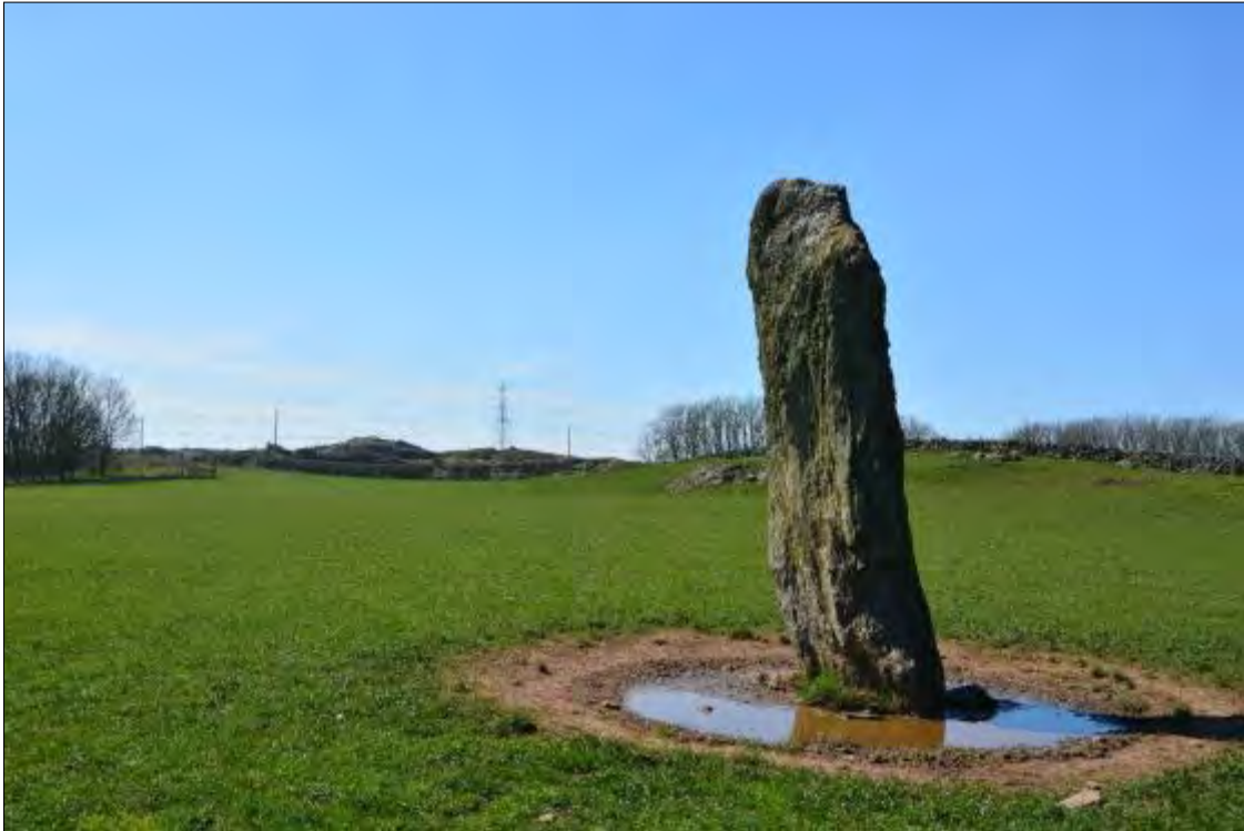
Plate 12a, View of Bodewryd Standing Stone looking north-west with existing 400 kV OHL