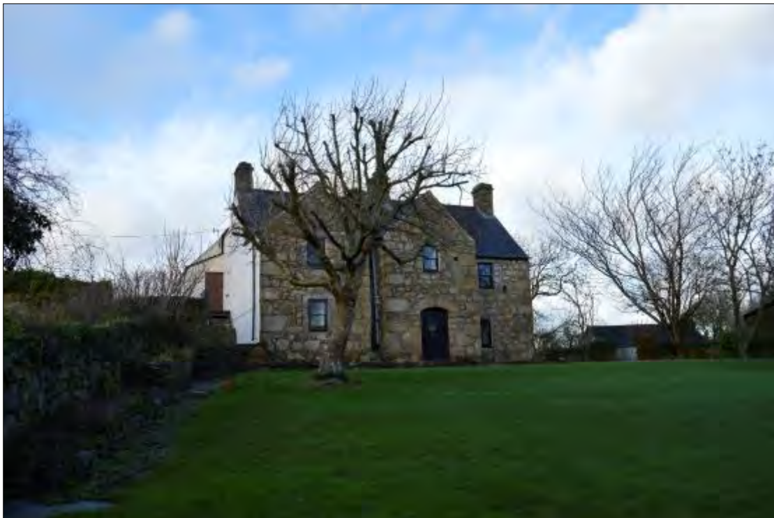
Plate 27a, View of Hendre Howell, looking west