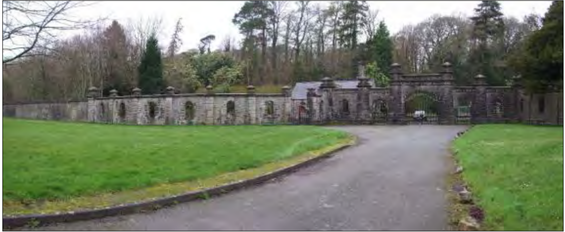
Plate 51a Vaynol Hall Main Entrance and Boundary wall, looking west (top)