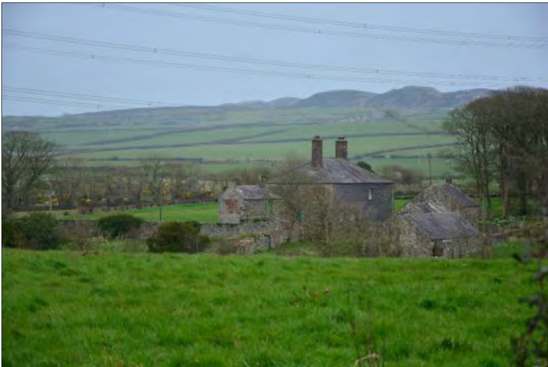
Plate 17d, General view of Rectory and agricultural range, looking east