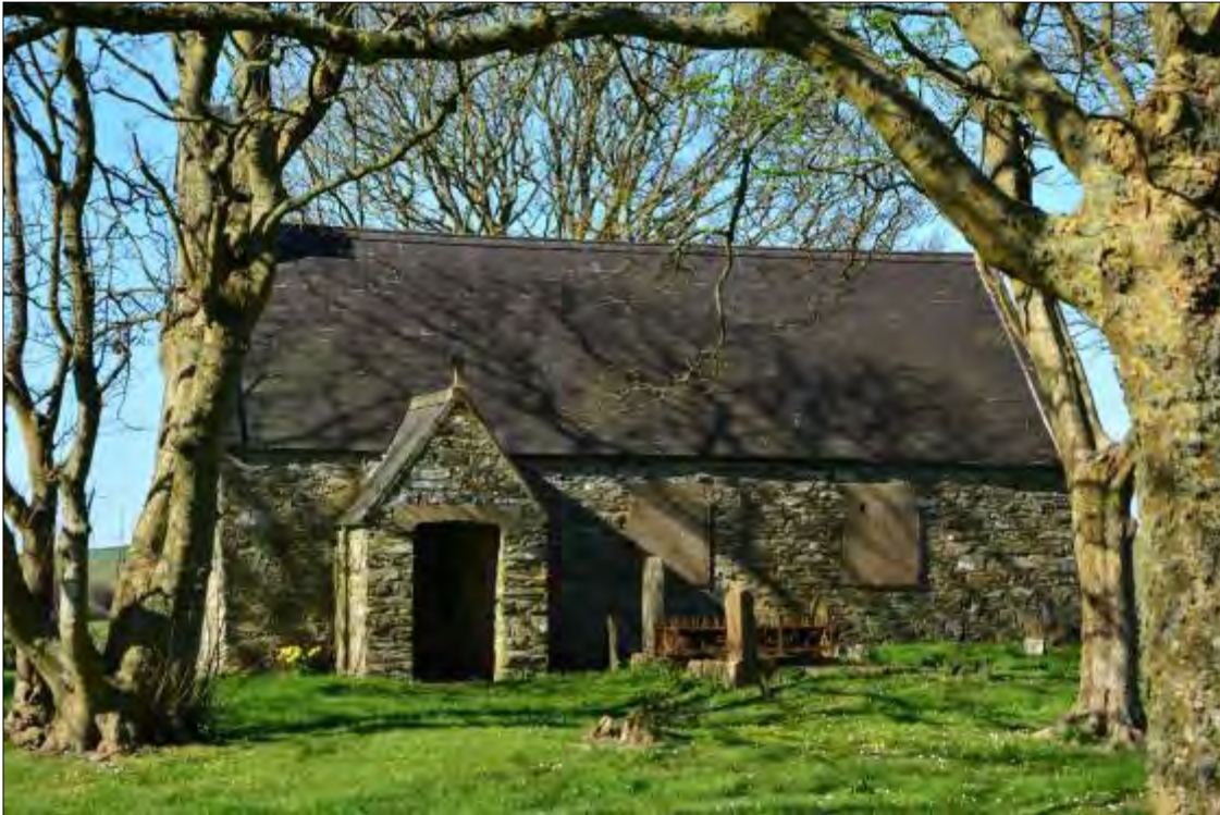
Plate 9a, Church of St Peirio, looking east