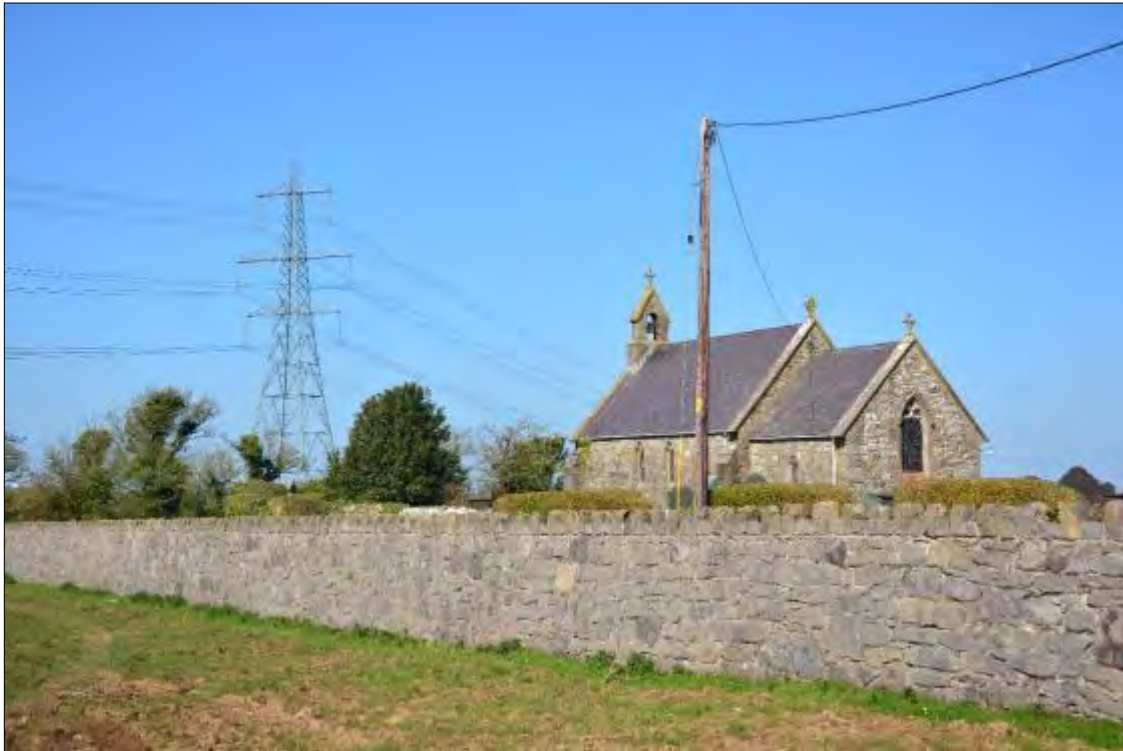
Plate 23a, Church of St Michael, looking north-west with existing 400 kV OHL