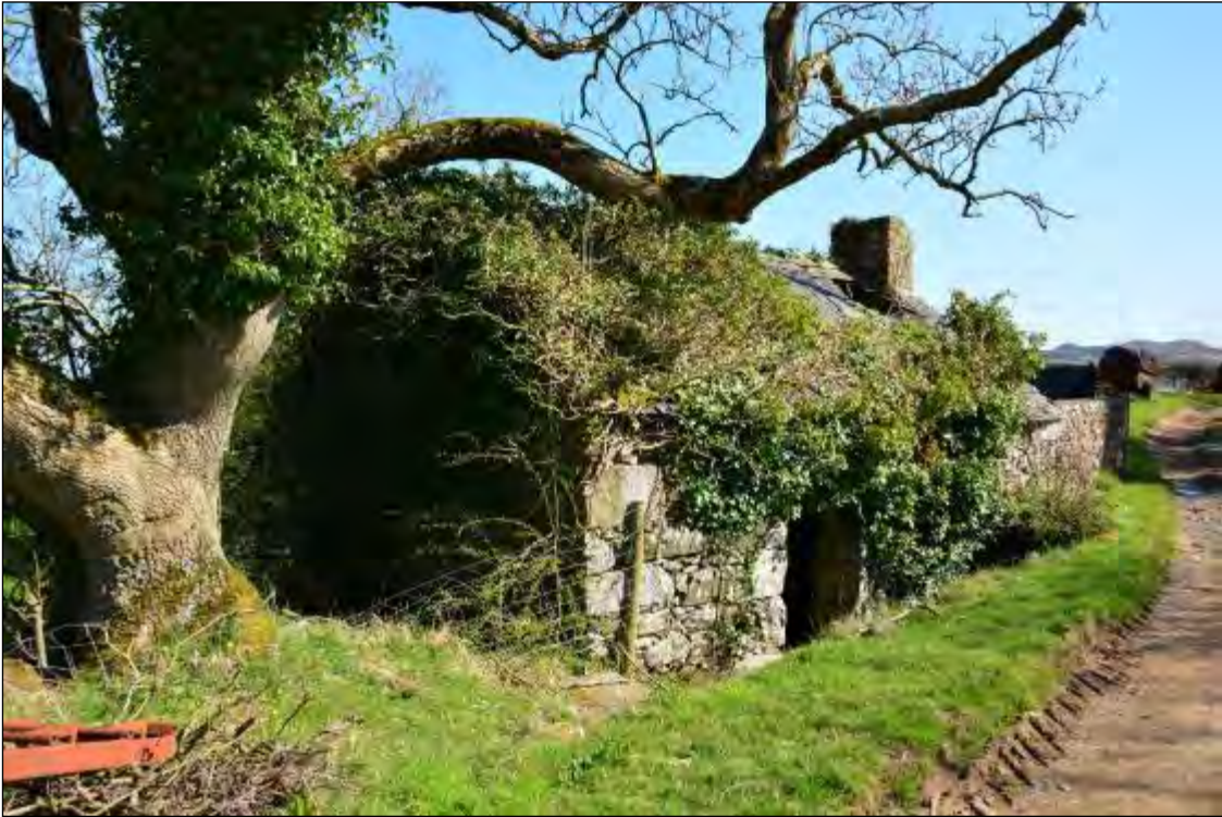
Plate 19c, View of former water mill at Clorach-fawr, looking north-east