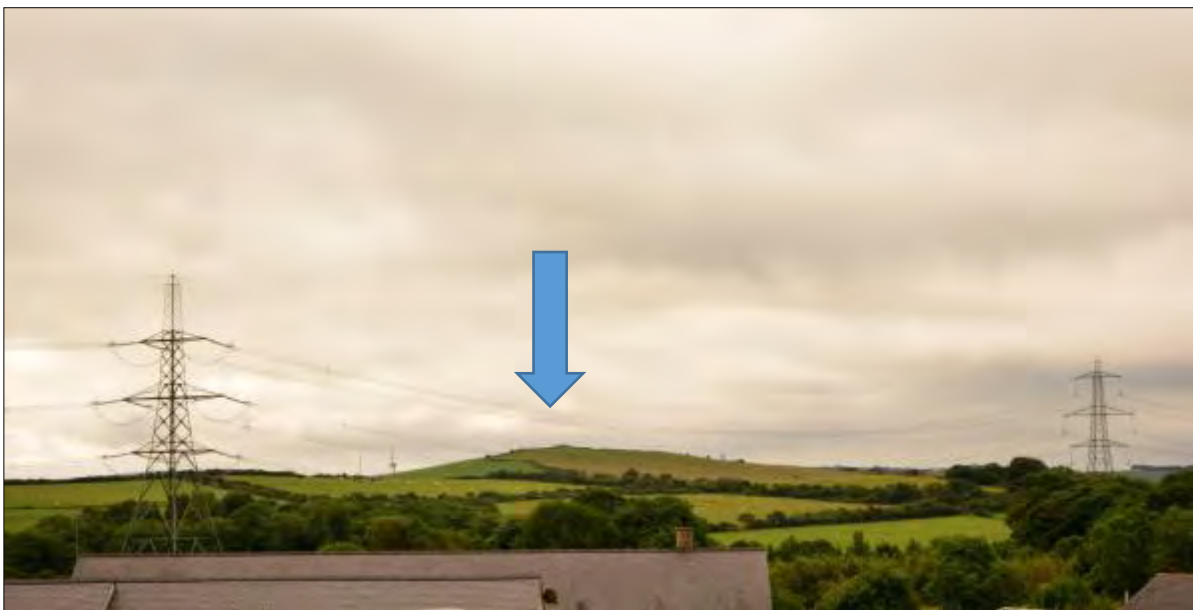
Plate 7d, View of Pen-y-Morwyd round barrow from Llanfechell (arrow indicates monument)