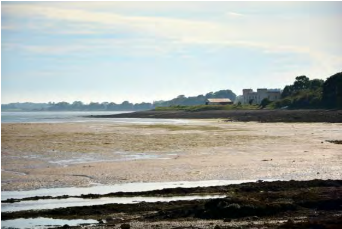
Plate 48a, View of Castell Gwylan from the north showing its location and setting overlooking the Menai Strait