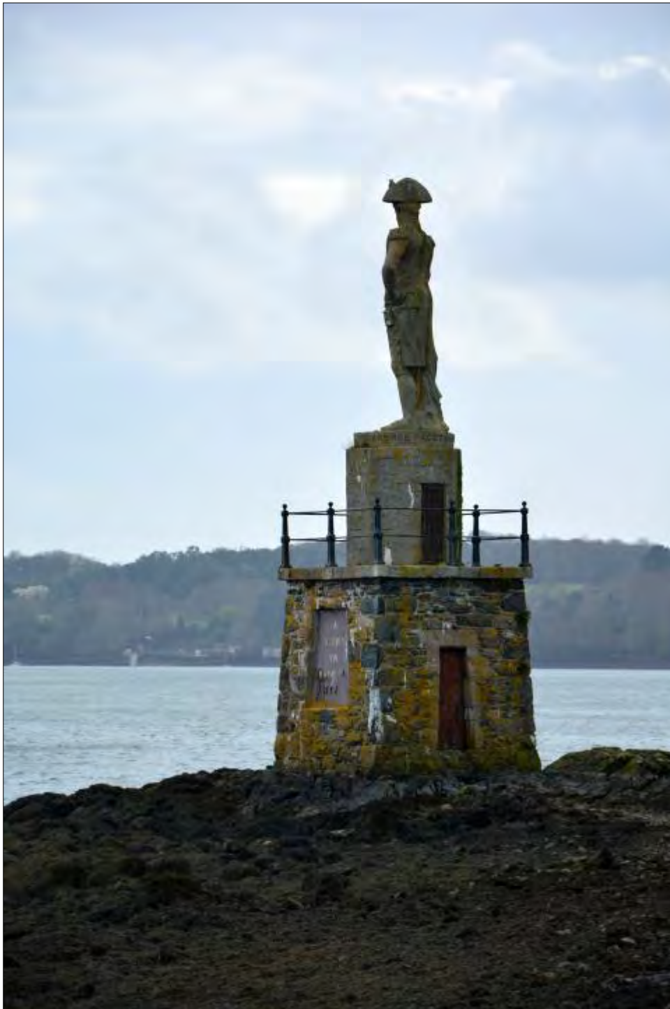
Plate 32a, View of Statue of Nelson, looking south