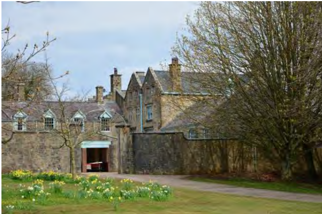
Plate 50a, Vaynol old Hall