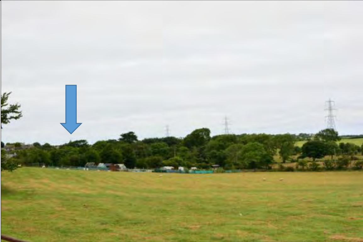
Plate 4b, View of Llanfechell Conservation Area from south. Arrow highlights church tower