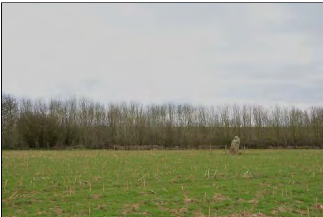
Plate 28a, View of Hirdre-Faig Standing Stone, looking south-east