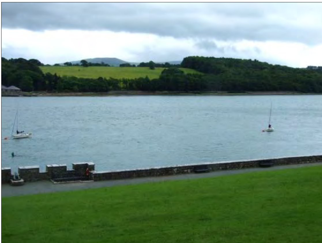
Plate 41b, View from east front of Plas Newydd towards Fodol THH/CSEC