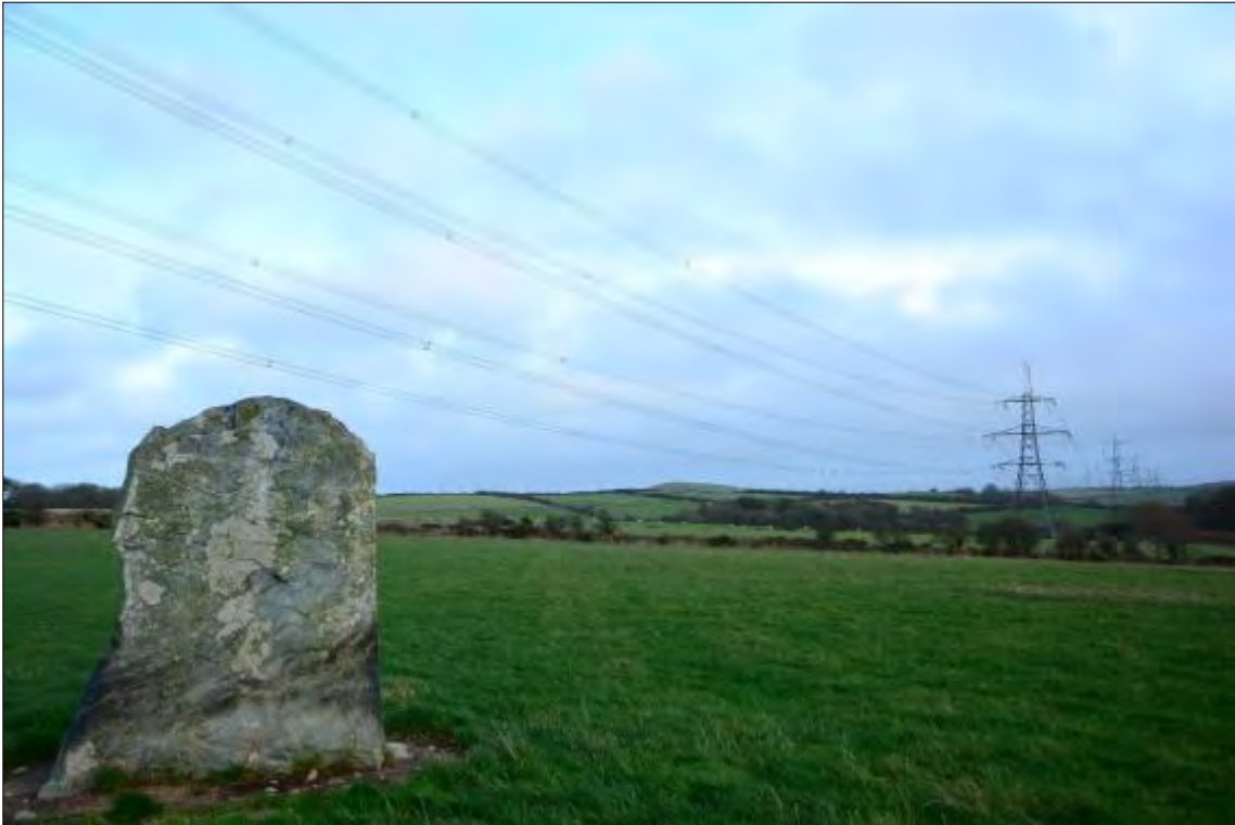
Plate 3c, AN080, looking south with existing 400 kV OHL