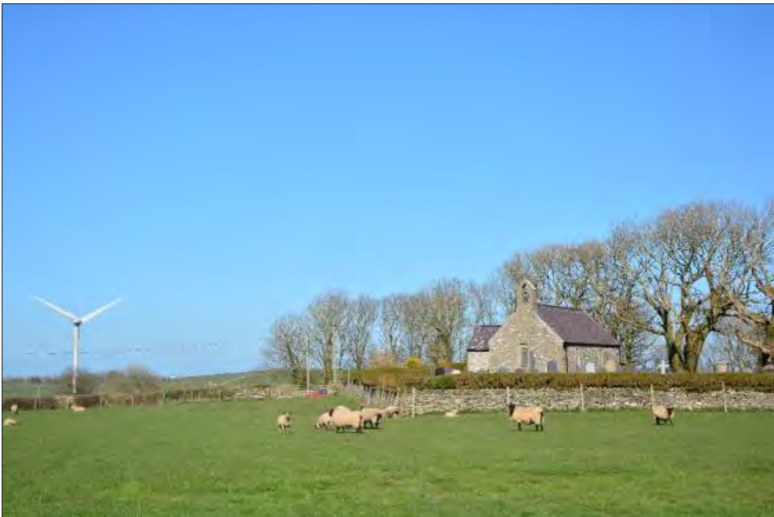
Plate 11b, Church of St Mary looking north-east