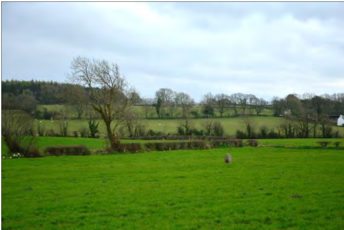
Plate 39c, View of Bryn Celli Ddu standing stone from north-west showing general setting