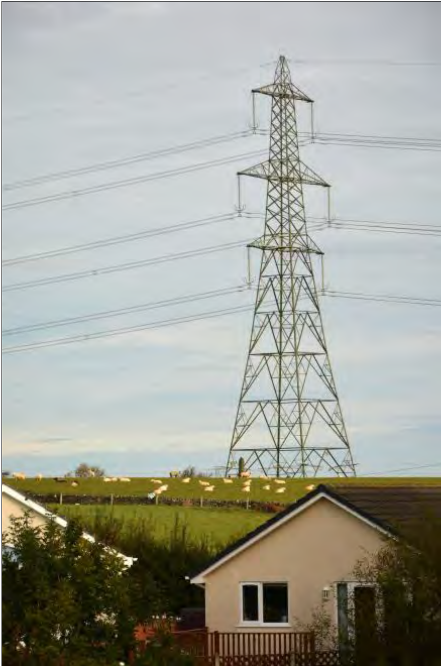
Plate 3b, AN080, viewed from the Llanfechell churchyard extension at a distance of approximately 300 m