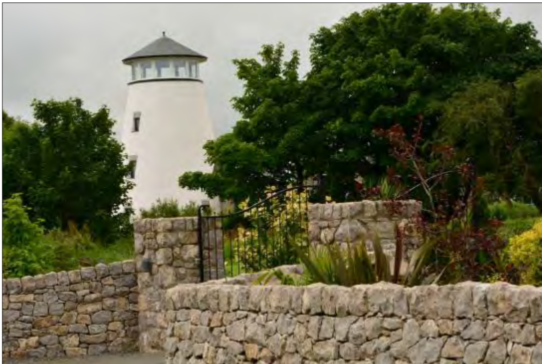
Plate 26a. View of Melin Lidiart, looking south