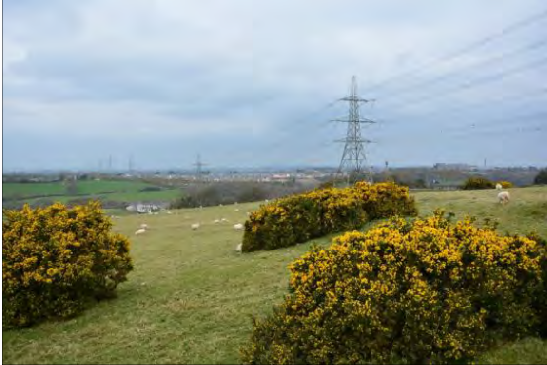
Plate 55a, View across Gors y Brithdir looking north-west showing existing OHL and development around Bangor

Gors y Brithdir Enclosed Hut Group and Ancient Fields Scheduled Ancient Monument (CN203)