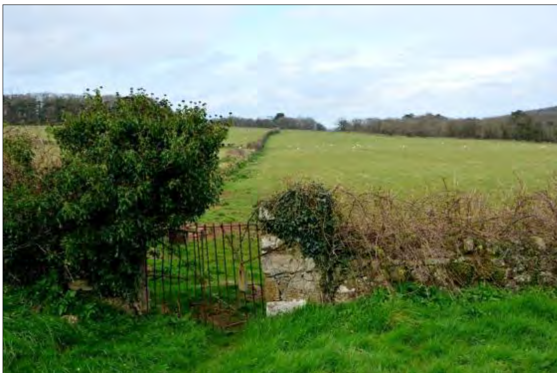
Plate 45b, View of churchyard gate at footpath leading to Plas Newydd, looking south