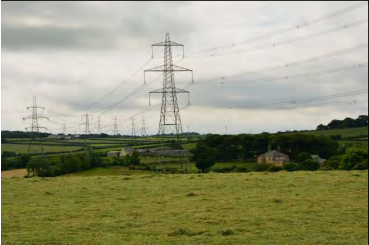
Plate 17e, General setting of Rectory and agricultural range, looking south-east