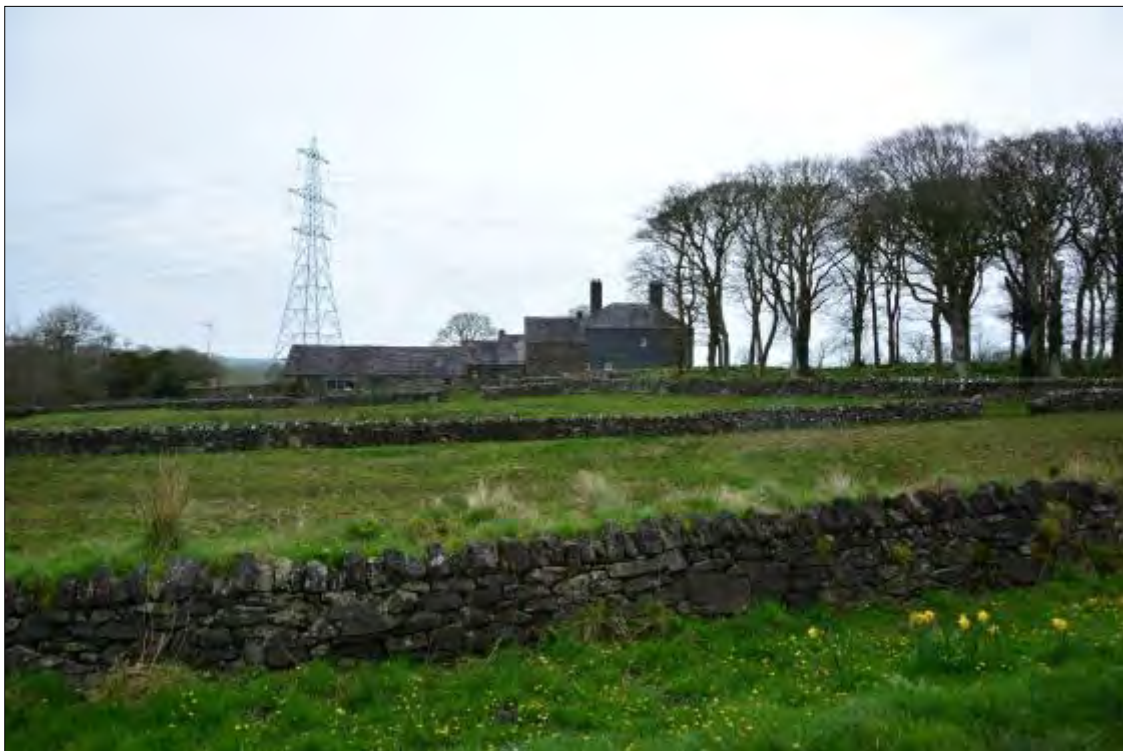
Plate 17b, Rectory and agricultural range, looking north-east with existing 400 kV OHL