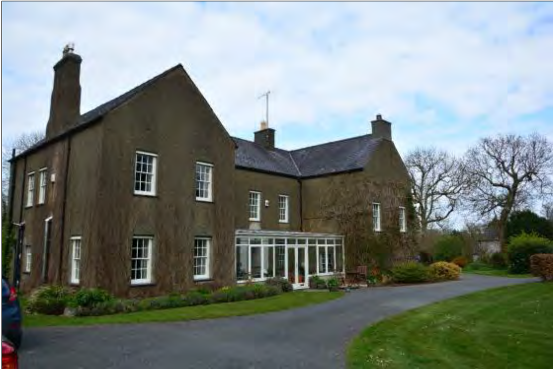
Plate 6a, View of Bryn Ddu looking north