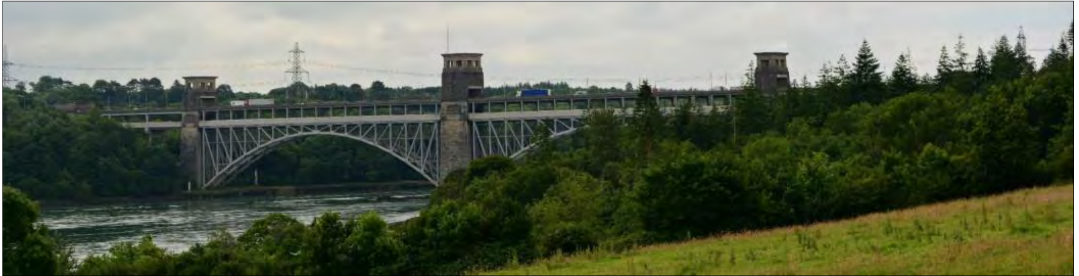
Plate 35a, View of Britannia Bridge, looking south-east