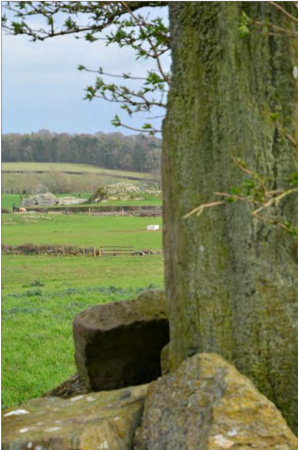
Plate 38b, View from Tyddyn-Bach standing stone towards Bryn Celli Ddu chambered tomb with the rock outcrop perfectly masking it from view