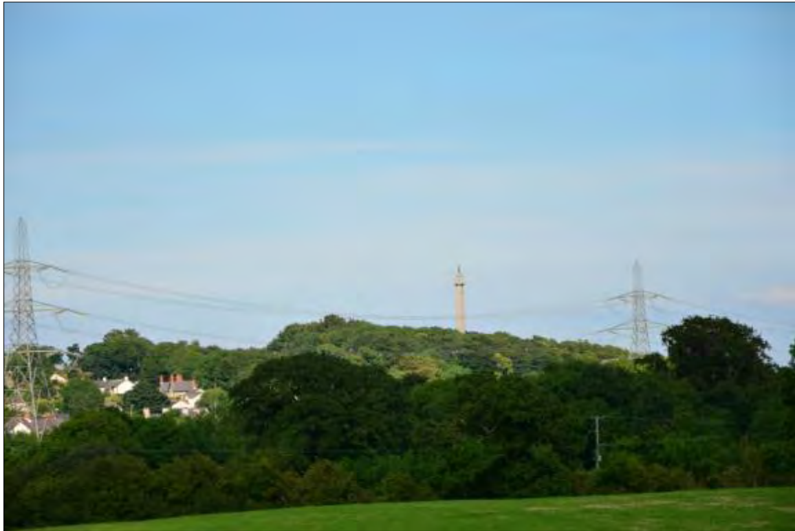
Plate 29a, View of Anglesey Column, looking north-east from road at a distance of 1.3 km