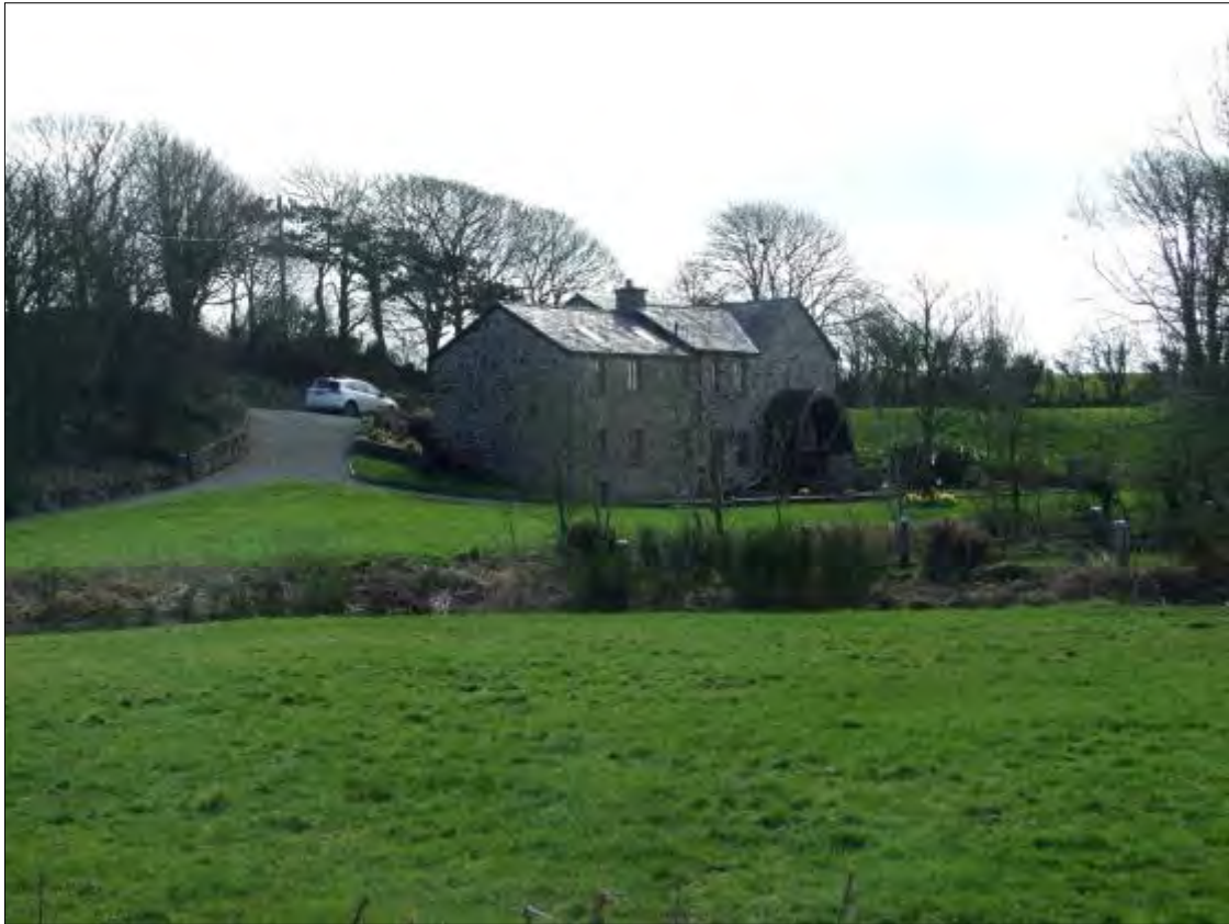
Plate 13a, View of Melin Esgob looking south