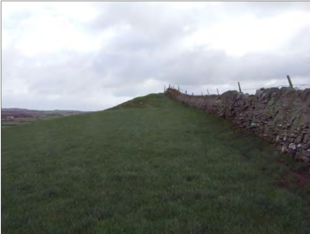
Plate 7a, View of Pen-y-Morwyd round barrow looking south