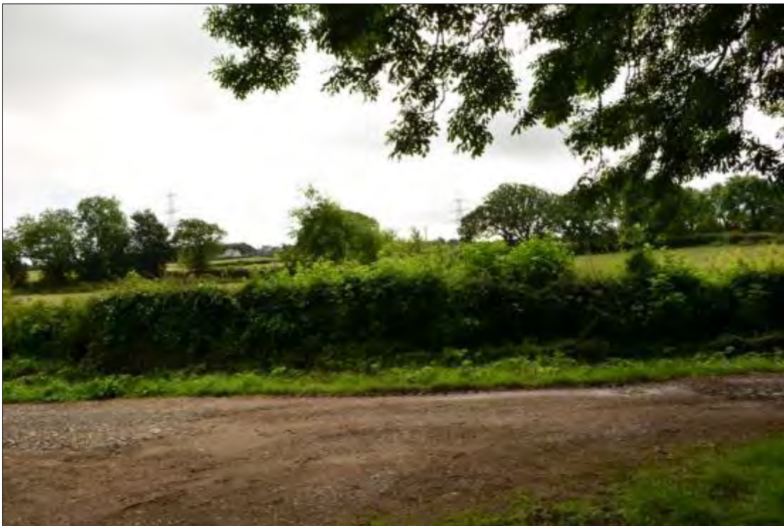
Plate 19b, View from Clorach-fawr, looking east.