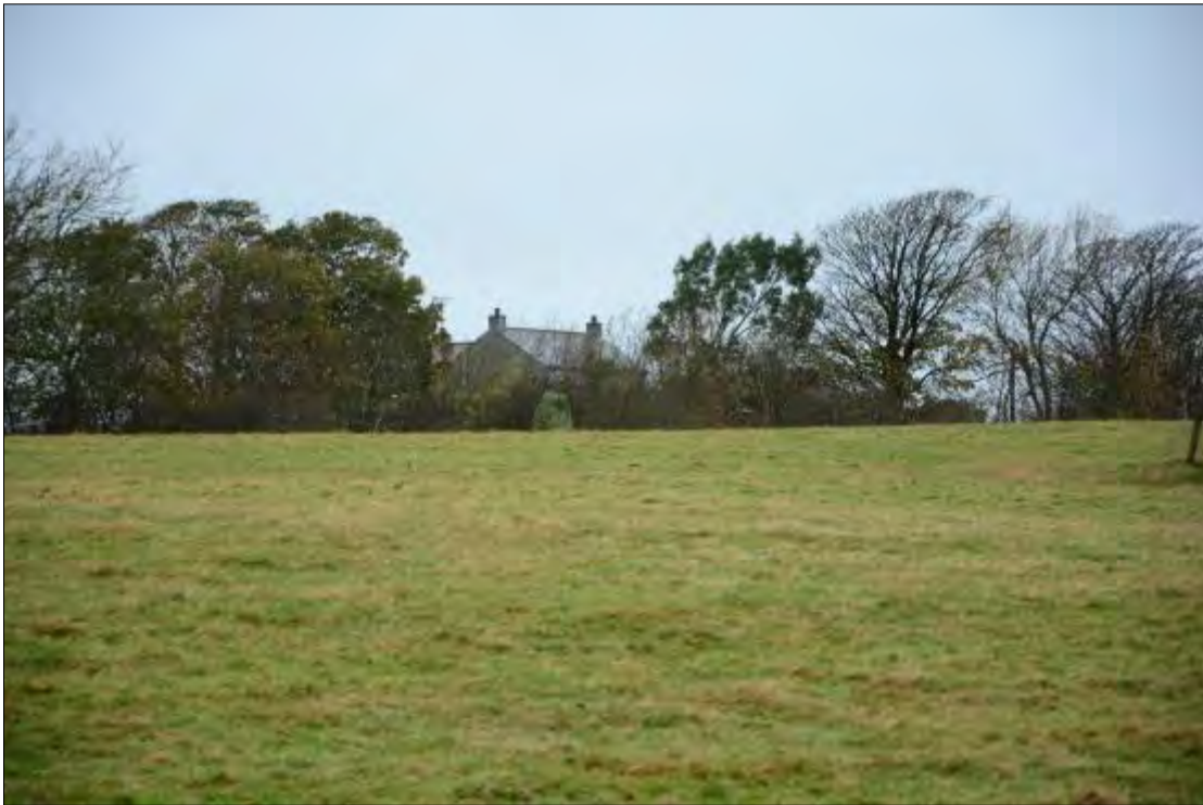
Plate 15a, Llys Einion standing stone looking south-west