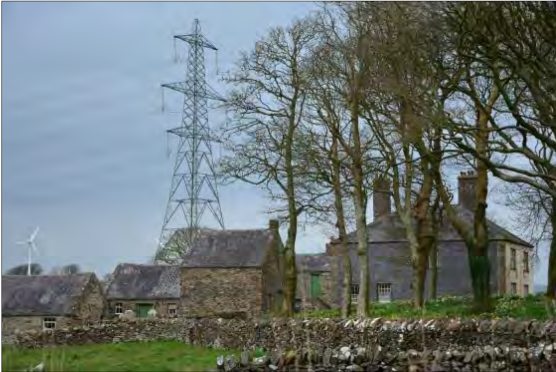
Plate 17a, Rectory and agricultural range, looking north with existing 400 kV OHL