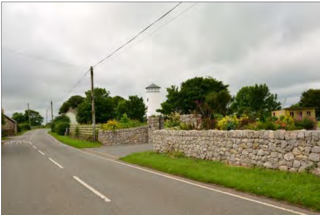
Plate 26b, Setting view of Melin Lidiart, looking south