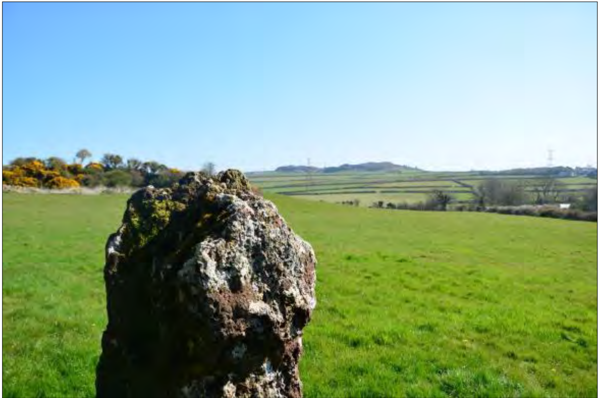
Plate 18b, view from Carreg Leidr, looking east