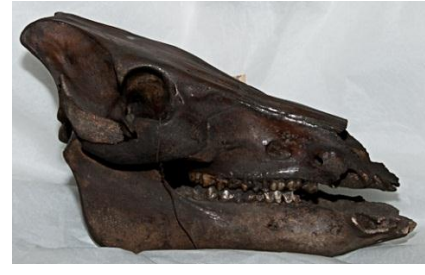
Figure 2. Skulls of a domestic pig (Carden, personal collection), a wild boar (NMS, Edinburgh) and an Irish 'greyhound pig' (NMI, Natural History, Dublin) (see Section 3.5) illustrating the different shape changes of the dome-shaped skull case, sloping nasal region and lower jaws.