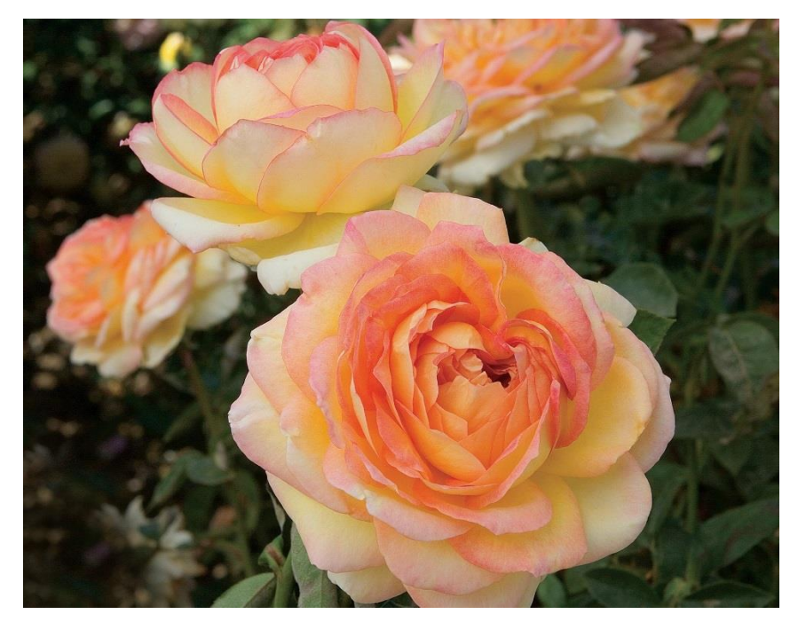
Centennial Star ® Rosa 'Meinerau' Hybrid Tea

Selected for the centennial of Star<sup>®</sup> Roses in 1997, the strongly fragrant golden yellow blooms remind one of Peace but with stronger colors and a higher petal count. Tall, bushy plants have dark green, glossy foliage. Great for cutting and bringing inside.