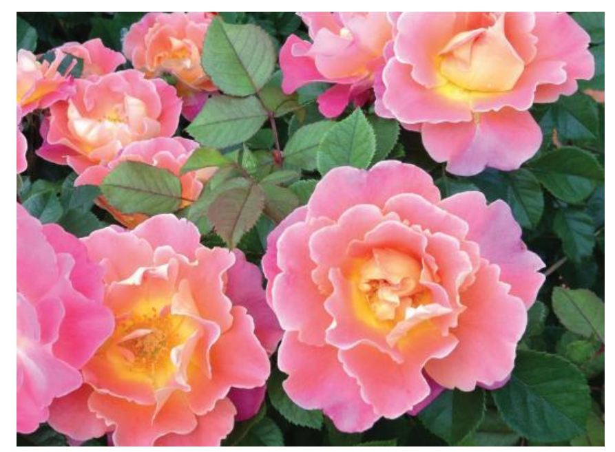
Fruity Petals™ 'Radpetals' Climbing Rose

Fruity Petals<sup>™</sup> is a disease resistant Climber from Will Radler, breeder of The Knock Out® Rose. This Climbing rose explodes with a heavy flush of blooms in the spring and reblooms throughout the season. The color is very unique and can be described as coral with a yellow eye. Ideal for arbors and fences.