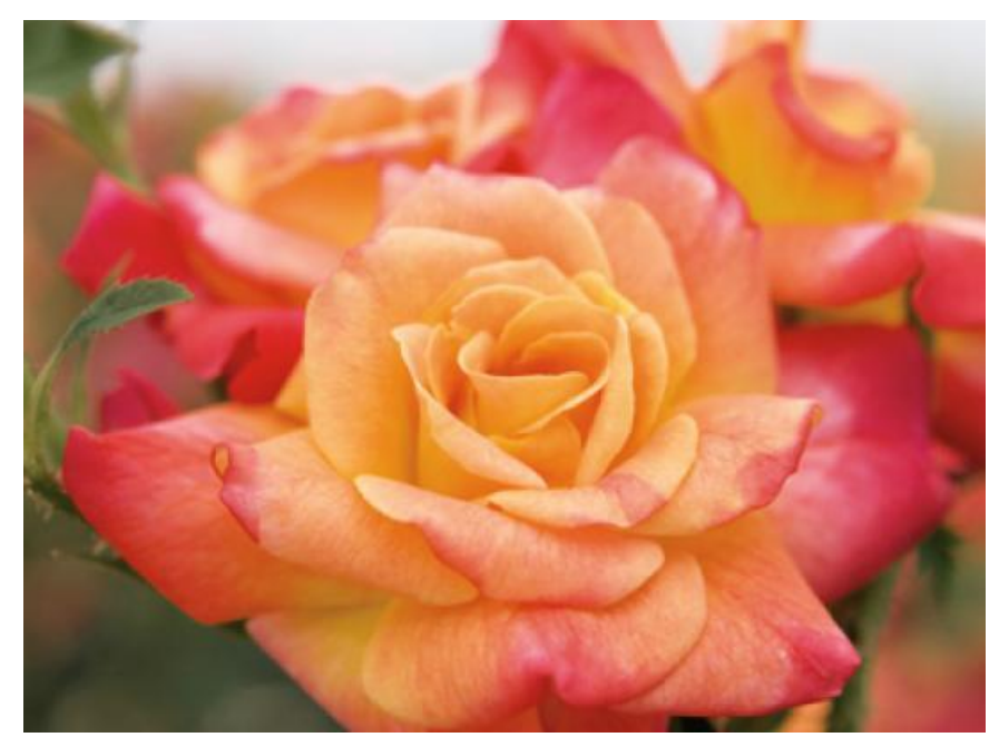
Joseph's Coat Climbing Rose

Unique color with a bold statement! A continuous kaleidoscope of ever-changing yellow to scarlet back to orange and carmine has made this rose a classic in mild climates. The green apple colored foliage helps soften the bold in-your-face statement made by the profusion of vivid, almost indescribable blooms. Allow to grow up a trellis or any other vertical surface that you'd like to fill with color. Blooms heavily and repeats throughout the season.