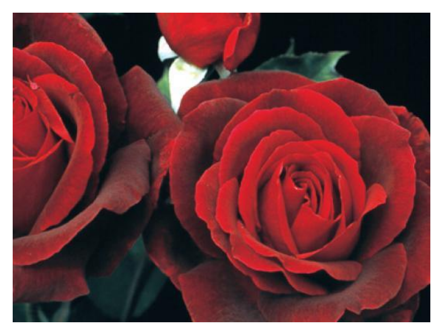
Mister Lincoln Hybrid Tea

Long stems, dark leaves, great high-centered flowers that open fully and offer a wonderful damask fragrance. Tall, vigorous and ever-blooming. High disease resistance. Good for cutting and bringing inside. Mister Lincoln was selected as the '<u>Best Hybrid Tea Rose</u>' by Birds & Blooms in 2014.