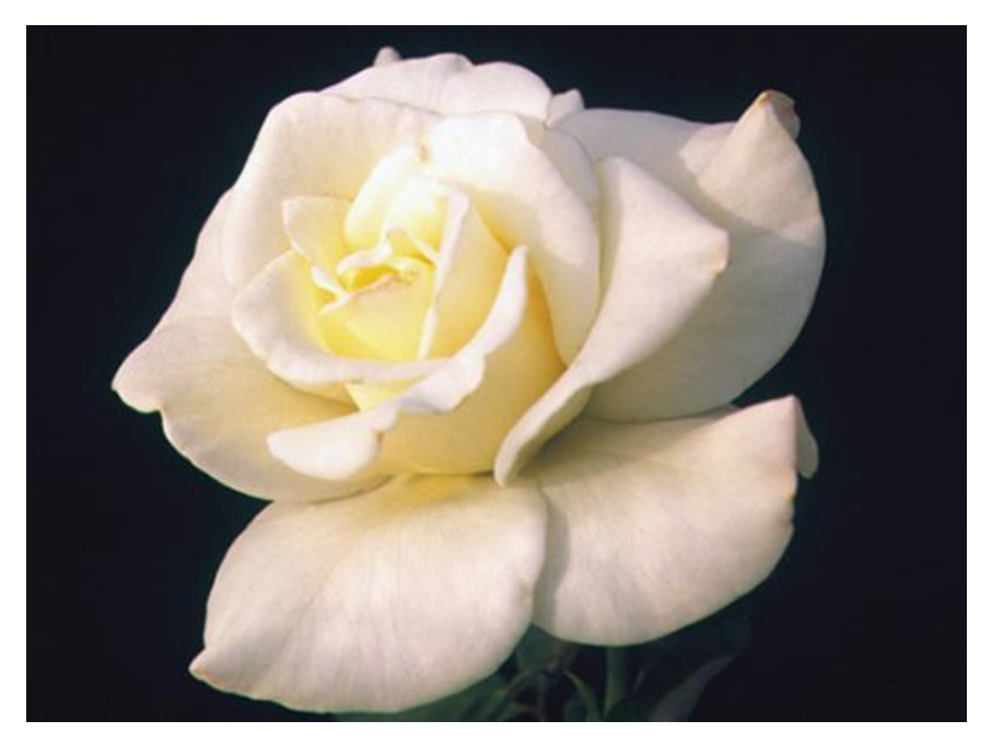
John F. Kennedy Hybrid Tea

THE classic white Hybrid Tea. This strong, classy and handsome rose has withstood the test of time. As popular today as ever. Good for cutting and bringing inside.