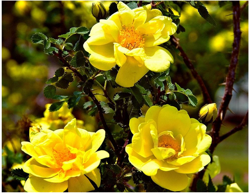
Golden Showers Climbing Rose

Popular yellow climber has bright yellow-gold flowers with honey-like fragrance, blooming spring through fall on robust plants. Blooms Spring-Fall. Ideal for arbors, trellises, and fences. This rose is a recipient of the All American Rose Selections award.