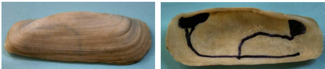
Tagelus adansoni (Bosc, 1801) (L - 60mm)