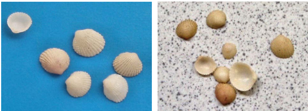
Plagiocardium papillosum (Poli, 1795) (L - 5mm)