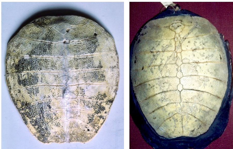
Figure 9. Bony carapaces of Cyclanorbis senegalensis. Left: NMW 125-2 (201 mm), right: BMNH 65.5.3.75 (230 mm).