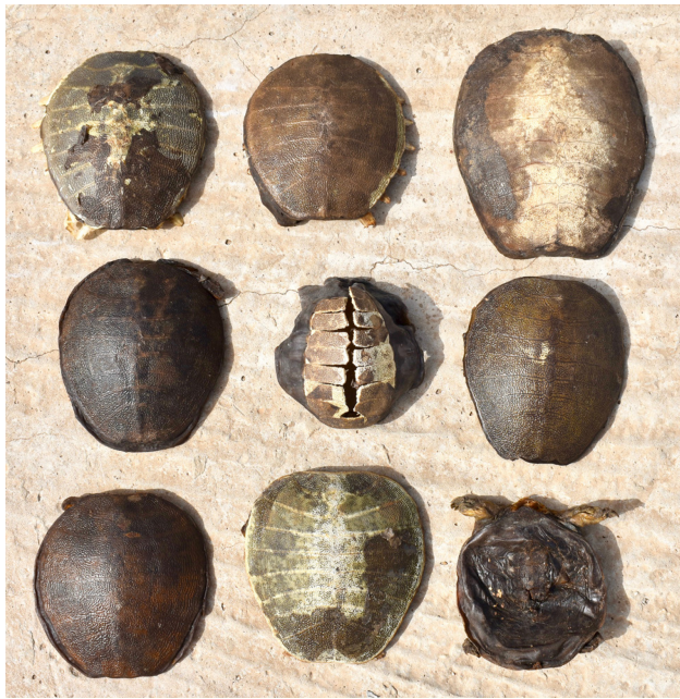
Figure 13. Carapaces of nine Cyclanorbis senegalensis consumed or killed by fishing gear in Senegal.

in Ghana that also included bones of antelope, crocodile, and python.