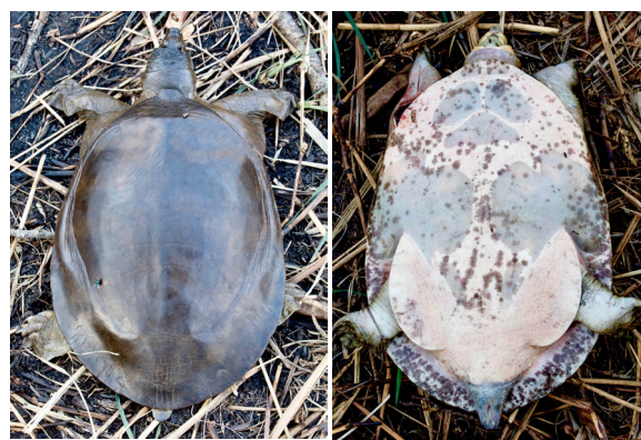
Figure 3. Cyclanorbis senegalensis from western Ethiopia.