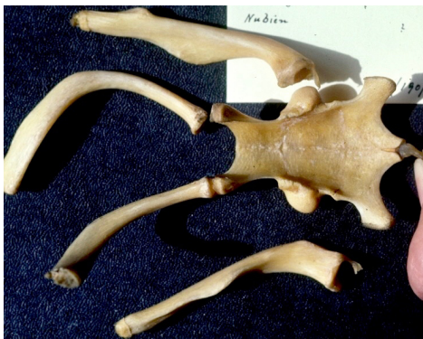
Figure 11. Hyoid apparatus of Cyclanorbis senegalensis (NMW 229).

Habitat and Ecology. — The few available accounts of the ecology of this species suggest that it is a riverine form and habitat generalist that also occupies seasonal wetlands. Andersson (1937) reported on a collection of four small specimens (4.0 to 12.0 cm CL) in river marshes during the rainy season in Gambia, and another large specimen caught on a longline in a river. Hughes (1979) reported at least three specimens taken from the Mole River within Mole National Park, Ghana, and mentioned another from near the Volta River. Based on the capture of 196 C. senegalensis specimens from six range countries, Akani et al. (2018) found that this species prefers medium sized rivers (5–25 m river-bed width) with sparse emergent vegetation, grassy, semi-vegetated banks, and predominantly muddy bottoms. This study compared C. senegalensis to the larger trionychid, Trionyx triunguis , with which it is often sympatric, finding that C. senegalensis is more of a habitat generalist, being found consistently in rivers with varying degrees of both shoreline and emergent vegetation as well as varied