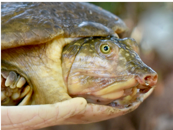
Figure 6. Cyclanorbis senegalensis from Senegal.

In mature individuals, the color of the carapace is light brown to blackish olive (see Gray 1860, 1870, and Pritchard 1979; gray in preservative). The surface of the carapace is covered with a thick, smooth skin which completely hides the rugosity of underlying bones. The plastron is white,