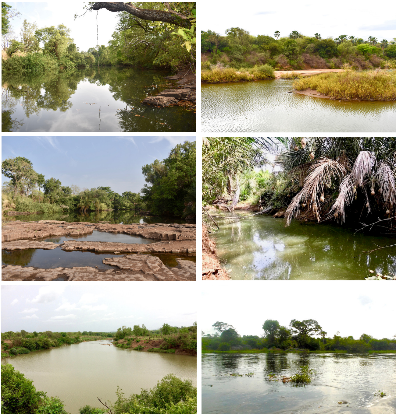
Figure 12. Habitats for Cyclanorbis senegalensis. Top left: Koila Kabe River, southeastern Senegal. Top right: Gambia River, near Madina in southeastern Senegal. Middle left: Koila Kabe River, near Khouleya, southeastern Senegal. Middle right: Kofla, near Sekoto in southeastern Senegal. Bottom left: Mékrou River, Atakora Dept., northern Benin. Bottom right: Southern White Nile River, South Sudan.

substrate bottoms (rocky, sandy, muddy). The greatest partitioning of the available aquatic habitats throughout the overlapping distributions of these species seemed to occur in the largest of rivers (> 25 m river-bed width) where T. triunguis was the dominant species captured. In Ghana, where it is the most common turtle species in permanent freshwater ecosystems, C. senegalensis is more similar to T. triunguis in its choice of habitat than to