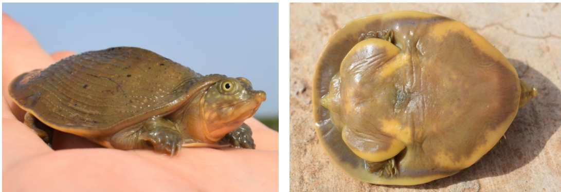
Figure 8. Hatchling Cyclanorbis senegalensis from Niokolo-Koba National Park, Senegal. The unossified prenuchal can be seen as a raised area at the front of the carapace above the eye; 54.1 mm straight carapace length.

As the smallest and lightest representative of the African cyclanorbines, C. senegalensis rarely exceeds 35 cm in curved carapace length (CCL) and 4 kg in mass (Villiers 1958; Rödel and Grabow 1995; Devaux 1998; Pritchard 2001; Gramentz 2008; Akani et al. 2018). In the most representative published dataset regarding CCL for this species, Akani et al. (2018) measured 63 specimens (32 males, 28 females, 3 immature) captured in six countries in the center of the species' range, documenting an average CCL of 23.3 cm (range, 12.0–34.2 cm).