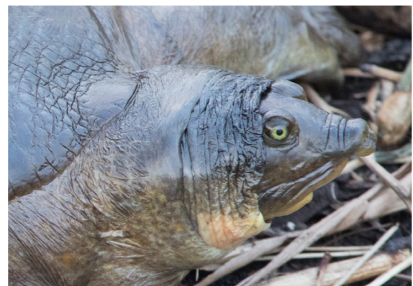
Figure 7. Cyclanorbis senegalensis from Ethiopia.

Skeletal material of this species is most easily identified by an unusual neural series, which, though highly variable, is nearly always divided by pairs of costal bones meeting on the midline (in 19 of 21 specimens examined by Meylan 1987). The work of Hughes (1979) suggested that there is a geographic pattern to the significant variation in the arrangement of the neural bones in this species.