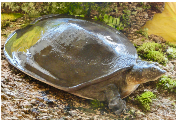
Figure 2. Cyclanorbis senegalensis from Northern Prov., Sierra Leone.

Although there is remarkable variability in the elements that make up the plastron, adult C. senegalensis are typically characterized by the presence of either seven or nine plastral callosities, with a single callosity covering the fused hyo-hyoplastra. More than nine plastral callosities have occasionally been reported (Gramentz 2008). When seven callosities are present, they include a hyo-hyoplastral pair, an epiplastral pair, a gular pair, and a midline ossification over the entoplastron. In most C. senegalensis , xiphiplastral callosities are absent. The gular callosities are unique among trionychids and cyclanorbines. These are always present and are located anterior to the epiplastral callosities. During growth, callosities first develop on the hyo-hyoplastra,