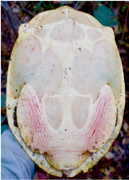
Figure 4. Cyclanorbis senegalensis with 11 plastral callosities found near the village of Sekoto in southeastern Senegal; 23.2 cm curved bony carapace length, 32.0 cm curved carapace length.

followed by the epiplastra, the gular, and lastly the entoplastron (Gramentz 2008). Additional callosities may be present lateral to the epiplastral or entoplastral callosities (e.g., BMNH 65.5.3.75; Gramentz 2008; McGovern, unpubl. data). This large number of plastral callosities is the most reliable character to distinguish this species from young individuals of C. elegans (2 to 4 callosities), which when fully grown also attain significantly larger sizes than C. senegalensis (Baker et al. 2015). Plastral callosities are textured with fine tubercles arranged in concentric circles.