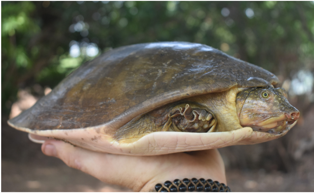
Figure 1. An adult female Cyclanorbis senegalensis caught in the Gambia River near the village of Soucoute, Senegal. The prenuchal in this individual is visible as a small swelling in the carapace just above the eye; 33.8 cm curved carapace length, 24.0 cm curved bony carapace length.

of the currently recognized species was being discussed (Webb 1975).