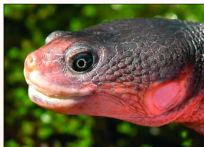
Chelodina gunaleni , adult female head.

Chelodina reimanni Philippen and Grossman, 1990, is the only other known species of subgeneric group A and the Chelodina novaeguineae complex found in