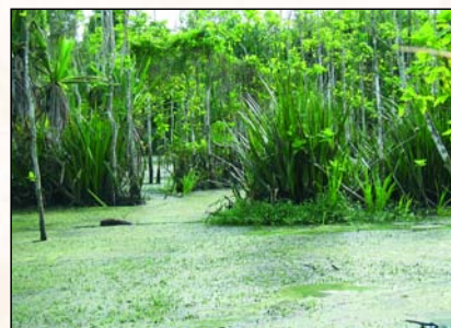
Chelodina gunaleni habitat — swamps in Uta River basin.