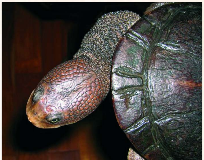
Chelodina gunaleni , head and neck.

Males are 30% smaller than females and have relatively thicker, longer tails. There are five horizontal scales on the dorsal surface of each foreleg. Soft parts are gray-black dorsally and creamy yellow ventrally.