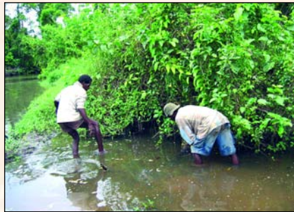
Locals collecting Chelodina gunaleni in Uta River swamp.

fifth/sixth marginal seam, whereas in most C. reimanni the pectoral/abdominal seam meets the marginals at or just anterior to the fifth/sixth marginal seam.