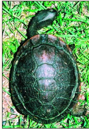
C. gunaleni paratype AMNH # R-160131 — carapace.