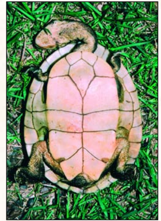
C. gunaleni paratype AMNH # R-160131 — plastron.

the lowlands of New Guinea. It is known only from the Merauke District, Papua, Indonesia, and thus is also biogeographically separate from the Chelodina population of the Mimika District (McCord and JOSEPH-OUNI, 2004).