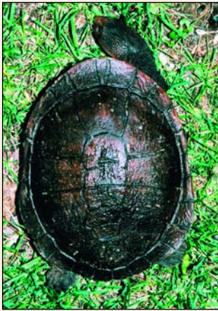
C. gunaleni holotype AMNH #R-160133 — carapace.