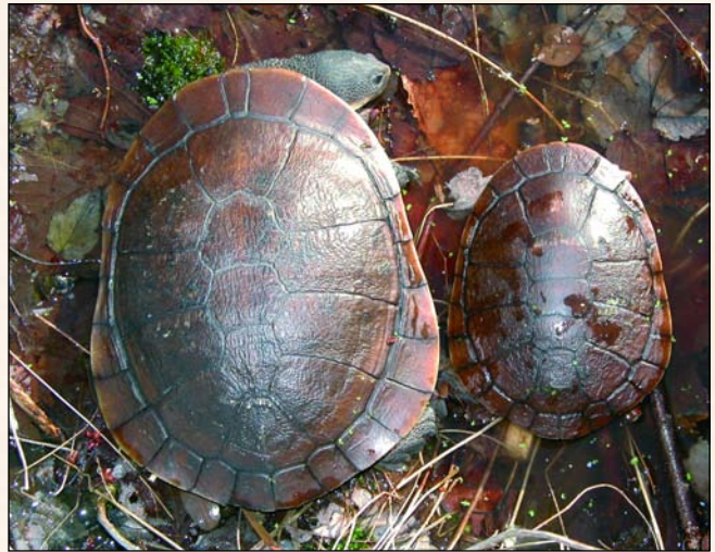
Adult female (left) and adult male (right) Chelodina gunaleni . Note sexual dimorphism.

Plastron. Relative to the plastral length, the plastral width is intermediate for subgeneric group A; relative to carapace length, plastral width is low for subgeneric group A. Inguinal width is 92% of axillary width; the width at the femoral/anal seam is 69% of the width at the humeral/pectoral seam. The plastral lobes narrow going both anteriorly and posteriorly; the anterior plastral lobe is wider than the posterior plastral lobe. The distance between the humeral seams of the intergular scute increases going posteriorly. The anterior edge of the plastron ends exactly at the caudal border of the ventral marginals and shows no skin when viewed from below. The gular/intergular seams are longer than the humeral/intergular seams. The plastral seam formula is IG \text{ scute length} > IAN > IAb > IP(70\%) > IF > IG . There is an intermediate plastral notch. Bridge length relative to carapace length is high for subgeneric group A. Axillary and inguinal scutes are absent. The ventral surface of the sixth marginal scute of the carapace is 50–55% of the width of the ventral seventh marginal. The ventral seventh marginal aligns with (helps form the border of) the anterior inguinal notch, which usually brings the pectoral/abdominal seam of the plastron to meet the marginals of the carapace at, or just caudal to the fifth/sixth marginal seam. The plastron is equally flat in both sexes. Plastral coloration is a uniform pale yellow with no dark markings present.