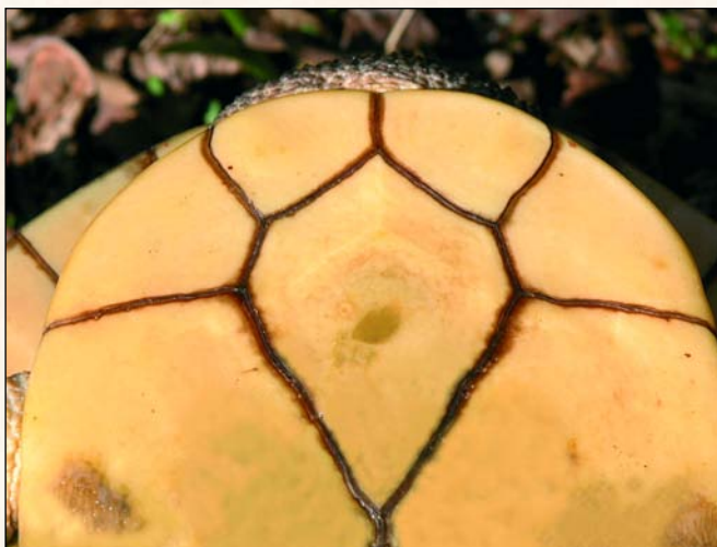
Photographic identification key for Chelodina gunaleni : step 1 – note M1 is larger than M2; step 2 – note V5 is wider than long; step 3 – note the humeral/intergular scute seams are shorter than the gular/intergular scute seams; step 4 – note the gular/humeral scute seams are equal to or nearly equal to the gular/intergular scute seams, forming a “W” composed of four equal parts.

female C. gunaleni . The interorbital width is greater (relative to head width) in C. gunaleni than in C. novaeguineae . Although barbels are usually absent in both forms, when present they are thin in C. gunaleni , tubercle-like in C. novaeguineae . The snout in young adult C. gunaleni is more steeply sloped and blunter than the less sloped and more conical snout of C. novaeguineae . The dorsal head color of wild C. gunaleni is distinctly orange-brown compared to the brown dorsal head color of C. novaeguineae .