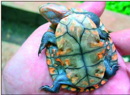
Plastral view of a juvenile Chelodina gunaleni .