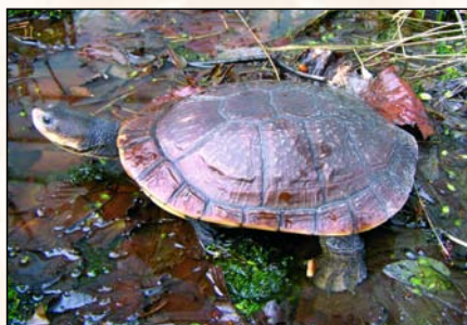
Chelodina gunaleni , dorsal view.