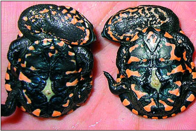
Plastral view of hatchling Chelodina gunaleni .