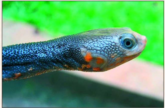
Head of juvenile Chelodina gunaleni.

C. novaeguineae the pectoral/abdominal seam meets the marginals at or just anterior to the fifth/sixth marginal seam.