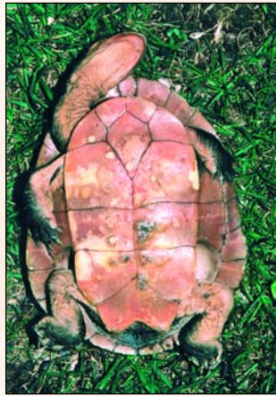
C. gunaleni holotype AMNH #R-160133 — plastron.