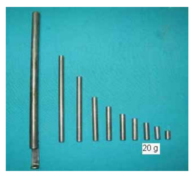
Fig. 1. The trauma set prepared for the study: a 30 cm metal tube with a spoon mechanism at its lower tip and cylinder-shaped metal weights of 100, 75, 50, 40, 30, 25, 20, 15, 10 g, respectively. (Color figure can be viewed in the online issue, which is available at www.tjtes.org)

Because basal NAG levels before the procedure would be measured, no separate control group was formed. An experimental procedure was carried out in aseptic conditions under general anesthesia of 50 mg/kg intramuscular ketamine hydrochloride (Ketalar<sup>®</sup>,