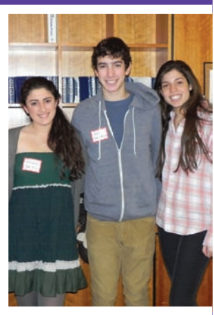
The Stern family, two generations of JCF donors.