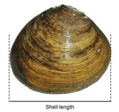
Figure 1: The standard procedure for measuring the length of bivalves