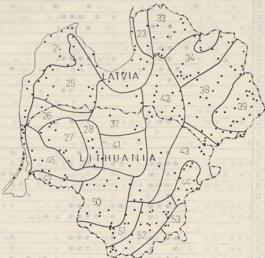
Fig. 1. Geobotanical regions of Latvia and Lithuania (after Соцава et al., 1960): 22 — dune pine forests and raised peat bogs of Riga's environs; 23 — hardwood-spruce, spruce and mossy pine forests of West Vidzeme; 24 — lowland dry pine forests with dunes and "grinis" of Kurzeme; 25 — upland spruce and hardwood-spruce forests of Kurzeme; 26 — lowland spruce and spruce-pine forests of West Zemaite; 27 — upland spruce and spruce-pine forests, swampy meadows and fens of Zemaite; 28 — lowland hardwood-spruce, spruce forests and raised peat bogs of East Zemaite; 29 — upland spruce and lichen-pine forests of North Vidzeme; 30 — upland spruce forests of Central Vidzeme; 31 — hardwood and hardwood-spruce forests of basins of Lielupe and Musa Rivers; 32 — East Latvian lowland swampy pine forests, locally with spruce forests; 33 — upland spruce forests and mossy pine groves of East Latvia; 34 — hardwood-spruce forests of Central Lithuania; 35 — lowland hardwood-spruce, hardwood-pine, spruce and pine forests of Middle Baltic region; 36 — upland hardwood-spruce forests and swampy meadows of Aukštaitė; 37 — mossy pine forests of Zemaite; 38 — lowland spruce, spruce-pine and hardwood-spruce forests of Southwest Zemaite; 39 — flood-plain meadows, swampy meadows, bogs and alder forests of the basin of Lower Nemunas; 40 — hardwood-spruce and hardwood forests of the Middle Nemunas basin; 41 — upland hardwood-spruce and hardwood forests of Džukaitė; 42 — sandy lichen-pine and mossy pine forests on the sandy areas of the basin of Merkinė River.

Tettigometra atrata Fb., 1872. La. only old records of Flor (cf. Vilbaste, 1958). Li: Nemenčine, dry meadow on sandy soil, on trees, 14. VIII 1968, 1 ♀ (A. V.).