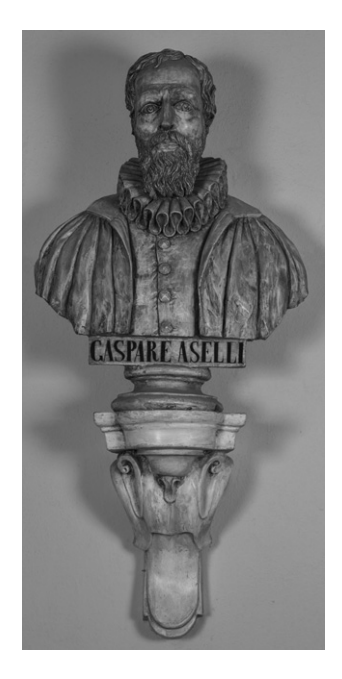
Fig. 2 Plaster bust of Gaspare Aselli. Gallery of Busts of the Museum of Human Anatomy 'Filippo Civinini' of the University of Pisa.

Once observed in dogs, these new vessels had to be investigated in humans, as well. In this respect, the French scientist Pierre Gassendi (1599–1655) suggested such a research to Fabrice de Peiresc (1580–1637). As a matter of fact, in 1628 de Peiresc described lacteals also in the body of a highly fed malefactor 2 h after his execution. On the other hand, Gassendi conceived that chyle was transported by choledoch duct. So, besides portal vein, also choledoch duct