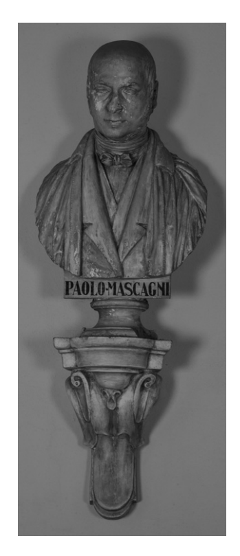
Fig. 3 Plaster bust of Paolo Mascagni. Mascagni's Gallery of the Museum of Human Anatomy 'Filippo Civinini' of the University of Pisa.

In the same year 1787, Paolo Assalini published an essay on lymphatics, where the author attempted to demonstrate the existence of air-conducting vessels (De Renzi, 1848, p. 275). In that time Mascagni sent several anatomical specimens (by drying or alcohol process of preservation) illustrating lymphatics to the Museum 'La Specola' in Florence