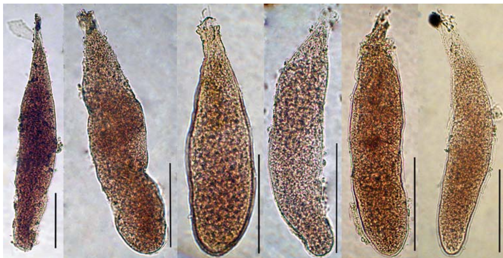
Fig. 3. Other investigated specimens of Vellaria solenta . Scale bars: 100 \mu\text{m} .

Рис. 3. Другие исследованные экземпляры Vellaria solenta . Масштаб: 100 мкм.