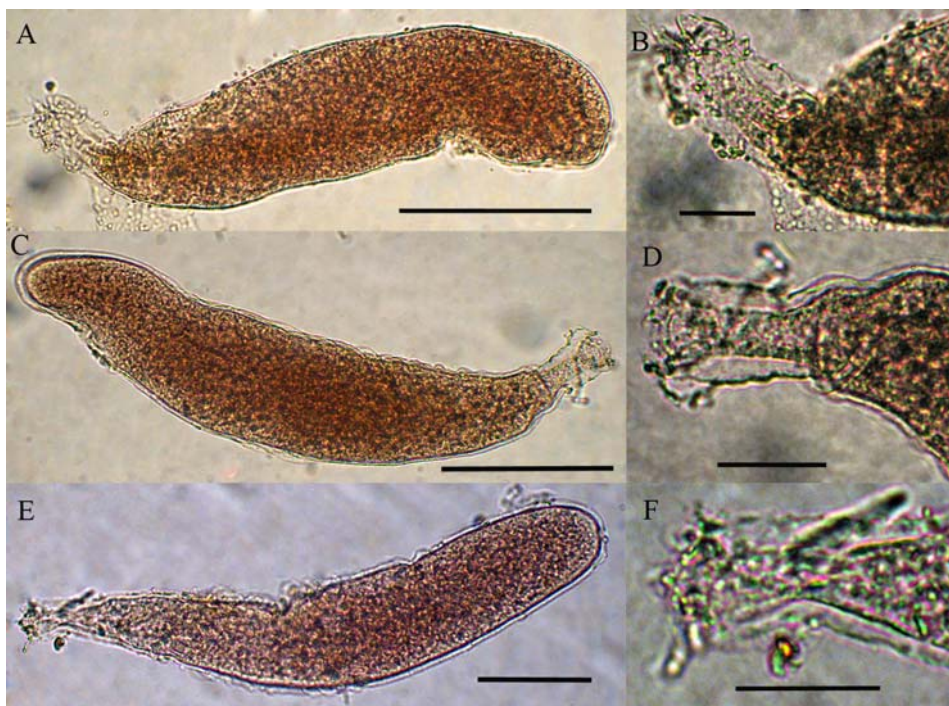
Fig. 2. Vellaria solenta , the paratypes: A, C, E — general view of the paratypes 1, 2 and 3; B, D and F — apertural part of paratypes 1, 2 and 3. Scale bars: A, C — 100 \mu\text{m} ; E — 50 \mu\text{m} ; B, D, F — 20 \mu\text{m} .