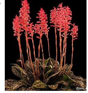
albidomaculatum Mello Spirit

Orchidwiz doesn't give a description or information but it contains judges descriptions from 4 American Orchid Society cultural awards and there is a picture of one awarded. The descriptions say that the leaves are deep green spotted or blotched with light green or one case white. The sepals are variously "red", "light red", or "coral" and in one case the dorsal had a white margin. The petals and lip are white but may have a pink stripe or flush.