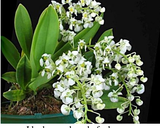
Z. grandiflora (close up)

Until recently, the genus Zygostates was reported to comprise only 7 species, all from Brazil. However, the genus is one of those groups that has been in debate for some time. Species have been moved back and forth between Zygostates and a closely related genus called Dipteranthus, and also occasionally with Ornithocephalus.