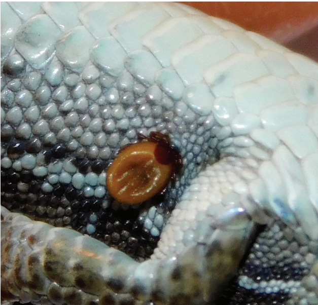
Figure 1. Ixodid tick attached to the host.