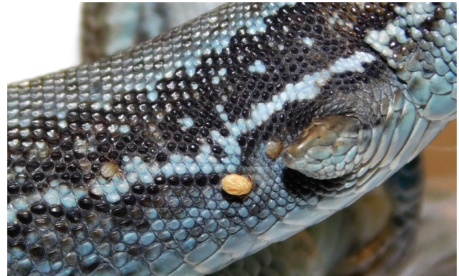
Figure 2. Three ixodid ticks attached to Darevskia praticola .

Other hosts: reptiles and birds are hosts for immature ticks, while large mammals, including cattle and sheep, are