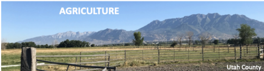
Examples of recent projects