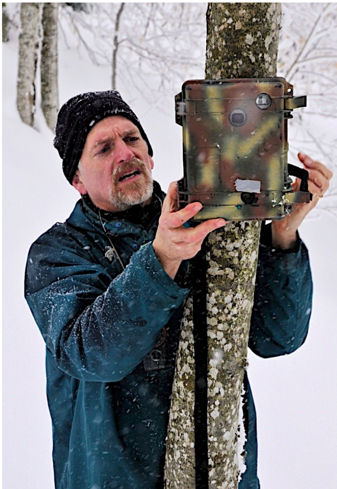
Setting up a critter cam in Jackson Valley

One such ecological keystone is Jackson Valley, a privately owned forest parcel in Jay, Vermont abutting the Canadian border. Its 936 acres encompass spruce fir uplands and a north-facing lowland bowl cloaked with Northern hardwoods. In 2008, Jackson Valley was identified by Two Countries One Forest ( www.2C1Forest.org ), an international alliance of fifty U.S. and Canadian conservation organizations, as an essential "missing link" the 1,158-square miles cross-boundary wildlife corridor connecting Vermont's Green Mountains with Quebec's Sutton Range.