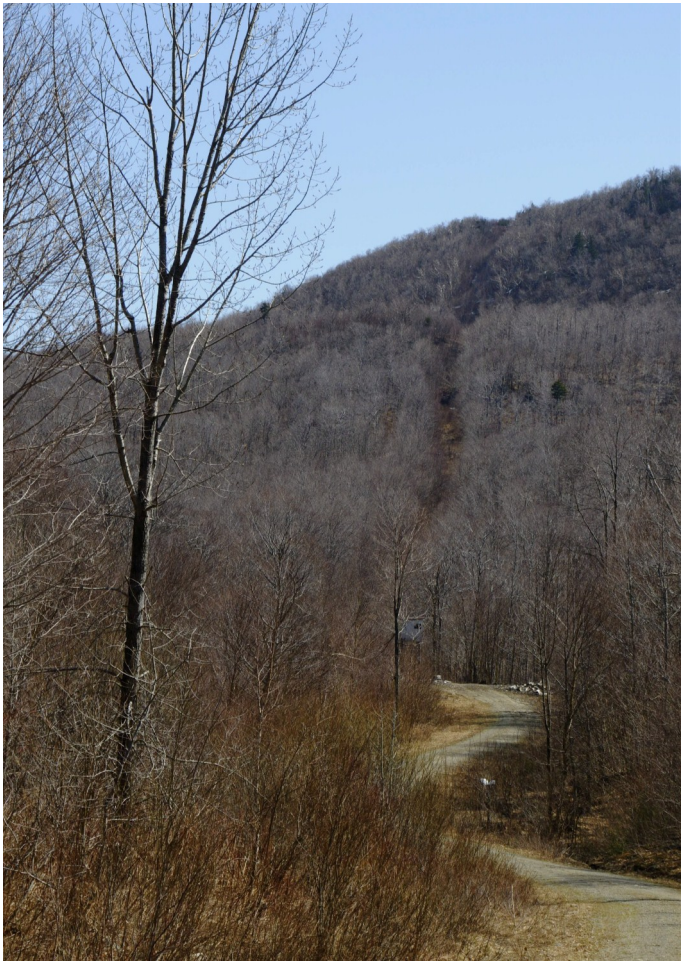
The International Border between the USA and Canada forms the northern boundary of Jackson Valley