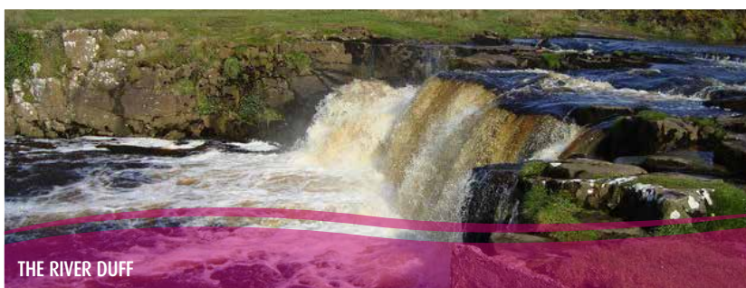
THE RIVER DUFF

Both the River Drowes and River Duff are important salmon fisheries.