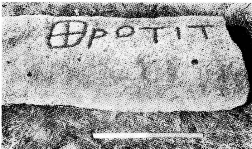
Beacon Hill Cemetery: the Potiti stone.

The enclosure is of a type sparsely represented in the British Isles—there are some in county Kerry, for example—and in my view is a derivative, perhaps not before the late 6th century, from the cella memoriae , the little open yard surrounding martyrial tombs in early Mediterranean and north African Christianity. There seems no reason why some, at least, of the Beacon Hill graves should not be contemporary with the OPTIMI and RESTEUTA stones and go back to the late 5th century; the cella is of course more of the period of the later stones, those with TIGERNI and POTIT (I). If, as seems likely, the cemetery was in more or less continuous use from sub-Roman times until after the Middle Ages, and indeed later, one might expect by the 8th or 9th century a small stone chapel, not necessarily below the medieval chapel. The uncertainty of the precise dedication of the latter (St. Helen or Elen—perhaps originally, the mysterious Elidius or 'Ilid' of St. Helen's, Scilly, and St. Helen's, Cape Cornwall), the apparent presence of cist-graves in a second cemetery on Lundy down by the farm-yard (the so-called 'Giants's Graves'), and the possibility that the cemetery