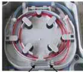
Splice protective sleeves Splice secure clips