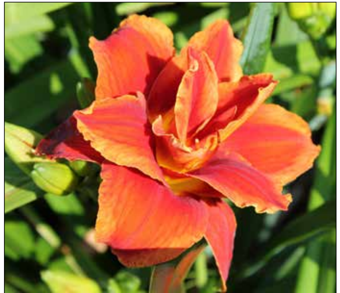
H. 'Fires of Fuji' (Hudson 1990)