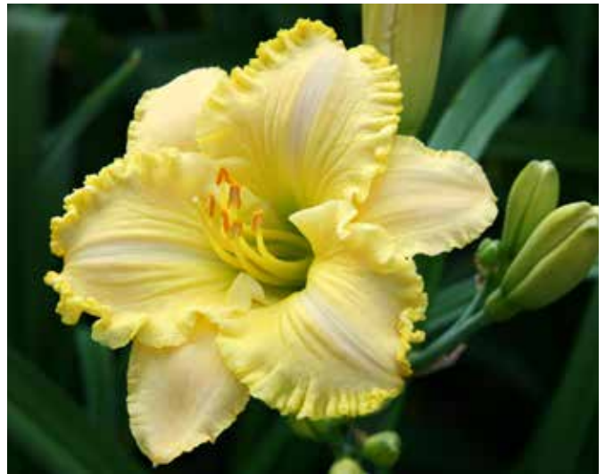
H. 'Betty Warren Woods' (R. W. Munson, Jr. 1987)

a 20", 5" cream self with a chartreuse throat, won an HM in 1997. 'Malaysian Monarch' (1986), a 24", 6" burgundy purple self with a cream white throat, won an HM in 1990 and an AM in 1993. 'Respighi' (1986), a 20", 6" wine black with a chalky wine eyezone and a yellow green throat, won an HM in 1993 and an AM in 1996. Another of his most famous registrations, 'Betty Warren Woods' (1987), a 24", 4.5" cream yellow self with a green throat, won an HM in 1997 and an AM in 2000. 'Court Magician' (1987), a 25", 5" purple with