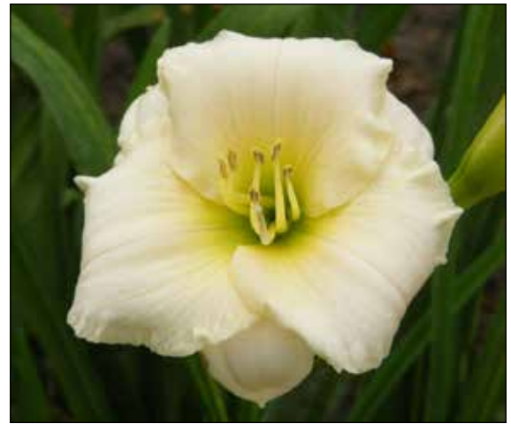
H. 'Iditarod' (Weston 1989)