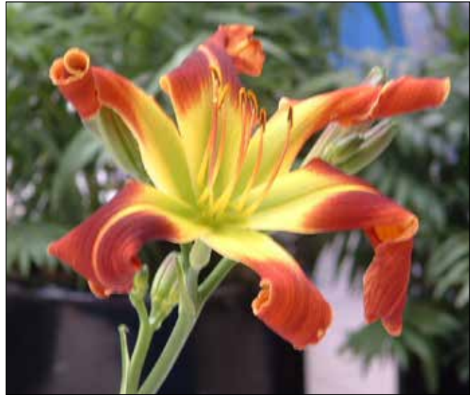
H. 'Satan's Curls' (Crandall 1987)