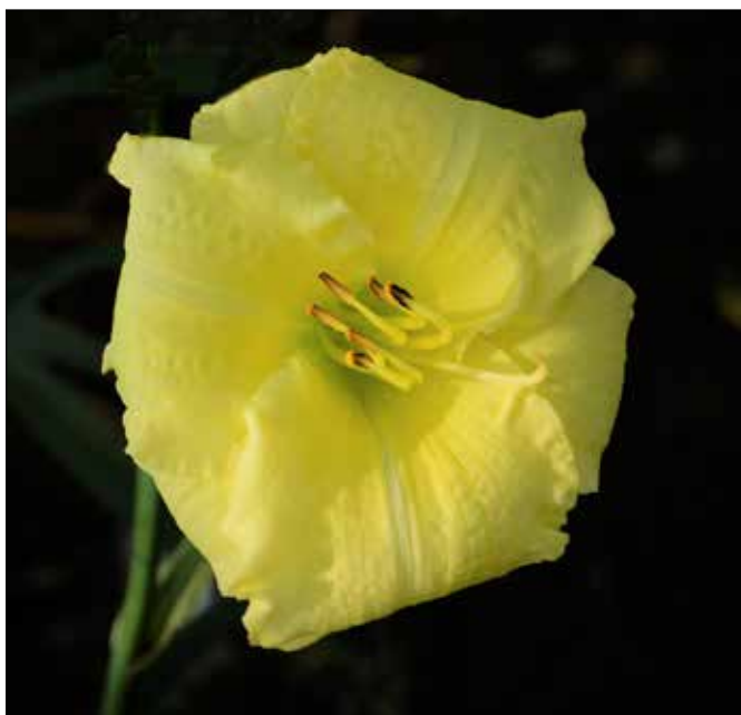
H. 'Marble Faun' (Millikan 1983)

lime green throat, won an HM in 1990. Another tetraploid, 'Old Tangiers' (1985), a 28", 5" tangerine with red eyezone and chartreuse throat, received an HM in 1993. Among other diploids, 'Snowed In' (1985), a 25", 5.5" white with light green overlay and a green throat, won an HM in 1991; 'Green Eyed Lady' (1985), a 24", 4.5" yellow green self with a green throat, won an HM in 1991; 'Video' (1985), a 20", 5" lemon yellow self with a green throat, won an HM in 1992; 'Carlotta' (1986), a 25", 4.5" blend of red and cherry pink with cream midribs and a green throat, won an HM in 1993; 'Chantelle' (1988), a 24", 4.5" bright pink with lighter midribs and green throat, won an HM in 1993; and 'Camay' (1989), a 20", 4.5" rich medium pink self with a very green throat, won an HM in 1995. Millikan registered several daylilies in conjunction with