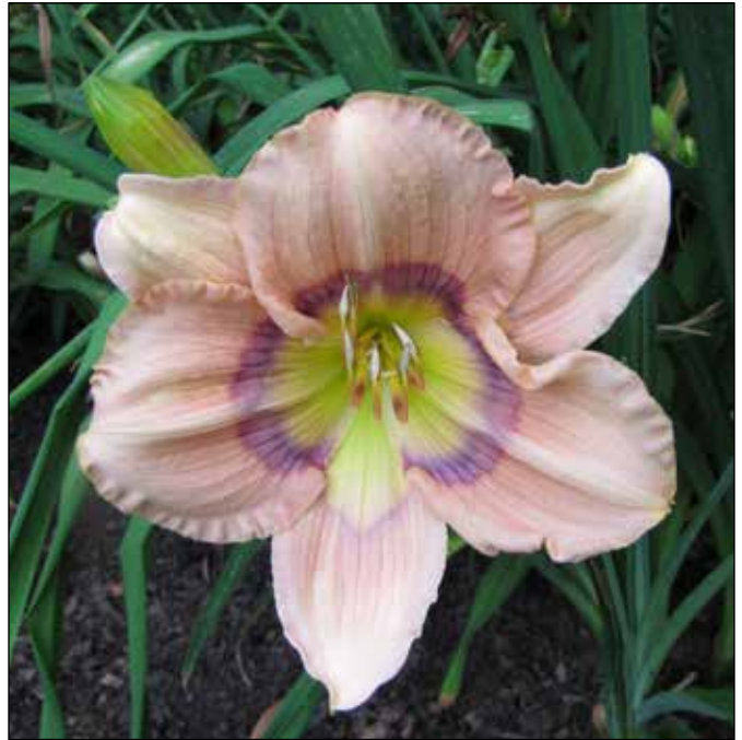
H. 'Priscilla's Rainbow' (Spalding-Guillory 1985)

1984), a 14", 6" rose blend with a green throat, won an HM in 1990 and an AM in 1993. 'Edith Vaughan' (1985), a 22", 5.5" mauve with a deeper eyezone and a green throat, won an HM in 1989. 'Elsie Spalding' (1985), a 14", 6" ivory blushed pink with a light pink halo and a green throat, won an HM in 1987 and an AM in 1990. Also co-registered with her daughter-in-law, 'Priscilla's Rainbow' (Spalding-Guillory 1985), a 22", 6.25" pink lavender with a rainbow halo and green throat,