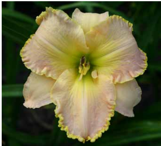
H. 'Ida's Magic' (Ida Munson 1988)

the Stout Silver Medal. 'Chinese Temple Flower' (1980), a 24", 5" lilac with purple eyezone and green throat, won an HM in 1982. 'Chinese Cloisonne' (1984), a 26", 5" peach ivory with a pale slate eyezone and green gold throat, won an HM in 1985. And 'Ida's Magic' (1988), a 28", 6" amber peach edged gold with a green gold throat, won an HM in 1986, an AM in 1999, and the Stout Medal in 2001.