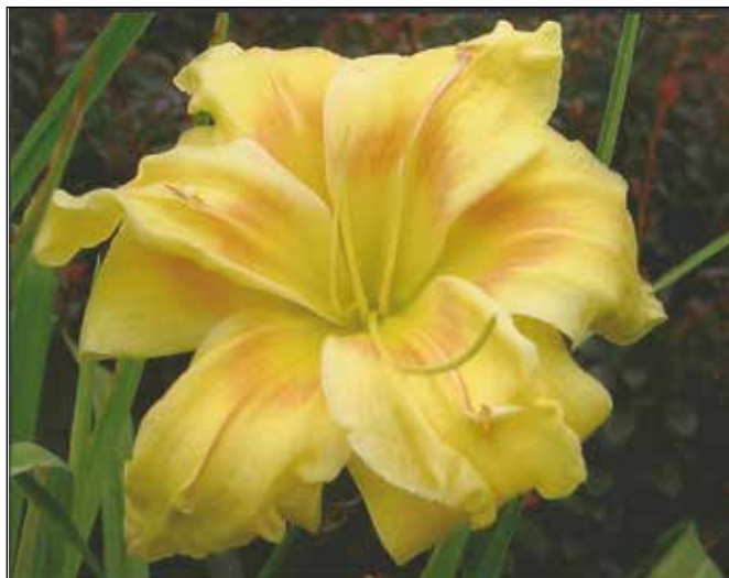
H. 'Double Pop Art' (Betty Brown 1981)

During the historical period of the Seventies and Eighties, Betty B. Brown of Orange, Texas, had great success in hybridizing diploid doubles. H. 'Double Overtime' (1981), a 19", 6" peach tan with a wine eyezone and green throat, won an HM in 1986. 'Whopper Stopper' (1981), a 24", 6" rose with a wine eyezone and chartreuse throat, won an HM in 1988. 'Double Tour Time' (1981), a 23", 6" peach self, won an HM in 1992. However, 'Double Pop Art' (1981), a 22", 5" double yellow with a light wine eyezone and a yellow throat, remains overlooked, as does 'Double Purple Thrill' (1981), a 15", 5.5" double deep purple self with a light gold throat.