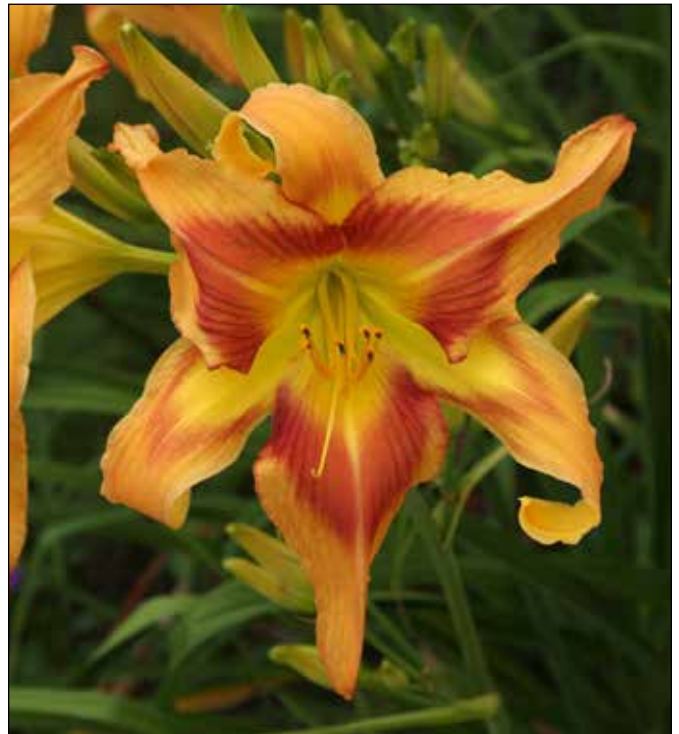
H. 'Parade of Peacocks' (Oakes 1990)