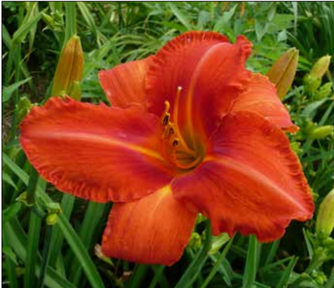
H. 'Alabama Jubilee' (Webster 1988)

24", 5" bright red self with a green throat, won an HM in 1992. 'Roll Tide' (1987), a 26", 5.5" bright red self with a small green throat, won an HM in 1996. 'Alabama Jubilee' (1988), a 30", 7" fluorescent red orange with a brighter red halo, won an HM in 1993. However, 'Centerpiece' (1988), a 26", 6.5" vivid orange yellow with a deep purple eyezone, and 'Risen Star' (1988), a 26", 10" soft yellow unusual form crispate with a greenish yellow throat, remain overlooked, as does 'Exotic Dancer' (1989), a 28", 7.5" pink unusual form crispate with a green throat. 'Red Suspenders' (1990), a 32", 11" bright red unusual form crispate with a green chartreuse throat, won an HM in 1995 and came the closest of any of these to winning an AM, missing by one vote.