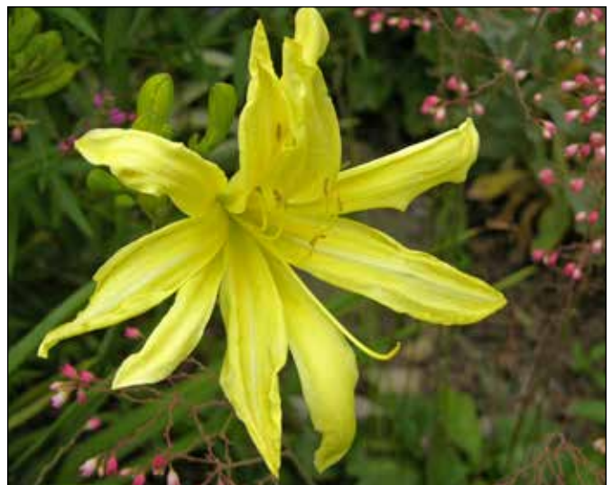
H. 'Four Star' (Kropf-Tankesley-Clarke 1988)