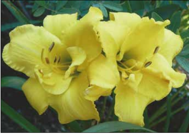
H. 'Decatur Double Delight' (Davidson 1983)