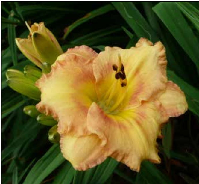
H. 'Inca Toy' (Soules 1990)