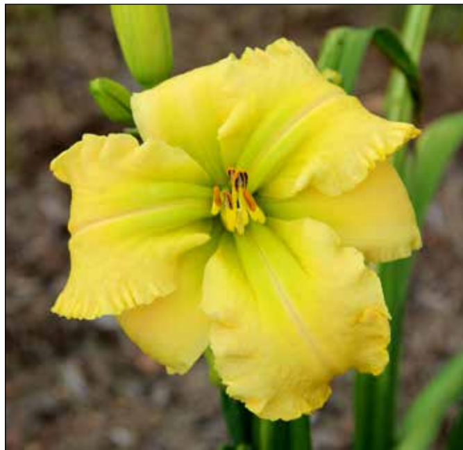
H. ‘ Anastasia ’ (Salter 1985)

red eyezone and a green throat, also won an HM in 1992, as did ‘ Spanish Glow ’ (1988), a 26", 5" warm peach self with a green throat. ‘ Magic Filigree ’ (1988), a 24", 6" lavender with a light amber halo and a yellow green throat, won an HM in 1993. ‘ Wyntoon ’ (1988), a 24", 6" lavender self with a green throat, won an HM in 1993, as did ‘ Well of Souls ’ (1988), a 26", 6" peach pink and lavender blend with a black purple eyezone above a green throat. ‘ Light of Heaven ’ (1988), a 24", 6" pale cream self with a green throat, won an AM in 1995. ‘ My Darling Clementine ’ (1988), a 21", 4.5" yellow self with a