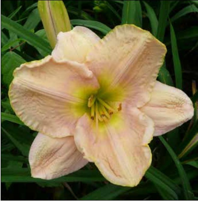
H. 'Graceland' (Morss 1987)