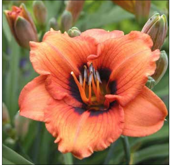
H. 'Desert Princess' (Oakes 1987)

period. Today it is one of the largest nurseries in the country. Most of Oakes' 20 registrations were during the 1980s. H. 'Red Volunteer' (1984), a 30", 7" clear candle red tetraploid with a gold yellow throat, won an HM in 1989, an AM in 1994, and the Lenington All-American Award in 2004. 'Desert Princess' (1987), a 16", 3.25" dark orange diploid with a burgundy eyezone and a green throat, remains overlooked. 'Jen Melon' (1987), a 26", 5" melon cream diploid with a chartreuse