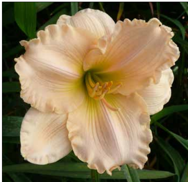
H. 'Southern Love' (Sikes 1985)