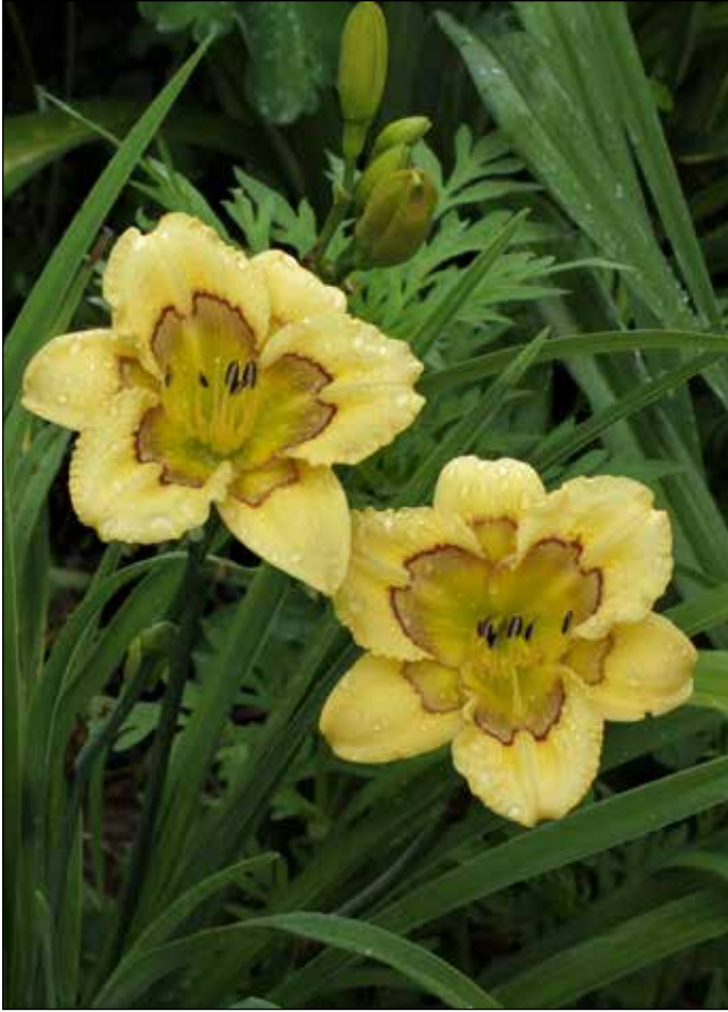
H. 'Patchwork Puzzle' (E. H. Salter 1990)