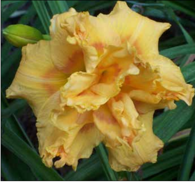
H. 'Violet Osborne' (Kirchhoff 1987)