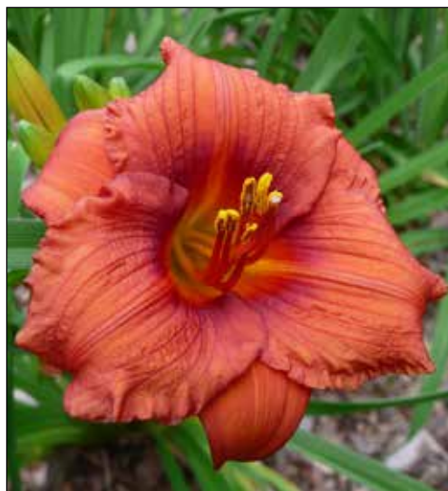
H. 'Little Rich' (Croker 1987)