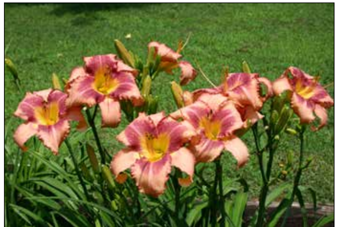
H. 'Designer Jeans' (Sikes 1983)

deep orange red eyezone and a green throat, which received an HM in 1993; 'Restless Heart' (1985), a 27", 6" golden orange blend with a red eyezone and green throat, which won an HM in 1996; 'Heartfelt' (1987), a 26", 6" red orange with a deep orange red halo and a green yellow throat, which won an HM in 1993; 'Designer Rhythm' (1987), a 25", 6" light mauve blend with deep lavender petal edges and a deep lavender eyezone above a green yellow throat, which received an HM in 1994; and 'Royal Dancer' (1988), a 25", 5.5" brick red with a deeper halo and a green yellow throat, which won an HM in 1993. Her 'Designer Image' (1987), a 20" 5.5" lemon beige with a large deep lavender eyezone and petal edges above a green yellow throat, also deserves notice. It won an HM in 1999. Among the most famous of her tetraploids was 'Designer Jeans' (1983), a 34", 6.5" lavender with dark lavender edges and eyezone and a yellow green throat. It won an