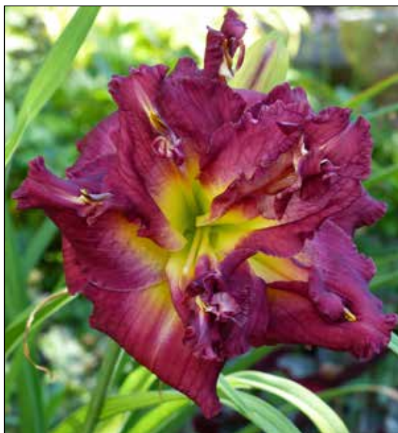
H. 'Desdemona' (Kirchhoff 1984)