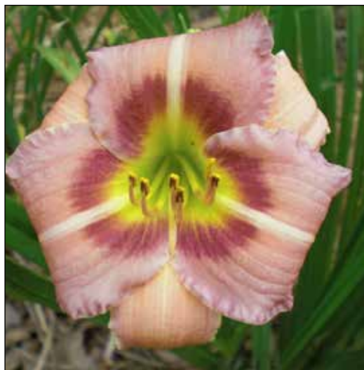
H. 'Candide' (Crochet 1986)