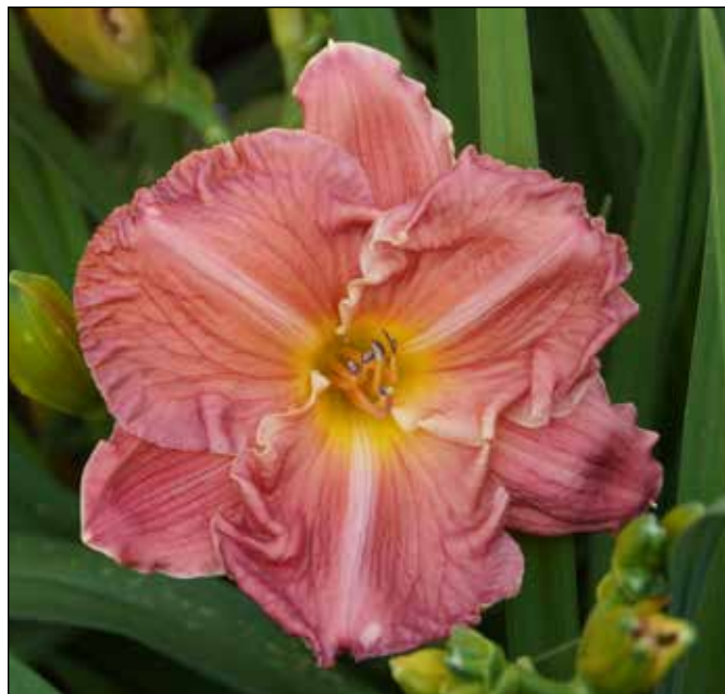
H. 'Mae West' (Weston 1990)

2.5" cream diploid with pink overlay and a slight pink halo above a green throat, won an HM in 1993. 'Artful Dodger' (1988), a 28", 3.75" tetraploid double lavender blend with a yellow green throat, won an HM in 1998. 'Iditarod' (1989), a 28", 3" diploid near white self with a green throat, won an HM in 1995. 'Borders on Pink' (1990), a 17", 5" fuchsia pink diploid with pale edges and a bright green throat, won an HM in 1994. 'House of Orange' (1990), a 27", 5.25" dark bitter-sweet orange diploid with a dark green throat, also won an