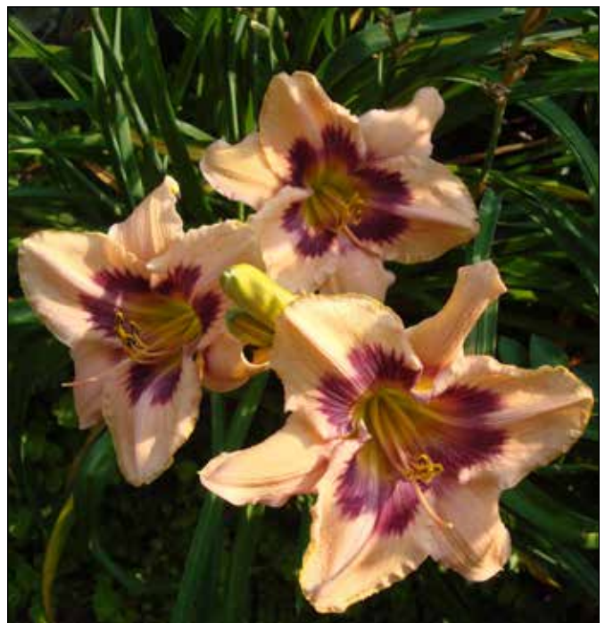
H. 'Paper Butterfly' (Morss 1983)

Rain ' (1987), a 26", 6" orchid pink blend with a green yellow throat, received an HM in 1991. ' Etruscan Tomb ' (1988), a 20", 5" purple violet blend with a dark purple eyezone and chartreuse throat, won an HM in 1994. ' Tuxedo Moon ' (1989), a 25", 6" burgundy purple with a light violet eyezone and a green chartreuse throat, also won an HM in 1994. ' Nosferatu ' (1990), a 26", 6" purple self with a green chartreuse throat, won an HM in 1997 and an AM in 2000. His tetraploid,