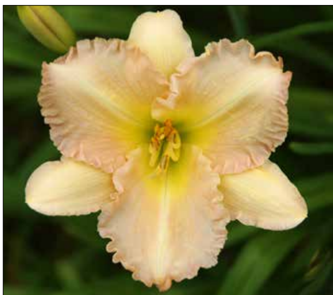
H. 'Iced Champagne' (Steinborn 1986)

6" white tetraploid brushed lavender pink with a light green throat, won an HM in 1991. 'Iced Champagne' (1986), a 28", 5" champagne pink blend diploid with a yellow green throat, won an HM in 1999. She is credited with a total of 39 cultivars.