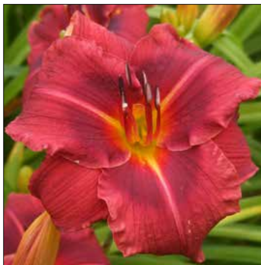
H. 'Little Red Warbler' (Crochet 1985)