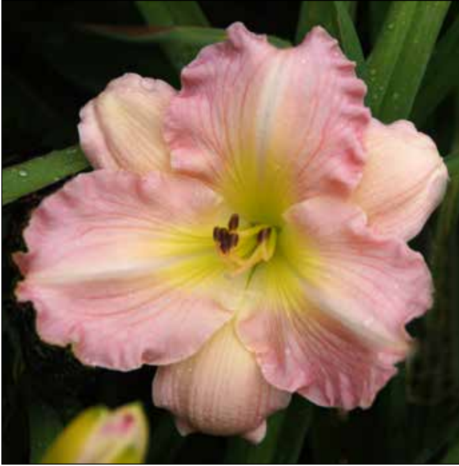
H. 'Pink Flirt' (DeKerlegand 1987)

won an HM in 1992 and an AM in 1995. One diploid registered in 1991, just beyond the historical period, was recently accorded an HM in 2018.