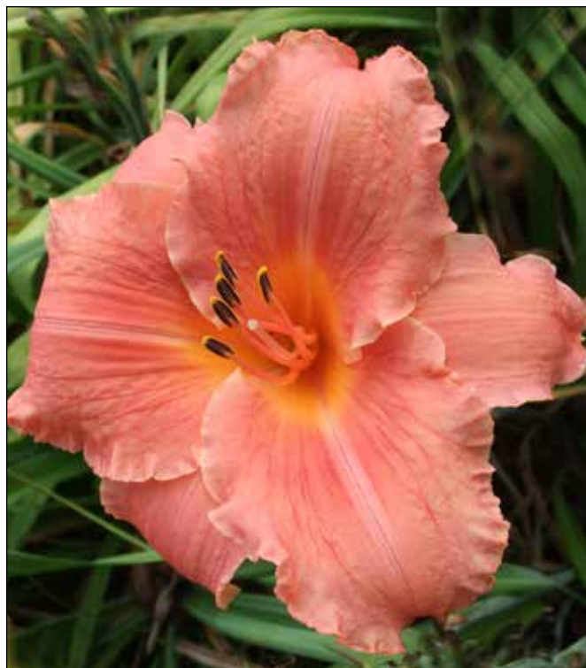
H. 'Watermelon Moon' (Stamile 1987)