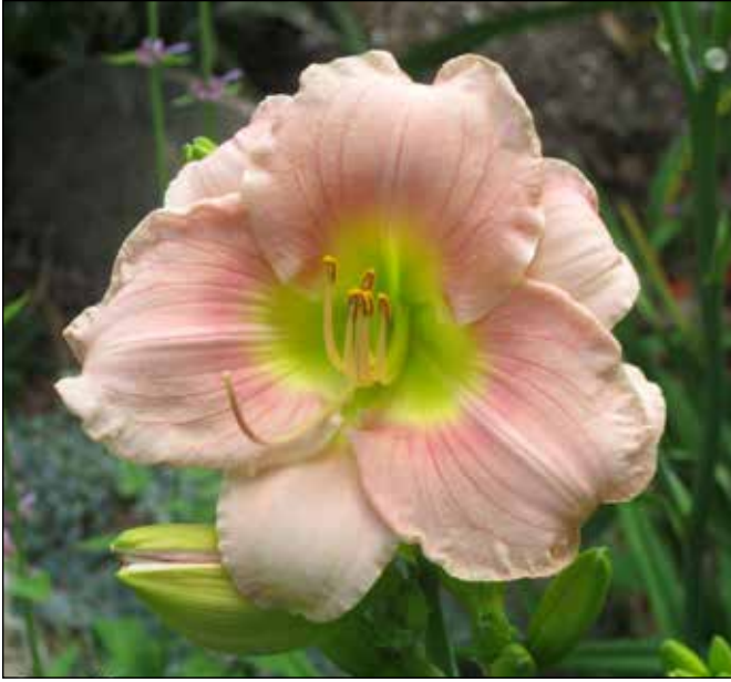
H. 'Ah Youth' (Simpson 1987)

1992. 'Aquarelle' (1987), a 24", 5.5" peach pink polychrome with lavender midribs and a lemon green halo above a green throat, won an HM in 1994. 'Speak of Angels' (1987), a 26", 6" flesh pink with a soft pink lavender halo and a very large chartreuse green throat, won an HM in 1994.