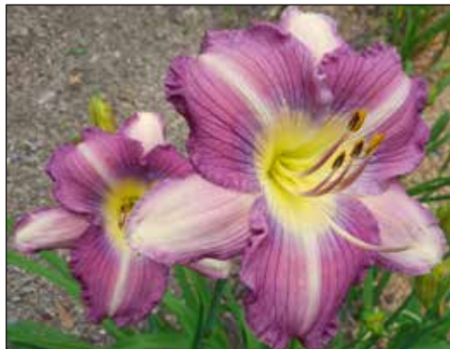
H. 'Ra Hansen' (Talbot 1986)