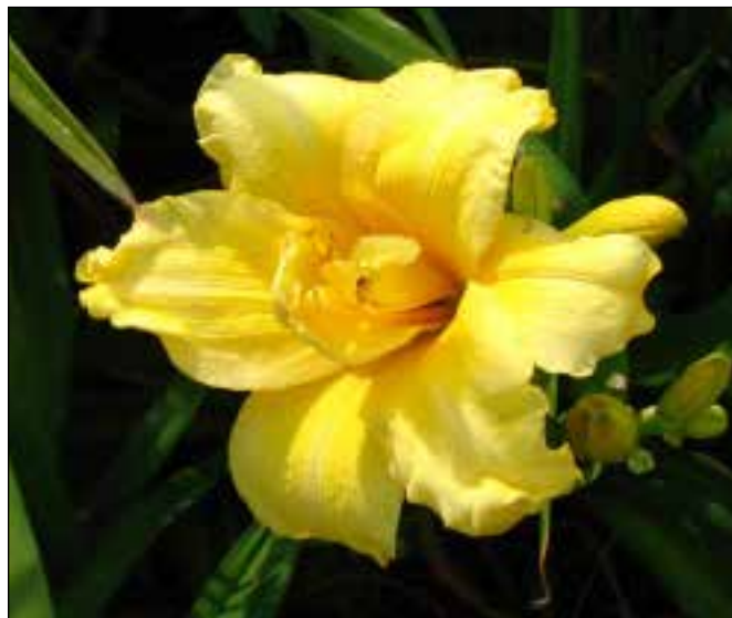
H. 'Butter Dish' (Kropf 1988)