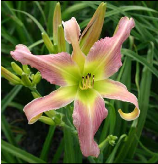
H. 'Exotic Dancer' (Webster 1989)