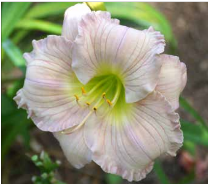
H. 'Edith Vaughan' (Spalding 1985)

1984), a 14", 6" rose blend with a green throat, won an HM in 1990 and an AM in 1993. 'Edith Vaughan' (1985), a 22", 5.5" mauve with a deeper eyezone and a green throat, won an HM in 1989. 'Elsie Spalding' (1985), a 14", 6" ivory blushed pink with a light pink halo and a green throat, won an HM in 1987 and an AM in 1990. Also co-registered with her daughter-in-law, 'Priscilla's Rainbow' (Spalding-Guillory 1985), a 22", 6.25" pink lavender with a rainbow halo and green throat,