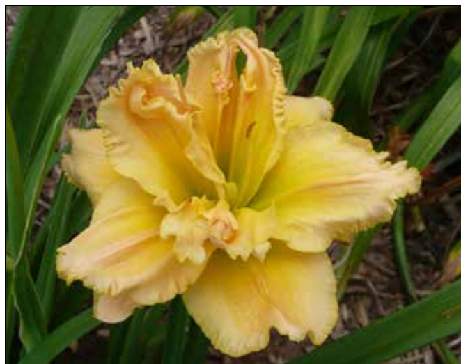
H. 'Fanciful Finery' (Kirchhoff 1984)