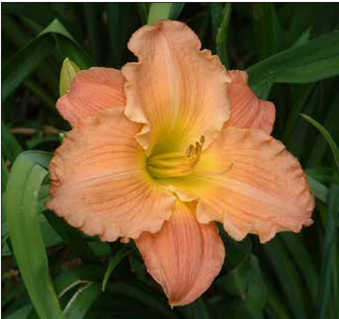
H. 'Cinnamon Bear' (Tarrant 1988)