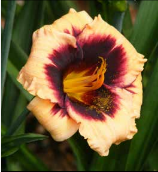
H. 'Eye of Newt' (E. H. Salter 1988)