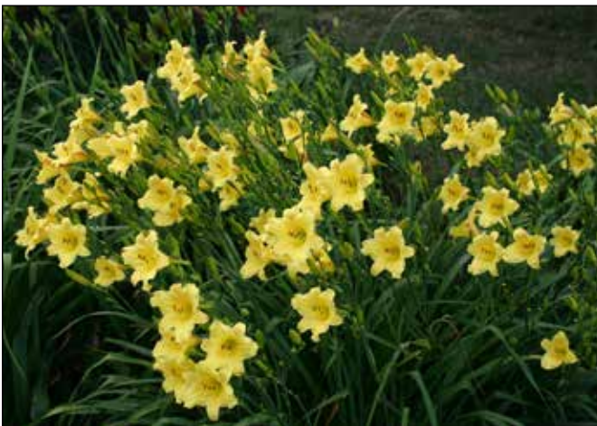
H. 'Toy Trumpets' (Sobek 1984)