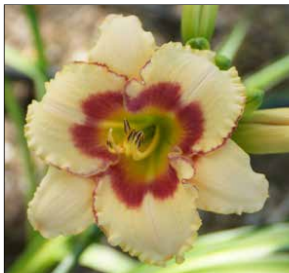
H. 'Vanilla Candy' (Stamile 1990)