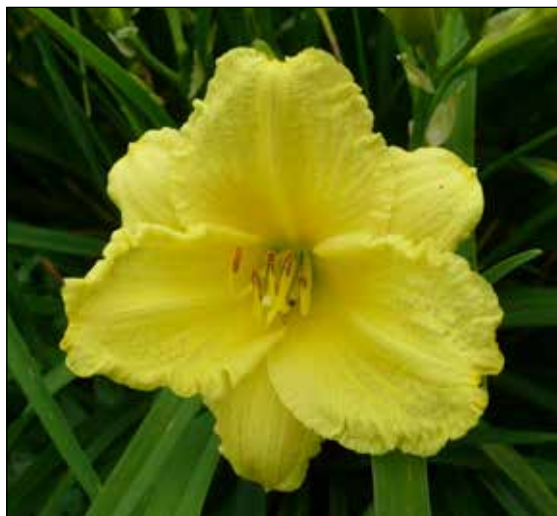
H. 'Happy Returns' (Apps 1986)

1992. Several other Apps diploids from the historical period have won HMs. Among these are 'Preppy' (1985), a 24", 4" pink self with a green throat, which won an HM in 1990; 'Little Squiz' (1985), a 26", 2.5" dark red with a dark red eyezone and green throat, which received an HM in 1991; 'Lavender Patina' (1987), a 28", 4.75" lavender with a deeper lavender eyezone and yellow green throat, which won an HM in 1991; 'Bone China' (1987), a 30", 4" near white with a green throat, which won an HM in 1993; 'Queen Anne's Lace' (1989), a 23", 4.5" near white with a green throat, which received an HM in 1997; 'Royal Occasion' (1990), a 26", 4.37" black violet with a black eyezone and a bright green throat, which received an HM in 1994; 'Nouveau Riche' (1990), a 26", 4.37" bright red with a ruby red eyezone and yellow green throat, which won an HM in 1995; and 'Jungle Beauty' (1990), a 30", 5.5" black red with a very faint black eyezone above a yellow green throat, which won an HM in 1996. Three of his diploids using the prefix "Woodside" in honor of his nursery also received HMs: 'Woodside Ruby' (1989), a 34", 4.5" ruby red self with