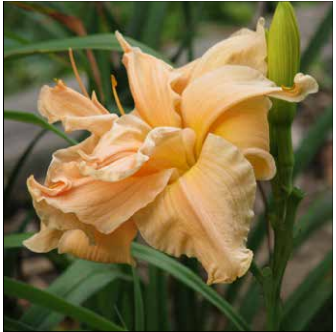
H. 'Scatterbrain' (Joiner 1988)