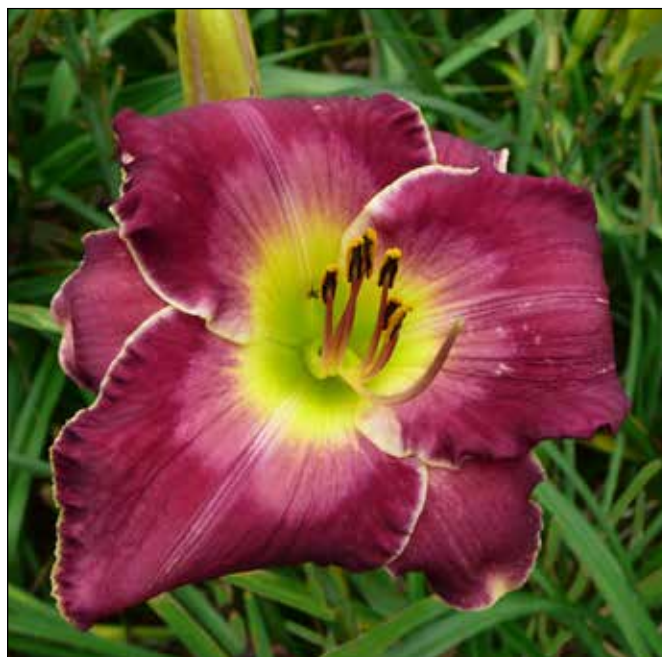
H. 'Violet Shadows' (Lachman 1988)