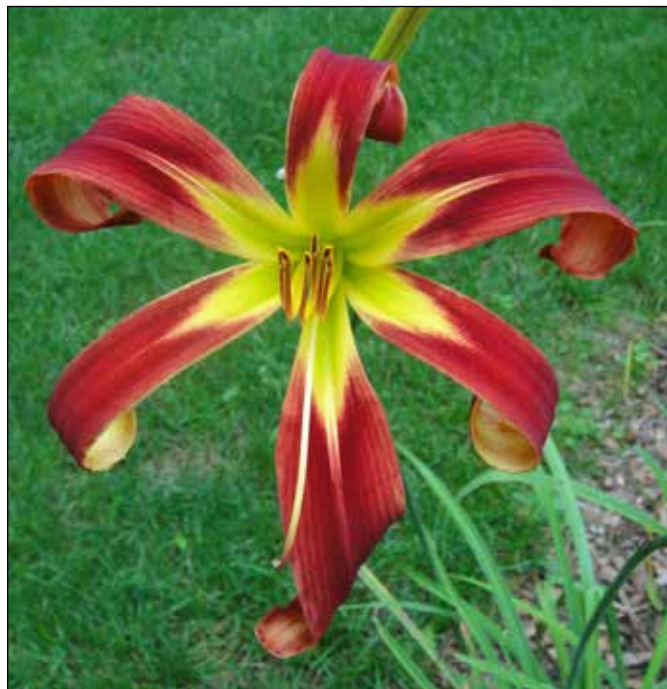
H. 'Red Rain' (Whitacre 1988)

red eyezone above a yellow green throat with a spider ratio of 6.00:1, won an HM in 1997 and is perhaps her most famous daylily. 'Tylwyth Teg' (1988), a 40", 8" pale cream rainbow polychrome with lavender midribs and a pale gold throat and a spider ratio of 5.60:1, however, remains overlooked for awards, as does 'Crazy Pierre' (1990), a 24", 7" pale orange peach with a bright red eyezone above a pale yellow throat and a spider ratio of 5.00:1. Jim Whitacre, Rosemary's husband, registered 'Watermelon Man' (1990), a 17", 4.5" black red with a chrome yellow throat and a spider ratio of 5.00, but it