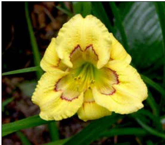
H. 'Patchwork Puzzle' (E.H. Salter 1990)