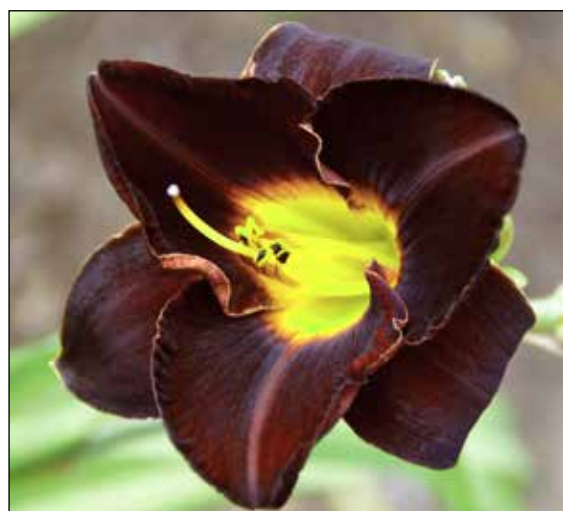
H. 'Obsidian' (Stamile 1988)

with a green throat, won an HM in 1990, an AM in 1993, and the Stout Silver Medal in 1996. 'Watermelon Moon' (1987), a 28", 6.5" watermelon pink blend with an orange throat, won an HM in 1992. 'Obsidian' (1988), a 27", 4.25" black self with a chartreuse throat, won an HM in 1992. 'Regal Finale' (1988), a 26", 6" violet purple self with a green throat, won an HM in 1992 and the Eugene S. Foster Award in 1992 for late blooming cultivars. 'Victorian Collar' (1988), a 24", 6.25" gold self, won an HM in 1993 and an AM in 1996. 'Ptarmigan' (1989), a 20", 5.75" near white self with a green throat, won an HM in 1993. 'Cherry Berry' (1989), a 30", 4.25" cream with a wine eyezone and a green throat, won an HM in 1994. 'Joe Marinello' (1989), a 21", 5" cream with a wine purple eyezone and a green throat, won an HM in 1994 and an