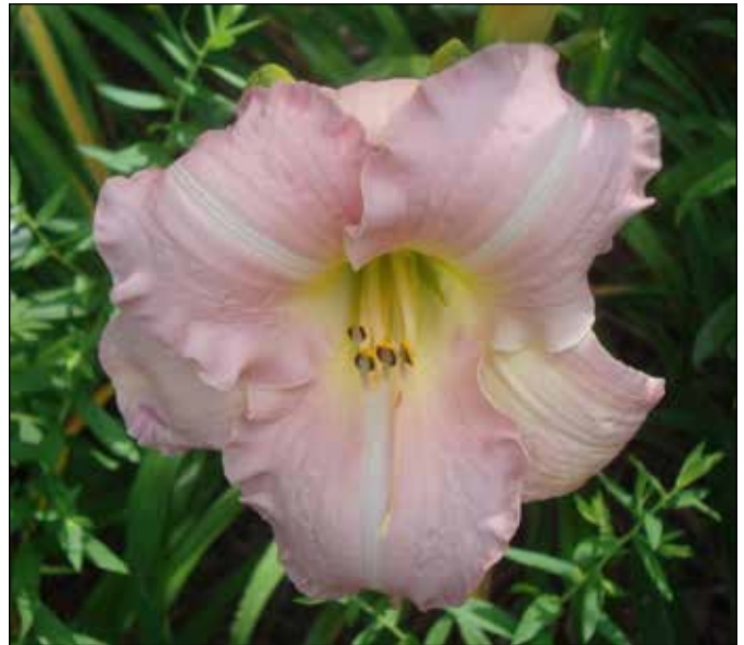
H. 'Frosted Pink Ice' (Stamile 1987)

(1985), a 28", 4.25" cranberry red self with a green throat, won an HM in 1990. One of his earliest tetraploids, 'Ever So Ruffled' (1983), a 22", 5" deep yellow self with a dark green throat, won an HM in 1990 and an AM in 1994. 'Arctic Snow' (1985), a 23", 5.5" ivory self with a green throat, won an HM in 1989 and an AM in 1992. 'Hot Ember' (1986), a 30", 6" reddish orange self with an orange throat, won an HM in 1992. 'Floyd Cove' (1987), a 21", 5" yellow self with a green throat, won an HM in 1990. 'Earth Angel' (1987), a 25", 4.5" apricot self with a green throat, won an HM in 1991. Two diploids from the same year were accorded awards: 'Frosted Pink Ice' (1987), a 28", 5" blue pink self with a green throat, won an HM in 1990 and the L. Ernest Plouf Award for fragrance in 1996; 'Double Conch Shell' (1987), a 26", 6" double melon pink blend with a green throat, won an HM in 1991. 'Glory Days' (1987), a 24", 5.5" tetraploid gold self, won an HM in 1995. 'Wedding Band' (1987), a 26", 5.5" cream white edged yellow