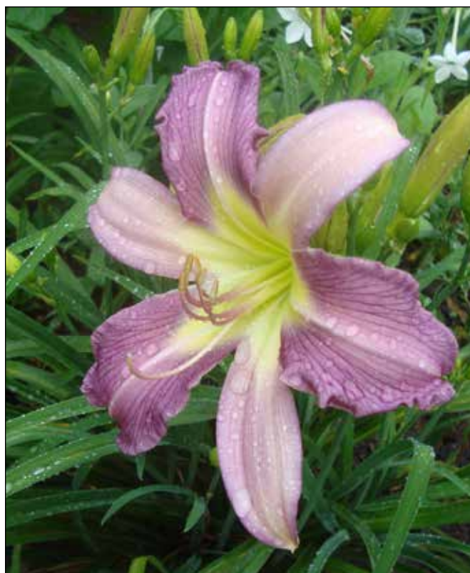
H. 'Moonlight Orchid' (Talbot 1986)