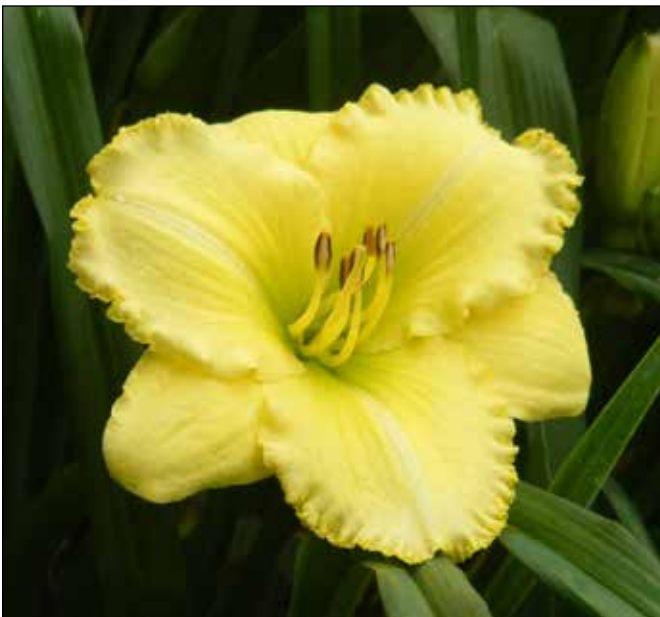
H. 'Atlanta Elegant Charm' (Petree 1990)