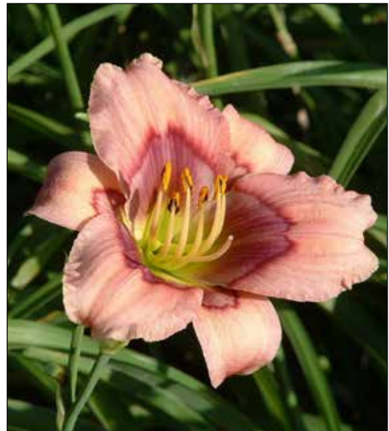
H. 'Little Witching Hour' (E. H. Salter 1988)

blend with an orange throat, and 'Bangkok Belle' (1987), an 18", 2.5" rose pink with yellow gold halo and a green throat, won HMs respectively in 1991 and 1993. 'Little Witching Hour' (1988), an 18", 3.25" rose lavender with washed light lavender rose eyezone edged dark purple above a green throat, won an HM in 1994. 'Storm Spell' (1990), a 20", 3" lavender tetraploid with a washed blue lavender purple eyezone above a