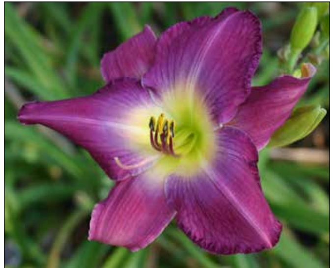
H. 'Anchors Aweigh' (Moldovan 1990)