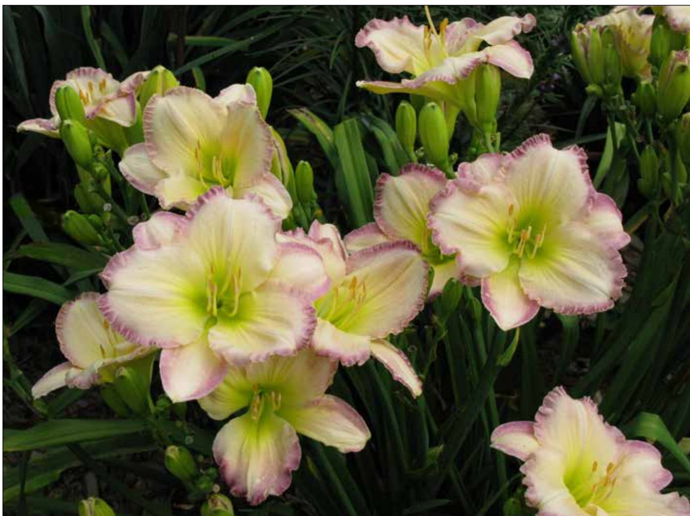
H. 'Seal of Approval' (Santa Lucia 1990)