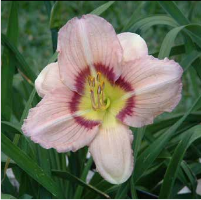
H. 'Brazos Belle' (Humphreys 1987)

Belle' (1987), a 25", 5.75" mauve lavender with a dark purple eyezone and a yellow green throat, has, however, not received an award.