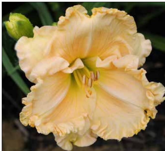
H. 'Ruffled Masterpiece' (E. C. Brown 1987)

eyezone above a yellow halo and a green throat, won an HM in 1991 and an AM in 1994. 'Elegance Supreme' (1987), a 19", 5" creamy near white self with a green throat, won an HM in 1993. 'Rose Charmer' (1987), a 23", 5.5" rose pink self with a green throat, won an HM in 1994. 'Ruffled Masterpiece' (1987), a 24", 5.25" creamy yellow self with a green throat, won an HM in 1995. 'Queen's Memories' (1989), a 25", 6" cream white self with a green throat, won an HM in 1993. 'Purple Rain Dance' (1989), a 29", 5.25" deep purple self with a green throat, won an HM in 1994. 'Rose Time' (1989), a 26", 5.25" rose pink self, also won an HM in 1994. 'Pink Tranquility' (1990), a 26", 5.5" cool clean pink self with a green throat, won an HM in 1995. In all, Edwin C. Brown is credited with 102 registrations, most of them diploids, though he registered several tetraploids after the historical period. He received the Bertrand Farr Silver Medal in 2004.