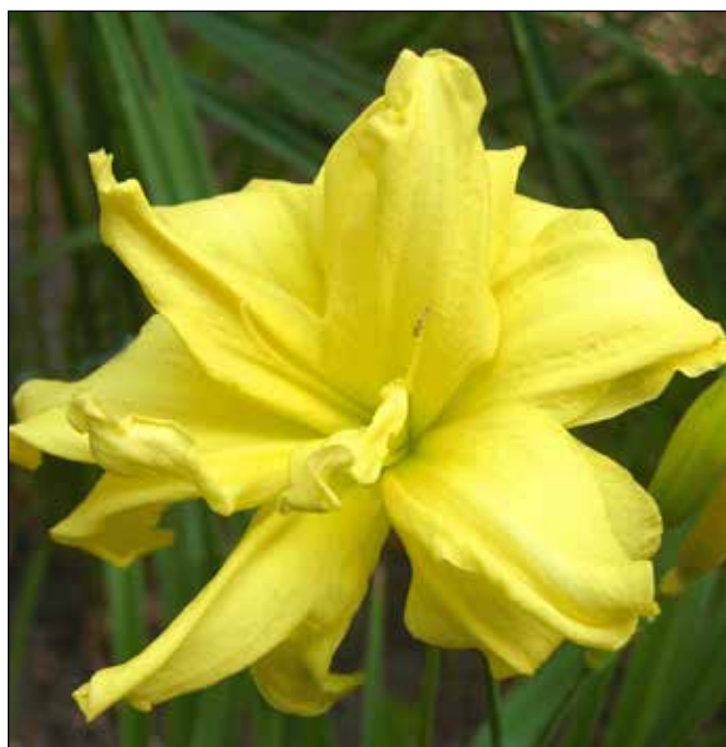
H. 'Double River Wye' (Kropf 1982)