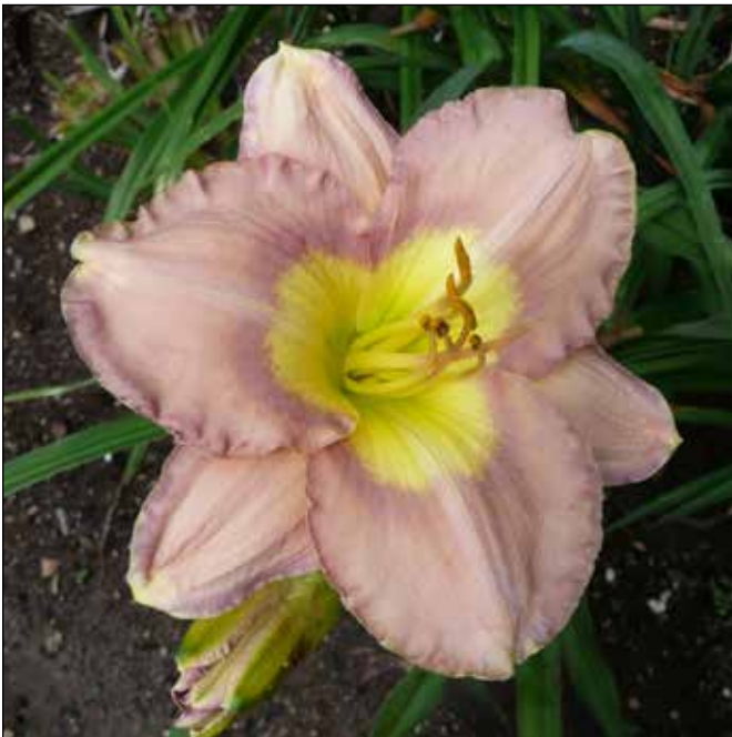
H. 'Mandala' (Morss 1988)

with a violet eyezone above a yellow green throat, won an HM in 1992. 'Graceland' (1987), a 28" 6" pastel lavender, cream, and chartreuse polychrome edged gold with a yellow halo above a green throat, won an HM in 1992. 'Mandala' (1988), a 27", 5" creamy lavender edged gold with a green throat, won an HM in 1993. 'Mort's Magic' (1989), a 26", 5.5" medium mauve edged purple and white with a green throat, won an HM in 1995. 'Into the Mystic' (1990), a 26", 5.5" medium orchid edged gold with a lavender violet halo above a green throat,