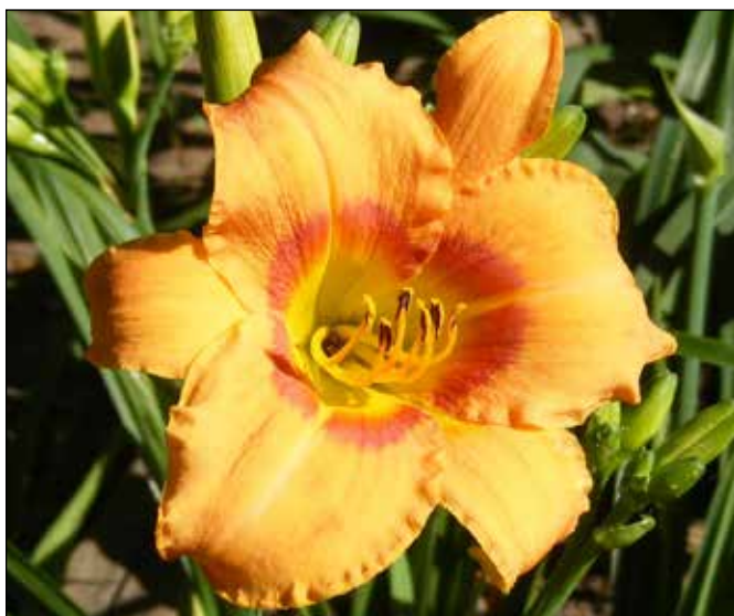
H. 'Caprician Fiesta' (Rogers 1984)