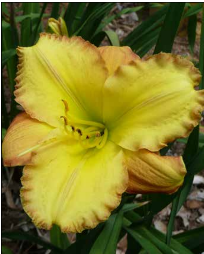
H. 'Unique Style' (Kate Carpenter 1985)