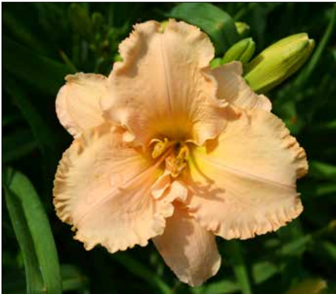
H. 'Elizabeth Salter' (Salter 1990)

green throat, won an HM in 1994 and an AM in 1997. 'Kathleen Salter' (1989), a 28", 6" yellow self with a green throat, won an HM in 1993. 'Walking on Sunshine' (1989), a 22", 5" yellow self with a green throat, also won an HM in 1993. 'Chestnut Mountain' (1989), a 24", 5.5" chestnut copper and orange yellow blend with a green throat, won an HM in 2006. On the other hand, 'Quest for Excalibur' (1989), a 24", 6" purple self with a green throat, remains overlooked. 'Elizabeth Salter' (1990), a 22", 5.5" pink self with a green throat, won an HM in 1995, an AM in 1998, and the Stout Silver Medal in 2000. It remains one of Jeff's most popular cultivars. 'Jungle Mask' (1990), a 28", 6" cream pink edged in purple with a royal purple eyezone above a green throat, won an HM in 1994. 'Elizabeth's Magic' (1990), a 24", 6" lavender purple edged deep gold with a green throat, won an HM in 1995.