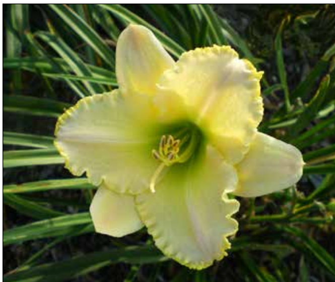
H. 'Fragrant Bouquet' (Reckamp-Klehm 1989)