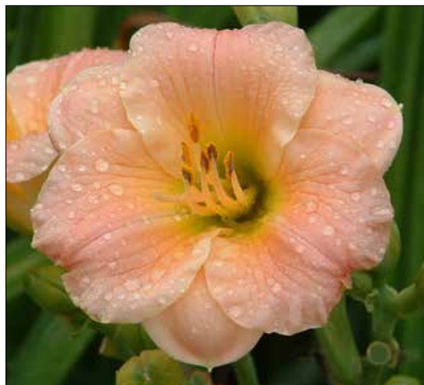
H. 'Pink Puff' (Jablonski-Sharp 1988)

24", 5.5" cantaloupe double with a green throat, captured an HM in 1991. However, his 'Double Joanna' (1982), a 30", 6" medium violet double with a dark violet eyezone and green throat, remains overlooked. 'Amethyst Art' (1988), an 18", 5" lavender double with a yellow throat, won an HM in 1994. 'Butter Dish' (1988), an 18", 5" butter yellow double with a green throat, also captured an HM in 1994. Several of his doubles received awards more than a decade after their registration. 'Zada Mae' (1982), a 22", 4.5" light peach self with a tiny green throat, received an HM in 2008. 'Double River Wye' (1982), a 30", 4.5" light yellow self with a green throat, received an HM in 2009. His 'Four Star' (Kropf-Tankesley-Clarke, 1988), a 30", 6" yellow gold double with a spider ratio of 4.30:1, although still popular, has so far been overlooked for awards. 'Carrot Crest' (1990), a 28", 4" light carrot orange with paprika eyezone above an orange green throat, won an HM in 1996.