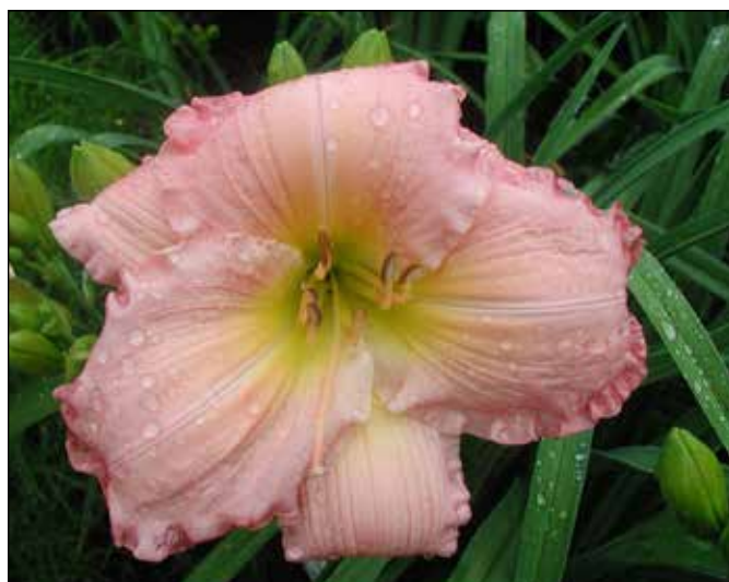
H. 'Xia Xiang' (Billingslea 1988)