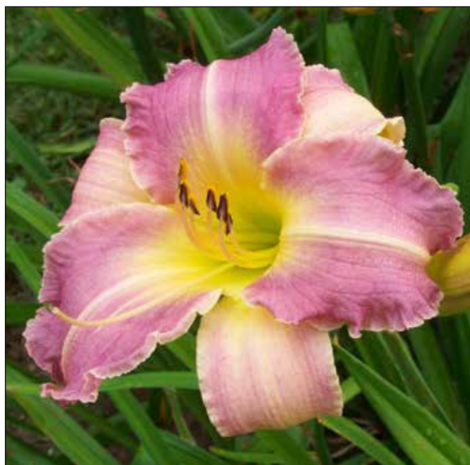
H. 'Lavender Deal' (Kirby-Oakes 1981)