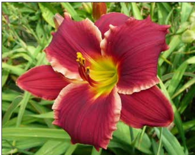
H. 'Pocket Change' (Crochet 1985)