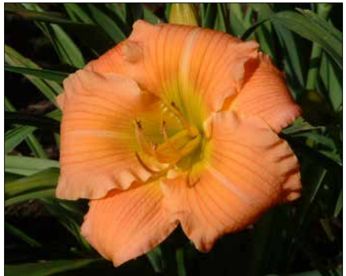
H. 'Kiowa Sunset' (Guidry 1990)