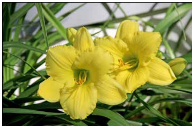
H. 'Atlanta Full House' (Petree 1984)