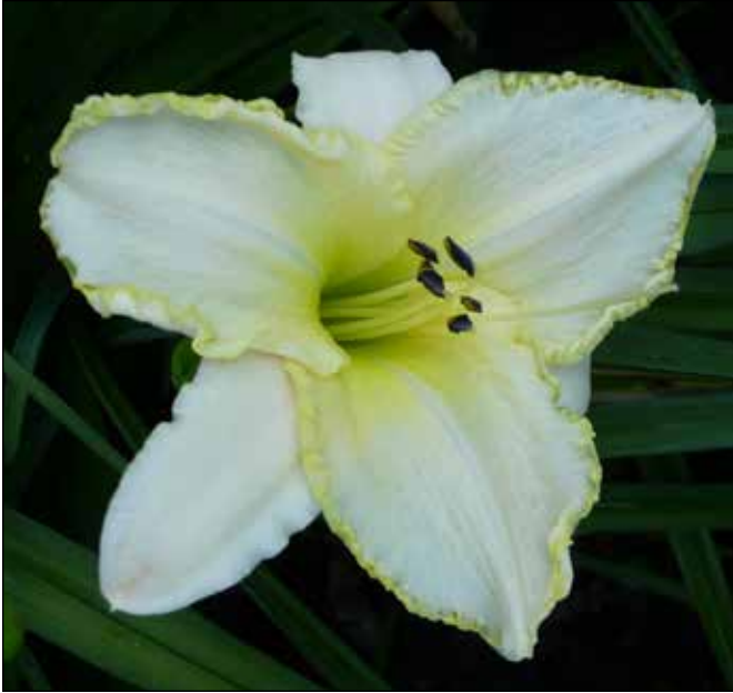
H. 'Admiral's Braid' (Stamile 1990)