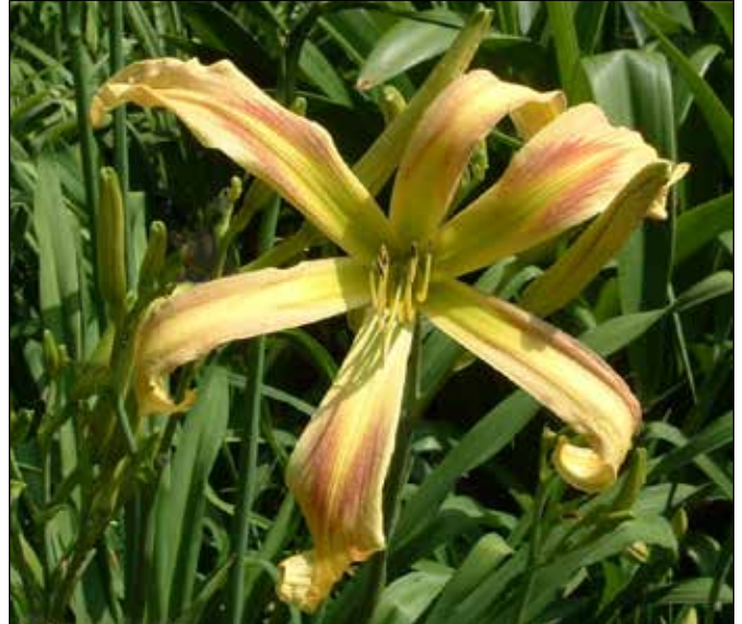
H. 'Slender Lady' (Crandall 1987)

yellow amber self with a very green throat and a spider ratio of 5.00:1, won an HM in 1997. 'Satan's Curls' (1987), a 29", 6" unusual form crispate red with a yellow band outside a very green throat, was popular, but also overlooked for an award. In contrast, 'Calico Spider' (1987), a 32", 6.75" gold with a brown mahogany eyezone and a spider ration of 4.20:1, eventually won an HM in 2011.