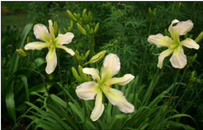
H. 'Asterisk' (Lambert 1985)