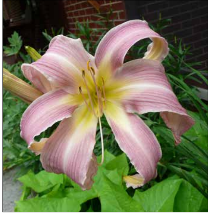
H. 'Lilting Belle' (Belle 1983)