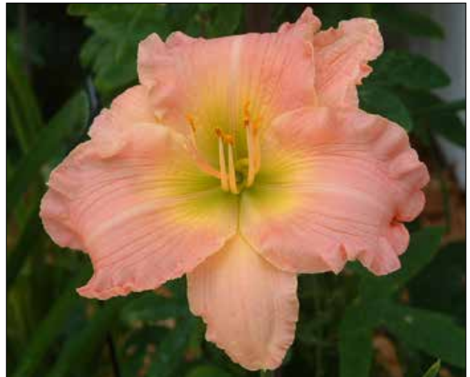
H. 'Perfectly Pink' (Cruse 1990)