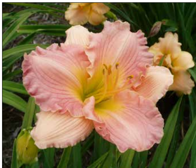
H. 'Blessing' (Applegate 1989)