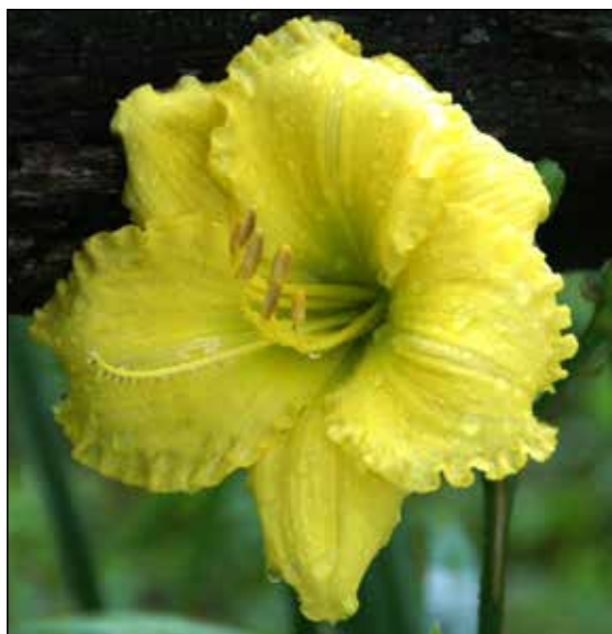
H. 'Seneca Valley' (Bennett 1983)