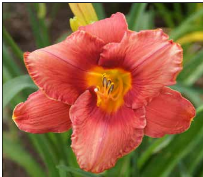
H. 'Ricky Rose' (Brooks 1990)

light greenish yellow self with a green throat, won an HM in 1993. 'Ricky Rose' (1990), a 30", 6.25" rose pink with a deep raspberry eyezone and a pale yellow green throat, won an HM in 1993.