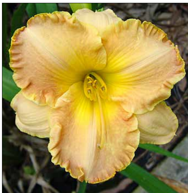
H. ‘ Chestnut Mountain ’ (Salter 1989)