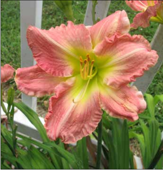
H. 'Mabel Nolen' (Nolen 1983)