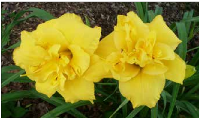
H. 'Layers of Gold' (Kirchhoff 1990)