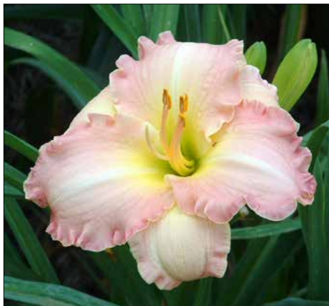
H. 'Antique Rose' (Sikes 1987)