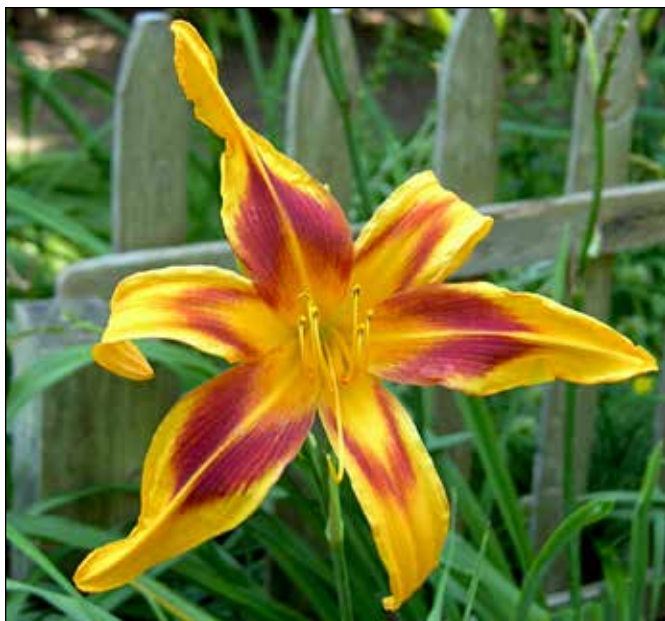
H. 'Calico Spider' (Crandall 1987)