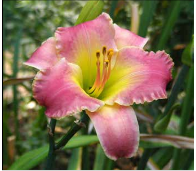
H. 'Morning Dawn' (Reckamp-Klehm 1981)