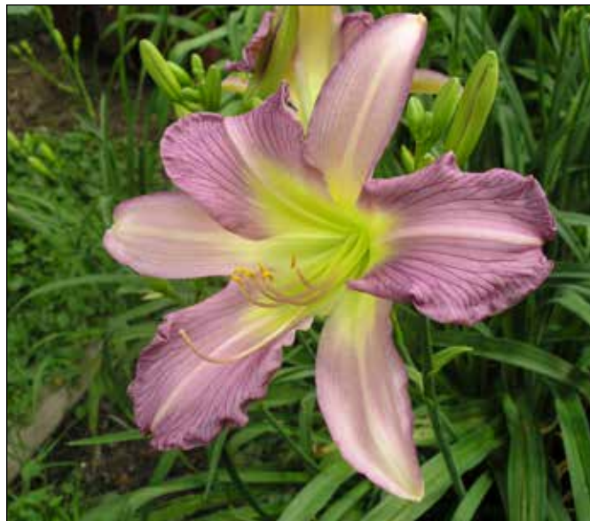
H. 'Moonlight Orchid' (Talbot 1986)