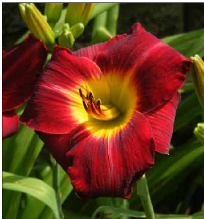
H. 'Gato' (Durio 1981)