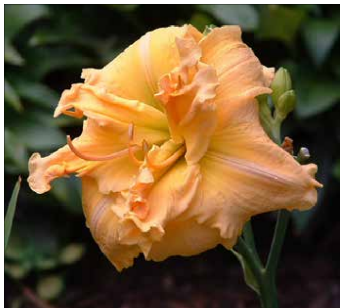
H. 'Double Conch Shell' (Stamile 1987)