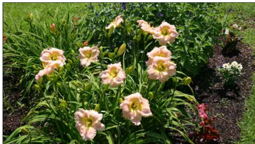
H. 'Rachel Billingslea' (Billingslea 1990)