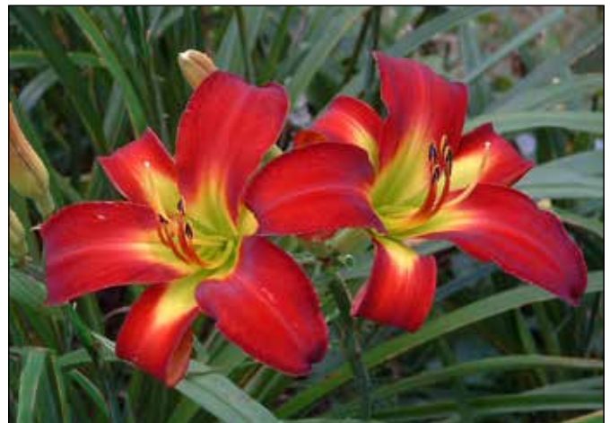
H. 'Fire from Heaven' (Grovenstein 1985)

2.62" light yellow self with a very small green throat; 'Echo the Sun' (1990), a 41", 3.25" bright yellow self with a green throat; and 'Cool Spice' (1990), a 36", 5.25" greenish yellow self with a green throat, are indicative of his registrations.