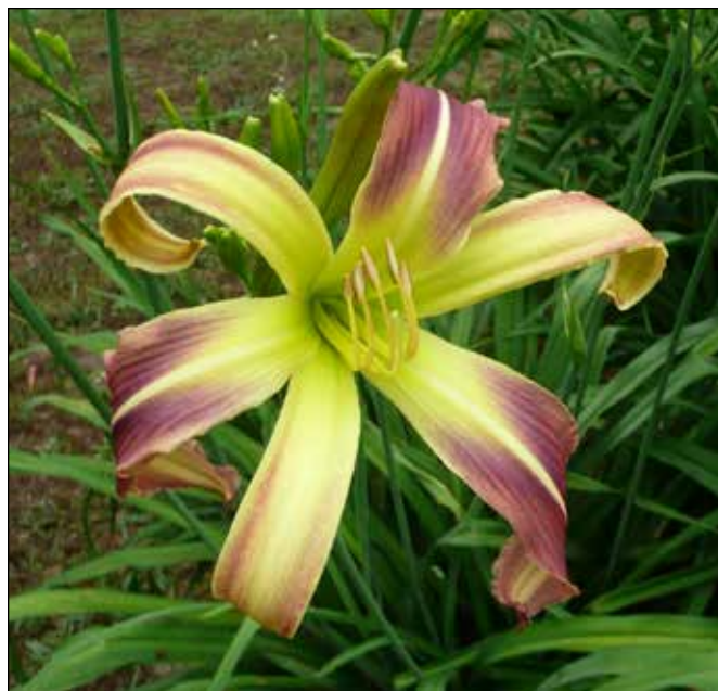
H. 'Lavender Spider' (Harris-Reinke 1990)

Light' (1990), a 34", 8" greenish yellow self with a spider ratio of 4.80:1, remains overlooked for awards. They also registered a cultivar hybridized by Eula "Gussie" Harris of Memphis, Tennessee. 'Lavender Spider' (Harris-Reinke 1990), a 32", 10" lavender diploid with yellow throat and a spider ratio of 5.20:1, which won an HM in 1993.