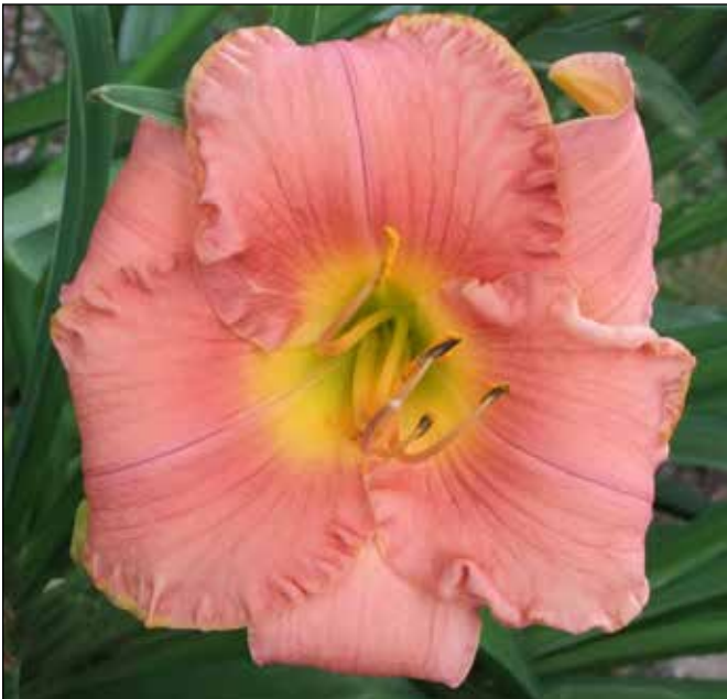
H. 'Silken Touch' (Stamile 1990)

an HM in 1996 and an AM in 1999. 'Silken Touch' (1990), a 23", 6" rose pink self with a green throat, won an HM in 1996. 'Isle of Capri' (1990), a 23", 6" deep lemon yellow self with a green throat, won an HM in 1997. 'Olympic Showcase' (1990), a 24", 6.25" brilliant gold self with a green throat, won an HM in 2005.