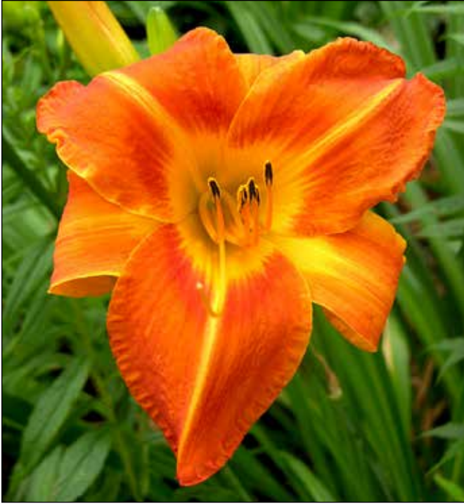
H. 'Tusawilla Tigress' (Hansen 1988)

gene S. Foster Award for late booming cultivars in 1994. 'Tusawilla Tigress' (1988), a 25", 7.25" bright orange tetraploid with a dark orange eyezone and a chartreuse throat, won an HM in 1992 and an AM in 1996. 'Tusawilla Tranquility' (1988), a 21", 5.5" near white diploid with a lemon lime throat, won an HM in 1992. 'Night Beacon' (1988), a 27", 4" black purple diploid with a large chartreuse center and a green throat, won an HM in 1998. 'Palo Duro Canyon' (1989) a 26", 6" rust brown diploid with a darker center edged gold with an ol-