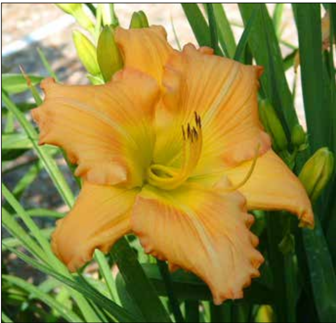
H. 'Waimea Cliffs' (Carpenter-Glidden 1983)