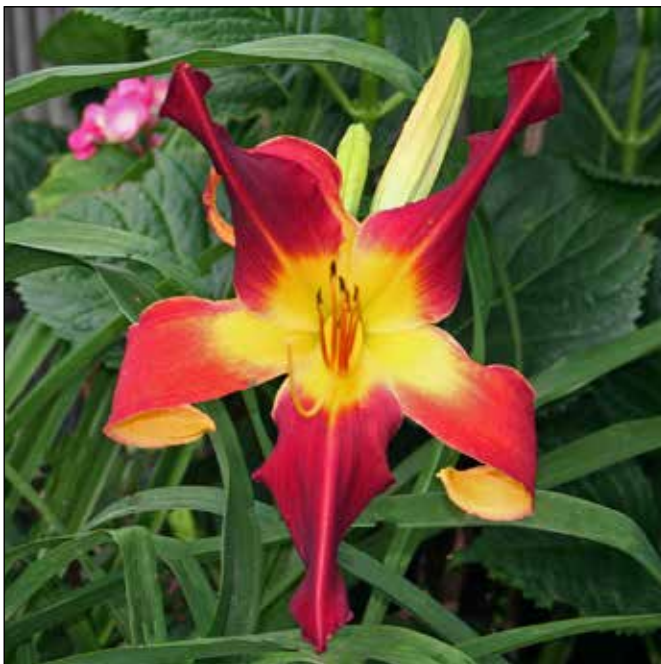
H. 'Red Suspenders' (Webster 1990)