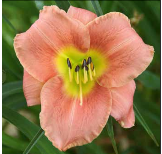
H. 'Adjure' (Whatley 1990)

an HM in 1994. Other tetraploids included 'Sligo' (1988), a 26", 5.5" dark red self with a green throat, which won an HM in 1993; 'Khorassan' (1988), a 30", 6" pink and yellow blend with a yellow throat, which won an HM in 1994; 'Kuan Yin' (1988), a 24", 6" bright red self with a green throat, which also won an HM in 1990; and 'Adjure' (1990), a 25", 6" rose pink self with a very green throat, which won an HM in 2001. These are just some of the 37 cultivars registered during this period. Oscie Whatley was awarded the Bertrand Farr Silver Medal in 1984.