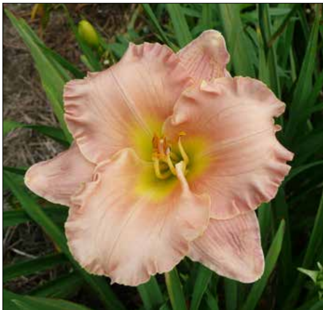
H. 'Someone Special' (Sikes 1985)

self with a chartreuse throat, won an HM in 1990. The most famous of her diploids from the mid-1980s was 'Neal Berrey' (1985), an 18", 5" rose pink blend with a green yellow throat. It won an HM in 1989, an AM in 1992, and the Stout Silver Medal in 1995. Other important diploids included 'Antique Rose' (1987), a 25", 5.5" rose pink bitone with a green yellow throat, which won an HM in 1989 and an AM in 1994; 'Trade-last' (1988), a 24", 4.75" deep pink blend with a green yellow throat, won an HM in 1991; 'Special Moment' (1990), a 26", 5" lavender blend with a green throat, which won an HM in 1995; and 'Heather Pink' (1990), a 22", 5" pink blend with a green throat, which won an HM in 1996. Sarah was awarded