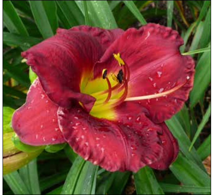
H. 'Jovial' (Lee Gates 1986)

an AM in 1996. Among his tetraploids winning HMs alone were 'Shaman' (1985), a 20", 5.5" canary yellow self with a green throat, in 1989; 'Jovial' (1986), a 20", 5" wine red self with a chartreuse green throat, in 1990; 'Ultra Plum' (1986), a 20", 5.5" plum purple with darker eyezone and green throat, in 1991; 'Excitable' (1986), a 20", 5.5" double rose pink self with a green throat, in 1992; 'Shared Excitement' (1986), a 20", 6" green yellow blend with a green throat, in 1993; 'Snow Bride' (1986), a 20", 5" diamond dusted near white with a