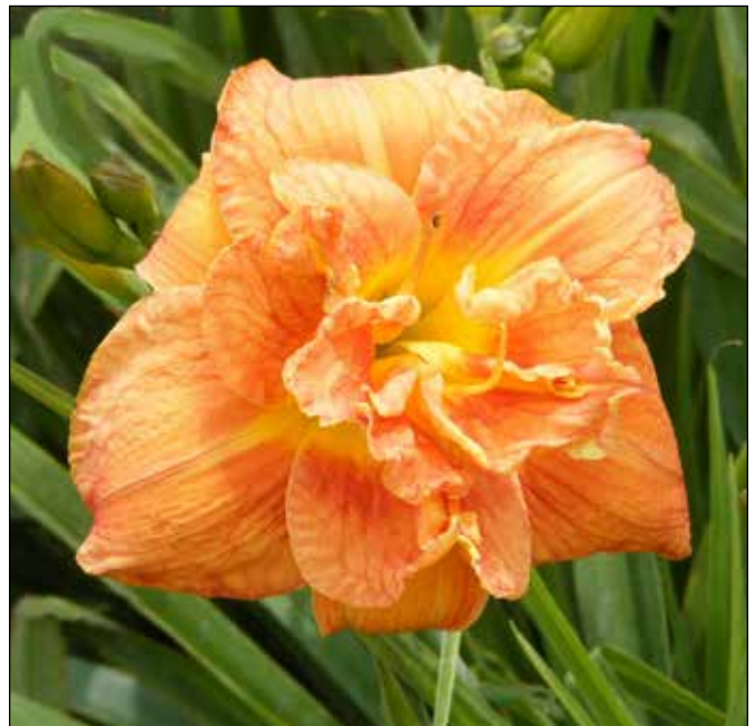
H. 'Double Dipper' (Dalton Durio 1990)