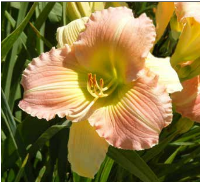
H. 'Bombay Bicycle' (Branch 1990)

After his retirement from his medical practice, he registered a large number of daylilies in the late 1980s and well into the Twenty-First Century. His diploid, H. 'Susan Weber' (1989), a 26", 5.75" light rose pink edged rose with a yellow green throat, became very popular. It won an HM in 1996, an AM in 1999, and the ESF in 2001. Another diploid, 'Bombay Bicycle' (1990), a 20", 5" pink apricot and cream lined light rose bitone with a yellow green throat, won an HM in 2002. A third diploid, 'Sweet Revenge' (1990), a 24", 5.5" rosy beige bitone with a willow green throat, also won an HM in 2002. However, his tetraploid, 'Pink Bon Bon' (1987), a 26", 5" light rose pink with a cream pink halo and a yellow green throat remains overlooked. He was the recipient of the Bertrand Farr Silver Medal in 2005.