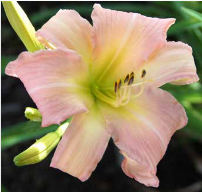
H. 'Mimosa Umbrella' (Hendricks 1984)

W. B. Hendricks of Woodland, Georgia, is credited with 43 registrations. H. 'Dream Blue' (1982), a 26", 5.5" grape purple with a slightly darker eyezone and a green throat, won an HM in 1992. 'Mimosa Umbrella' (1984), a 28",