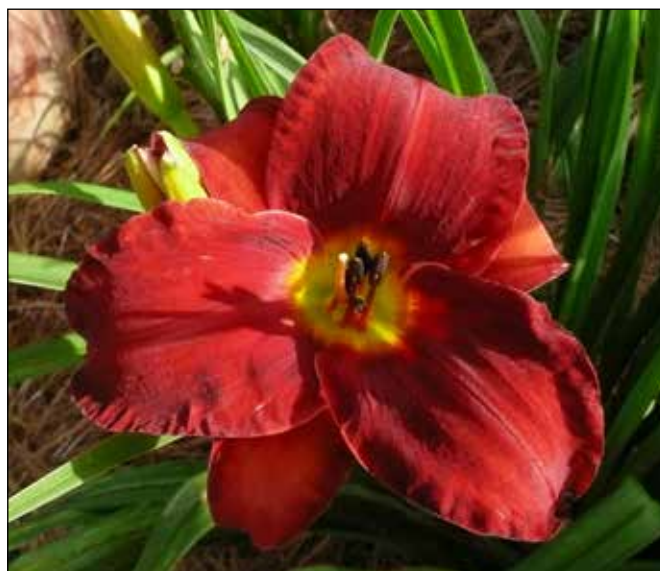
H. 'Roll Tide' (Webster 1987)

large green throat, won an HM in 1995. 'Purple Arachne' (1982), a 22", 7" purple spider with a spider ratio of 4.70:1 and a green throat, however, was overlooked for an award, as was 'Fire Arrow' (1985), a 24", 8.5" bright red unusual form crispate with a green chartreuse throat, and 'Galaxy Rose' (1986), a 32", 9.5" deep rose unusual form crispate with a green chartreuse throat. (Perhaps these daylilies were registered prior to a time when these forms became fully appreciated.) 'Purple Storm' (1985), a 26", 5" pinkish lavender with a deep purple eyezone and a green throat, won an HM in 1992. 'Ivory Gown' (1985), a 26", 6" ivory cream with a pinkish cast and green throat, won an HM in 1991. 'Bama Bound' (1986), a