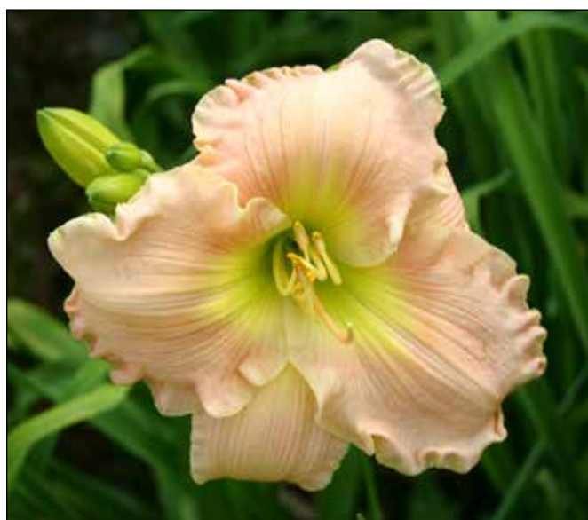
H. 'Rachel Billingslea' (Billingslea 1990)