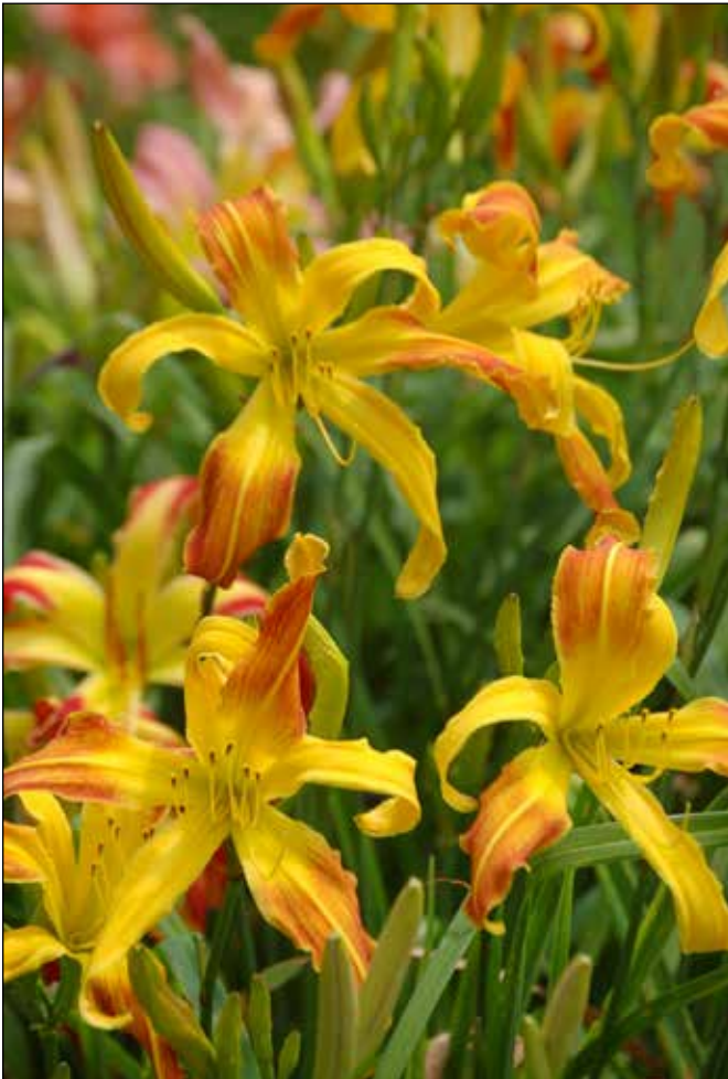
H. 'Spindazzle' (Wilson 1983)