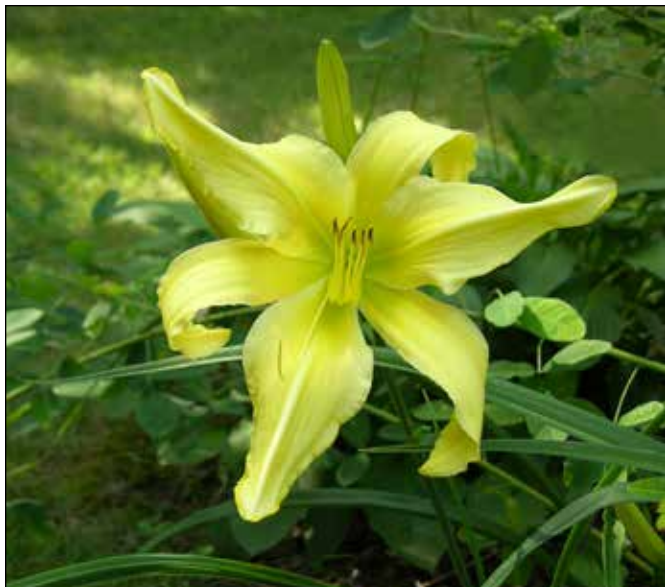
H. 'Risen Star' (Webster 1988)