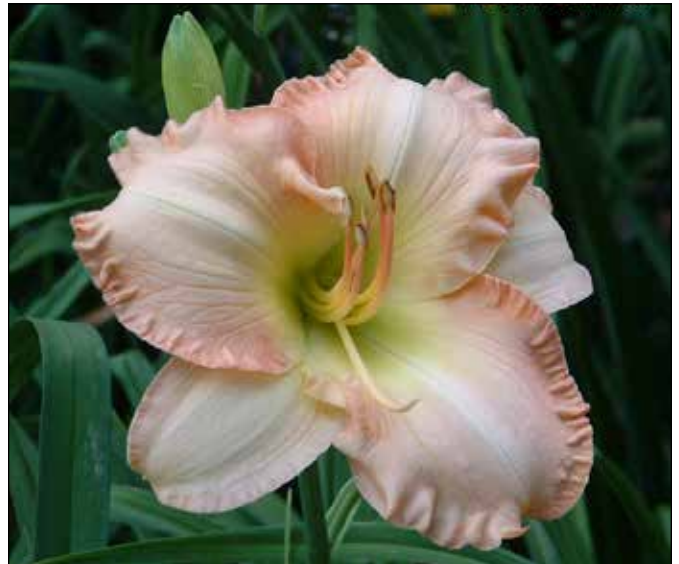
H. 'Heaven Can Wait' (Hansen 1990)

ive throat, won an HM in 1994. 'Tusawilla Princess' (1990), a 26", 5" pink diploid with a tiny olive throat, won an HM in 1993. 'Paige's Pinata' (1990), a 26", 6" peach diploid with a bold fuchsia band around an orange eyezone and a dark green throat, won an HM in 1994, an AM in 1997, and the Don C. Stevens Award for banded or eyed cultivars in 1998. 'Affair to Remember' (1990), a 22", 6" hot fuchsia pink and cream bitone diploid with a very large chartreuse throat, won an HM in 1994. 'Heaven Can Wait' (1990), a 23", 5" peach pink diploid with a darker edge and a green throat, won an HM in 1994. 'Sings the Blues' (1990), a 26", 6" lavender with a variegated violet blue eyezone and an emerald throat, won an HM in 1994. 'Riseman's Flame' (1990), a 22", 6" cream yellow diploid with rose red overlaid patterns above a green throat, won an HM in 1995. 'Prince Michael' (1990), a 28", 7" violet diploid with a magenta purple eyezone and a green throat, won an HM in 1997. 'Just Whistle' (1990), a 24", 4.25" orchid diploid with a dark purple eyezone and an emerald throat, won