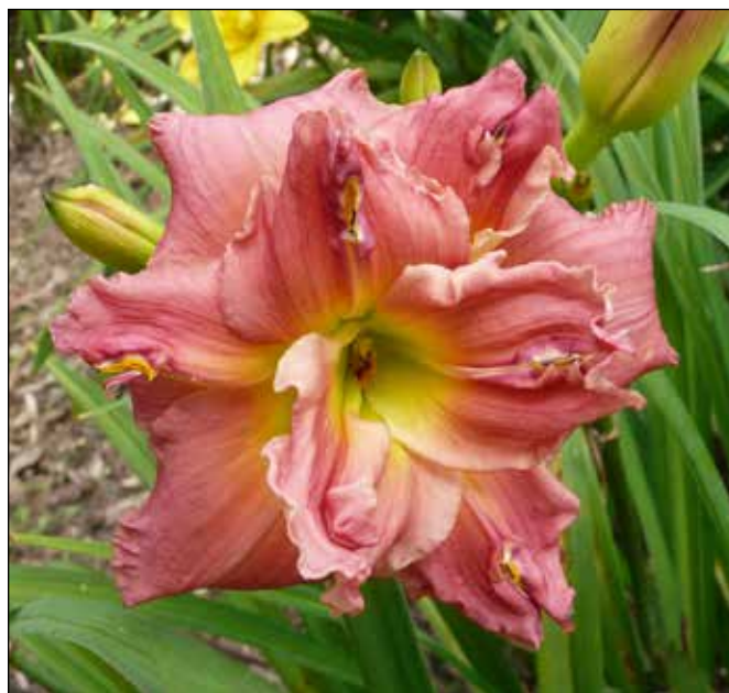
H. 'Sanford House' (Kirchhoff 1984)

HM in 1987 and an AM in 1991. 'Cabbage Flower' (1984), still another diploid, won an HM in 1987 and the Ida Munson Award in 1990. It is a 17", 4.62" double pastel lemon yellow self with a green throat. The diploid double, 'Far Niente' (1984), a 26", 5.5" rose pink, flesh and lavender polychrome with a yellow throat, won an HM in 1994. However, 'Desdemona' (1984), a 20", 4.5" diploid double blend of magenta, orchid, and rose with a grayed watermark above a yellow green throat, remains overlooked, as does 'Fanciful Finery' (1984), a 15", 4.5" diploid double medium amber blend with pink highlights and an olive throat. 'Sanford House' (1984), a 26", 4.75" diploid double medium rose pink self with a green throat, also remains overlooked. 'Homer Howard Glidden' (1985), a 20", 3.25" diploid near white with an orchid cast and a yellow green throat, won an HM in 1988. 'Cotton Club'