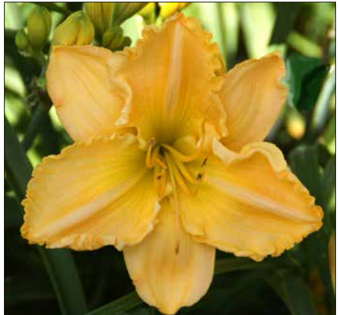
H. 'Josephine Marina' (J. Carpenter 1987)

'Regal Heir' (1987), a 22", 5.5" purple self with a yellow green throat, won the President's Cup at the National Convention in 1992, but again no further awards. 'Josephine Marina' (1987), a 21", 7.5" apricot peach self with an olive green throat, won an HM in 1990 and an AM in 1993. 'Marie Hooper Memorial' (1988), a 26", 8.25" melon pink blend with yellow green throat, won an HM in 1998. 'Ruffled Perfection' (1989), a 24", 7" lemon yellow self with a green throat, won an HM in 1997 and an AM in 2000. 'Dark and Handsome' (1990), a 20", 5.75" smoky pink with a dark maroon eyezone and a yellow green throat, won an HM in 1997. 'Merle Kent