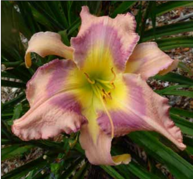
H. 'Designer Gown' (Sikes 1982)

ister daylilies during the Nineties. H. 'Royal Rage' (1980), a 28", 5.5" deep brick red tetraploid with a green gold throat, won an HM in 1983. It continued the legacy of 'Sound and Fury' which had been registered in 1979. A number of her tetraploid registrations in the 1980s were honored, including 'Designer Gown' (1982), a 29", 6" pale pink lavender with a deep pink lavender halo and a yellow green throat, which received an HM in 1985; 'Ardent Affair' (1982), a 32", 6"