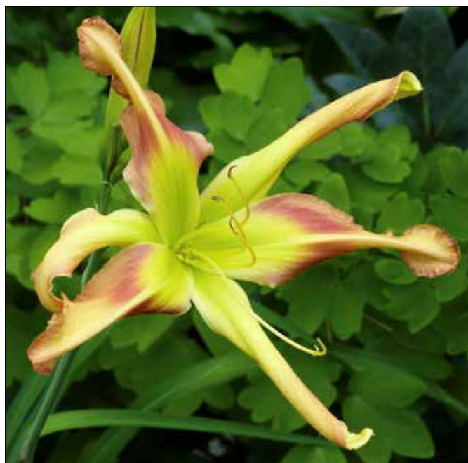
H. 'Rosy Lights' (Wilson-Schott 1990)

'Mad Max' (Wilson-Schott 1989), a 46", 7" rosy purple unusual form cascade with a deep purple eyezone and a chartreuse throat, won an HM in 2011. Another diploid, 'Rosy Lights' (Wilson-Schott 1990), a 40", 8.5" rose beige unusual