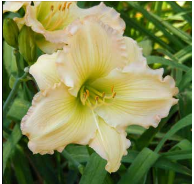
H. 'Stop the Show' (Lee Gates 1986)

green throat, in 1992; 'Stop the Show' (1986), a 24", 6.5" lavender pink and yellow polychrome with a green chartreuse