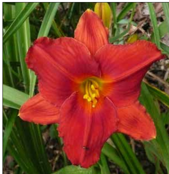
H. 'Nouveau Riche' (Apps 1990)

a green throat, won an HM in 1993; 'Woodside Amethyst' (1989), a 30", 4" lavender purple blend with a yellow green throat, won an HM in 1995; and 'Woodside Fire Dance' (1990), a 26", 3.5" Orient red self with a yellow green throat,