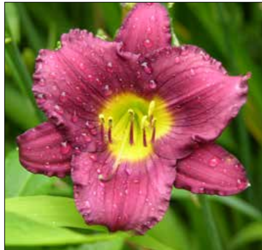
H. 'Velvet Shadows' (Hudson 1981)

from the early part of the decade included 'Moonlight Mist' (1981), an 18", 3" frost pink peach blend with a chartreuse throat; 'Crimson Icon' (1982), a 15", 2.75" diploid red self with a yellow green throat; and 'Jim McGinnis' (1983), a 15", 2.75" diploid pink with a rose red eyezone and a green throat. The first received an HM in 1985, and the latter two, HMs in 1987. Another, 'Velvet Shadows' (1981), a 15", 2.75" violet purple diploid with a chalky lavender watermark and green throat, was honored somewhat belatedly with an HM in 2011,