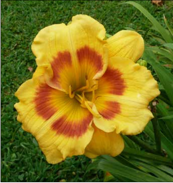
H. 'Jedi Tequila Sunrise' (Wedgeworth 1990)