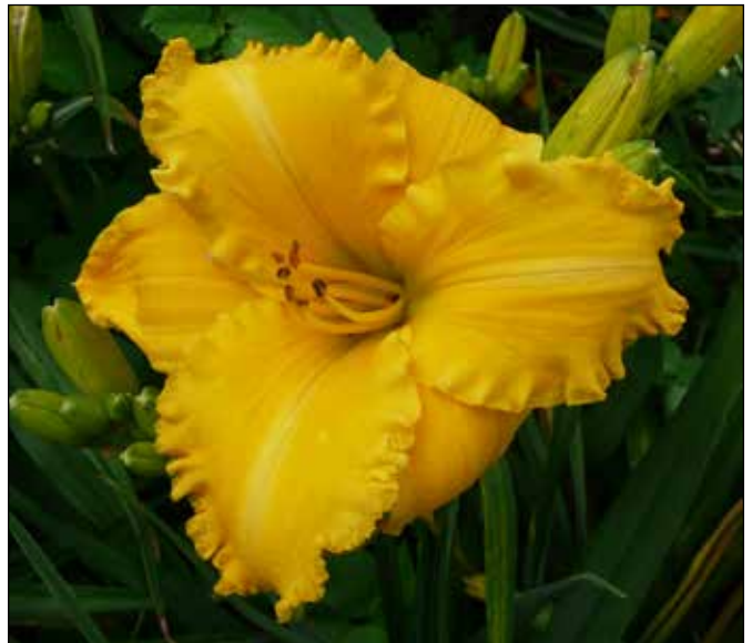
H. 'Olympic Showcase' (Stamile 1990)