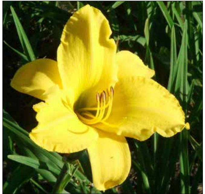
H. 'California Sunshine' (Chesnik 1985)

(1985), a 30", 6" yellow gold self with a pale green throat, won an HM in 1988. 'California Sunshine' (1985), a 33", 6.5" intense yellow self, won an HM in 1990. Both of these were tetraploids. A diploid 'Purple Rain' (1985), registered as a 15", 3" bright grape purple bitone with a black eyezone and a green throat, also won an HM in 1988.