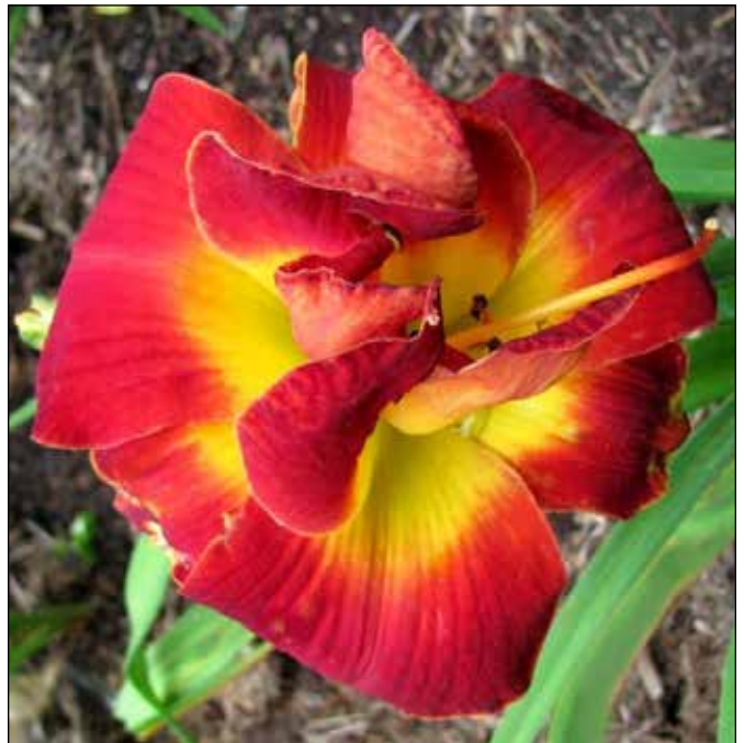
H. 'Red Explosion' (Sellers 1986)

(1986), a 26", 4" pale pink diploid with a pink halo and green throat, won an HM in 1993, and a diploid double, 'Red Explosion' (1986), a 26", 5.5" red with a yellow green throat, won an HM in 1994. Two of his most honored diploids were 'Exotic Echo' (1984), a 16", 3" pink cream blend double with a burgundy eye and a green throat, which won an HM in 1989, the Annie T. Giles Award for small flowers in 1994, and an AM in 1994, and 'Big Apple' (1986), a 26", 5" cerise red self with a green throat, which won an HM in 1989 and an AM in 1992.