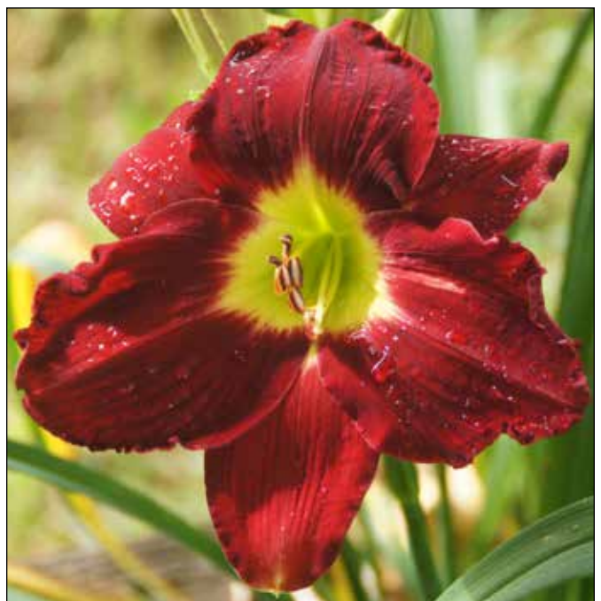
H. 'Big Apple' (Sellers 1986)