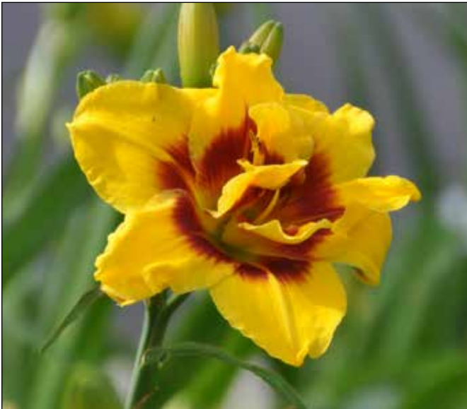
H. 'Mount Helena' (Grooms 1985)