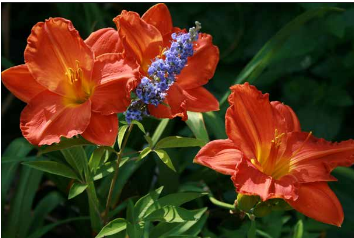
H. 'House of Orange' (Weston 1990)