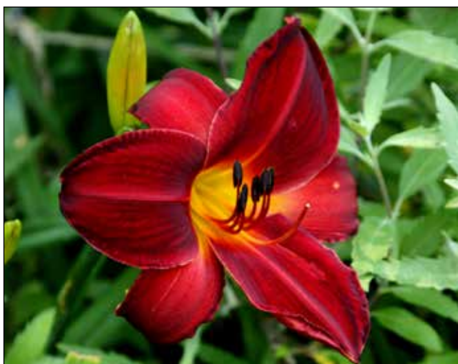
H. 'Island Blackout' (Rasmussen 1981)