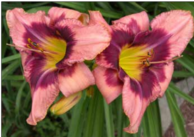
H. 'Emperor's Dragon' (R. W. Munson, Jr. 1988)

a chartreuse yellow throat, won an HM in 1993. 'Lexington Avenue' (1990), a 24", 6" wine with whitish wine eyezone and a greenish yellow throat, won an HM in 1995. These represent but a fraction of his award winners. Notable among his many cultivars which have not been recognized for awards is 'Nairobi Night' (1983), a 30", 6" purple with a large cream lavender eye above a yellow green throat, 'Nile Plum' (1984), a 20", 5" silvery mauve plum with plum claret eyezone and a yellow green throat, and 'Grand Palais' (1987), a 24", 6" silvery lilac lavender self with a lemon cream throat.