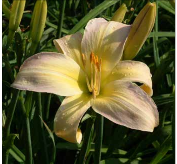
H. 'Skyhooks' (Hanson 1990)

' Skyhooks ' (1990), a 36", 8" unusual form cascade orchid lavender blend with a chartreuse throat, is an example of one of his overlooked cultivars from the historical period.