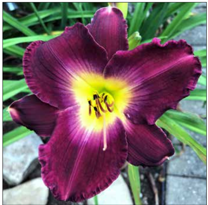
H. 'Strutter's Ball' (Moldovan 1984)

'Vera Biaglow' (1984), a 28", 6" rose pink edged silver with a lemon green throat, captured an HM in 1989 and an AM in 1993. 'Pewter Lake' (1986), a 28", 6" gray bluish lavender blend with deeper veins and a lemon yellow green throat, won an HM in 1991. 'Avante Garde' (1986), a 26", 5.5" amber tan bitone with a red orange eyezone and a yellow green throat, won an HM in 1993, and 'Geppetto' (1986), a 26", 5" pink cream with a strong pink eyezone and yellow green throat, won an HM in 1994. Four other tetraploids, registered on the cusp of the next decade, are worth mentioning. 'Anchors Aweigh' (1990), although overlooked for awards, is a 28", 6"