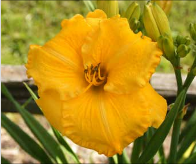
H. 'Victorian Collar' (Stamile 1988)