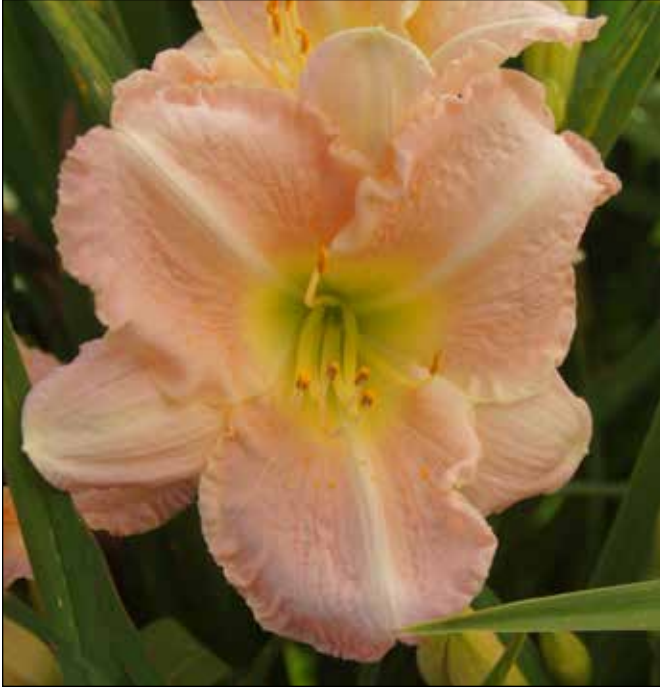
H. 'Delmar' (Whatley 1986)

a 20", 5" light yellow self with a green throat, was an exception to Whatley's breeding program in the 1980s, in that it was a diploid. It won an HM in 1991. A second diploid, 'Delmar' (1986), a 20", 5" medium pink self with a green throat, won an HM in 1992. 'Sedalia' (1986), a 27", 6.5" rose pink tetraploid with a green throat, won an HM in 1993. 'Three Diamonds' (1986), a 27", 6" dark red tetraploid with a green throat, won