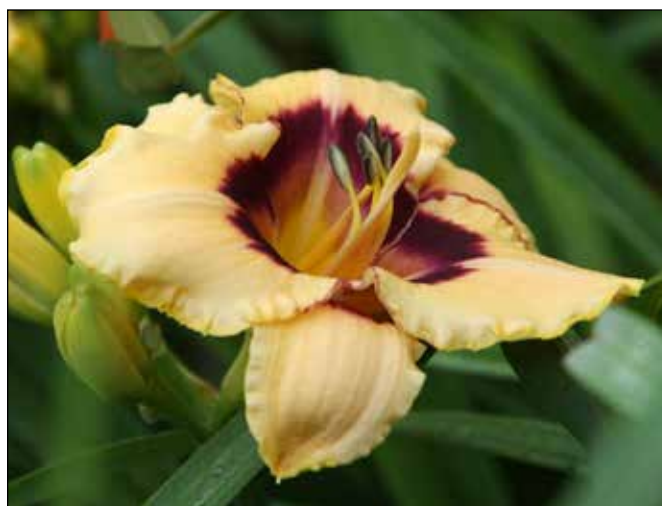
H. 'Modern Design' (Rasmussen 1987)

(1989), a 28", 5.5" rose pink blend edged plum with a green gold throat, won an HM in 2000. Several of his tetraploids from the historical period, however, have been overlooked for awards, among them: 'Island Blackout' (1981), a 34", 6.5" black red blend with a gold throat; 'Moonless Night' (1985), a 30", 6" black red self with a yellow green throat; and 'Modern Design' (1989), a 24", 4" beige pink with a dark plum eyezone and green throat. In all, he is credited with 65 registrations.