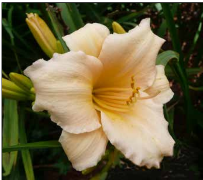
H. 'Mini Pearl' (Jablonski 1982)