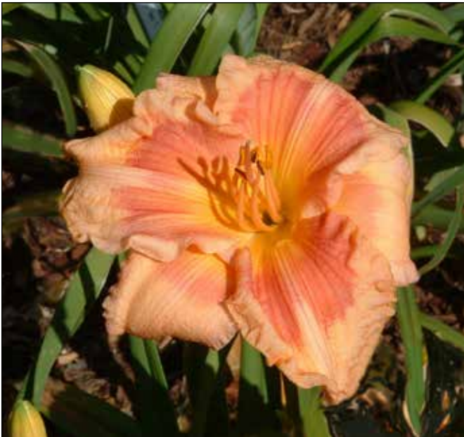
H. 'Paige's Pinata' (Hansen 1990)

gene S. Foster Award for late booming cultivars in 1994. 'Tusawilla Tigress' (1988), a 25", 7.25" bright orange tetraploid with a dark orange eyezone and a chartreuse throat, won an HM in 1992 and an AM in 1996. 'Tusawilla Tranquility' (1988), a 21", 5.5" near white diploid with a lemon lime throat, won an HM in 1992. 'Night Beacon' (1988), a 27", 4" black purple diploid with a large chartreuse center and a green throat, won an HM in 1998. 'Palo Duro Canyon' (1989) a 26", 6" rust brown diploid with a darker center edged gold with an ol-