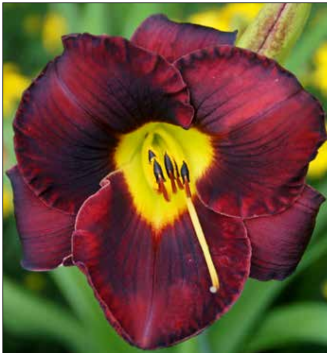
H. 'Vintage Bordeaux' (Kirchhoff 1986)