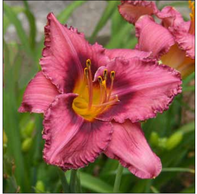
H. 'Mort's Magic' (Morss 1989)