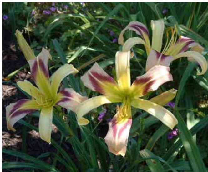
H. 'Rainbow Spangles' (Temple 1983)