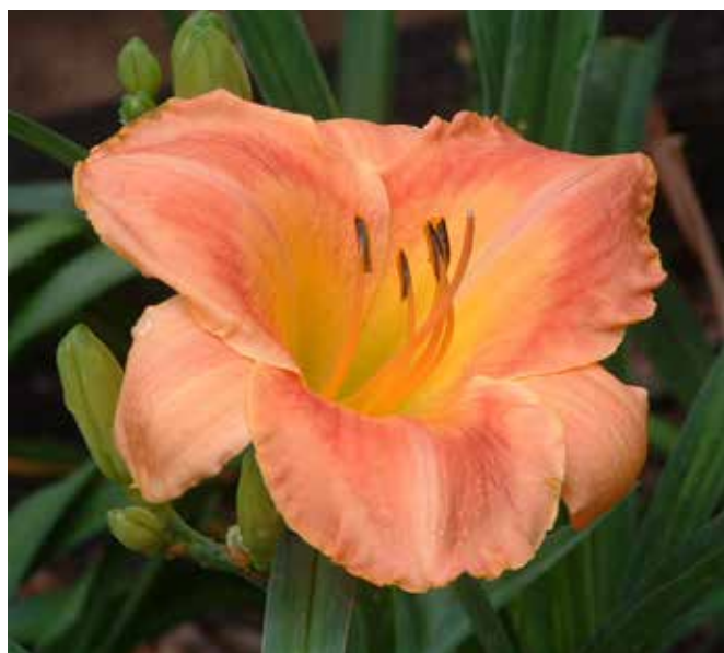
H. ‘Mayan Poppy’ (R. W. Munson, Jr. 1980)

low self, won an HM in 1988 and an AM in 1991. ‘Book-mark’ (1982), a 24", 5" pink beige self with a yellow green throat, won an HM in 1988. ‘Royal Saracen’ (1982), a 26", 6" light purple self with a cream chartreuse throat, won an HM in 1988. ‘China Lake’ (1982), a 28", 6" plum rose lilac with a cream throat, won an HM in 1989. ‘Merry Witch’ (1983), a 30", 6" rose with lighter eyezone and a lemon cream throat, won an HM in 1986. ‘Cherry Chapeau’ (1983), a 28", 5" rose red and pink bicolor with a lemon cream throat, won an HM in 1987. ‘Highland Lord’ (1983), a 22", 5" red wine double with a lemon throat, won an HM in 1985. ‘Time Lord’ (1983), a 30", 6" copper rose red with a lime gold throat, won an HM in 1986. ‘Panache’ (1983), a 22", 5" peach with plum