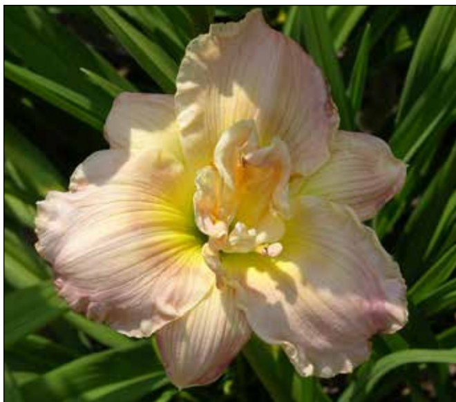
H. 'Almond Puff' (Stamile 1990)