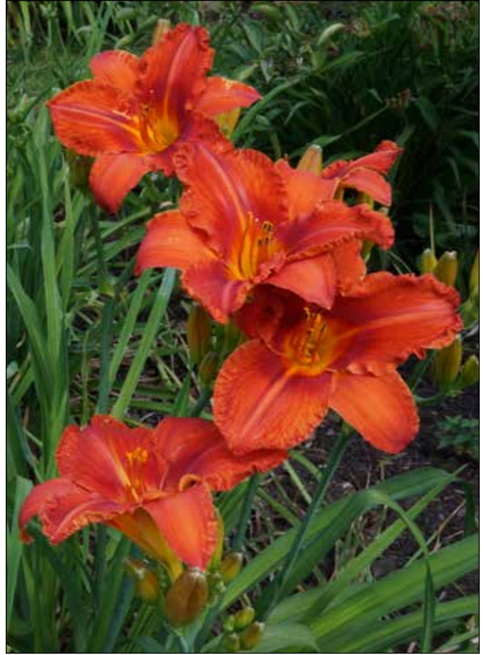
H. 'Alabama Jubilee' (Webster 1988)