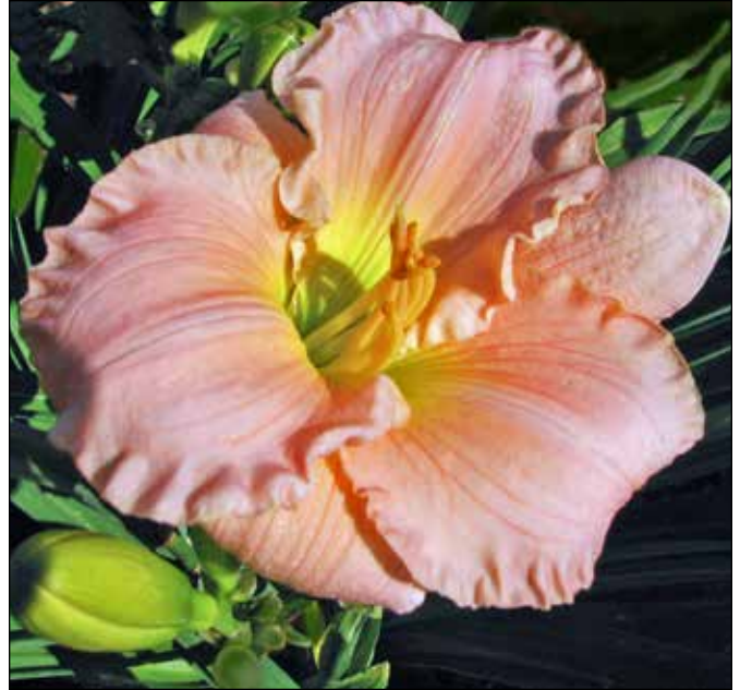
H. 'Jedi Brenda Spann' (Wedgeworth 1990)

er rose eyezone and green throat, it won an HM in 1997 and an AM in 2001. 'Jedi Brenda Spann' (1990), a 24", 6" pink self with a green throat, won an HM in 1997 and is still widely grown. Other cultivars included 'Jedi Tom Wilson' (1988), a 22", 6" copper and cinnamon peach blend with a green throat; 'Jedi Codie Wedgeworth' (1990), a 26", 6" lavender pink with maroon eyezone and green throat; and 'Jedi Tequila Sunrise' (1990), a 20", 5.5" green yellow with a maroon eyezone and a green throat. All three won HMs in 1997.