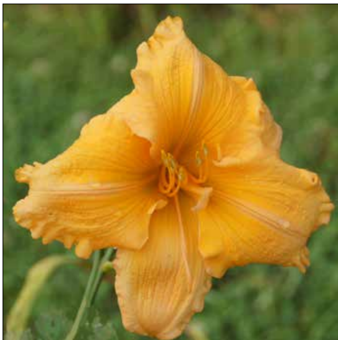
H. 'Orange Velvet' (Joiner 1988)