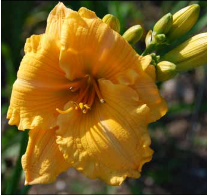
H. 'Golden Scroll' (Guidry 1983)

(1981), a 20", 6.5" cream self with a green throat, also won an HM in 1984. However, 'New Testament' (1981), an 18", 6" pink self with a green throat, remains overlooked. 'Antique Lace' (1983), a 26", 6.5" cream self with a green throat, won an HM in 1986. 'Golden Scroll' (1983), a 19", 5.5" tangerine self with a green throat, won an HM in 1985, an AM in 1989, and the LEP in 1989. 'Little Orange Drop' (1983), a 26", 5"