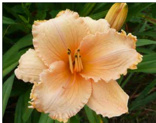
H. 'Decatur Piecrust' (Davidson 1982)