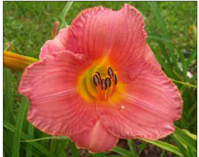
H. 'My Melinda' (Warner 1984)