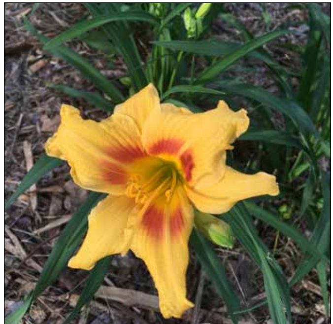
H. 'Black Eyed Stella' (Roberson 1989)