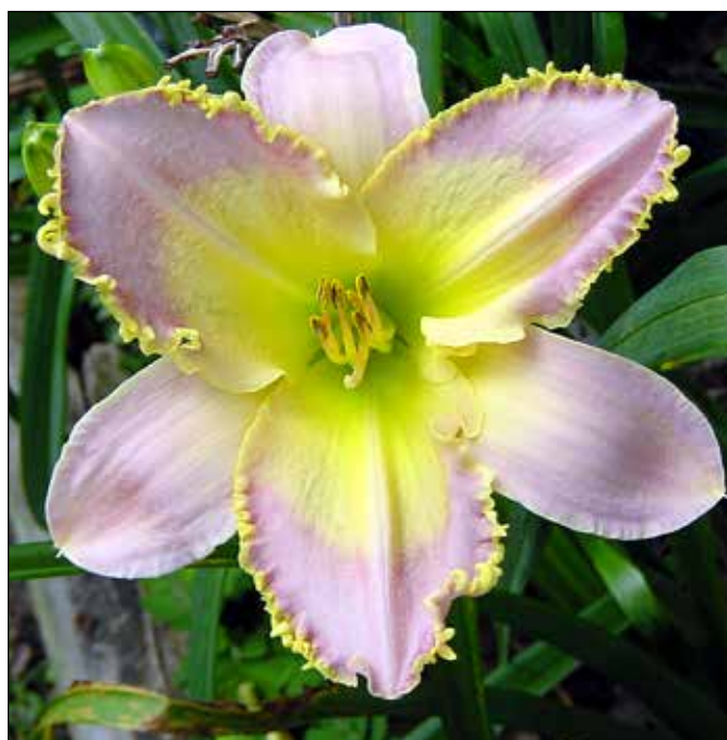
H. ‘ Magic Filigree ’ (Salter 1988)