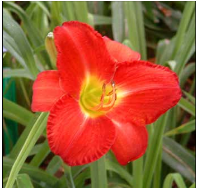
H. 'King Lamoni' (Roberson 1981)

between the late 1970s and mid 1990s, both diploids and tetraploids. For whatever reason, only one of his introductions has received an award. The diploid, H. 'Mormon' (1977), a 20", 8.5" near white self, won an HM in 1985. Although overlooked for awards, his tetraploid, 'King Lamoni' (1981), a 24", 5" scarlet self with a green throat, is still grown. He is perhaps best known for his diploid, H. 'Black Eyed Stella' (1989), a 13", 3.12" golden yellow with a dark red eyezone and a yellow gold throat. Though distributed commercially in thousands of plants, it has not been recognized for awards by the AHS.