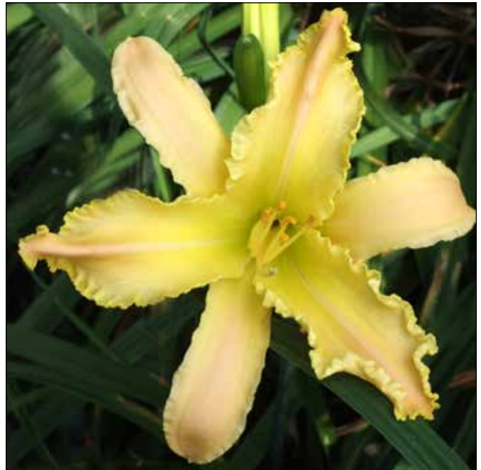
H. 'Techny Spider' (Reckamp-Klehm 1987)