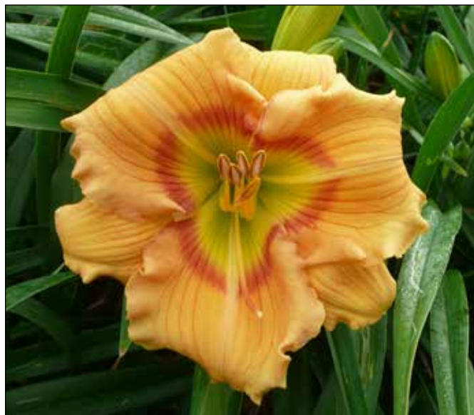
H. 'Pumpkin Kid' (Spalding 1987)