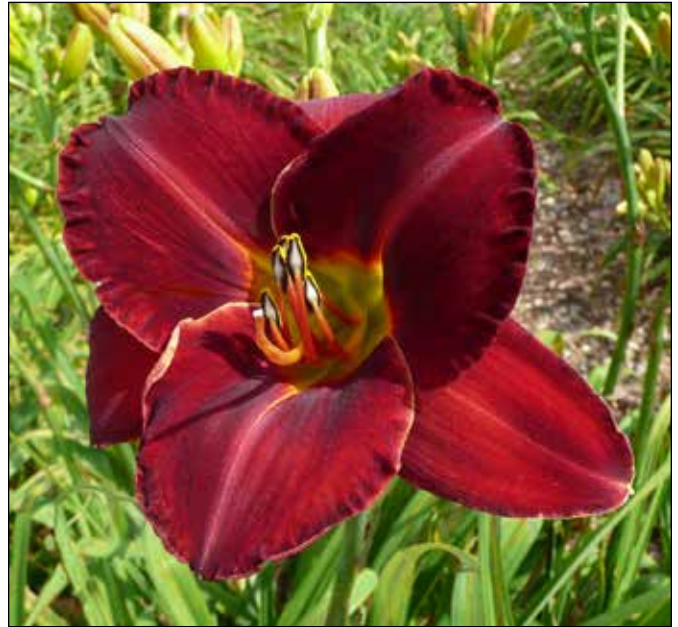
H. 'Illini Jackpot' (Varner 1981)

light orange beige blend with a green throat, won an HM in 1994. 'Illini Show Girl' (1984), a 32", 6" deep red self with a very green throat, won an HM in 1991.