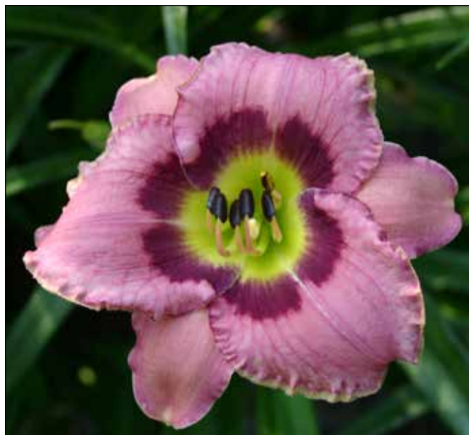
H. 'Always Afternoon' (Morss 1987)