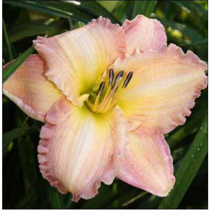
H. 'Princess Ellen' (Crochet 1983)

HM in 1989. 'Little Red Warbler' (1985), an 18" 3.5" dark red with a maroon eyezone and yellow green throat, won an HM in 1990; 'Pocket Change' (1985), an 18", 4.5" dark red with lighter red edges and a green throat, won an HM in 1993, and 'Candide' (1986), an 18", 3.5" rose salmon and pink blend with a fuchsia eyezone and chartreuse throat, won an HM in 1991. His unusual form crispate 'Pink Windmill' (1987), a 24", 6" spidery pink with a green throat, received an HM in 1994. One of his most famous diploids, 'Ellen Christine' (1987), a 23", 7" pink gold blend double with a dark green throat, won an HM in 1990, an AM in 1993, and the Ida Munson Award for doubles in 1994. His 'Olin Frazier' (1988), a 20", 5.5" double medium yellow self, won an HM in 1994, and