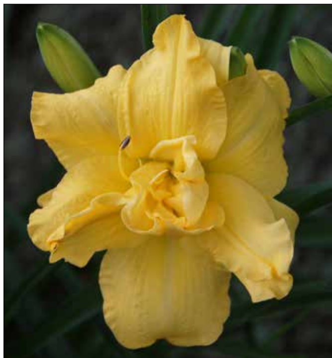
H. 'Rachael My Love' (Talbot 1983)

1987. 'Rachael My Love' (1983) an 18", 5" golden yellow double, won an HM in 1988 and an AM in 1991, having won the Ida Munson Award for doubles in 1989. 'Hamlet' (1984), an 18", 4" purple with a deep purple eyezone and a green throat, won an HM in 1987 and the JEM in 1988. 'Femme Fatale' (1985), a 21", 5" creamy tangerine with a purple eyezone and green throat, won an HM in 1985. 'Ra Hansen' (1986), a 28", 4.75" dark orchid lavender with variegated blue powder shading and a green throat, won an HM in 1990. 'Moonlight Orchid' (1986), a 28", 6.5" blue lavender with a light blue eyezone and green throat, won an HM in 2001. 'Vi Simmons'