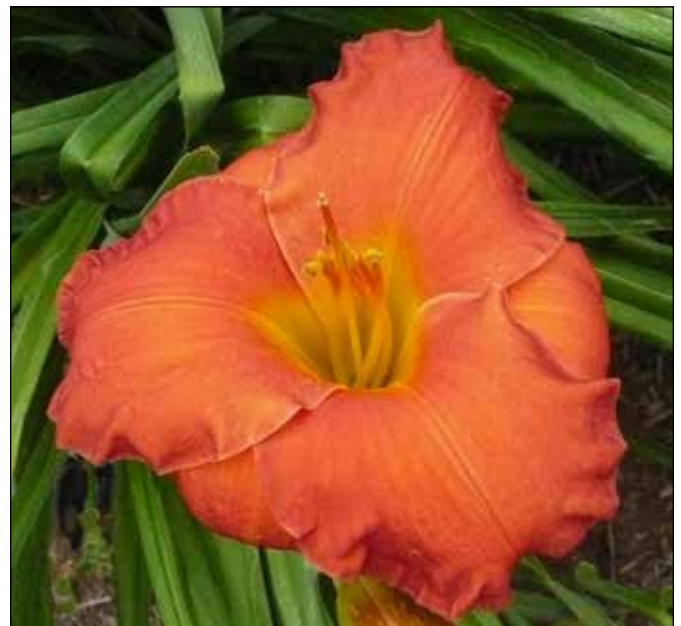
H. 'House of Orange' (Weston 1990)