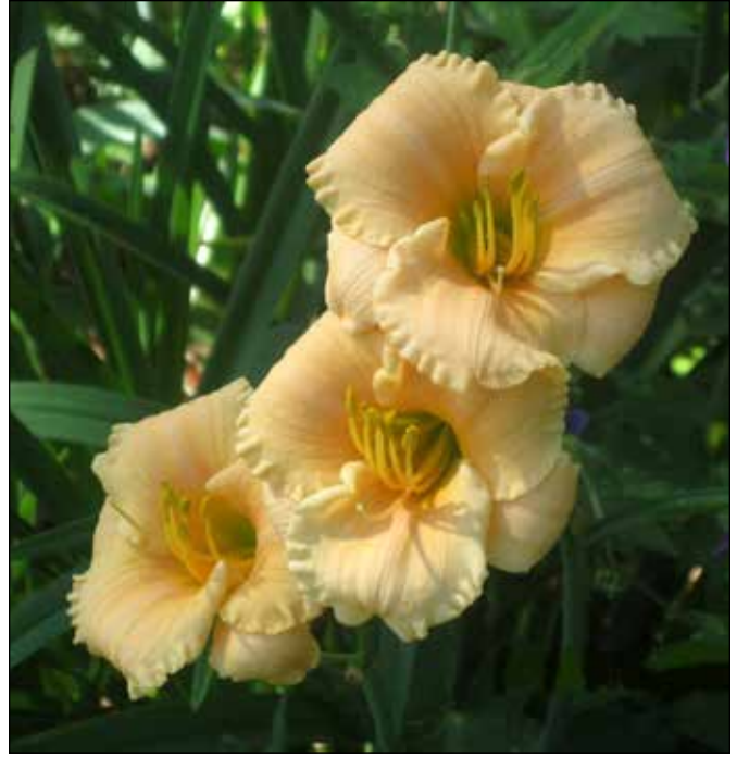
H. 'Moonlight Mist' (Hudson 1981)