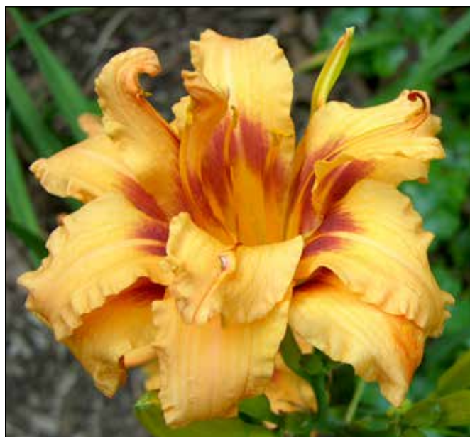
H. 'Carrot Crest' (Kropf 1990)