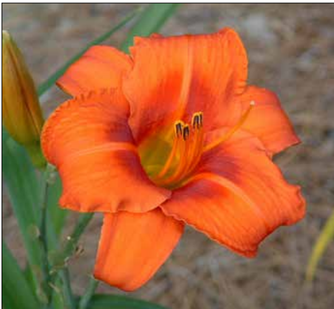
H. 'Mended Heart' (Sikes 1985)

glowing orange self with a green throat, which received an HM in 1987; 'Wounded Heart' (1985), a 26", 5.5" orange with scarlet blotch and green throat, which won an HM in 1991; 'Mended Heart' (1985), a 32", 4.6" light orange red with an