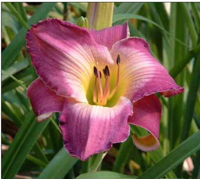
H. 'Nairobi Night' (R. W. Munson, Jr. 1983)

a chartreuse yellow throat, won an HM in 1993. 'Lexington Avenue' (1990), a 24", 6" wine with whitish wine eyezone and a greenish yellow throat, won an HM in 1995. These represent but a fraction of his award winners. Notable among his many cultivars which have not been recognized for awards is 'Nairobi Night' (1983), a 30", 6" purple with a large cream lavender eye above a yellow green throat, 'Nile Plum' (1984), a 20", 5" silvery mauve plum with plum claret eyezone and a yellow green throat, and 'Grand Palais' (1987), a 24", 6" silvery lilac lavender self with a lemon cream throat.