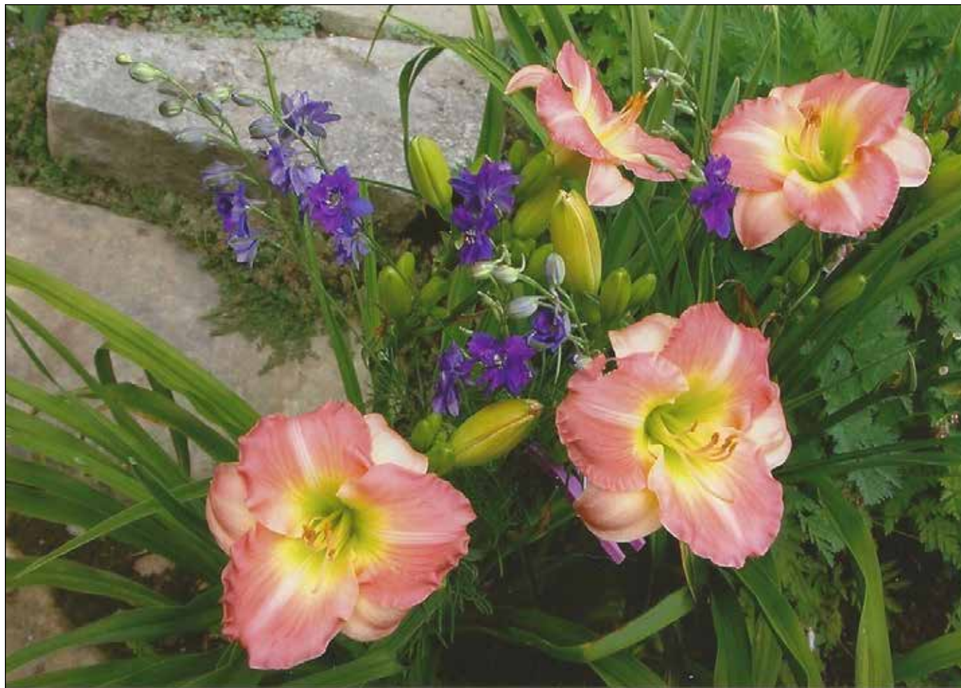
H. 'Pink Power' (Jablonski-Sharp 1989)