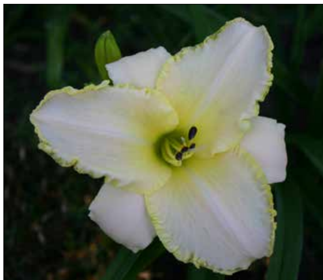
H. 'Wedding Band' (Stamile 1987)