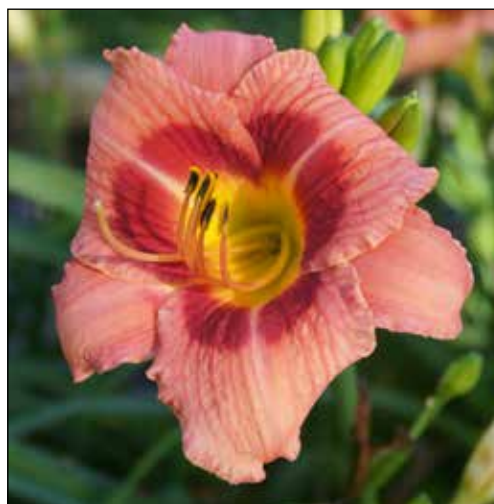
H. 'Decatur Cherry Smash' (Davidson 1981)

Clyde Davidson of Decatur, Georgia, continued registering his "Decatur" series of tetraploid daylilies into the 1980s. H. 'Decatur Cherry Smash' (1981), a 26", 4" medium pink with a cherry eyezone and a yellow green throat, won an HM in 1986. 'Decatur Double Dandy' (1981), a 32", 5" double medium red self with a yellow throat, however, remains overlooked. 'Decatur Piecrust' (1982), a 22", 5" salmon pink self, won an HM in 1985. 'Decatur Double Delight' (1983), a 26", 6.25" double light yellow self, remains overlooked.