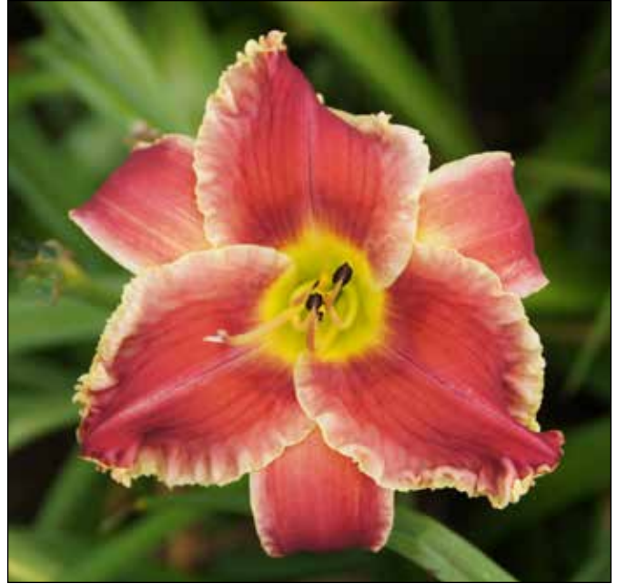
H. 'Startle' (Belden 1988)

Ron Rose of East Taunton, Massachusetts, registered only 4 cultivars. His diploid H. 'Blueberry Breakfast' (1988), a 22", 5" slate lavender with wide magenta purple midribs and a deep purple eyezone above a green throat, gained popularity and won an HM in 2002.