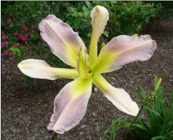
H. 'Cerulean Star' (Lambert 1982)