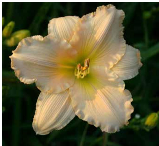
H. 'Fairy Tale Pink' (Pierce 1980)