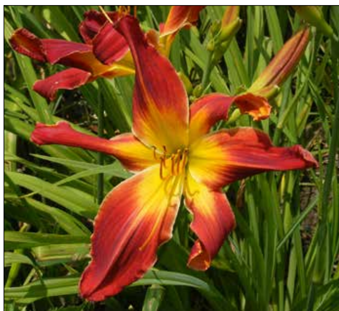
H. 'Tail Feathers' (McRae 1985)

a darker halo and a green yellow throat, and 'Tail Feathers' (1989), a 20", 7" tetraploid bright red and yellow spidery bicolor with a large green throat, both remain overlooked for an award.