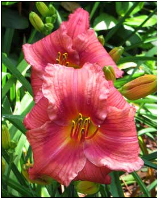
H. 'Gordon Biggs' (Crochet 1981)

HM in 1989. 'Little Red Warbler' (1985), an 18" 3.5" dark red with a maroon eyezone and yellow green throat, won an HM in 1990; 'Pocket Change' (1985), an 18", 4.5" dark red with lighter red edges and a green throat, won an HM in 1993, and 'Candide' (1986), an 18", 3.5" rose salmon and pink blend with a fuchsia eyezone and chartreuse throat, won an HM in 1991. His unusual form crispate 'Pink Windmill' (1987), a 24", 6" spidery pink with a green throat, received an HM in 1994. One of his most famous diploids, 'Ellen Christine' (1987), a 23", 7" pink gold blend double with a dark green throat, won an HM in 1990, an AM in 1993, and the Ida Munson Award for doubles in 1994. His 'Olin Frazier' (1988), a 20", 5.5" double medium yellow self, won an HM in 1994, and