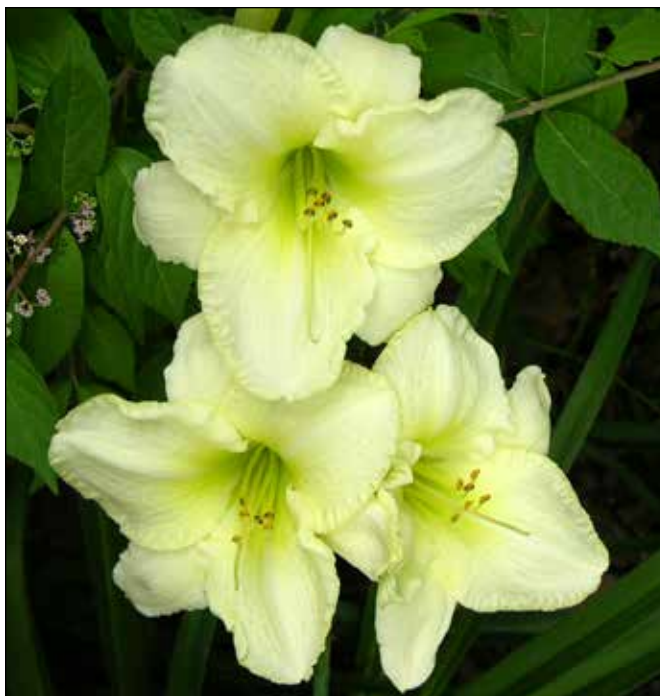
H. 'Lime Frost' (Stamile 1990)