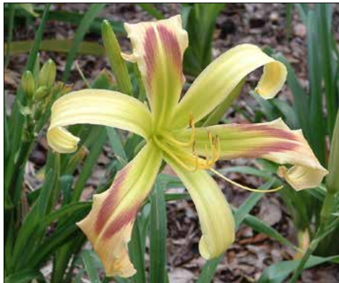
H. 'Mountain Top Experience' (Temple 1988)