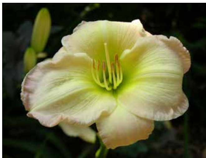
H. ' Raining Violets ' (Wild 1983)