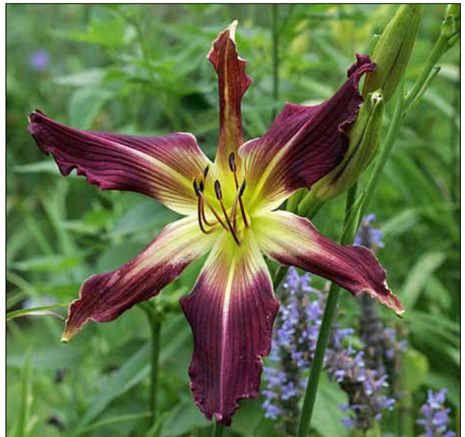
H. 'Vampire Lestat' (Lambert-Whitacre 1990)