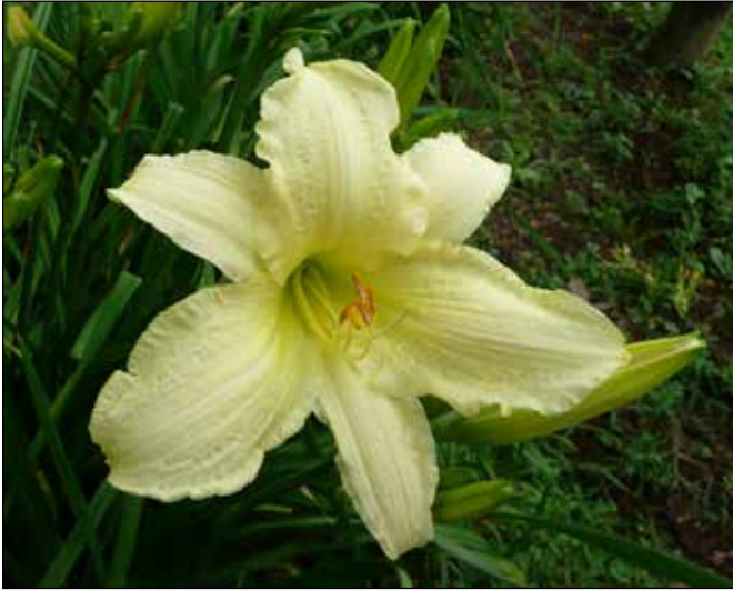
H. 'Ghost Fingers' (Nelson 1980)