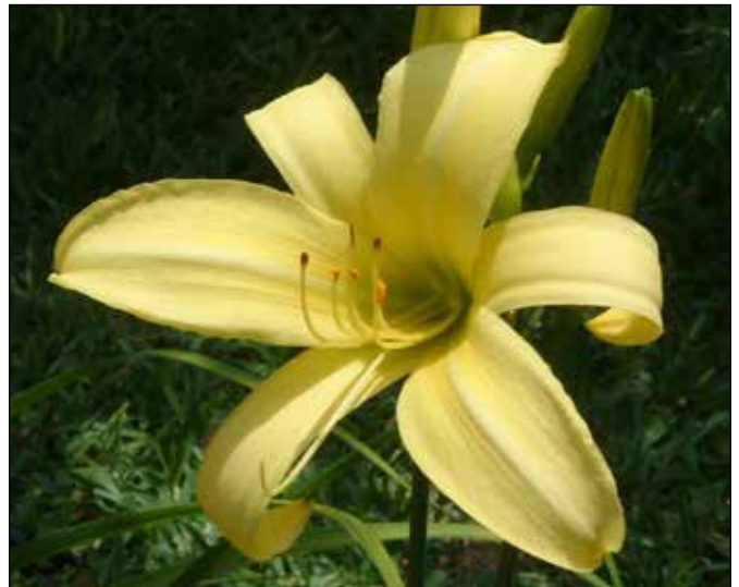
H. 'Green Dolphin Street' (Sanford Roberts 1986)

Sanford Roberts of Blossom Valley Garden in El Cajon, California, is credited with 23 registrations. H. 'Cortez Cove' (1983), a 28", 4" greenish yellow tetraploid with a green throat, won an HM in 1988. 'Green Dolphin Street' (1986), a 28", 7.5" green yellow spider-type tetraploid with a green throat won an HM in 1993.