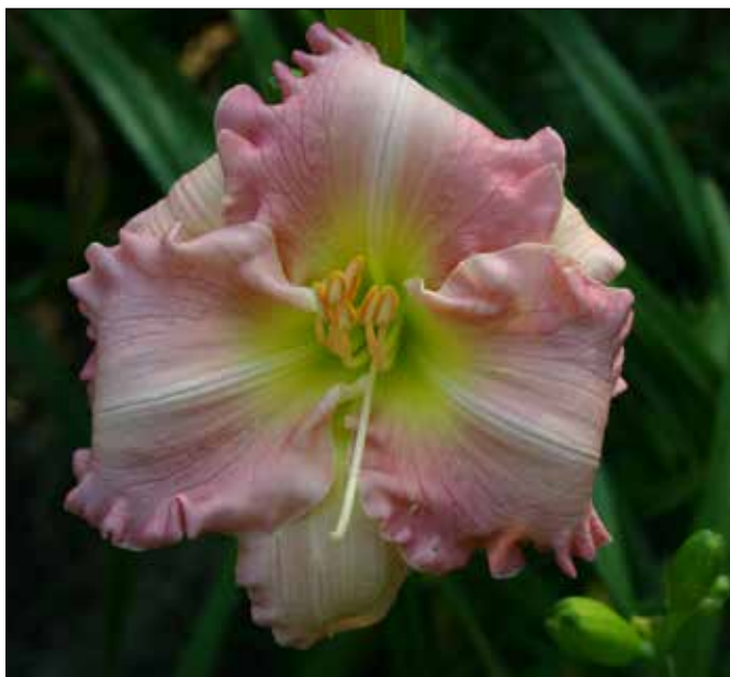
H. 'Neal Berrey' (Sikes 1985)