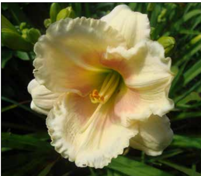
H. 'Today's Charm' (Sellers 1986)

(1986), a 26", 4" pale pink diploid with a pink halo and green throat, won an HM in 1993, and a diploid double, 'Red Explosion' (1986), a 26", 5.5" red with a yellow green throat, won an HM in 1994. Two of his most honored diploids were 'Exotic Echo' (1984), a 16", 3" pink cream blend double with a burgundy eye and a green throat, which won an HM in 1989, the Annie T. Giles Award for small flowers in 1994, and an AM in 1994, and 'Big Apple' (1986), a 26", 5" cerise red self with a green throat, which won an HM in 1989 and an AM in 1992.