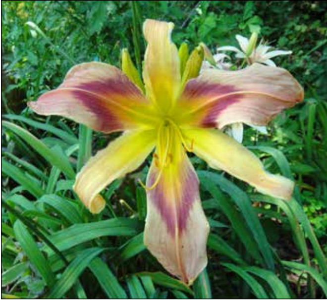
H. 'Pat Thornton' (Glidden 1988)

1990s. H. 'Startle' (1988), a 26", 5" red bitone with a cream halo and a green throat, achieved popularity and won an HM in 1999.