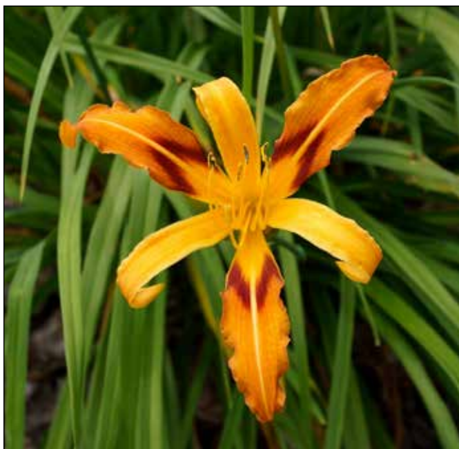
H. 'Twiggy' (Dickerson 1990)

18", 4" orange with a wine eyezone above a green throat and a spider ratio of 6.30:1. A tetraploid, 'Guinea Jubilee' (1990), a 30", 9" wine spider-type with a large gold eyezone and a green throat, has received no awards as well. In all, Dickinson registered a total of 134 cultivars.