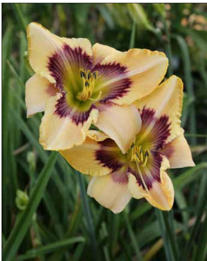
H. 'Witch Stitchery' (Morss 1986)