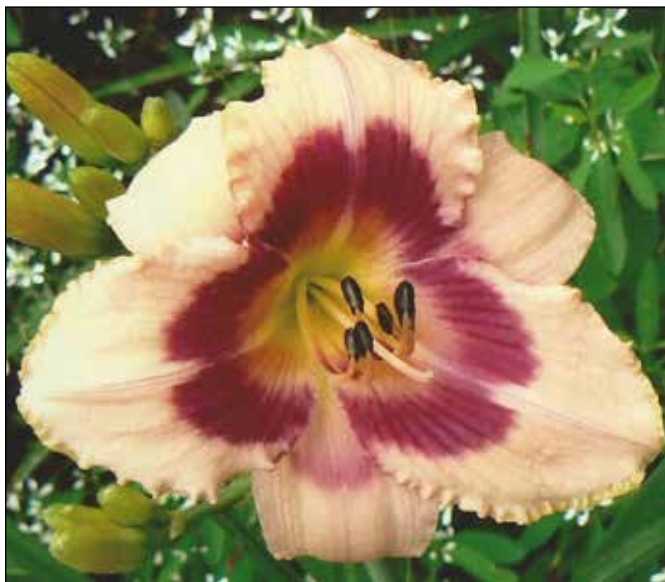
H. 'Wineberry Candy' (Stamile 1990)