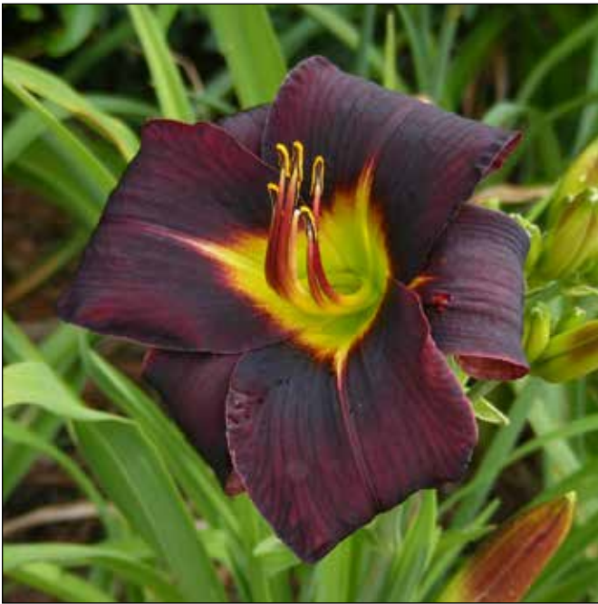
H. 'Black Velvet Elvis' (Glidden 1988)