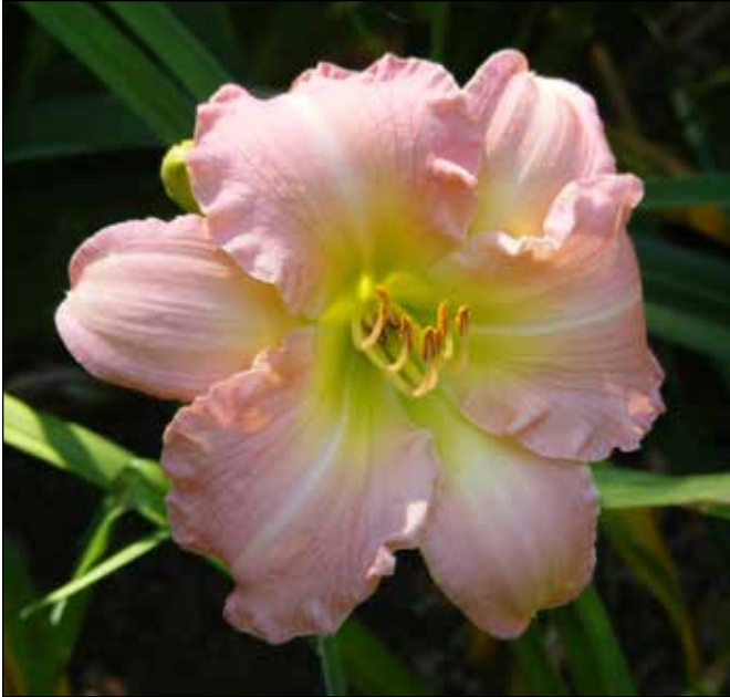
H. 'Vi Simmons' (Talbot 1987)