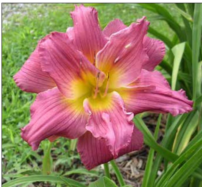
H. 'Amethyst Art' (Kropf 1982)