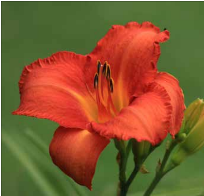
H. 'Hot Ember' (Stamile 1986)