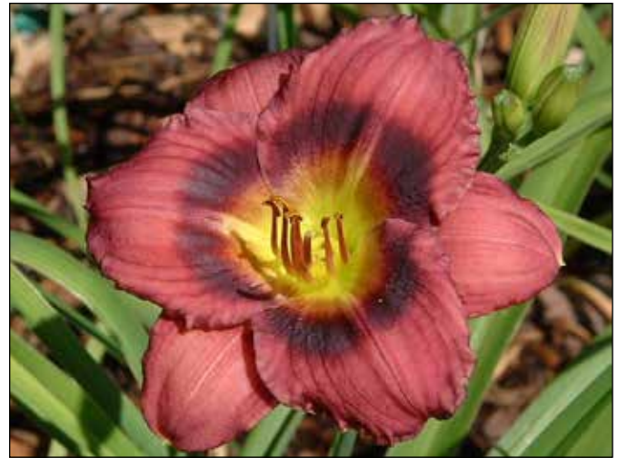
H. 'Gypsy Grapette' (Cruse 1986)