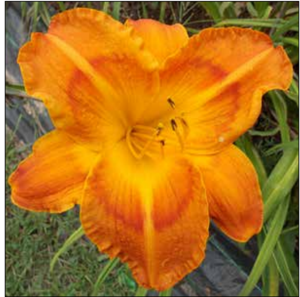
H. 'Jambalaya' (Soules 1981)

a 21", 4" pink, orange, and lavender blend with a purple eyezone and a green throat, won an HM in 1986. Two additional diploids also received honors: 'Royal Charm' (1988), a 16", 3.37" Egyptian buff edged wine grape with a wine grape halo and a lime green throat, won an HM in 1994; and 'Porcelain Ruffles' (1990), a 23", 5.5" ivory with pink overlay and a chartruse throat, won an HM in 1996. Another popular diploid, 'Inca Toy' (1990), a 20", 3.25" yellow cream blend edged rosy mahogany with a yellow green throat, remains overlooked, as does 'Swingin' Miss' (1990), a 22", 3.25" rose red diploid with white midribs and yellow throat.