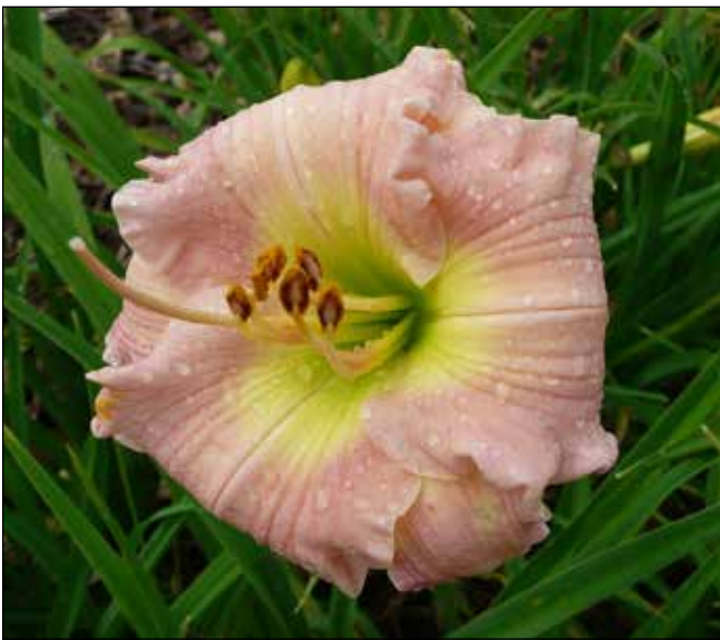
H. 'From Morning Dews' (Billingslea 1990)

also won an HM in 1994. 'Michelangelo's David' (1990), a 21", 5.5" cream white with pink glow and a green throat, won an HM in 1995. 'From Morning Dews' (1990), a 22", 5" clear light pink self with a green throat, won an HM in 1997. 'Lights of Evening' (1990), a 25", 6" pale creamy yellow self with a green throat, won an HM in 1998. 'What Wondrous Love' (1990), a 24", 6" pink with a rose eyezone and green throat, won an HM in 1998. 'Mulberry Frost' (1990), a 20", 6" rose mulberry blend with a silvery blush and green throat, was popular, but was overlooked for awards. 'Rhythm in Pink' (1990, a 26", 6" veined light rose pink with a green throat, was also much admired, but overlooked for awards. As of the present, Oliver Billingslea has registered a total of 59 cultivars, for which he received 18 HMs, including the Presi-