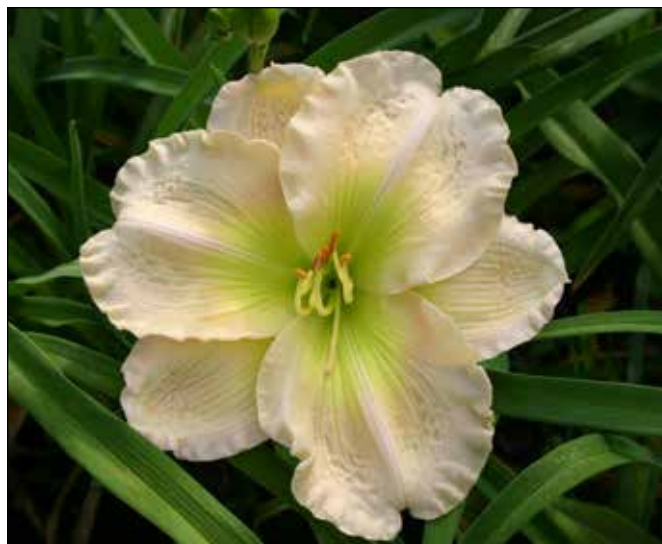
H. 'In Pastures Green' (Billingslea 1990)