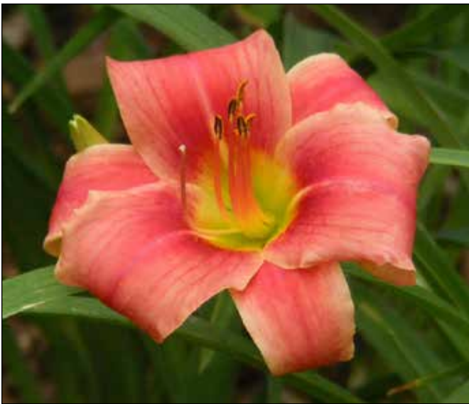
H. 'Gypsy Bridesmaid' (J. L. Cruse, Jr. 1981)

J. L. Cruse, Jr. from Woodville, Texas, registered a couple hundred cultivars, most of them small flowers or miniatures. Many carried the prefix "Gypsy" or "Little." H. 'Gypsy McCrone' (1981), a 17", 2.62" beige and tan blend with a cream green throat, won an HM in 1986. 'Gypsy Bridesmaid' (1981), a 20", 3.5" rose edged white with a green throat, however, remains overlooked, as does 'Gypsy Cranberry' (1981), a 16", 3.5" cranberry red self with a green throat, and 'Gypsy Dark Eyes' (1983), a 26", 5" peach with a black purple eyezone and a green throat. 'Little Red Dazzler' (1986), a 20",