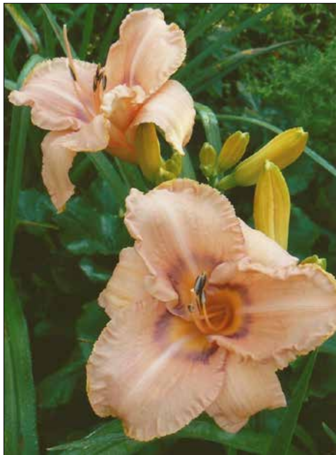
H. 'Penny Arcade' (Sellers 1989)

Yet another diploid from the Eighties, 'Vegas Lights' (1989) a 20", 6" bright red blend with a dark red eyezone and a yellow throat, won an HM in 1994. Three more of his tetraploids also received honors, including 'Second Glance' (1984), a 28", 6" persimmon blend with a green throat, which won an HM in 1988; 'Prince Redbird' (1986), a 26", 3.5" red self with a green throat, which won an HM in 1993; and 'Penny Arcade' (1989), a 26", 5" orange apricot blend with a purple eyezone and a flaming orange throat, which won an HM in 1996. 'Early Look' (1989), a 28", 5.5" pink blend with a yellow green throat, however, remains overlooked. In all, Van Sellers is credited with 324 registrations. He was honored with the Bertrand Farr Silver Medal in 1987.