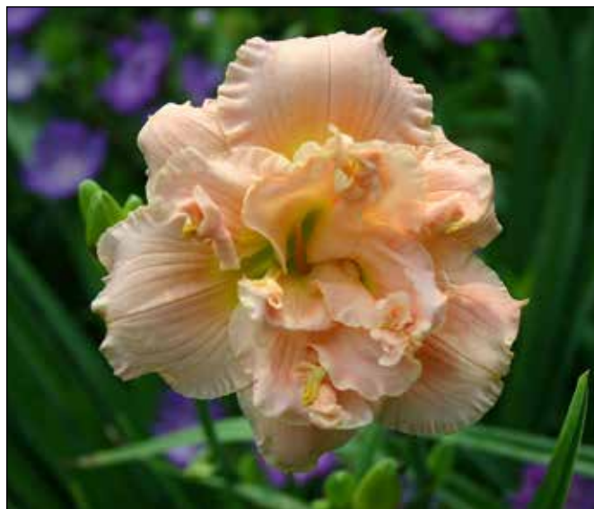
H. 'Siloam Double Classic' (Henry)