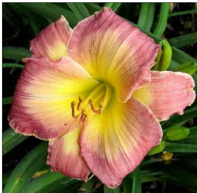
H. 'Kurumba' (Weston 1985)

green throat, won an HM in 1985. It was hybridized while Judith still lived in Detroit. A small-flowered tetraploid, 'Pygmy Paramour' (1984), a 17", 3.5" medium pink self with a