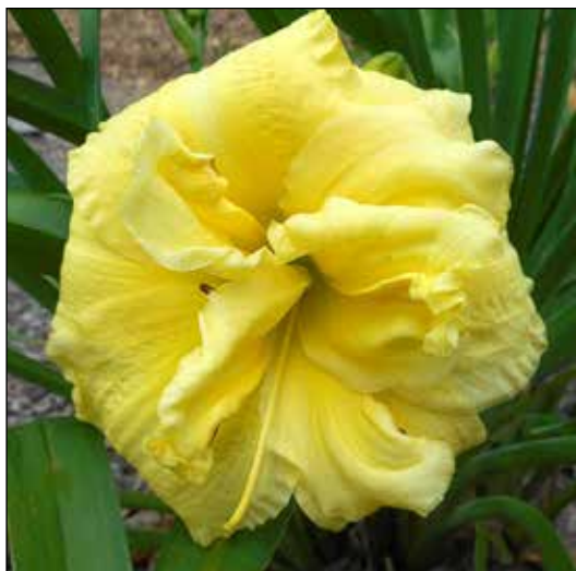
H. 'Cabbage Flower' (Kirchhoff 1984)