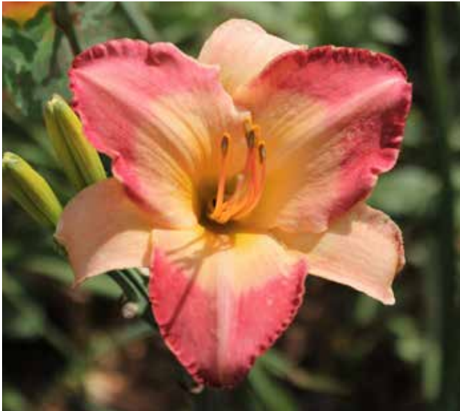
H. 'Cherry Chapeau' (R. W. Munson, Jr. 1983)

purple eyezone and a peach orange throat, won an HM in 1987. 'Sovereign Queen' (1983), a 30", 6" bluish lavender self with a cream throat, won an HM in 2003. 'Apollodorus' (1984), a 28", 4.5" violet purple self with a cream yellow throat, won an HM in 1987. 'Nivia Guest' (1984), a 24", 5" purple self with a yellow green throat, won an HM in 1993. 'Cameroons' (1984), a 28", 5" claret self with a yellow green throat, won an HM somewhat belatedly in 2000. 'Beijing' (1986), a 24", 5" pale flesh self with a cream yellow throat, won an HM in 1990. 'Borgia Queen' (1986), a 26", 5" silver lavender mauve with a slate blue eyezone and a cream chartreuse throat, also won an HM in 1990. 'Emperor Butterfly' (1986), a 28", 5" violet orchid mauve blend with a yellow violet eyezone and a yellow green throat, won an HM in 1993. 'Ruffled Dude' (1986),