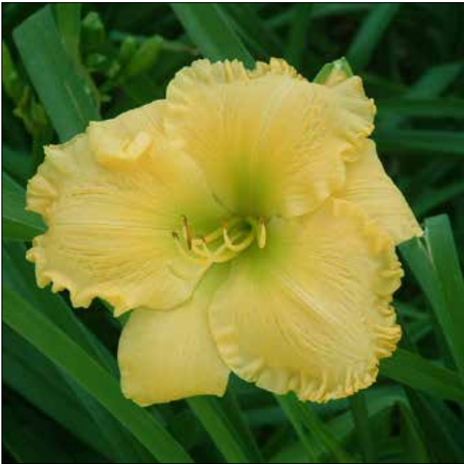
H. 'Alec Allen' (Kate Carpenter 1982)

with an olive green throat, in 1984; 'Vision of Beauty' (1985), a 21", 6" very light pink with a lavender pink halo and green throat, in 1990; and 'Unique Style' (1985), a 21", 3.25" yellow edged rose amber and greenish yellow bicolor with a large green throat, in 1992. Kate Carpenter was awarded the Bertrand Farr Silver Medal in 1994.