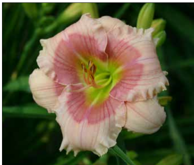
H. 'Janice Brown' (E. C. Brown 1986)

throat, won an HM in 1987. 'Radiant Eyes' (1984), a 24", 4.5" clear light yellow with a vibrant cherry red eyezone and a yellow green throat, won an HM in 1987. 'Ruffled Carousel' (1985), a 23", 3.75" cream with apricot penciled eye and a yellow green throat, won an HM in 1988. 'Janice Brown' (1986), a 21", 4.25" bright pink with a rose pink eyezone and a green throat, became his most celebrated cultivar. It won an HM in 1989, the Annie T. Giles Award in 1990 for small flowers, the Don C. Stevens Award in 1990 for the most outstanding eyed or banded daylily, the AM in 1992, and the Stout Silver Medal in 1994. 'Coral Masterpiece' (1986), a 25", 5.25" coral peach with apricot orange eyezone and a yellow green throat, won an HM in 1990. 'Wendy Glawson' (1986), a 19", 5" cream white self with a green throat, won an HM in 1991. 'Radiant Ruffles' (1987), a 24", 4.75" cream with a red