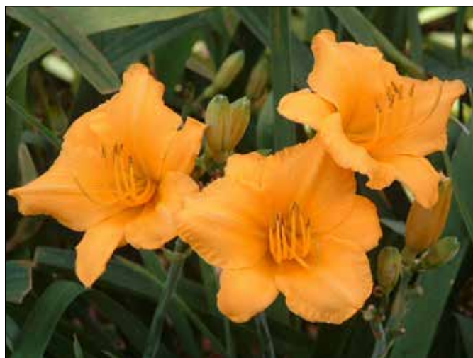
H. 'Little Orange Tex' (Faggard 1985)