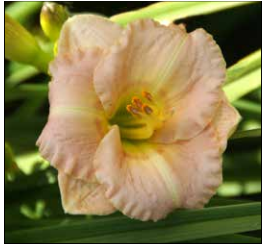
H. 'Cowrie Flower' (Weston 1988)

administrator for the Detroit Institute of Arts, which housed a fine collection of African artifacts. Her diploid, 'Bologongo' (1986), a 16", 5.5" Chinese red self with a yellow green throat, named for a 15th-century African king, won an HM in 1991. 'Bubbling Brown Sugar' (1987), a 27", 5.5" yellow edged cinnamon tetraploid with a brown eyezone and green yellow throat, won an HM in 1992. 'Cowrie Flower' (1988), a 16",