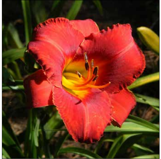
H. 'Amadeus' (Kirchhoff 1981)