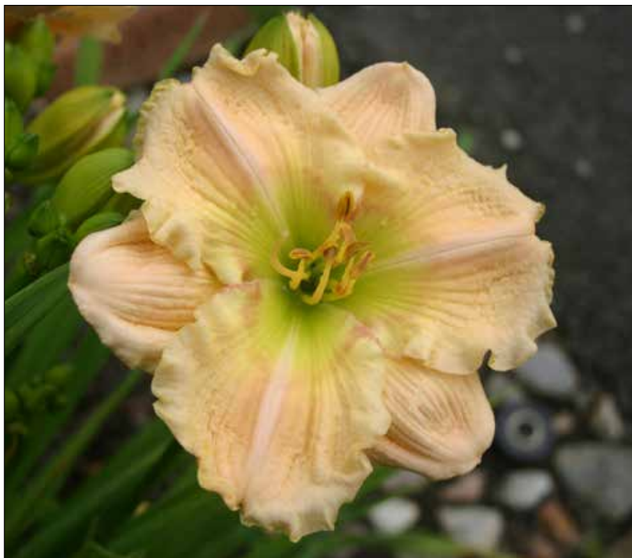
H. 'Elsie Spalding' (Spalding 1985)