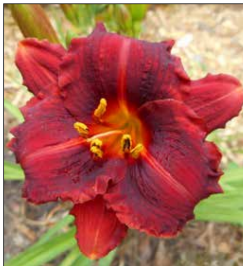
H. 'Little Christine' (Croker 1987)

yellow self with a green throat, won an HM in 1991. However, 'Voices of Spring' (1986), a 22", 4.25" tetraploid medium rose pink self with a yellow green throat, remains overlooked.