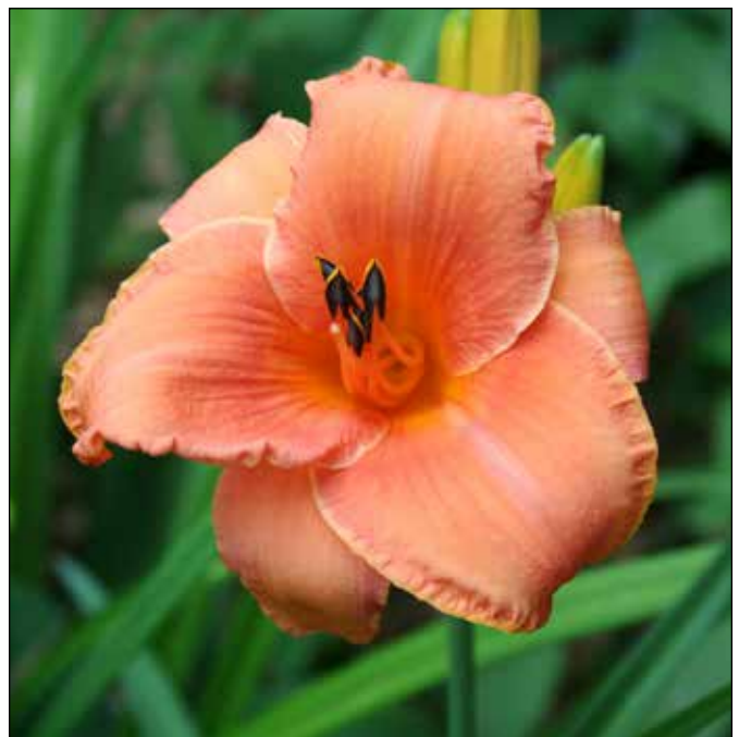
H. 'Hawaiian Party Dress' (Soules 1982)