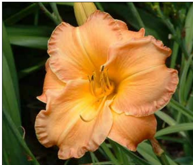
H. 'Clay Basket' (Ford 1989)