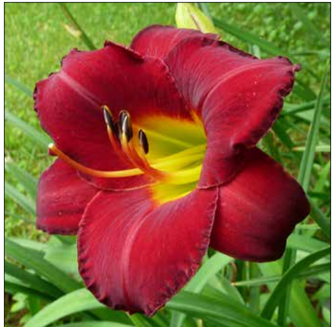
H. 'Study in Scarlet' (Kirchhoff 1985)

and the Eugene S. Foster Award in 1995. 'Ming Porcelain' (1981), a 28", 5.25" pastel ivory pink touched peach and edged in gold with a wide yellow halo and a lime green throat, won an HM in 1985, an AM in 1989, and the Lenington All-American Award in 2001. Still another tetraploid, 'Bittersweet Holiday' (1981), a 23", 5.5" red, copper and burnt orange blend with a wide yellow halo and green throat, won an HM in 1986. 'Amadeus' (1981), a 26", 5.5" scarlet tetraploid with a yellow green throat, the result of David's treatment of the Wiese diploid, also won an HM in 1986. 'Study in Scarlet' (1985), a 28", 5" blood red self with a green throat, won an HM in 1990. 'Vintage Bordeaux' (1986), a 27", 5.75" black cherry