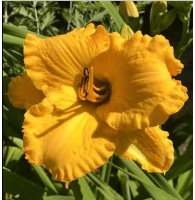
H. 'Jerusalem' (Stevens-Seawright 1985)