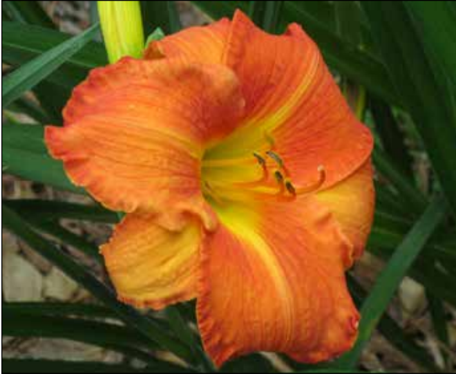
H. 'Old Tangiers' (Millikan 1985)