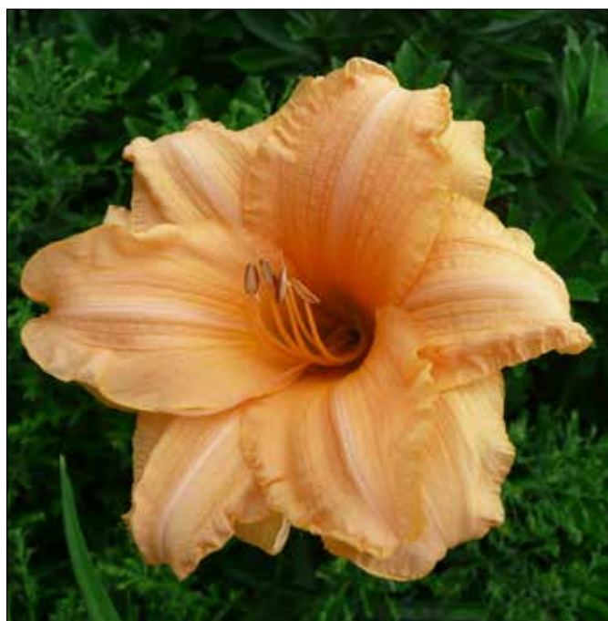
H. 'Zella Virginia' (Kropf 1982)