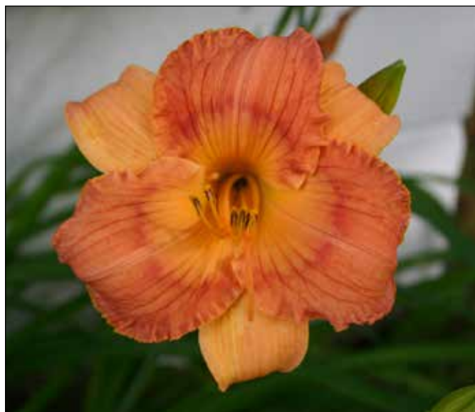
H. 'Brand New Lover' (Brooks 1987)

HM in 1994. Still another diploid, 'Mae West' (1990), a 20", 7.25" shrimp rose reverse bitone with a green throat, won an HM in 1995. 'Jump Start' (1990), a 19", 5.5" red tetraploid edged white with a yellow green throat, won an HM in 1996.