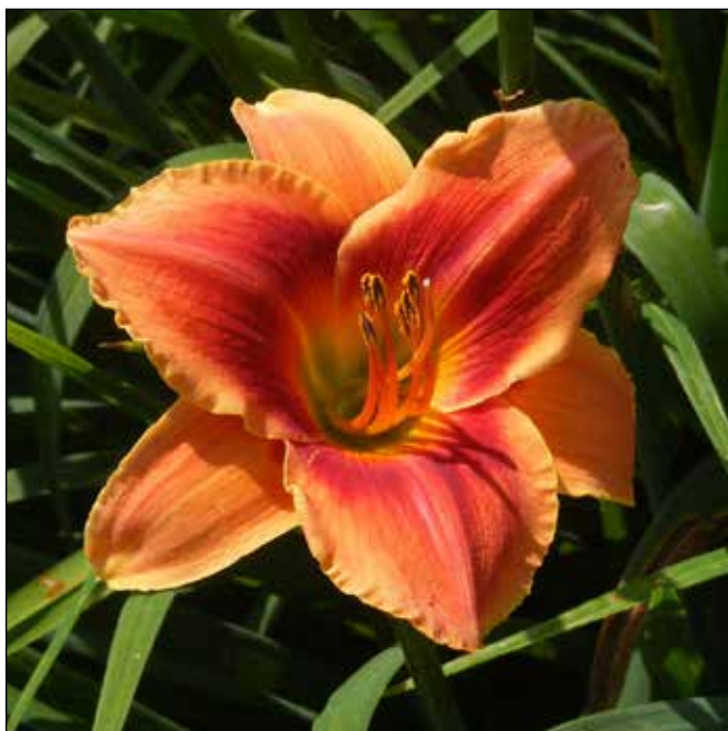
H. 'Avante Garde' (Moldovan 1986)