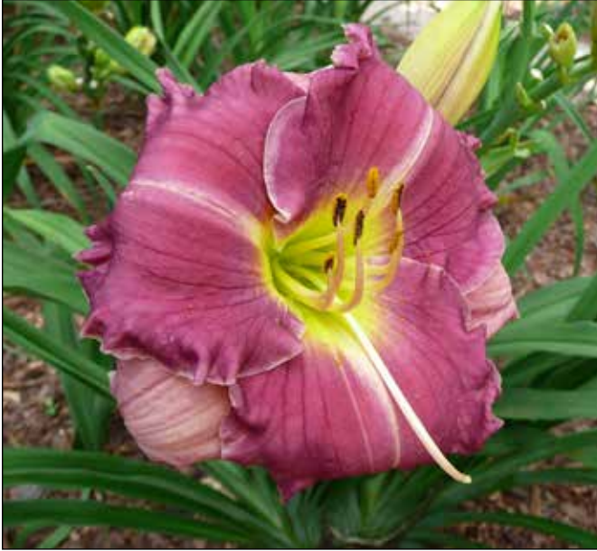
H. 'Lois Hall' (Tarrant 1987)

with a spider ratio of 5.10:1, is still popular today. It won an HM in 1993 and the Harris Olson Spider Award in 2001. Another diploid, 'Lois Hall' (1987), a 22", 5.5" violet purple and light lavender bitone with narrow white midribs and a green throat, won an HM in 1993. 'Mother's Love' (1987), a 24", 5.5" light soft pink self diploid with a green throat, won an HM in 1994. A fourth diploid, 'Cinnamon Bear' (1988), a 21", 5" cinnamon blend with a green throat, won an HM in 1994.