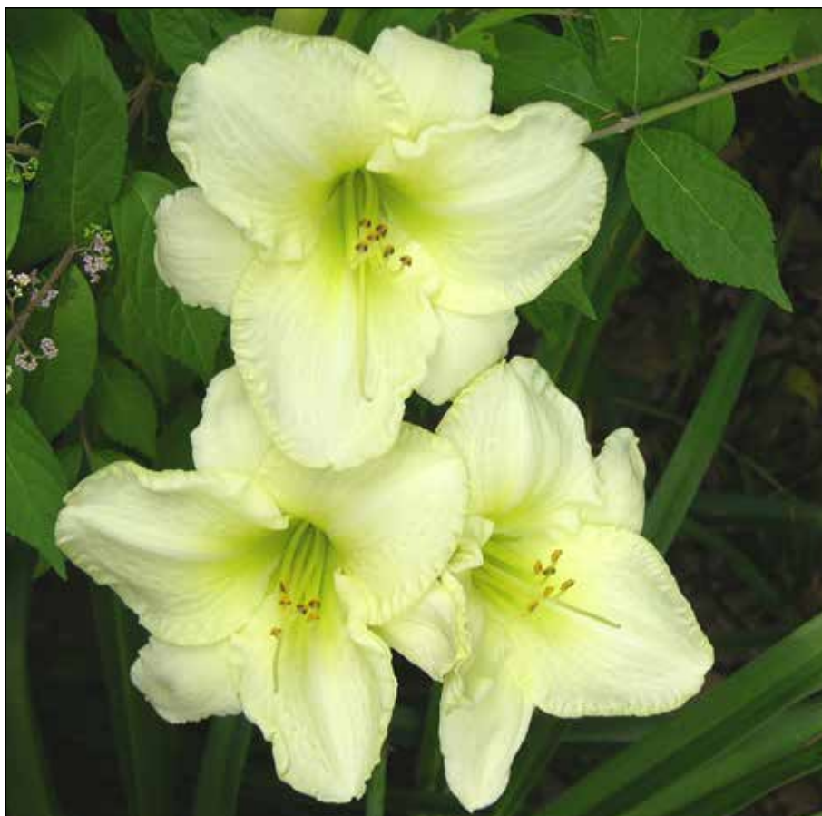
H. 'Lime Frost' (Stamile 1990)