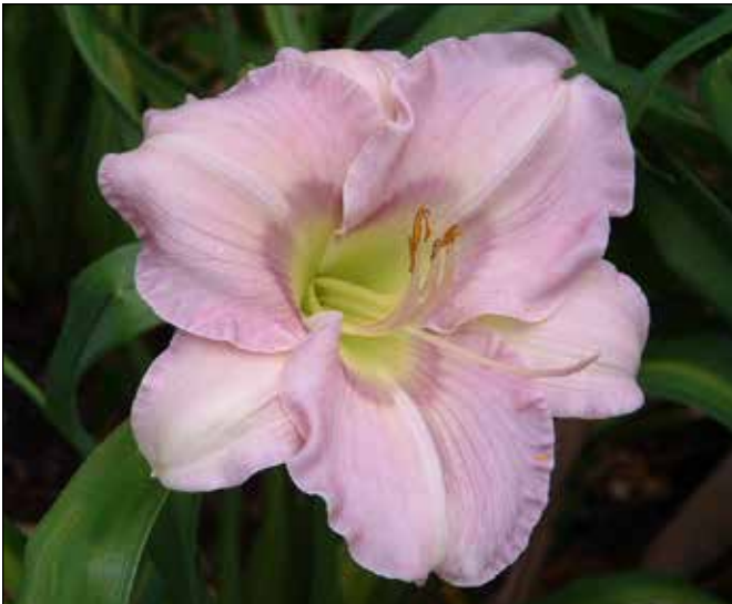
H. 'Lavender Layette' (Spalding 1988)