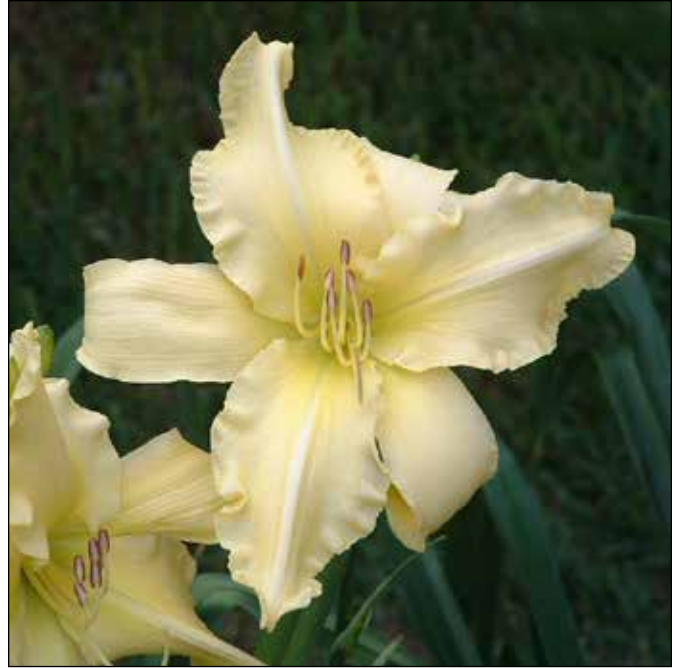
H. 'Twirling Skirt' (Carpenter-Glidden 1984) (Photo by Rich Rosen)