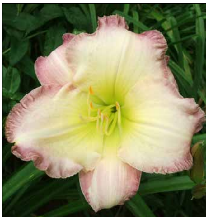
H. 'Seal of Approval' (Santa Lucia 1990)