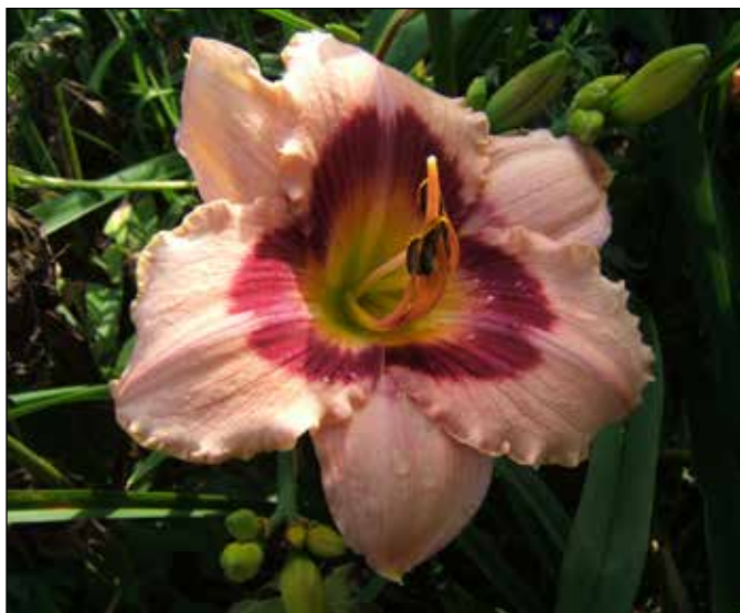
H. 'Wineberry Candy' (Stamile 1989)