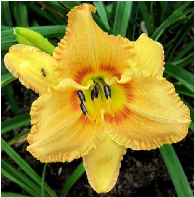
H. 'Bubbling Brown Sugar' (Weston 1987)

administrator for the Detroit Institute of Arts, which housed a fine collection of African artifacts. Her diploid, 'Bologongo' (1986), a 16", 5.5" Chinese red self with a yellow green throat, named for a 15th-century African king, won an HM in 1991. 'Bubbling Brown Sugar' (1987), a 27", 5.5" yellow edged cinnamon tetraploid with a brown eyezone and green yellow throat, won an HM in 1992. 'Cowrie Flower' (1988), a 16",