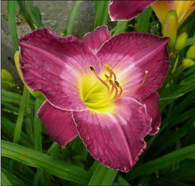
H. 'Tuxedo Moon' (Hanson 1989)