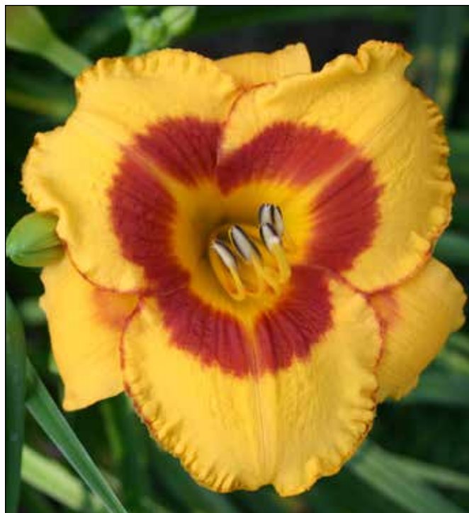
H. 'Fooled Me' (Reilly-Hein 1990)