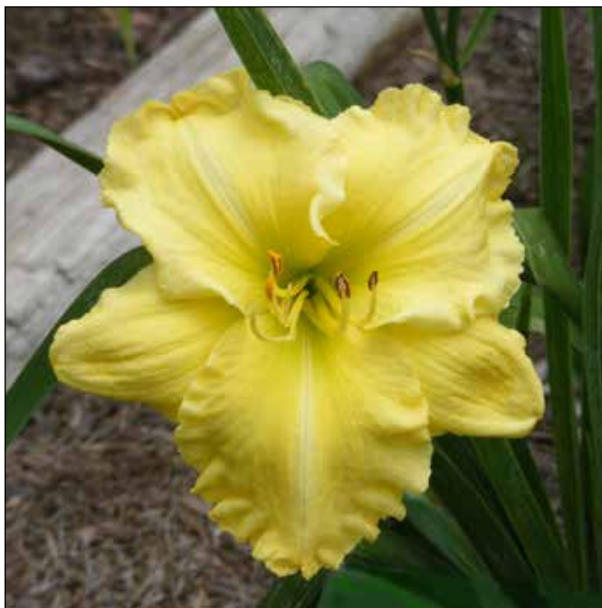
H. 'Ruffled Perfection' (J. Carpenter 1989)