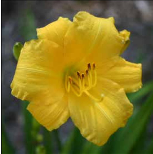
H. 'Yellow Lollipop' (Crochet 1980)