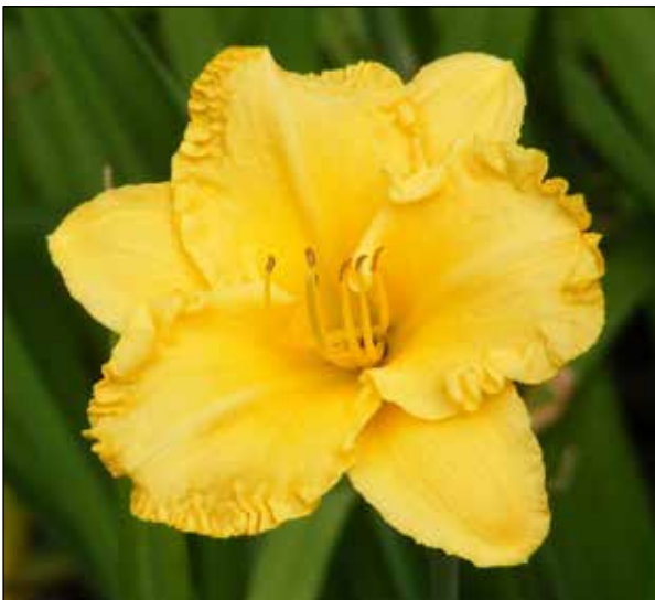
H. 'Butterfly Ballet' (Dunbar 1983)

Charles Dunbar of Mendocino, California, is credited with 17 registrations, although none received an award from the AHS. H. 'Mountain Lilac' (1983), a 26", 5.5" lilac lavender self with a cream green throat, was nonetheless popular, as was 'Butterfly Ballet' (1983), a 28", 4" gold self with a green throat, and 'Butterfly Charm' (1984), an 18", 4" butter yellow with a green throat.