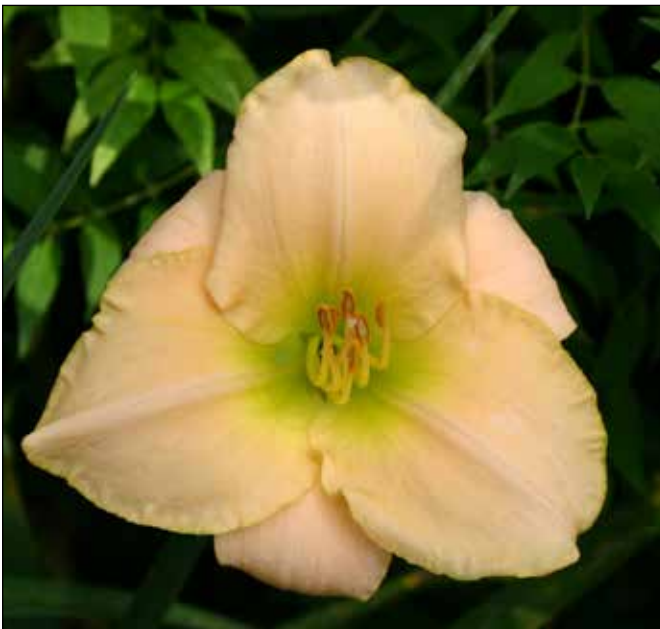
H. 'Ming Porcelain' (Kirchhoff 1981)