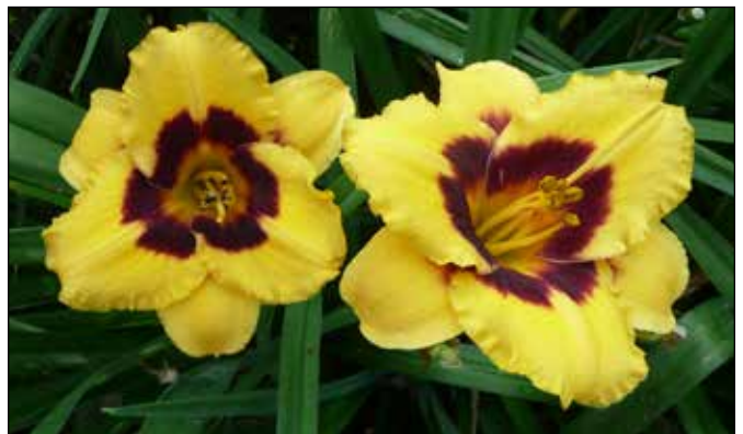
H. 'Blackberry Candy' (Stamile 1989)