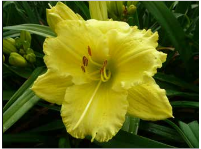
H. 'Floyd Cove' (Stamile 1987)