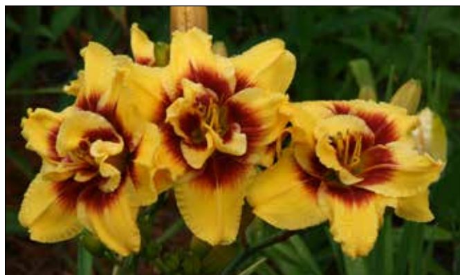
H. 'Mount Helena' (Grooms 1985)