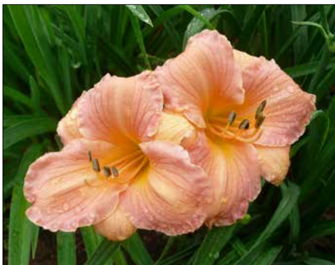
H. 'Little Rosy Cloud' (Elna Winniford 1986)