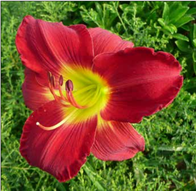
H. 'Scarlet Orbit' (Lee Gates 1984)

'Indecent' (1986), a 20", 6.5" tetraploid double, a lavender and cream blend with a chalky chartreuse throat, also received an HM in 1991 and an AM in 1995. It was the winner of the Ida Munson Award in 1995. Several other tetraploids were honored with both HMs and AMs: 'Seducator' (1983), an 18", 6" apple red self with a green throat, won an HM in 1986 and an AM in 1990; 'Scarlet Orbit' (1984), a 22", 6" red self with a chartreuse throat, won an HM in 1987 and an AM in 1991; and 'Superlative' (1986), a 24", 6" dark red tetraploid with darker eyezone and green throat, received an HM in 1992 and