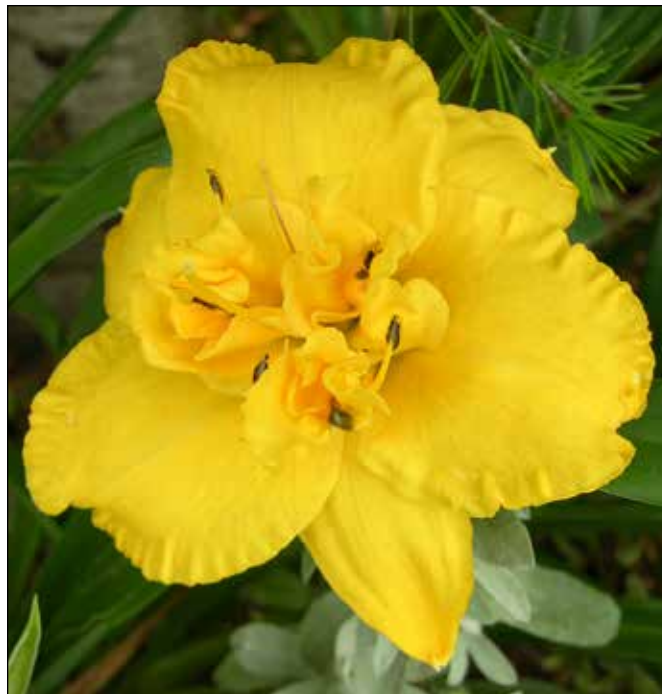
H. 'Layers of Gold' (Kirchhoff 1990)