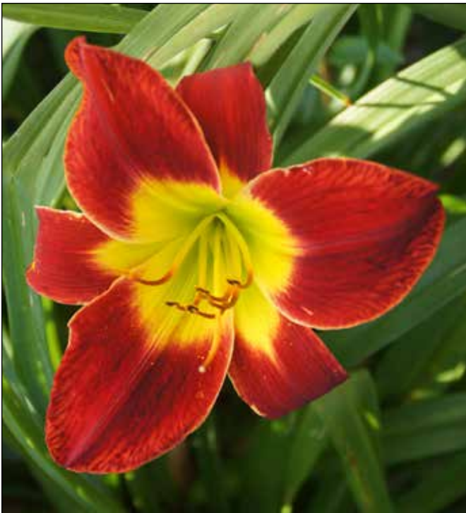
H. 'Sligo' (Whatley 1988)

an HM in 1994. Other tetraploids included 'Sligo' (1988), a 26", 5.5" dark red self with a green throat, which won an HM in 1993; 'Khorassan' (1988), a 30", 6" pink and yellow blend with a yellow throat, which won an HM in 1994; 'Kuan Yin' (1988), a 24", 6" bright red self with a green throat, which also won an HM in 1990; and 'Adjure' (1990), a 25", 6" rose pink self with a very green throat, which won an HM in 2001. These are just some of the 37 cultivars registered during this period. Oscie Whatley was awarded the Bertrand Farr Silver Medal in 1984.