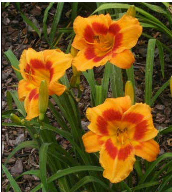
H. 'Eye-Yi-Yi' (McCroskey 1988)