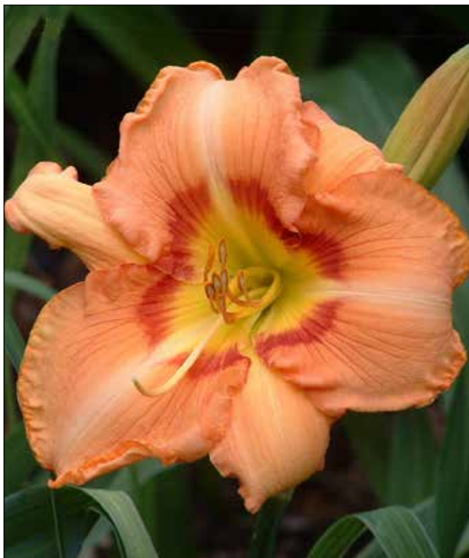
H. 'Lambada' (Kirchhoff 1990)

Doris Simpson of Baltimore, Maryland, registered 31 diploids during the 1980s. H. 'Fond Hope' (1981), a 27", 5" peach with a faint pink blush at its center and a green throat, won an HM in 1986. 'Bite Size' (1981), a 20", 2.37" gold self, won an HM in 1987. 'Peachy Pie' (1982), a 28", 4" toasted peach bitone with a small golden peach halo and a gold throat, won an HM in 1990. 'Lemon Lollypop' (1985), a 24", 2.87" light lemon yellow self with a green throat, won an HM in 1990. 'Ah Youth' (1987), a 28", 4.5" clear pink with a slightly deeper pink eyezone and a lemon green throat, won an HM in