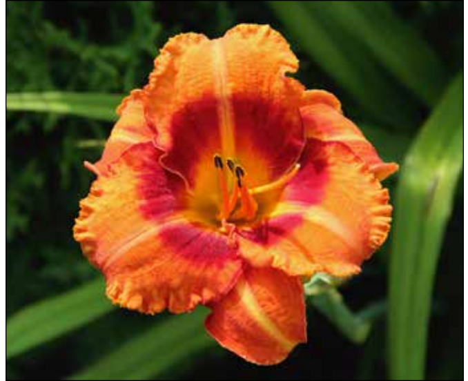
H. 'Tigger' (Stamile 1989)