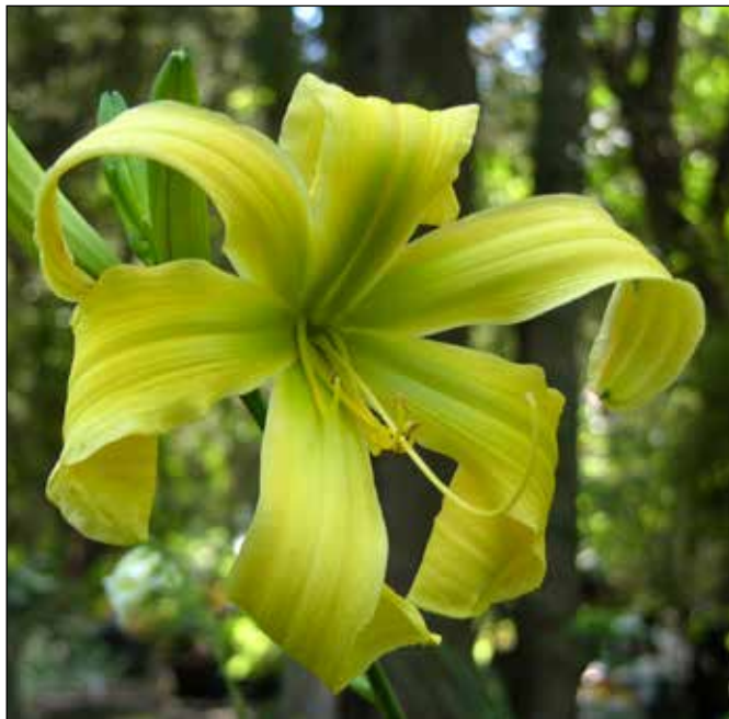
H. 'Lois Burns' (Temple 1986)

a spider ratio of 4.10:1 and a very green throat, won an HM in 1987 and the Harris Olson Spider Award in 1996. 'Rainbow Spangles' (1983), a 30", 7" lavender and chartreuse bicolor with a spider ratio of 4.40:1 and a purple eyezone above a green throat, won an HM in 1991. 'Lois Burns' (1986), a 30", 8.5" yellow green with a spider ratio of 4.00:1, won an HM in 1991 and the Harris Olson Spider Award in 1995. 'Mountain Top Experience' (1988), a 30", 5.87" lavender sepaled bicolor with a spider ratio of 4.80:1 and cream orange blend sepals with a red chevron on its petals and a green to yellow throat, won an HM in 1991 and the Harris Olson Spider Award in 1993. 'Umbrella Parade' (1990), a 30", 9" purple and yellow bicolor with a spider ratio of 5.00:1 and a green throat, remains