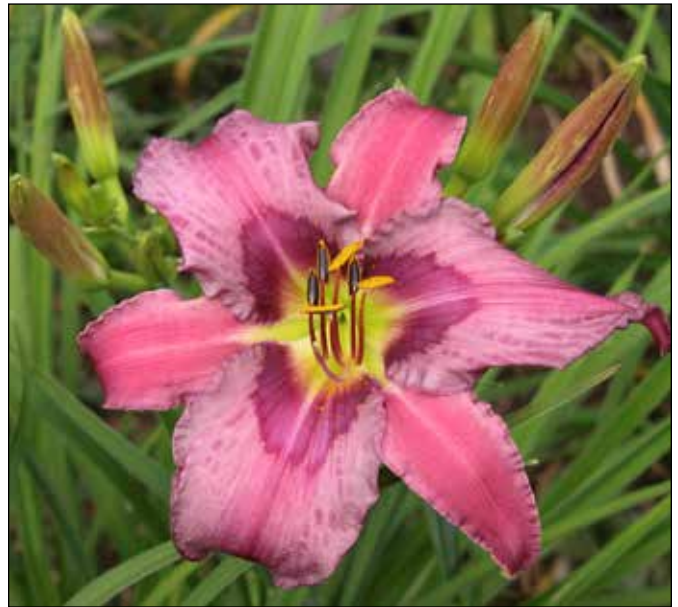
H. 'Blueberry Breakfast' (Rose 1988)