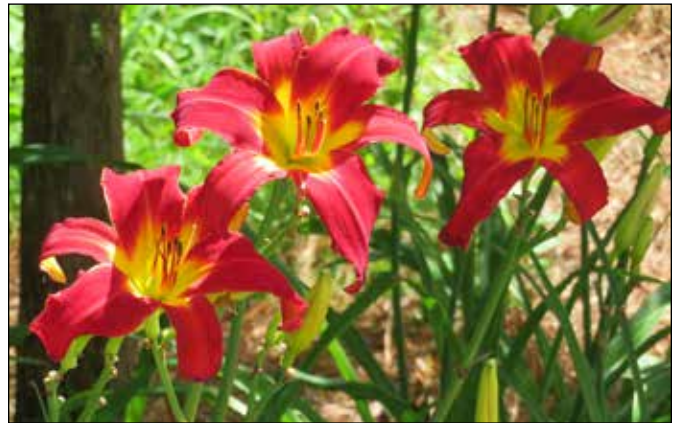
H. 'Spider Man' (Durio 1982)