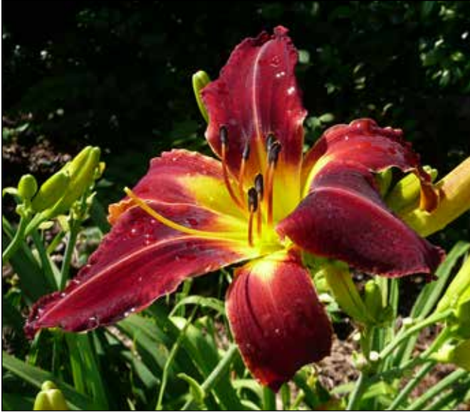
H. 'Samar Star Fire' (Sullivan 1985)