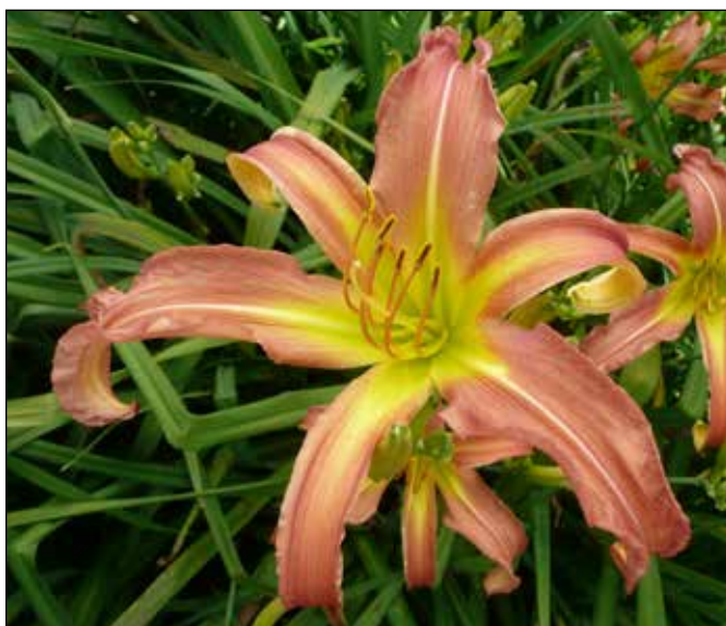
H. 'Star Twister' (Mills 1988)

Twister' (1988), a 26", 7" rose blend with a spider ratio of 4.40:1, however, remains overlooked for awards.