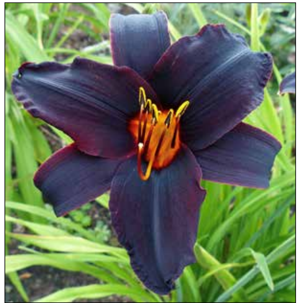
H. 'Africa' (Tankesley-Clarke 1987)

Bob & Eric Tankesley-Clarke of California, Missouri, are credited with 223 registrations, but almost all of their work stems from the post-historical period. Their diploid, H. 'Africa' (Kropf-Tankesley-Clarke 1987), a 27", 5" deep black red self with a bright tangerine orange throat, remains overlooked for awards, as does 'Four Star' (Kropf-Tankesley-Clarke 1988), a 30", 6" diploid double yellow gold self with a spider ratio of 4.30:1. 'Spinneret' (1990), a 30", 6" amber yellow semi-spider with dusted cinnamon edges and a green throat,