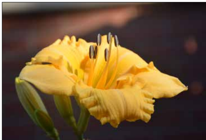
H. 'Golden Scroll' (Guidry 1989)