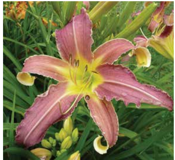
H. 'Loch Ness Monster' (G. Couturier) Dip: 25", 7.5" spider ratio 4.40:1; HM 2008