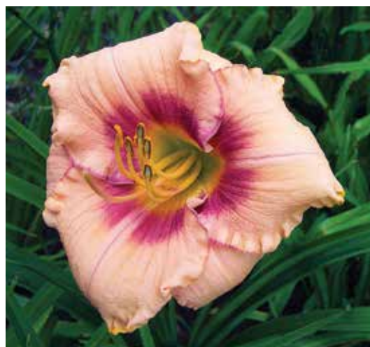
H. 'Peach Candy' (Stamile) Tet: 25", 4.75"; HM 1997