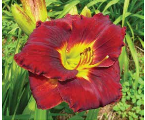
H. 'Rain Dance' (Benz) Tet: 28", 5"; HM 2000