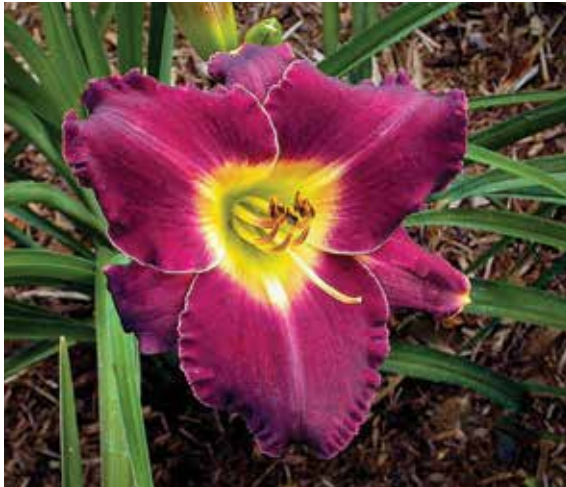
H. 'African Diplomat' (Carr) Tet: 29", 5.5"; HM 1998