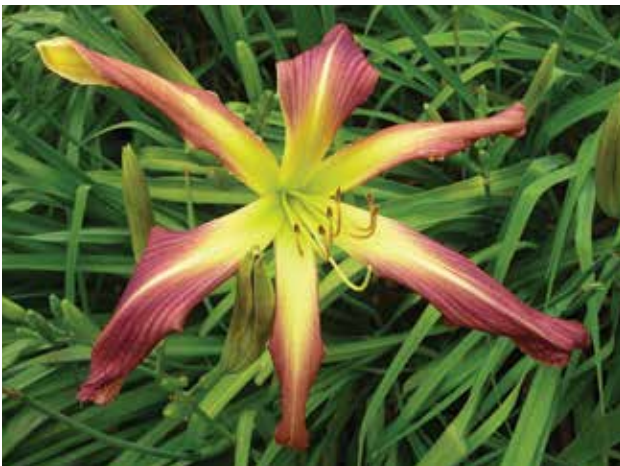
H. 'Watchyl Christmas Widow' (Kreger) Dip: 25", 10" spider ratio 5.00:1; No Awards