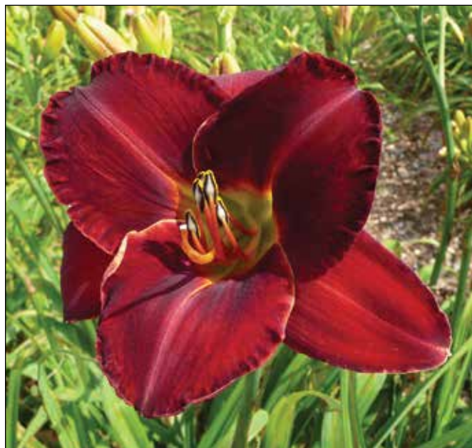
H. 'Illini Jackpot' (Varner 1981)

light orange beige blend with a green throat, won an HM in 1994. 'Illini Show Girl' (1984), a 32", 6" deep red self with a very green throat, won an HM in 1991.