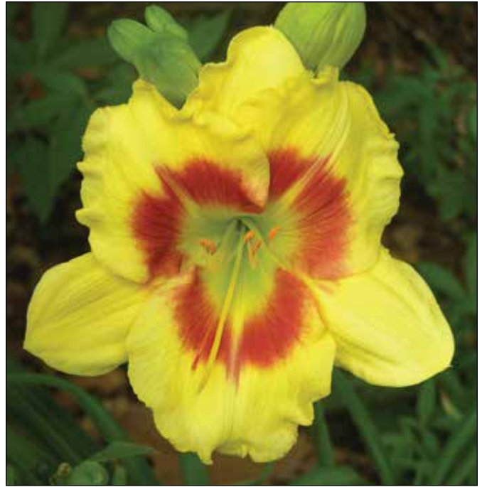
H. 'Wings of Chance' (Spalding-W.M. 1985)