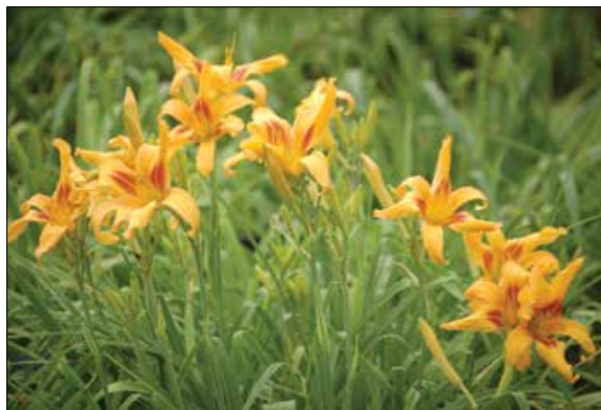
H. 'Crazy Pierre' (Whitacre 1990)

too remains overlooked. Jim is credited with a total of 14 cultivars. In the previous decade, John Whitacre had registered 'Trog' (1976), a 40", 7" deep red with chrome midribs and a chrome orange throat; it too has won no awards. Collectively, the Whitacres registered a total of 47 cultivars.