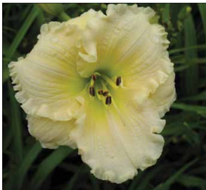
H. 'Monica Marie' (Gates-L. 1982)

throat, in 1992; and 'Wrapped in Beauty' (1986), a 22", 5.5" light cream pink self with a green throat, also in 1992. There are others too numerous to list. Among his diploids receiving honors were 'Monica Marie' (1982), a 24", 5" near white self with a green throat, which received an HM in 1986 and an AM in 1991; 'Judith Weston' (1989) a 20", 6" light yellow self with a green throat, which won an HM in 1993; 'Lots of Pizazz' (1989), a 26", 5.5" ivory edged gold with a very green throat, which won an HM in 1993; and 'Prim and Proper' (1989), a 20", 5" white with pink overlay and a green throat, which won an HM in 1994. For his many contributions, Lee Gates won the Bertrand Farr Silver Medal in 1995.