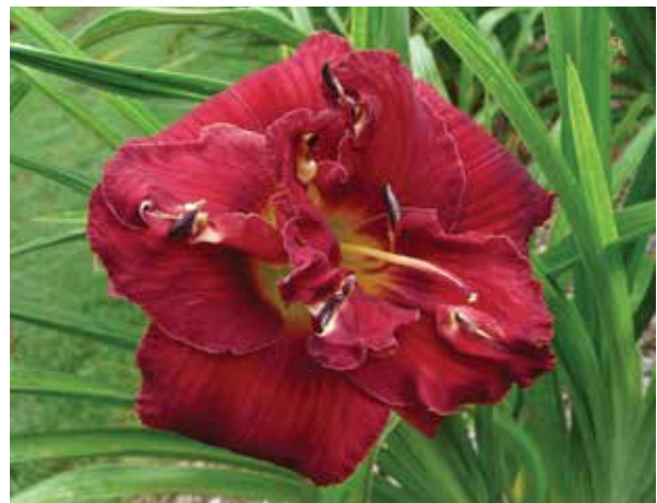
H. 'Wally' (T. Howard) Dip: 22", 5.25" double; HM 1994