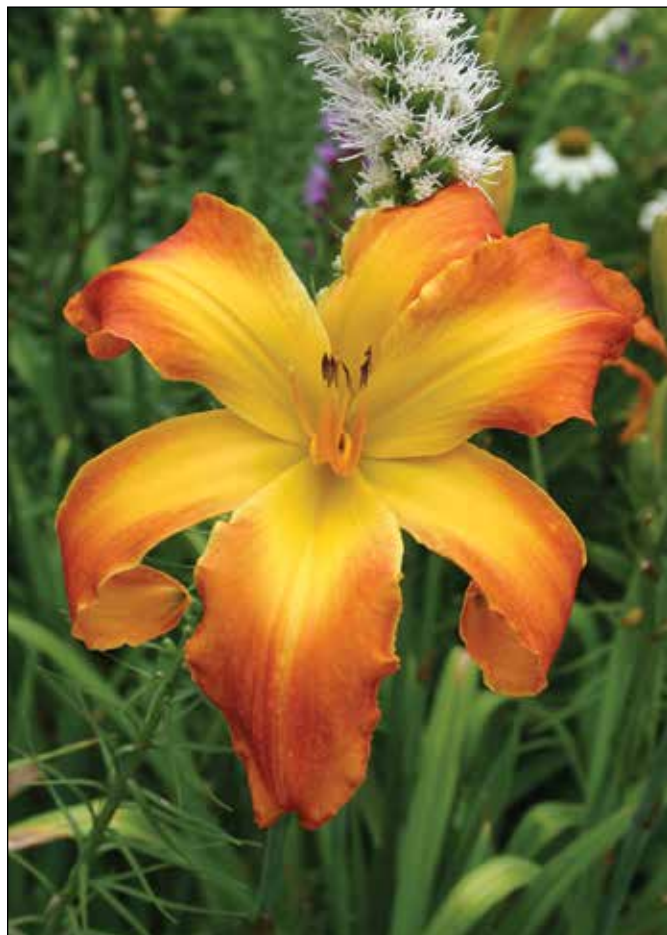
H. 'Carrick Wildon' (Goldner 1987)

Nona Ford of Greenfield, Illinois, registered a total of 22 cultivars. H. 'Thornbird' (1986), a 22", 4" red self with a green throat, won an HM in 1992. 'Clay Basket' (1989), a 22", 5" bronze and pale gold blend with a green throat, won an HM in 1994.