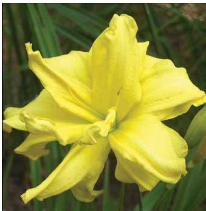
H. 'Double River Wye' (Kropf 1982)