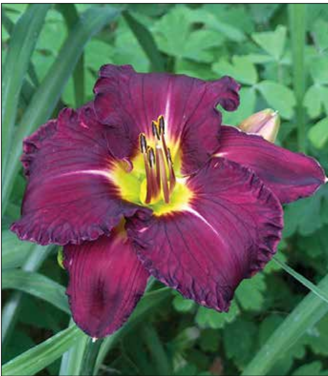
H. 'Nosferatu' (Hanson 1990)

H. 'Ocean Rain' (1987), a 26", 6" orchid pink blend with a green yellow throat, received an HM in 1991. 'Etruscan Tomb' (1988), a 20", 5" purple violet blend with a dark purple eyezone and chartreuse throat, won an HM in 1994. 'Tuxedo Moon' (1989), a 25", 6" burgundy purple with a light violet eyezone and a chartreuse throat, also won an HM in 1994. 'Nosferatu' (1990), a 26", 6" purple self with a chartreuse green throat, won an HM in 1997 and an AM in 2000. His