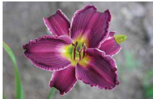
H. 'Indian Giver' (Ferguson) Dip: 20", 4.5"; HM 1997, AM 2000