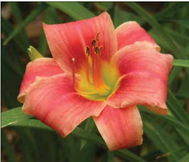
H. 'Gypsy Bridesmaid' (Cruse 1981)

J. L. Cruse, Jr. from Woodville, Texas, registered a couple hundred cultivars, most of them small flowers or miniatures. Many carried the prefix "Gypsy." H. 'Gypsy McCrone' (1981), a 17", 2.62" beige and tan blend with a cream green throat, won an HM in 1986. 'Gypsy Bridesmaid' (1981), a 20", 3.5" rose edged white with a green throat, however, remains overlooked, as do 'Gypsy Cranberry' (1981), a 16", 3.5" cranberry red self with a green throat, and 'Gypsy Dark Eyes' (1983), a 26", 5" peach with a black purple eyezone and a green throat. 'Little Red Dazzler' (1986), a 20",