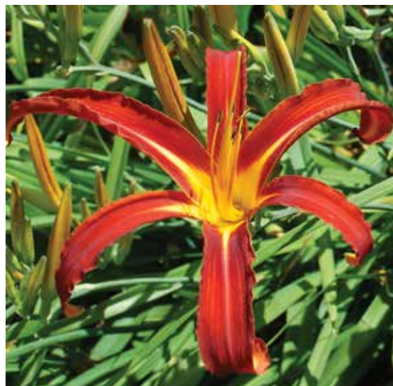
H. 'Nona's Garnet Spider' (N. Ford) Dip: 36", 6.5" spider ratio 4.33:1; No Awards