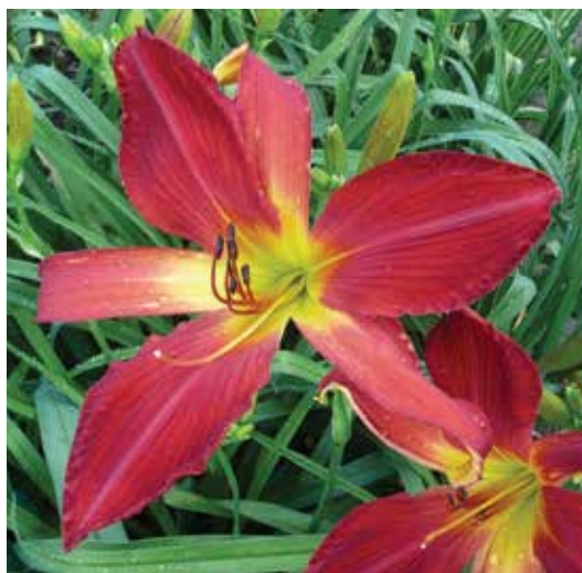
H. 'Christmas Ribbon' (Stamile) Tet: 34", 8.5" unusual form spatulate; HM 2004