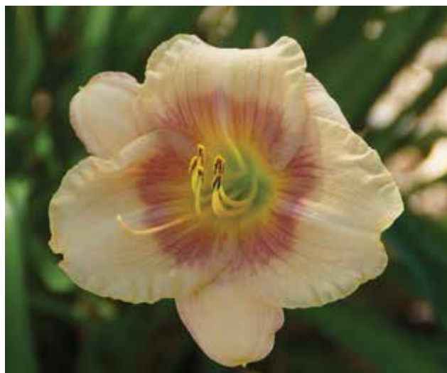
H. 'Papa's Pride' ( H. Herrington ) Dip: 29", 6.5"; HM 1995