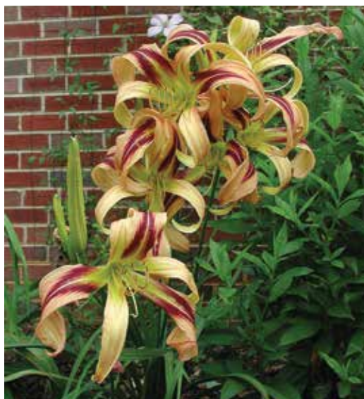
H. 'De Colores' (Temple) Dip: 28", 8.5" spider ratio 6.00:1; Harris Olson Award 1998, HM 1999