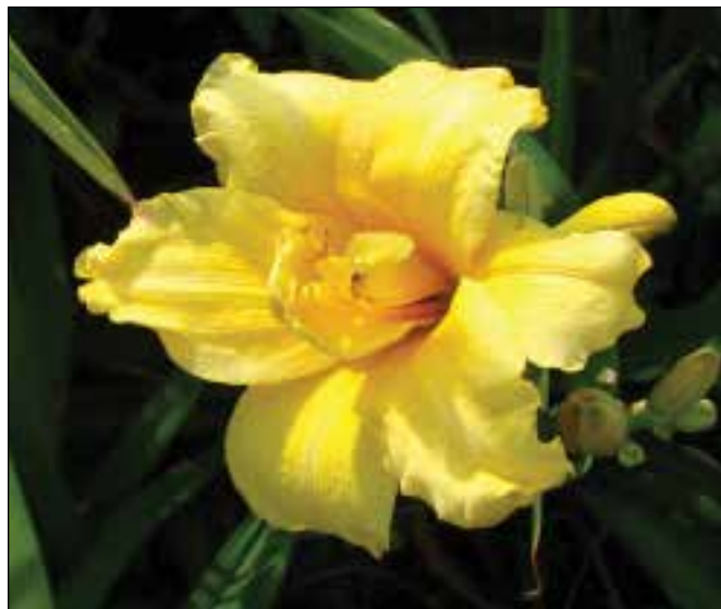
H. 'Butter Dish' (Kropf 1988)