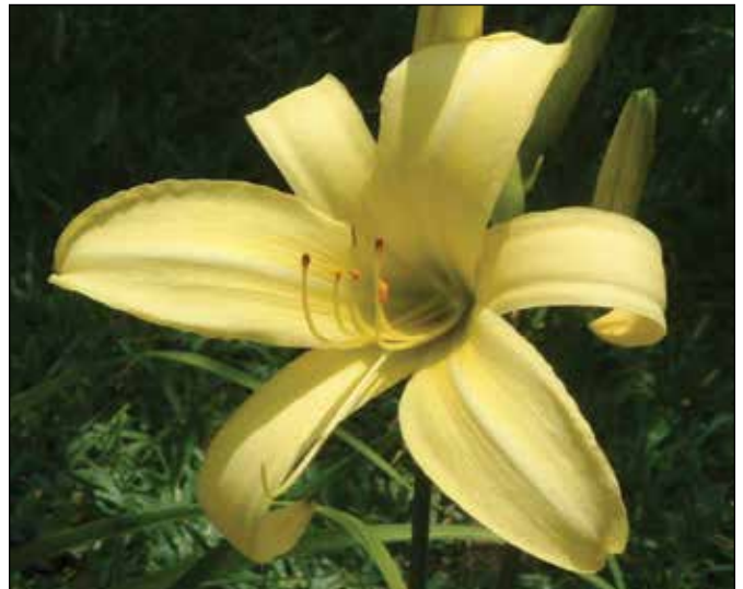
H. 'Green Dolphin Street' (Sanford Roberts 1986)

Sanford Roberts of Blossom Valley Garden in El Cajon, California, is credited with 23 registrations. H. 'Cortez Cove' (1983), a 28", 4" greenish yellow tetraploid with a green throat, won an HM in 1988. 'Green Dolphin Street' (1986), a 28", 7.5" green yellow spider-type tetraploid with a green throat won an HM in 1993.