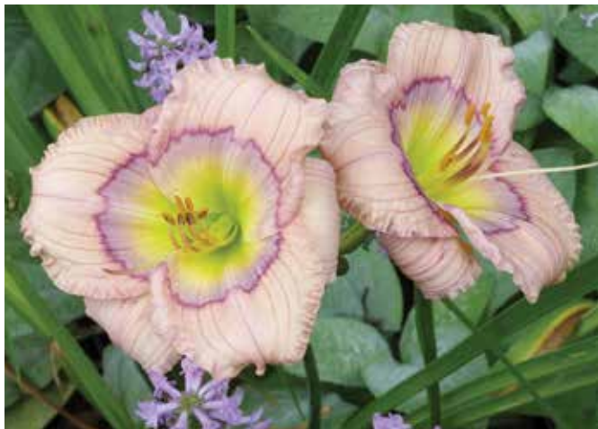
H. 'Siloam David Kirchoff' (Henry-P. 1986)

Glawson' (1986), a 16", 2.87" blush pink with a deep burgundy eyezone and a green throat, won an HM in 1990. 'Siloam Leo Sharp' (1986), an 18", 2.87" blue orchid with a smoky gray eyezone and a green throat, won an HM in 1991. 'Siloam Paul Watts' (1988), an 18", 4.75" red self with a green throat, won an HM in 1992 and an AM in 1995. 'Siloam Ralph Henry' (1988), an 18", 5.5" pale blush self with a green throat, won an HM in 1993 and an AM in 1997; it also became a significant parent in its diploid form and as a tetraploid conversion. 'Si-