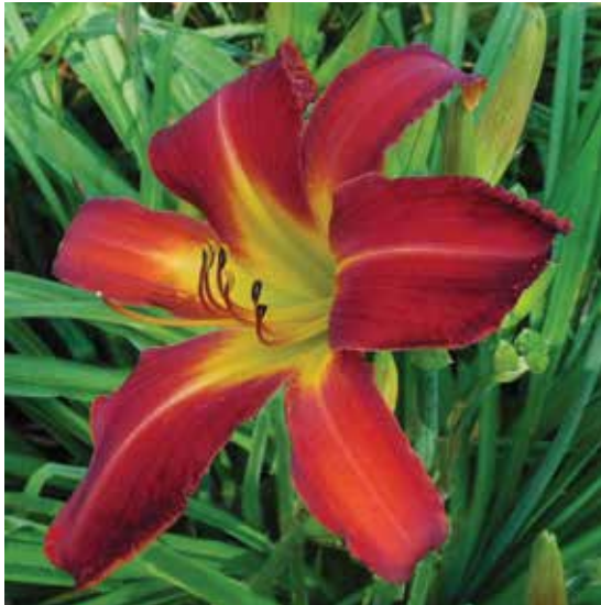
H. 'Point of View' (S. Roberts) Tet: 35", 7.5"; HM 2001