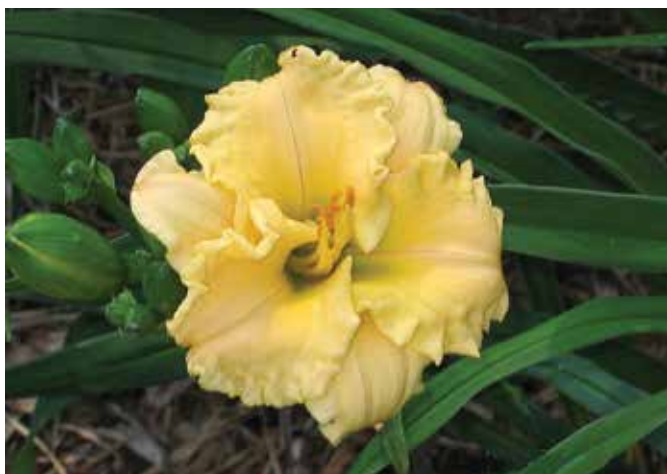
H. 'Baby Fresh' ( Joiner ) Dip: 16", 3.5"; HM 1994