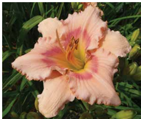
H. 'Pink Cotton Candy' ( Stamile ) Tet: 23", 5"; HM 1995