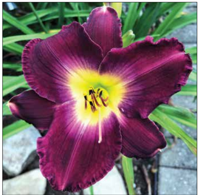
H. 'Strutter's Ball' (Moldovan 1984)

'Vera Biaglow' (1984), a 28", 6" rose pink edged silver with a lemon green throat, captured an HM in 1989 and an AM in 1993. 'Pewter Lake' (1986), a 28", 6" gray bluish lavender blend with deeper veins and a lemon yellow green throat, won an HM in 1991. 'Avante Garde' (1986), a 26", 5.5" amber tan bitone with a red orange eyezone and a yellow green throat, won an HM in 1993, and 'Geppetto' (1986), a 26", 5" pink cream with a strong pink eyezone and yellow green throat, won an HM in 1994. Four other tetraploids, registered on the cusp of the next decade, are worth mentioning. 'Anchors Aweigh' (1990), overlooked for awards, is a 28", 6" bluish violet blend