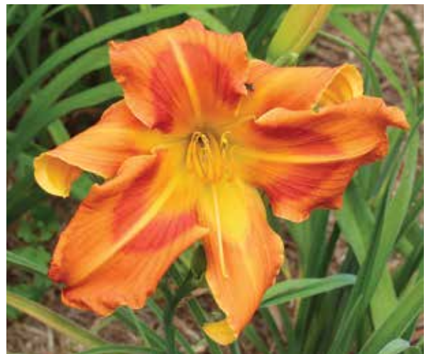
H. 'Orangutan' ( Reed ) Dip: 26", 6"; HM 2003