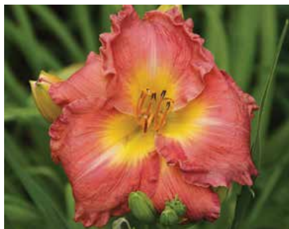
H. 'Dena Marie' (J. Carpenter) Dip: 26", 6.75"; HM 1997, LEP 1999, AM 2000