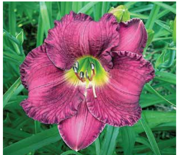
H. 'Solomons Robes' (Talbot) DIP: 30", 6"; HM 1995, AM 1998