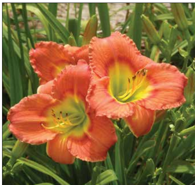
H. 'Green Eyes Wink' (Nolen 1982)