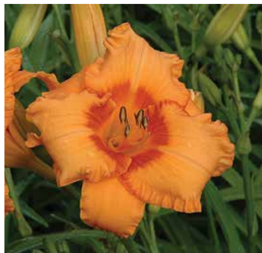
H. 'Cherry Eyed Pumpkin' (D. Kirchoff) Tet: 28", 5.75"; HM 1995