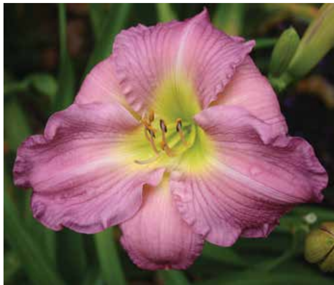
H. 'Jedi Blue Note' ( Wedgeworth ) Dip: 22", 5.25"; HM 1999