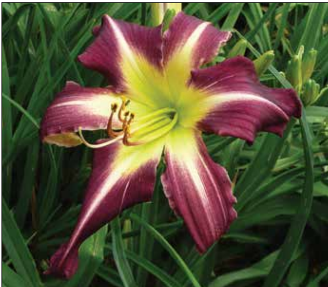
H. 'Peacock Maiden' (Carpenter-K. 1982)