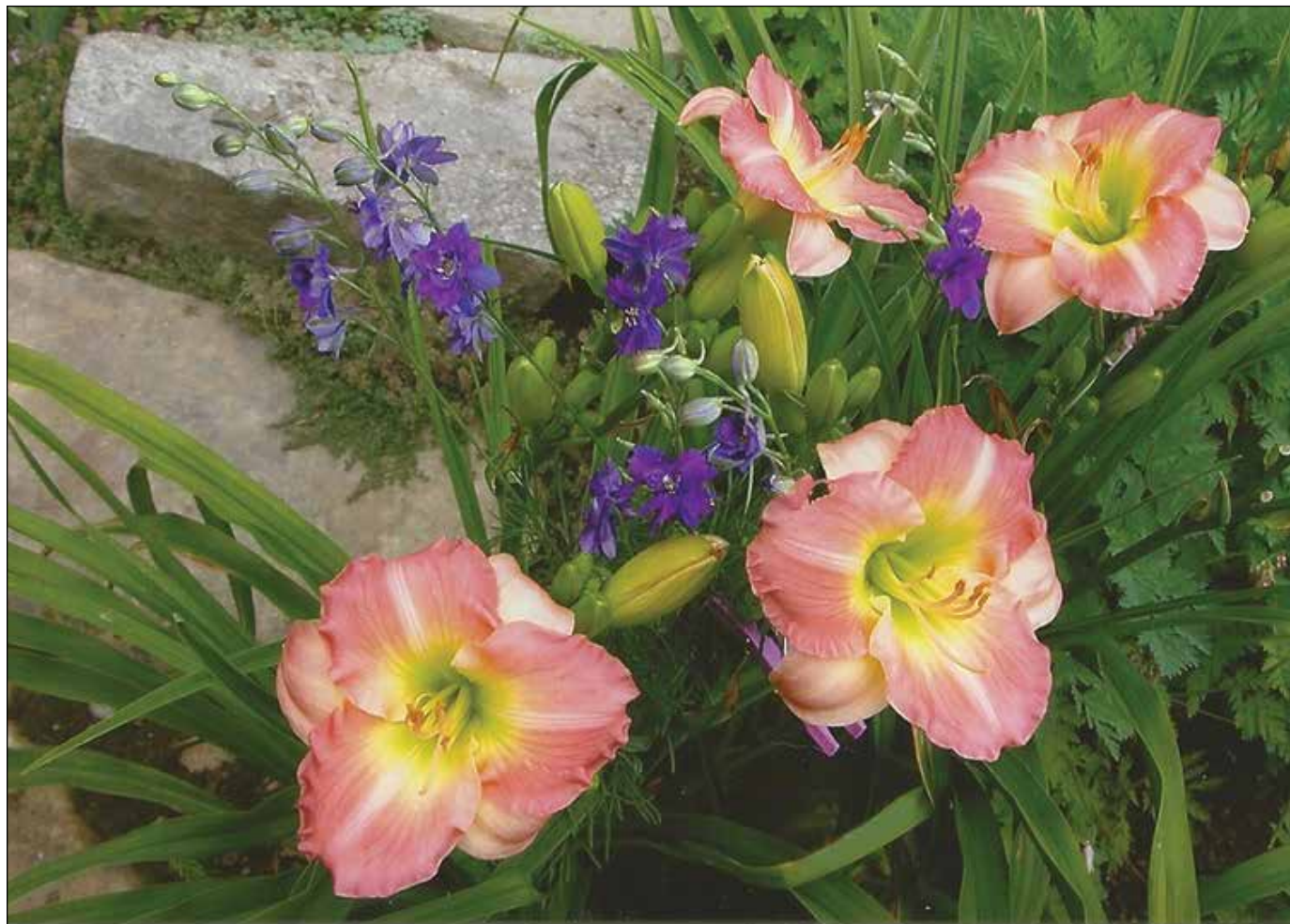
H. 'Pink Power' (Jablonski-Sharp 1989)