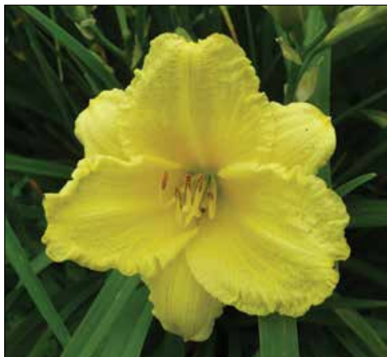
H. 'Happy Returns' (Apps 1986)