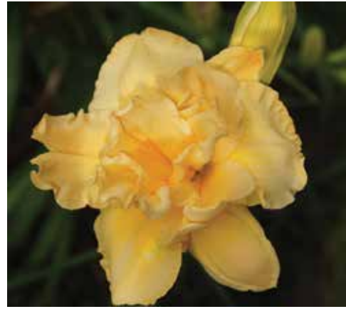
H. 'Heather Herrington' (Joiner) Dip: 30", 6" double; HM 1994