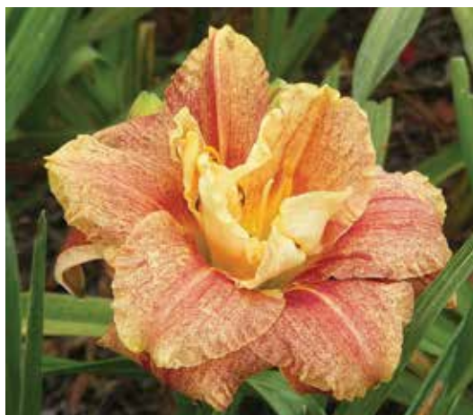
H. 'Happy Hooligan' (Talbot) Dip: 18", 5.5" double; HM 1999