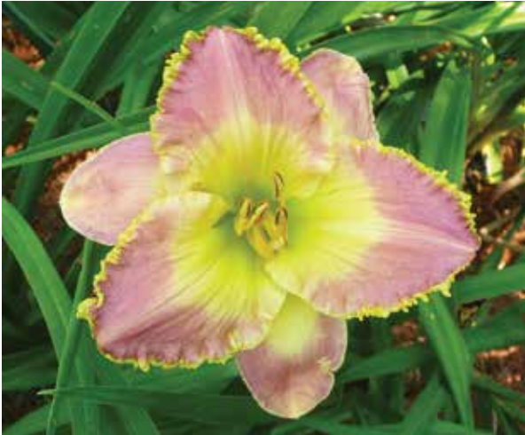
H. 'Spritual Corridor' (C. Hanson) Tet: 25", 6"; HM 1997