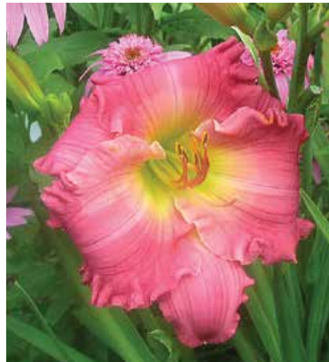
H. 'Hush Little Baby' (Sikes) Dip: 22", 5"; HM 1997