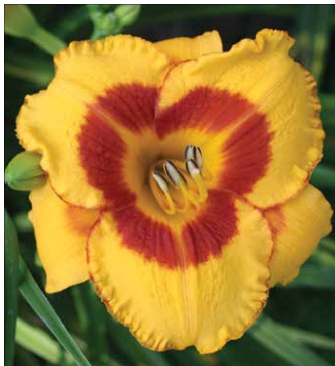
H. 'Fooled Me' (Reilly-Hein 1990)