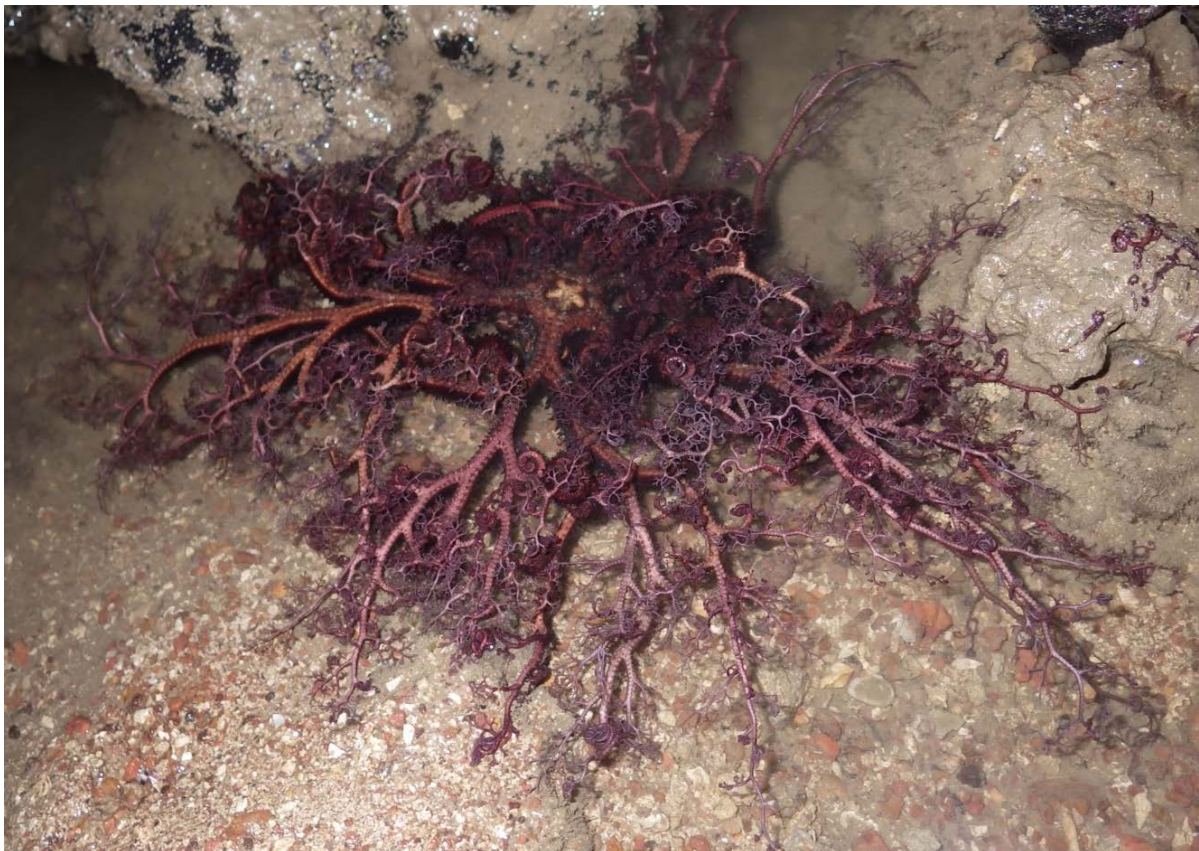
Fig. 1. The basket star on the reef flat with its oral surface facing upwards.