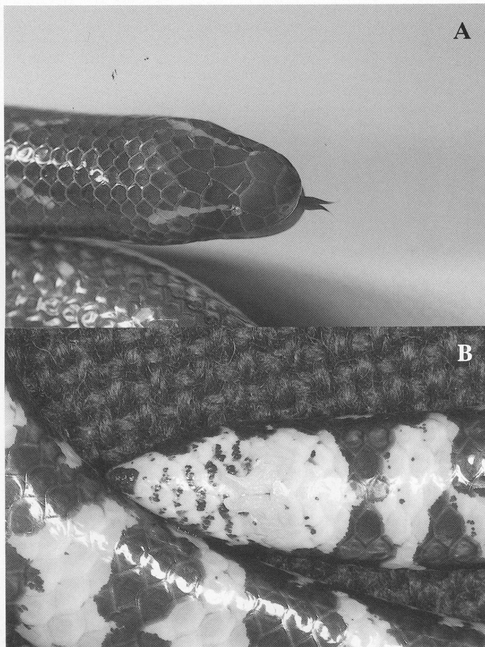
Fig. 2. Cylindrophis engkariensis , new species. Holotype male (ZRC). A, dorsal view of head; ventral view of caudal region.

A large temporal, approximately equal in size to supraocular, bordering the fourth and fifth supralabials, behind and much larger than the postocular. A second temporal about half the size of the first, posterior to the supraocular. A pair of irregularly shaped parietals posterior to the frontals, approximately equal in size to the supraoculars. Five infralabials. Mental half the size of first infralabial. One pair of chin shields, separated from a mental groove by the first pair of infralabials.