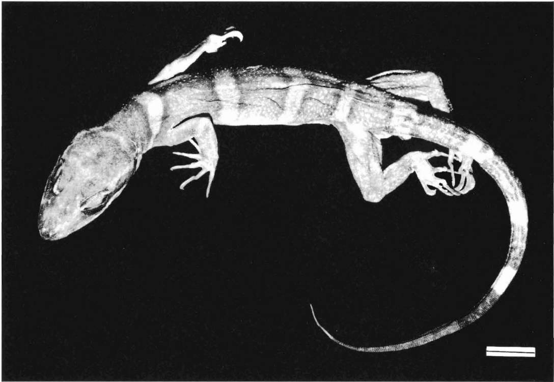
Fig. 1. The holotype of Cyrtodactylus tiomanensis (ZRC 2.3412). Marker = 10 mm.