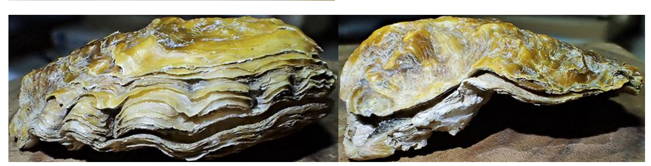
Fig. 5. Dendostrea cristata. Lateral views with both valves attached.

Remarks: Dendostrea cristata was originally described by Born (1778) as Ostrea cristata. Its type locality, by redesignation, is Kuantan in West Malaysia (Huber, 2010). This species is distributed through the central Indo-West Pacific from northwestern Australia up to China (Huber, 2010). It was one of the most common oyster species washed ashore along the beaches of the Gulf of Thailand, with individuals growing up to 82 mm (Swennen et al., 2001, as Dendrostrea glaucina).