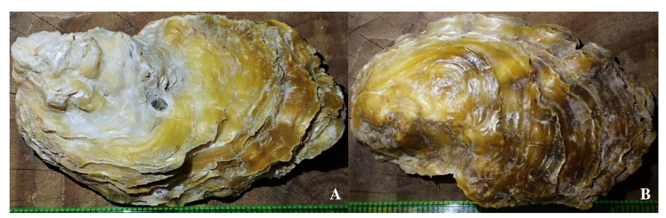
Fig. 2. Dendostrea cristata. Exterior surfaces of right valve (A) and left valve (B). Space between black bars = 1 mm.

greatly inflated compared to right. Commissural shelf narrow and poorly developed. Umbonal cavity shallow and ligament short.