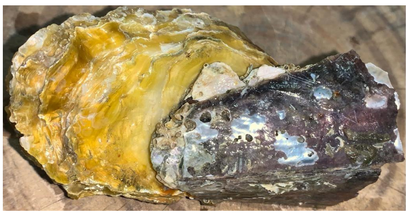
Fig. 1. Dendostrea cristata attached to a dark-coloured pen shell fragment.

Observation: A mature specimen of about 53 mm in length was found lying on muddy sand, with its left valve still attached to a fragment of a pen shell ( Pinna sp.) (Fig. 1).