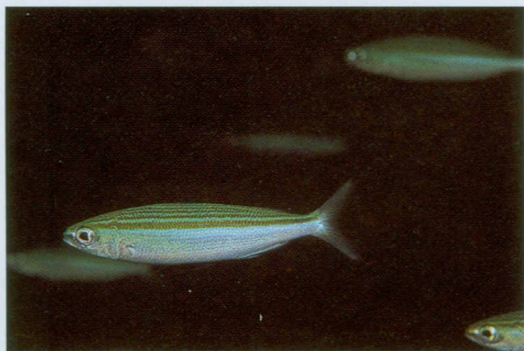
Fig. 2. Unidentified species of the caesionid fish genus Pterocaesio , Mentawai Islands.