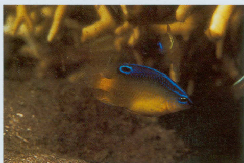
Fig. 8. Juvenile of the pomacentrid fish Pomacentrus xanhosternus , Mentawai Islands.