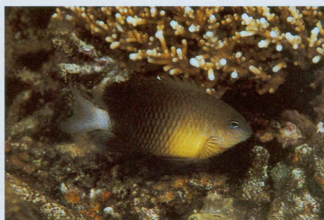
Fig. 9. Adult of the pomacentrid fish Pomacentrus xanhosternus , Mentawai Islands.