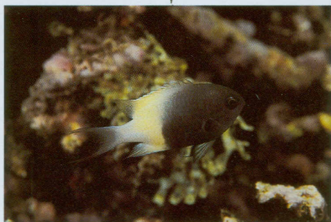
Fig. 4. The pomacentrid fish Chromis dimidiata , Mentawai Islands.