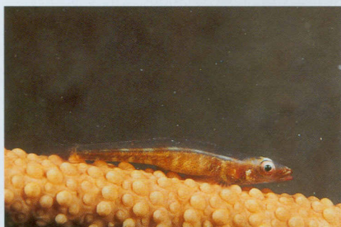
Fig. 6. The gobiid fish Bryaninops amplus on the gorgonian Junceella sp., Pulau Ular, West Sumatra.