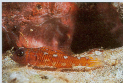
Fig. 7. The gobiid fish Trimma naudei , Mentawai Islands.