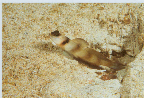
Fig. 5. The gobiid fish Amblyeleotris downingi , Pulau Ular, West Sumatra.