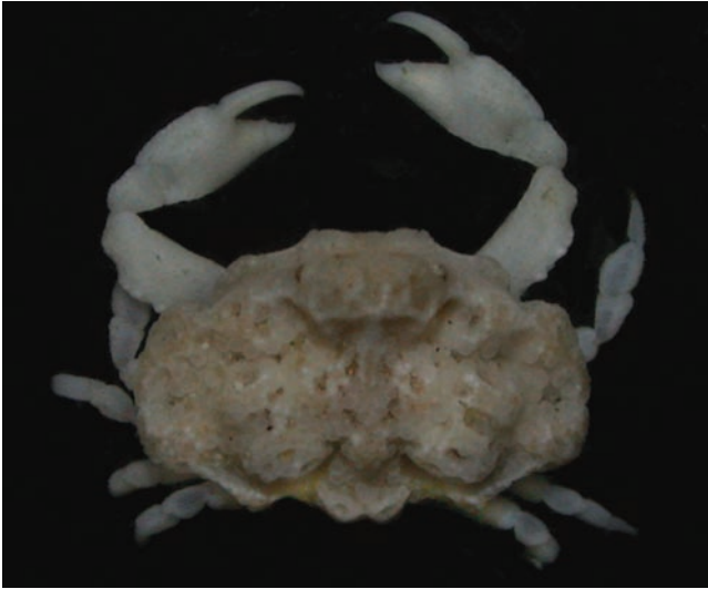
Fig. 1. Alox tormos , new species. Holotype male (4.2 × 5.6 mm) (NMCR), colour in life.

view; when retracted, ocular peduncle nearly seals orbit; outer orbital margin bisutured. External maxillipeds concealing trapezoid buccal opening, closely set with granules; endognathal meri visible in anterior view. Anterolateral margin sinuous, indistinctly rimmed, with pit-like indentation medially. Subhepatic margin with rounded facet medially, visible in dorsal view. Lateral margins of carapace expanded. Posterolateral margin with granulate tubercle submedially. Posterior carapace margin produced, visible in dorsal view, bilobate. Postfrontal median longitudinal ridge narrow, distinct, separated laterally by deep grooves. Granule-lined furrow meandering from postfrontal ridge to distal posterolateral margin. Branchial regions raised, irregularly pitted, a pair of granule-rimmed cavities submedially on anterior margin. Cardiac region surfaced with flattened granules. Intestinal region raised, well demarcated, distinctly pitted. Chelipeds subequal, robust, closely and evenly granulate; chela almond-shaped, upper and lower margins carinate; fingers as long as palm; propodal finger very high