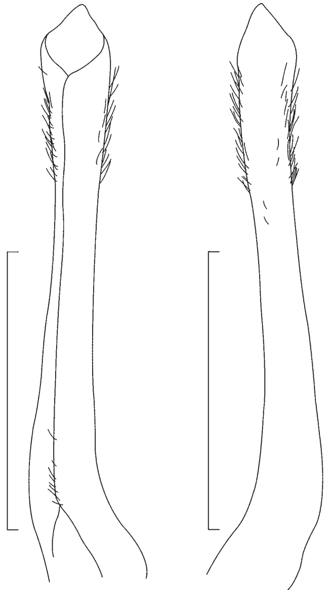
Fig. 3. Alox tormos , new species. Holotype male (4.2 × 5.6 mm) (NMCR). A, B, right male first pleopod. Scale bar = 1 mm.