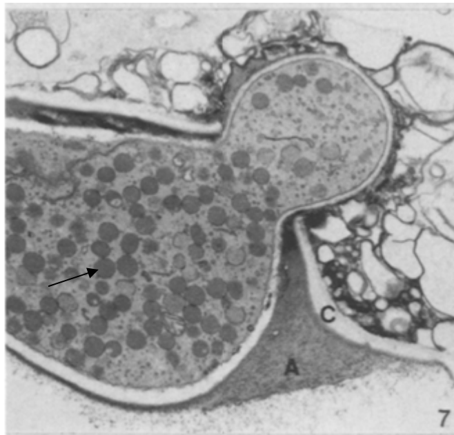
Figure 2. Electron micrograph of a thin section of Arthrobotrys oligospora demonstrating the presence of electron-dense microbodies (arrow) in the penetration hyphae, shortly after penetration of the nematode cuticle. (4h after capture; 10,000 x ), 7; this is micrograph number 7 in a series originally published in Veenhuis et al. , (1985). A, adhesive coating; C, cuticle of the nematode.

the studies of M. haptotylum in this thesis can also apply to other species of nematode-trapping fungi.