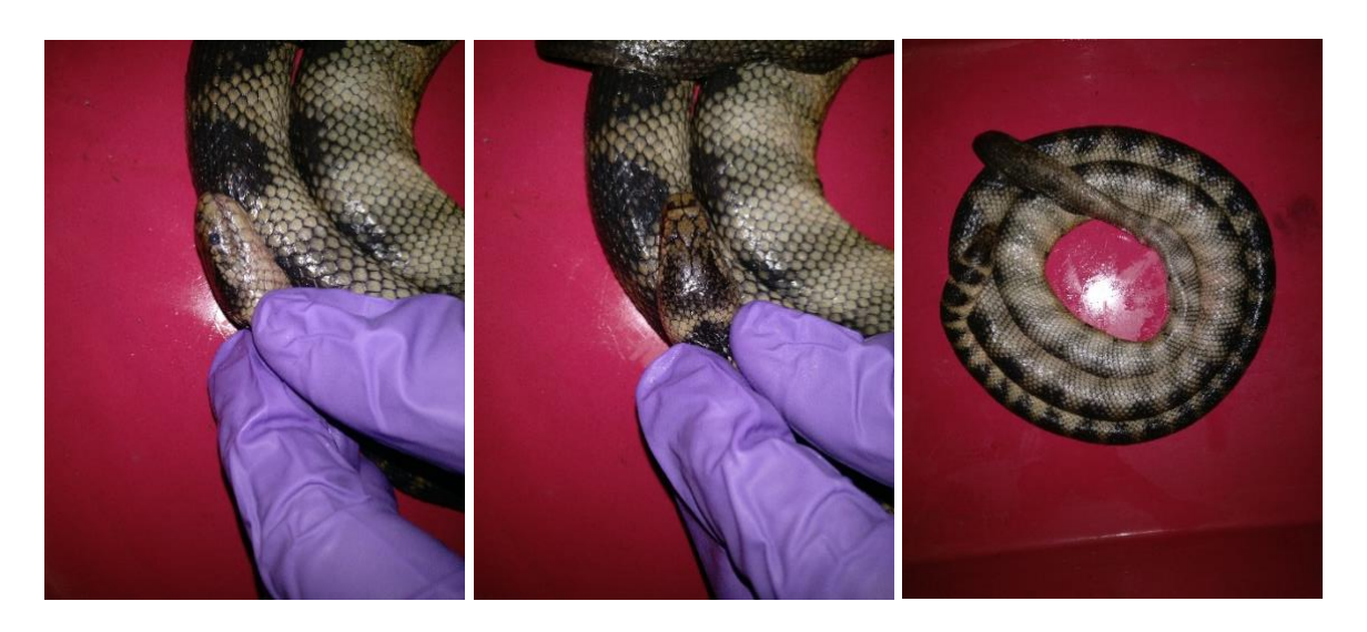
Figure 2: Hydrophis cyanocintus specimen obtained as trawler bycatch, from left to right, lateral view of head, dorsal view of head and entire specimen.

preserved and will be deposited in the Museum at Centre for ecological sciences, IISc, Bangalore.