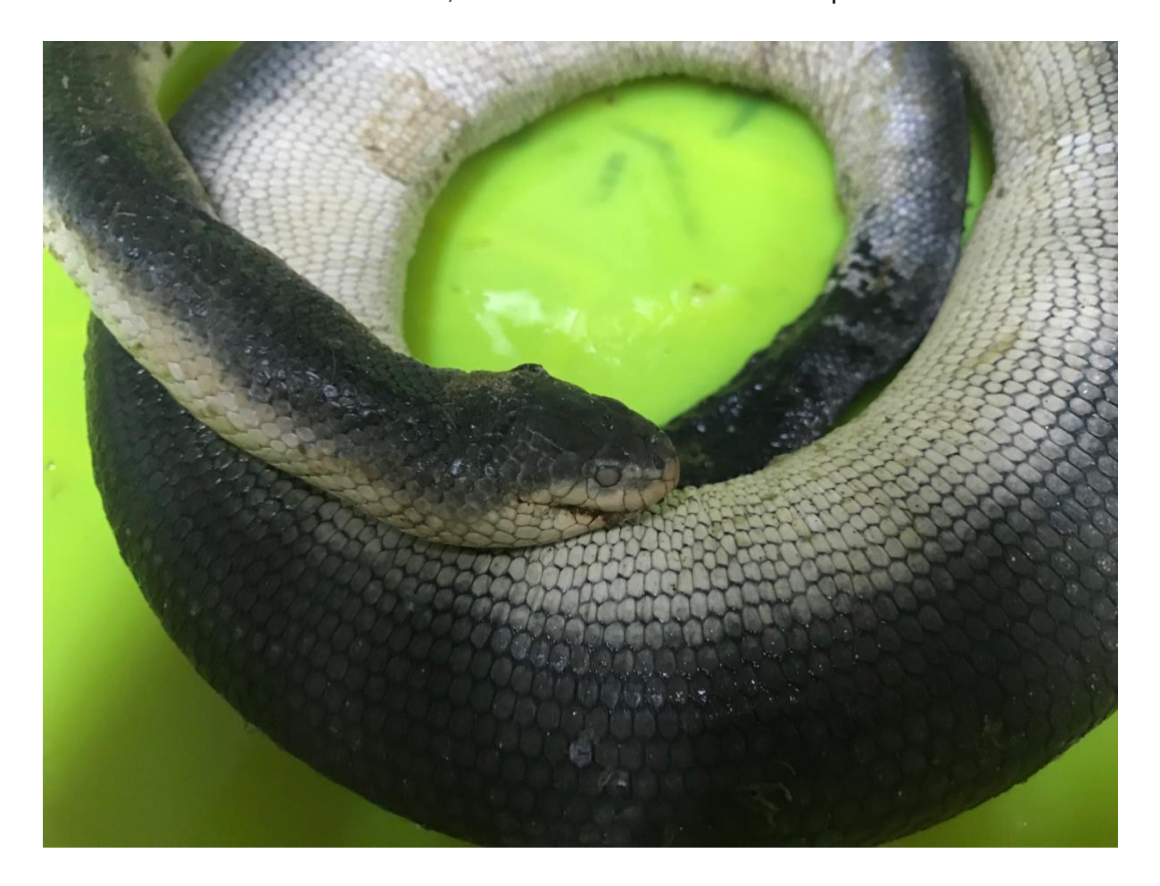
Fig 3: Viper headed sea snake (Hydrophis viperinus) found dead on Dandi beach.