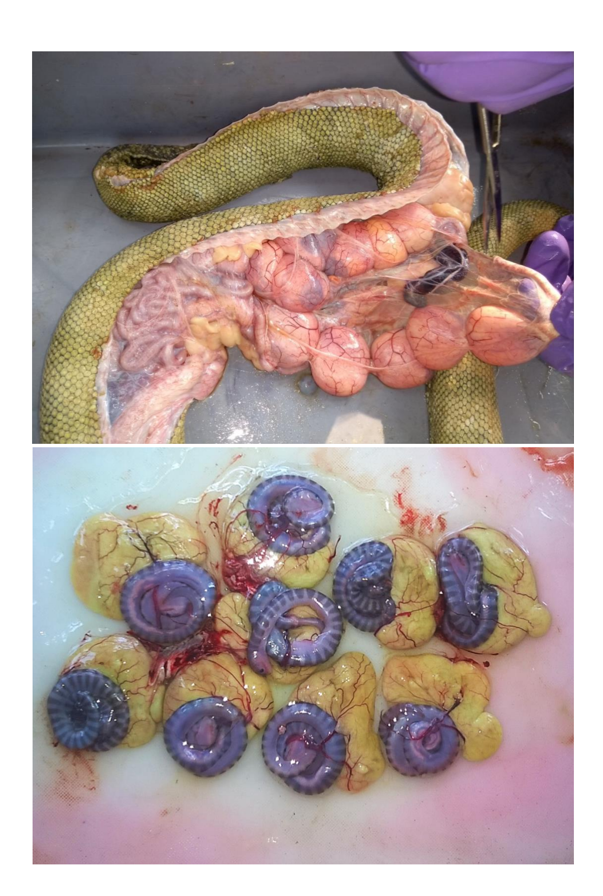
Figure 4: Top: Eggs of H. schistosus in situ and Bottom: Embryos of H. schistosus