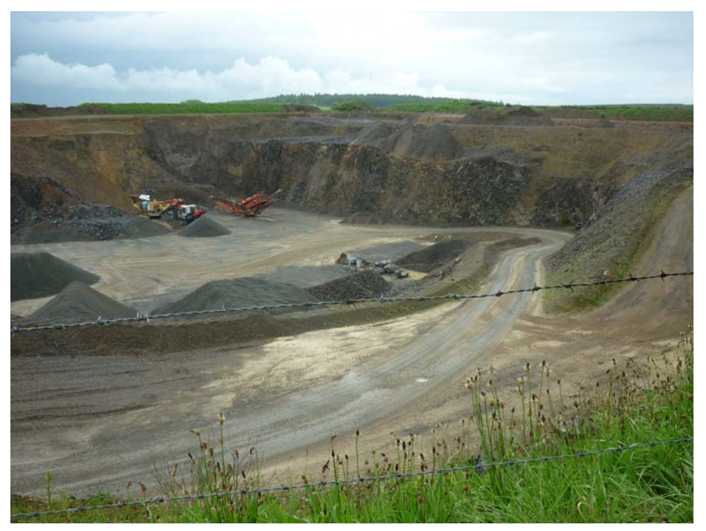
Photograph 7: Quarry near South Gorrachie