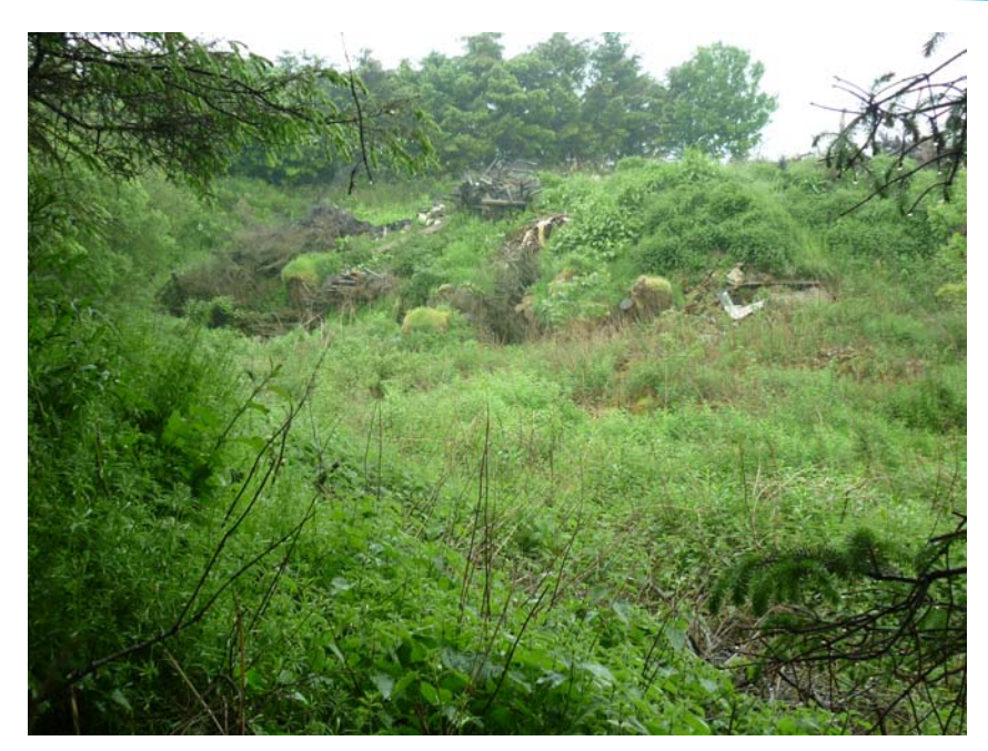
Photograph 6: Swanford Farm, with evidence of made ground / rubble and scrap metal