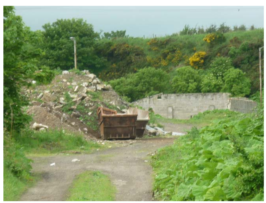
Photograph 5: Demolition rubble at Inverboyndie