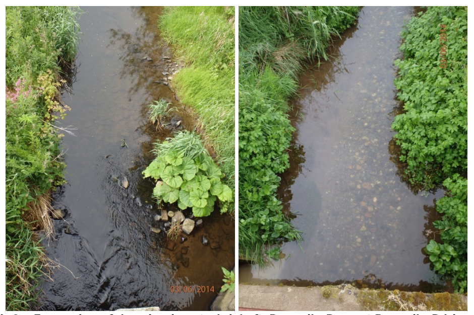
Photograph 2 – Examples of river bed material. Left: Boyndie Burn at Boyndie Bridge, shortly before Boyndie Bay. Right: Burn of Fortie north-east of King Edward. Note the gravel bed covered with fines.

The river bed material is generally gravel (Photo 2), often covered by fine particles, most common in smaller watercourses and drains (Photo 2 Left). These fines are also found attached to macrophites (e.g. algae) on the bed, colouring the bed a brown tone (Photo 3).