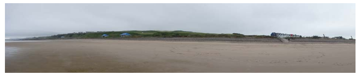
Photograph 4 – Boyndie Beach. Boyndie Burn discharges to the right of the image. Note the dunes in the background.

The landfall point at Boyndie Bay has a sandy beach, with the Boyndie Burn cutting through it. High vegetated sand dunes are found at the back of the beach (Photo 4).