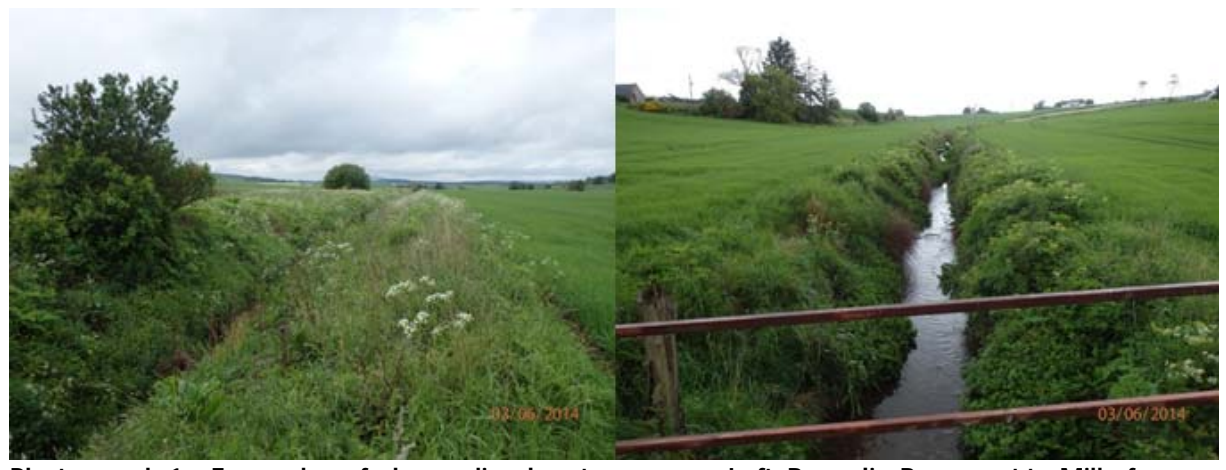
Photograph 1 – Examples of channelised watercourses. Left: Boyndie Burn next to Mill of Blairshinnoch. Right: Burn of Fortrie at Milltack.

Based on the site inspection, the majority of the watercourses –especially the smaller oneshave some degree of channelisation. Since the land is mainly dedicated to crop production and grazing the channels are commonly straightened and productive land pushed to the edge of the banks. Raised embankments commonly bound the channels, which are generally incised. There is evidence of bank toe undercutting in numerous locations and many watercourses have very steep banks, which were covered in dense vegetation (high grass and bush) at the time of the visit (June 2014) (Photo 1).