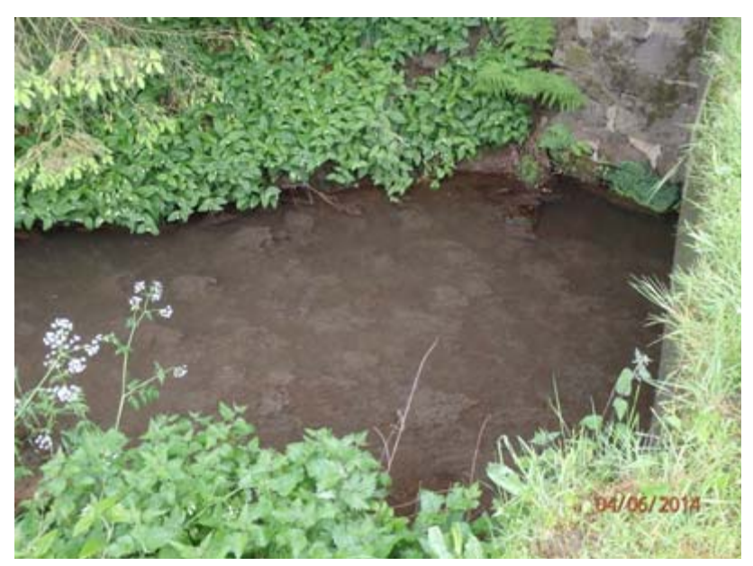
Photograph 3 – Craigston Burn approximately 1km downstream of Craigston Castle. Note the very fine particles attached to the macrophites.