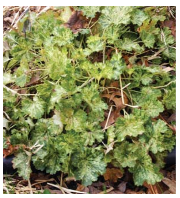
Heuchera 'Snow Angel'.

If necessary, cut back winter-damaged foliage in early spring to make way for new growth. And if you live in a cold climate (Z4), mulch your coral bells in winter, leaving the crowns unburied. Oak leaves are ideal.