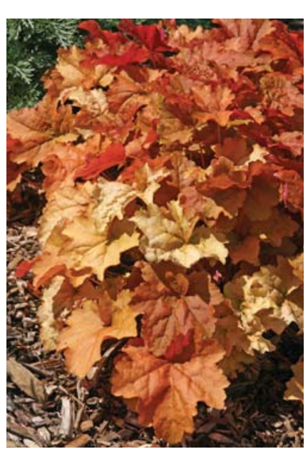
Heuchera 'Dolce Creme Brulee'