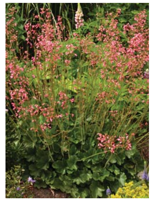
A green-leaved Heuchera in bloom.

Try pairing the deep purple leaves of 'Dark Secret', 'Plum Royale' or 'Berry Smoothie' with a spray of yellow coreopsis or a few choice lilies. Marry the chartreuse of 'Lime Marmalade' with blue bachelor's buttons and orange California poppies. Or, arrange the bold orange leaves of 'Peach Flambé' or 'Tara' with green hydrangeas, zinnias or purple salvia. To play up the color silver, combine a silver-toned coral bell like 'Rave On' or 'Silver Scrolls' with white daisies, roses or lilies. Tulip flowers in dusky purples