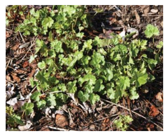
Heuchera sanguinea in early spring.

H. sanguinea, a Southwestern native, maintains its oftenbright blooms through extreme drought and heat. Most do well in shady rock gardens or along woodland paths. Look to bold varieties such as 'Snow Angel' with mottled green and cream leaves or 'Firefly' strain or the 'Coral Forest' strain with profuse scarlet blossoms.