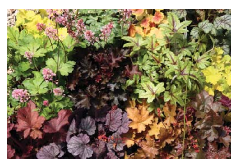
There are a seemingly unending number of forms and colors of heuchera these days.

Each year the National Garden Bureau (NGB) selects one flower and one vegetable to be showcased. In 2012, they added a perennial to these selections. These crops are chosen because they are popular, easy-to-grow, widely adaptable, genetically diverse, and versatile. For the first ever perennial of the year, the NGB chose Heuchera.