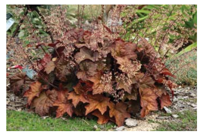
Heuchera 'Palace Purple' looking more coppery than purple!

It wasn't until 1980 when Brian Halliwell released Heuchera villosa 'Palace Purple' that these plants were accepted as foliage plants. At about the same time, Dale Hendricks of Northcreek Nurseries released a strain of Heuchera americana called 'Dale's Strain'. These two plants were hybridized to form the first foliage varieties, and the rest, they say, is history.