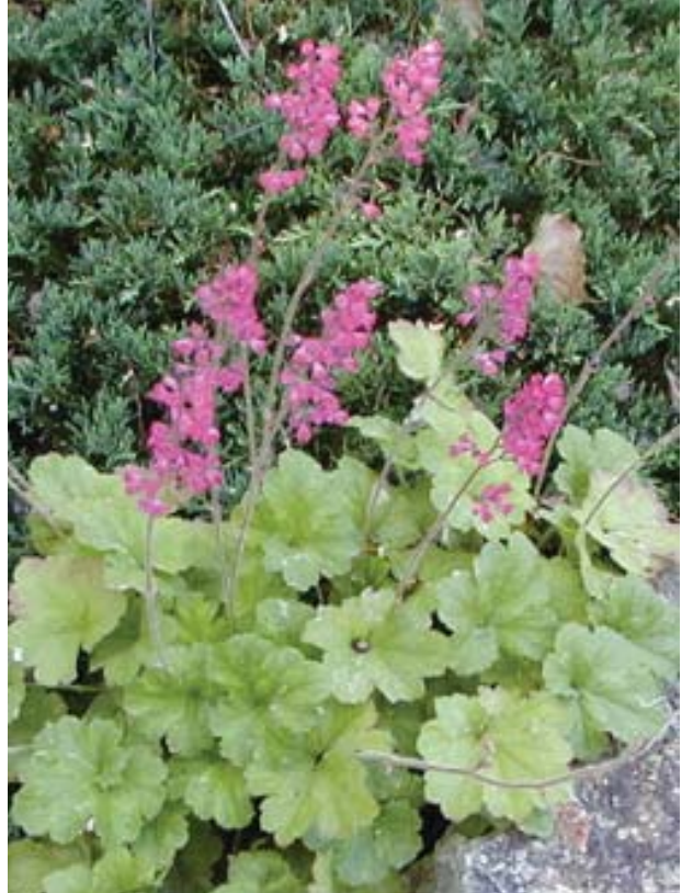
Green-leaved heuchera with bright pink flowers.

to the possibilities these crosses can present.