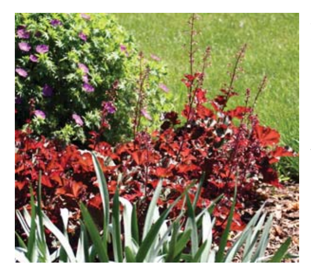
Heucheras offer foliar color and contrast in the landscape.

A premium organic planting compost will provide excellent drainage with enough moisture.