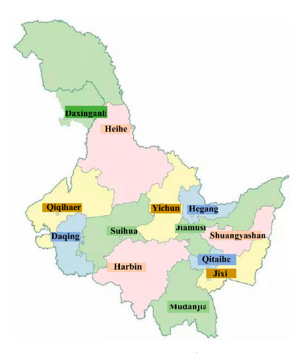
Figure 1. Geographic distribution of 242 wild soybean samples in Heilongjiang Province.

Based on the information of four major agricultural regions in Heilongjiang Province, all wild soybean resources were collected and preserved by the field investigation (Table 1). Seeds were obtained by self-breeding. The growth habits of wild soybean were different from those of the cultivated soybeans, including stolon habits, high plant height, and thin stems. Thus, in this study, a completely randomized block design (i.e., a 0.65 \text{ m} \times 1 \text{ m} plot containing four holes) was utilized with three replications for each sample. One seedling was sown in each hole. About 2 weeks after germination, routine management was performed throughout the experiment. To avoid plant twist, the growth of each plant was supported by bamboo sticks.