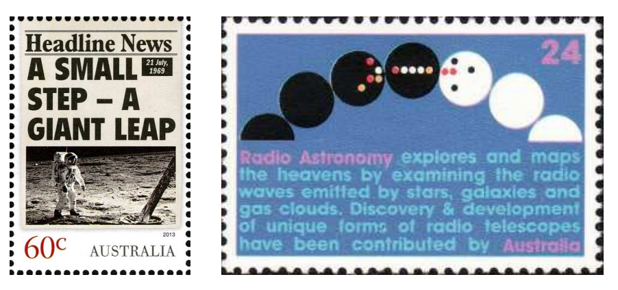
Figure 5. Left panel: Australia Post stamp from the 23 July 2013 "Headline News" series, showing the lunar footage taken from Australia on 20 July 1969. Right panel: Australia Post stamp from the 14 May 1975 "Scientific Development" series.