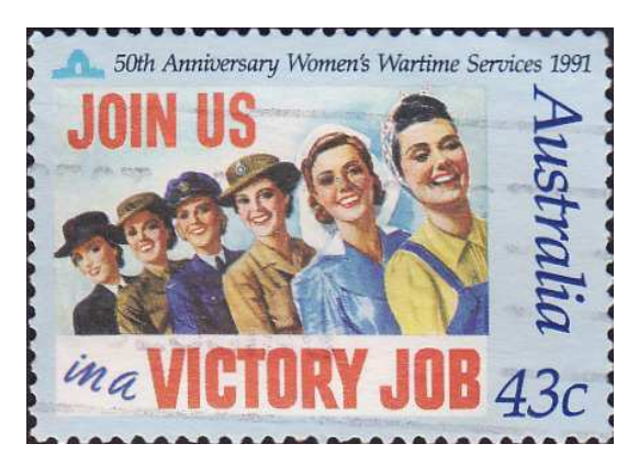
Figure 1. National Service Office poster from WWII featured on a 1991 Australian postage stamp commemorating the 50th Anniversary of Women's Wartime Services.