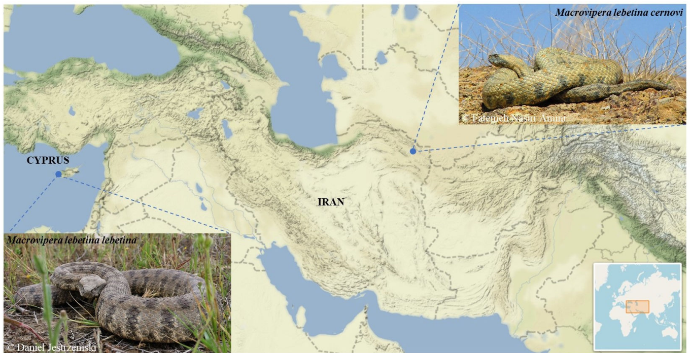
Figure 1. Geographical map of the collection sites. Two female specimens of M. l. lebetina were used for milking, which were the F2 generation of blunt-nosed vipers originally caught nearby the cities of Paphos and Polis (Paphos district, Republic of Cyprus). In comparison, two female specimens of M. l. cernovi were collected and milked from Khorasan Razavi, Iran. Map provided by using the “leafletR” package [26].