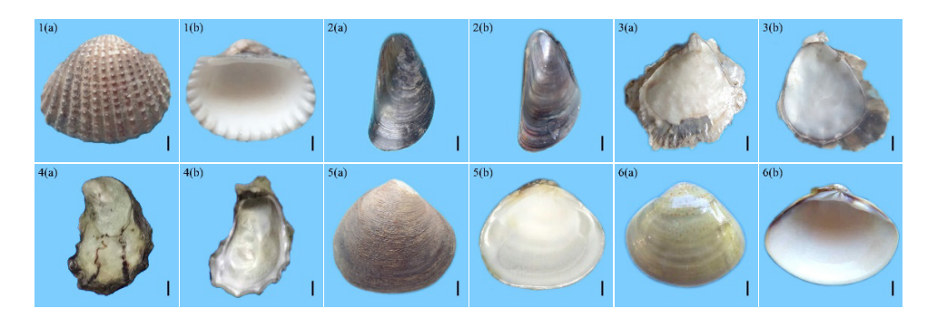
Figure 3 Bivalvess: (a) Dorsal view, (b) Ventral view; Figure 1, Anadara granosa; Figure 2, Perna viridis; Figure 3, Planostrea pestigris; Figure 4, Saccostrea cuccullata; Figure 5, Polymesoda expansa; Figure 6, Meretrix meretrix.