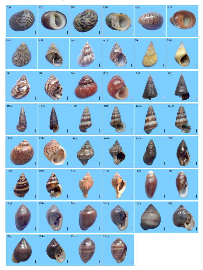
Figure 2 Gastropods:(a) Dorsal view, (b) Ventral view; Figure 1, Nerita lineata; Figure 2, Nerita funiculata; Figure 3, Dosita violaceae; Figure 4, Littoraria conica; Figure 5, Littoraria scarba; Figure 6, Littoraria melanostoma; Figure 7, Littoria strigata; Figure 8, Assiminea brevicula; Figure 9, Telescopium telescopium; Figure 10, Cerithidea cingulata; Figure 11, Cerithidea obtusa; Figure 13, Cerithidea rhizophorarum; Figure 13, Natica trgrina; Figure 14, Thais rufotincta; Figure 15, Nassarius dorsatus; Figure 16, Nassarius jacksonianus; Figure, Pugilina ternatana; Figure 18, Ellobium aurisijudaei; Figure 19, Cassidula aurisifelis; Figure 20, Cassidula mustelina; Figure 21, Pythia pantherina; Figure 22, Pythia scarabaeus; Figure 23, Melampus zonztus.

A total of 29 species of mollusks were collected from the mangrove swamps of study areas during the study period (from July 2013 to March 2014)(Figure 2) (Figure 3). The composition of the species were 23 species belonging to 3 orders, 8 families, 14 genera under the class gastropoda and 6 species belonging to 3 orders, 5 families, 6 genera under the class bivalvia. In gastropod, 3 species of Neritidae, 4 species of Littorinidae, 1 species of Assimineidae, 4 species of Potamididae, 1 species of Naticidae, 1 species of Muricidae, 2 species of Nassariidae, 1 species of Melongenidae and 6 species of Ellobidae. In bivalves, 1 species of Arcidae, 1 species of Mytilidae, 2 species of Ostreidae, 1 species of Corbiculidae and one species of Veneridae were observed (Table 1) (Table 2).