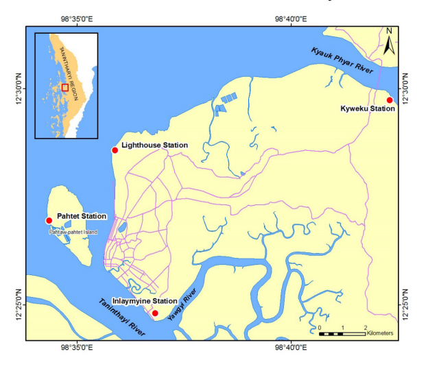
Figure I Map showing the location of study areas.

Study areas: The present study was conducted in the mangrove swamp of Myeik Coastal and its adjacent areas that are Kyweku, Lighthouse, Inlaymyine and Pahtet. The location of study areas is shown in Figure 1. Kyweku (Lat. 12° 29'N and Long. 98° 34'E) is located near the human settlement and ship building, and mangrove swamp has about 0.23km² where fresh water flow from the Kyauk Phyar river. Lighthouse (Lat. 12° 28'N and Long. 98° 35'E) is located near the human settlement and peddle field, and mangrove swamp has 0.29km². Inlaymyine (Lat. 12° 24'N and Long. 98° 38'E) is located near the human settlement and fishery industry, and mangrove swamp has about 0.23km² where freshwater flow from the Yaw Gyi River and Taninthayi River. Pahtet (Lat. 12° 24'N and Long. 98° 38'E) has near the mud crab culture farm and fishmeal industry, and mangrove swamp has about 0.06km². Tidal rhythm in the study areas regularly occur twice a day.