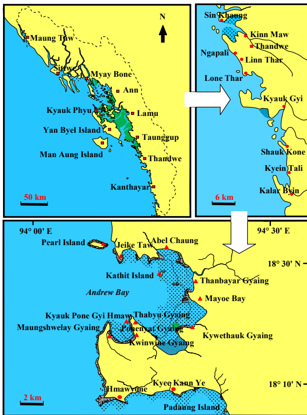
Figure 1 Map showing the collection sites of Andrew Bay in Rakhine Coastal Region.

All voucher specimens were deposited at the Museum of the Department of Marine Science, Mawlamyine University (MLM.MS). Zoogeographical distribution of each species was prepared with the data from the literature available. Ecological notes and associated species of these molluscs were also recorded in the field.