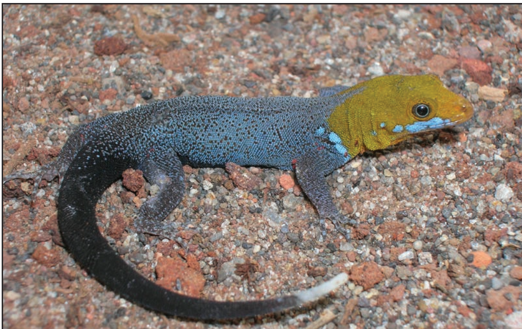
Gonatodes albogularis (Duméril and Bibron, 1836). The Yellow-headed Gecko is an MXSA species with a broad distribution in Central- and South America and numerous islands in the West Indies, and also has been introduced into Florida, in the United States (Schwartz and Henderson, 1991). Pictured here is an individual from Isla de Ometepe, in the department of Rivas, Nicaragua. Wilson et al. (2013b) determined the EVS of this species as 11, placing it in the upper portion of the medium vulnerability category, and the IUCN has evaluated its conservation status as Least Concern.