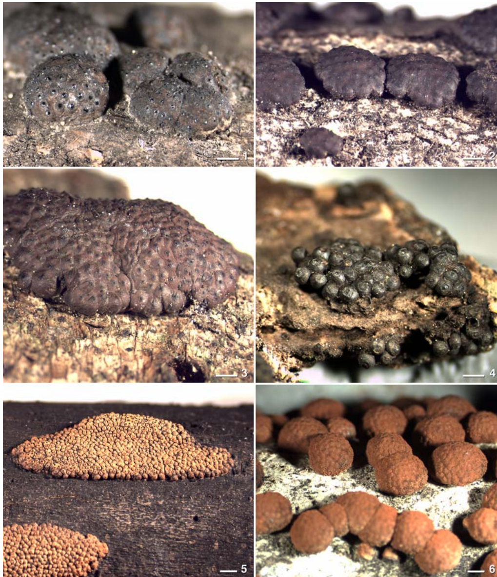
Figs 1-6. Stromata of species of Annulohypoxyton and Hypoxyton known from the GSMNP. 1. Annulohypoxyton annulatum . 2. Annulohypoxyton cohaerens . 3. Annulohypoxyton multiforme . 4. Annulohypoxyton truncatum . 5. Hypoxyton crocopeplum . 6. Hypoxyton fragiforme . Bars = 1 mm.