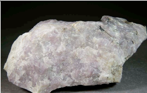
Figure 3. Ussingite from the Lovozersky Tundra, Kola Peninsula, Russia.