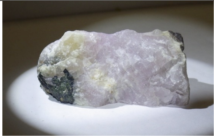
Figure 2. Pale purple ussingite from the Ilímaussaq complex.

But the descriptions of the original samples are purple, and I must admit that all the ussingite from the Ilímaussaq complex I have seen is pale purple ( Figure 2 ).