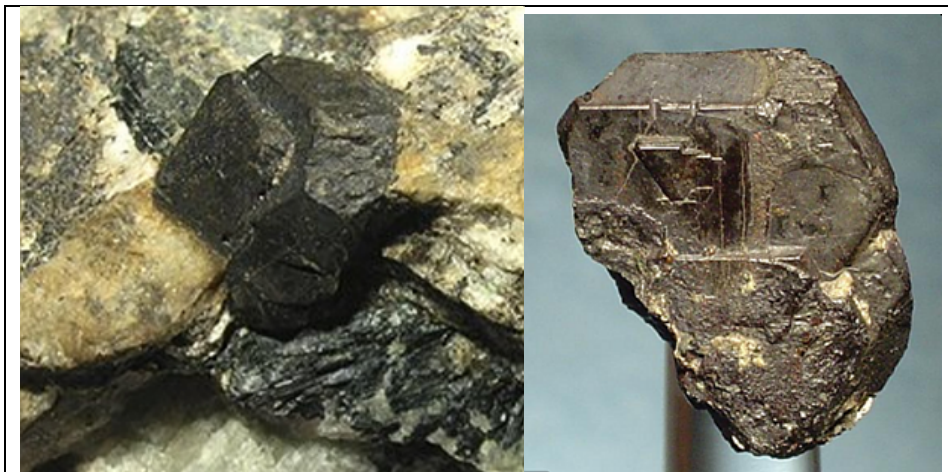
Figures 6 and 7. Steenstrupine-(Ce) from the Ilímaussaq complex, Greenland.

As global warming melts the ice caps on Greenland, we can expect additional interesting mineral deposits to be found and likely more interesting mineral specimens will see the light of day.