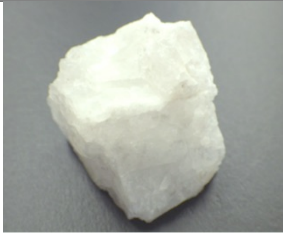
Figure 1. Colorless ussingite from the Ilímaussaq complex

What color would this mineral be if it had the ideal composition? Answer: The same color as albite feldspar; namely colorless ( Figure 1 ).