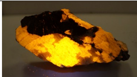
Figure 5. Sodalite from the Ilímaussaq complex in Greenland under longwave ultraviolet light.

The original ussingite locality at Kangerluarsuk Fjord is also the type locality for aenigmatite, arfvedsonite, bohseite, eudialyte, karupmøllerite-(Ca), polyolithionite, potassic-arfvedsonite, rinkite-(Ce), skinnerite, and steenstrupine-(Ce).