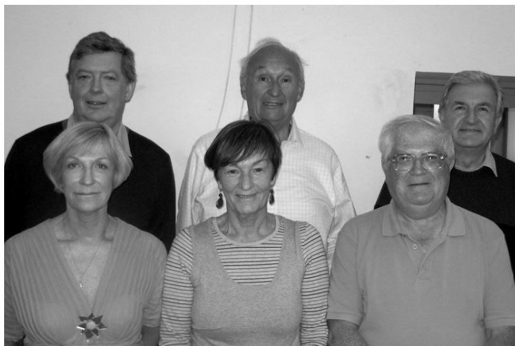
Winners of the Cambria Cup