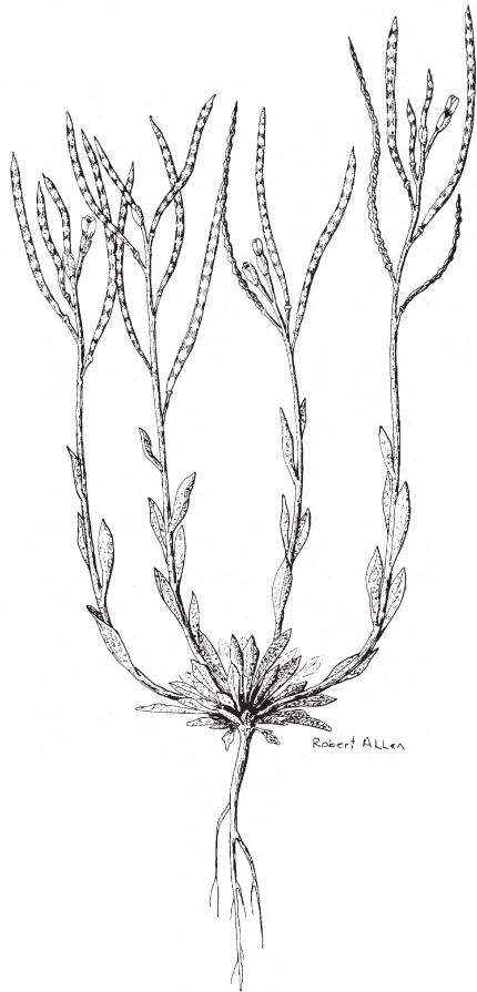
Arabis fecunda (Sapphire Rockcress)