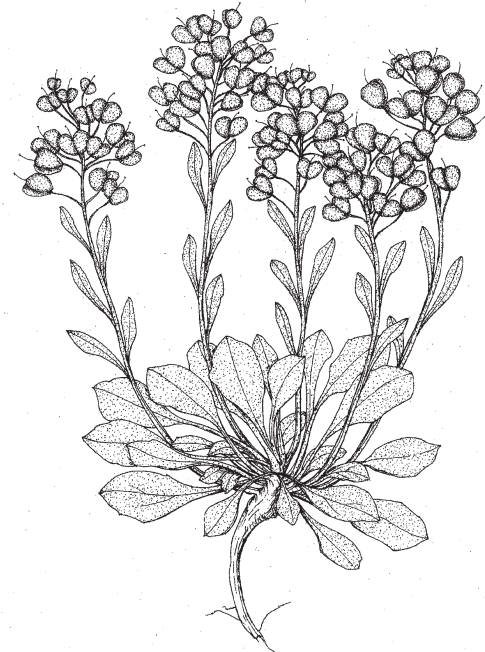
Physaria brassicoides (Double Bladderpod)

The MTNHP continuously reviews and updates status ranks as new information and insights are generated by field surveys, research, and submitted observations. Status ranks and information supporting them, are informally reviewed by botanists and resource specialists, if you wish to comment or contribute information to this process please contact the MTNHP Botanist. The information that we receive from botanists and others throughout the state is essential in this process, and contributes to more accurate assessments of species' status. We continue to ask that all observations of these species be reported to the Heritage Program, with as much detail as possible. A copy of a field survey form specifying the information that should be submitted is available at the end of this publication and on our website. Review