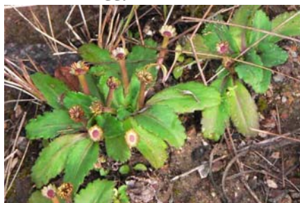
Solenogyne dominii JG