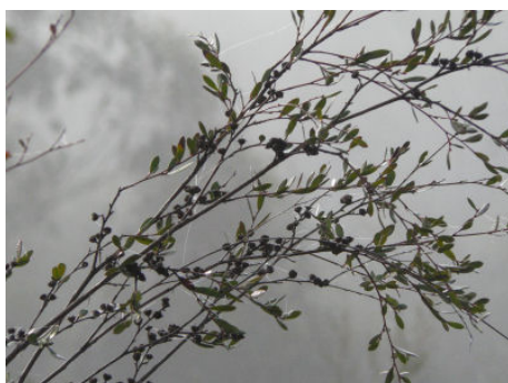
Leptospermum brevipes JG