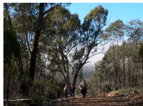
Fog lifting JG