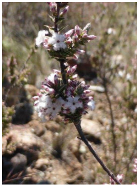
Leucopogon attenuatus JC