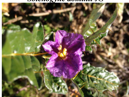
Solanum cinereum GRK