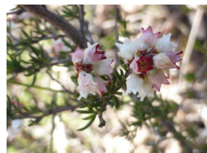
Fading to pink JC