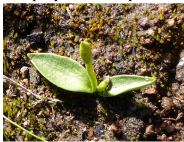
Ophioglossum lusitanicum JC