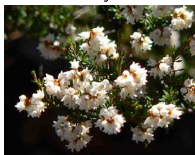
Cryptandra amara var. floribunda JG