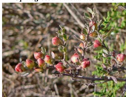
Hibbertia obtusifolia buds JG