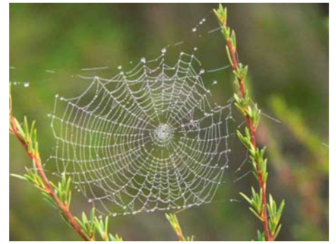
Kunzea ericoides and web JG