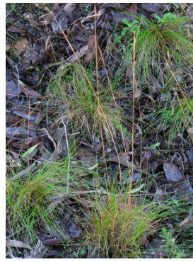
Poa sieberiana JG