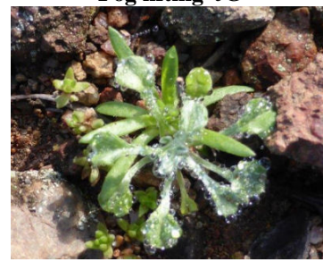
Stuartina muelleri JC