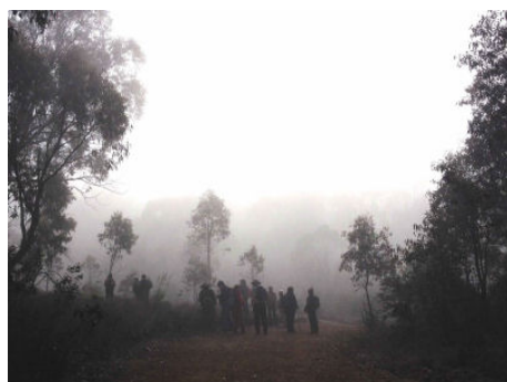
Foggy start