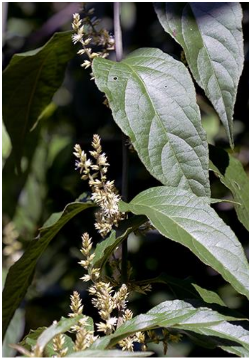
Chamissoa altissima , photo by P. Acevedo.

Herbs, erect subshrubs or scrambling shrubs. Stem cylindrical, up to 3 cm in diam. and