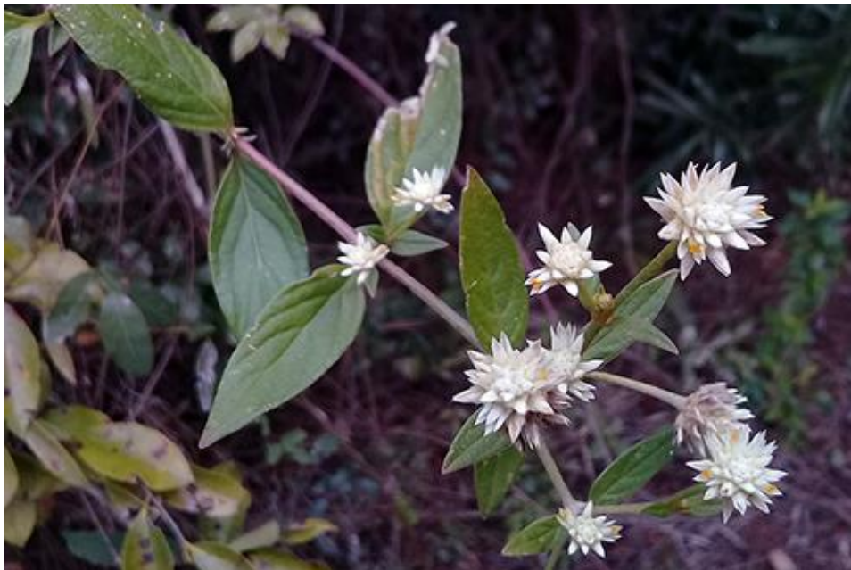
Alternanthera pubiflora , photo by D. Culbert.

Prostrate herbs with a long taproot, less often subshrubs, scrambling herbs or lianas.