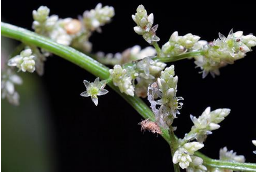
Iresine diffusa , photo from J. Amith.

Erect or clambering herbs or shrubs, less frequently small trees or scrambling shrubs.