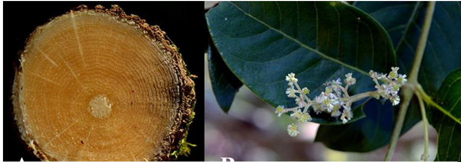
Pedersenia macrophylla . A. Cross section of stem with successive cambia. B. Inflorescence.

Scrambling shrubs, twining lianas and a few arborescent species. Stems nearly