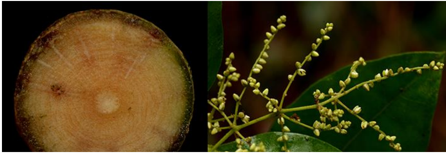
Hebanthe eriantha . A. cross section of stem with successive cambia. B. Inflorescence.

Scrambling shrubs or twining lianas. Stems nearly cylindrical, in some species up to 10