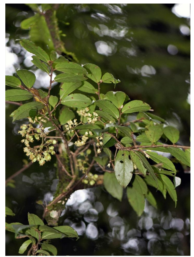
Begonia fruticosa

A pantropical family of succulent herbs, erect, prostrate or climbing through the aid of adventitious roots. Worldwide the family contains 2 genera, the Hawaiian monotypic genus Hillebrandia and the widely spread Begonia with a total of about 1,923 species. Begonia is quite diverse in the Neotropics but only a few species are reported as rootclimbing vines. The genus is most diverse in humid forest at elevations between 1000 and 3000 m elevation with a few species in the lowlands.