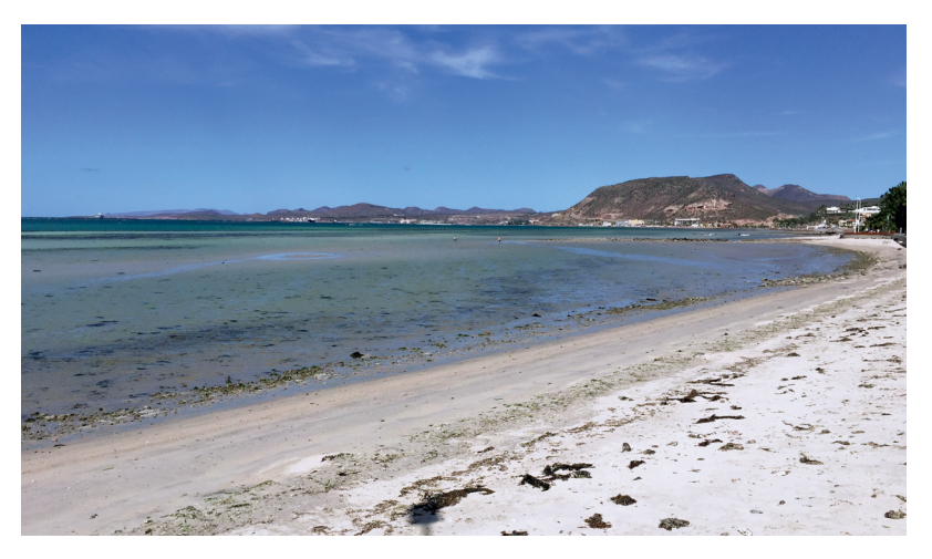
Figure 5. Ricketts-Steinbeck collecting site No. 5, La Paz, page 109 in Sea of Cortez. Photo taken March 2020 by R. Brusca.

as there is no appropriate habitat for this species in the area. They likely took G. grapsus at a rocky site a few kilometers away and combined it with their La Paz sample list. We also did not see the common Gulf fiddler crab Uca crenulata , even though the uppermost beach habitat, next to the malecón itself, appeared suitable for this species. The anoxic layer a few centimeters below the surface might now be excluding this once-common La Paz Bay species. No sea stars of any kind were seen. It is likely that the larger-bodied species are periodically harvested by locals for food and for the curio shop trade in La Paz. Also, echinoderms throughout the Gulf have not fully recovered from the devastating Gulf "echinoderm wasting disease" event that began in 1978 (Dungan et al. 1982).