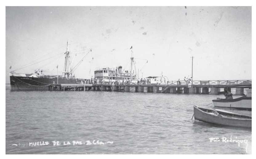
Figure 2. The municipal pier was gone when the Western Flyer arrived in La Paz on March 21, 1940, and the Flyer anchored "250 yards westward" of where the pier used to be. This photograph, taken that same year, is of another, commercial pier in La Paz.