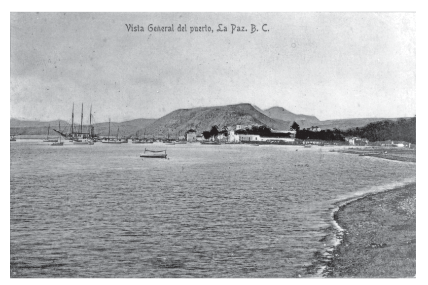
Figure 1. 1940 postcard of La Paz.

The expedition took place just before a highly contested presidential election in Mexico, in which PRI-affiliated president Lázaro Cárdenas hoped to hand the office to Manuel Ávila Camacho (who had been his right-hand man during the Mexican Revolution). The PRI had been rigging the elections since the revolution. After the election, it was reported that Camacho won the presidency with 94% of the popular vote! Not everyone in Mexico supported or backed the PRI's revolutionary legacy, and most regarded the party as highly corrupt. This political situation was creating unrest in the country and, combined with the Second World War (which had just begun in Europe), the circumstances gave Ricketts and Steinbeck further grist for thought and philosophizing about human nature and the human condition. Coincidentally, President Cárdenas visited La Paz in 1940, though he was not there when the Western Flyer and her crew visited (Figures 1–4).