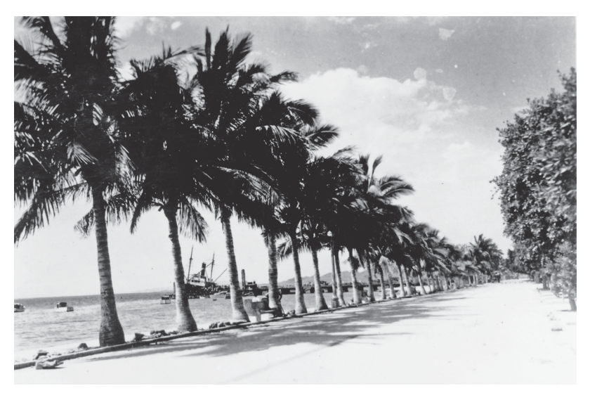
Figure 3. Photograph of the La Paz malecón, 1940.