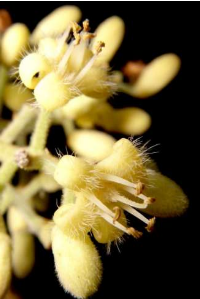
Leretia cordata