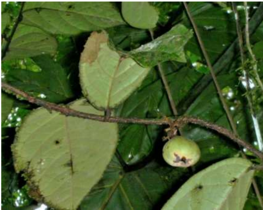
L. cordata , photo by E. Salicetti (from La Selva, florula digital)

LERETIA Vellozo, Fl. Flumin. 99. 1829 ['1825'].