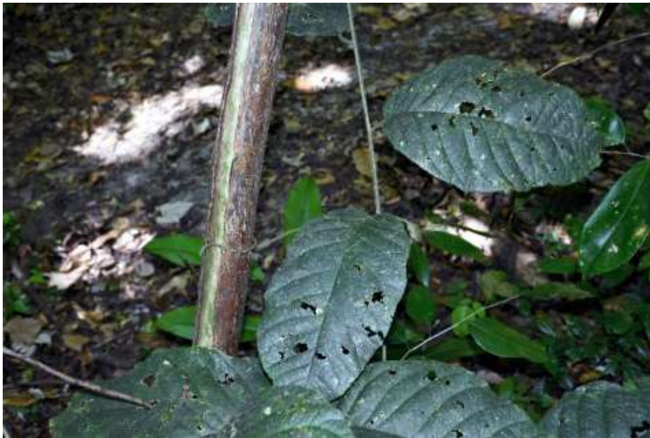
P. artocarp i Baill.

PLEURISANTHES Baillon, Adansonia 11: 201. 1874.